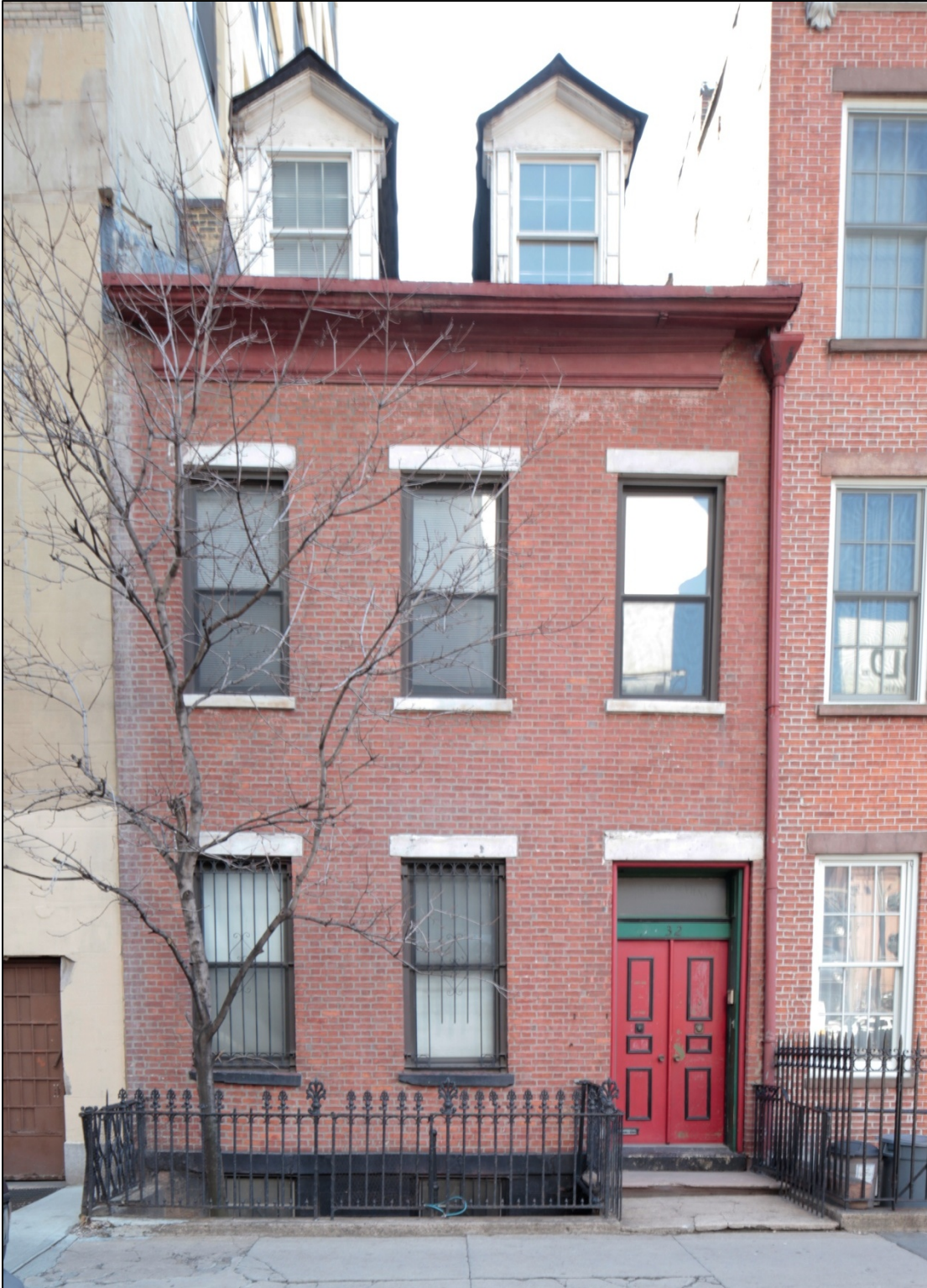
32 Dominick Street House 32 Dominick Street, Manhattan Block: 578, Lot: 64 Photo: Olivia T. Klose, 2011