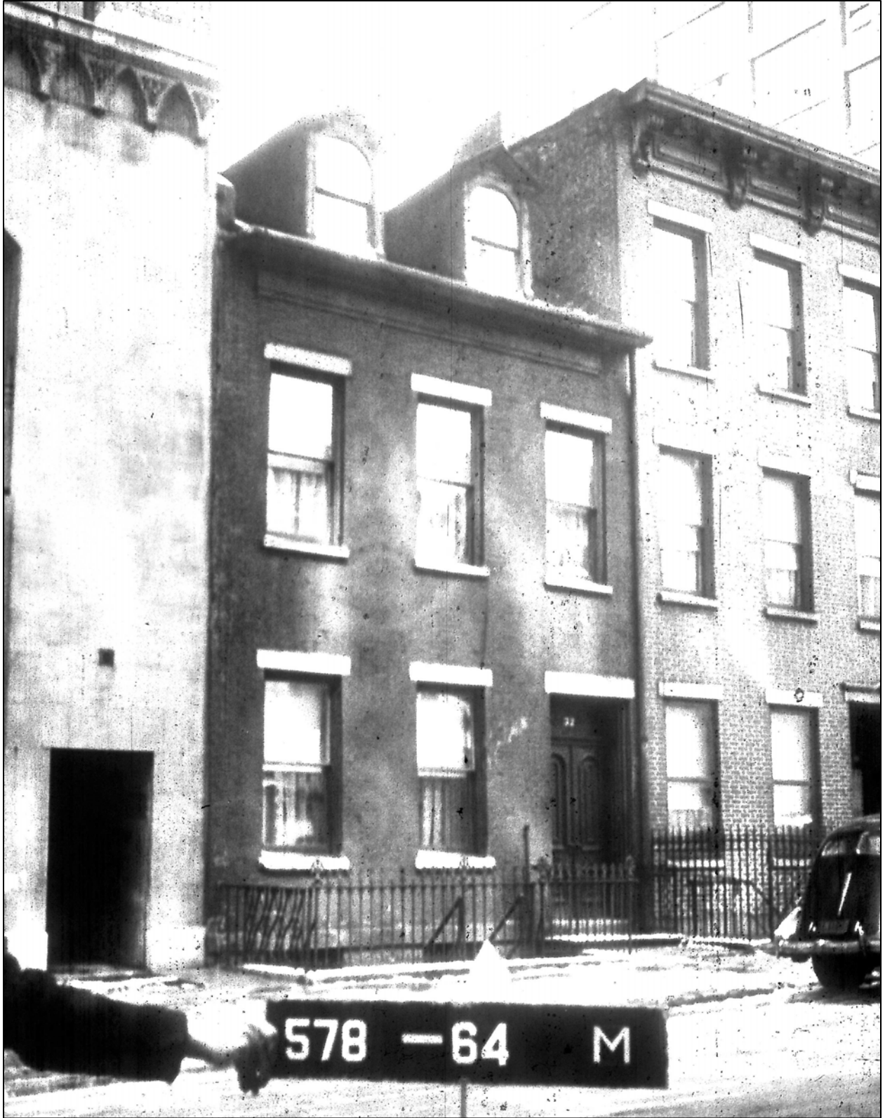
32 Dominick Street House (c. 1939)