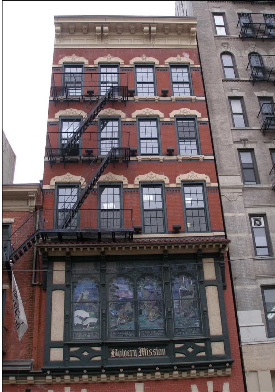
Bowery Mission 227 Bowery Borough of Manhattan Tax Map Block Block 426, Lot 8 in part