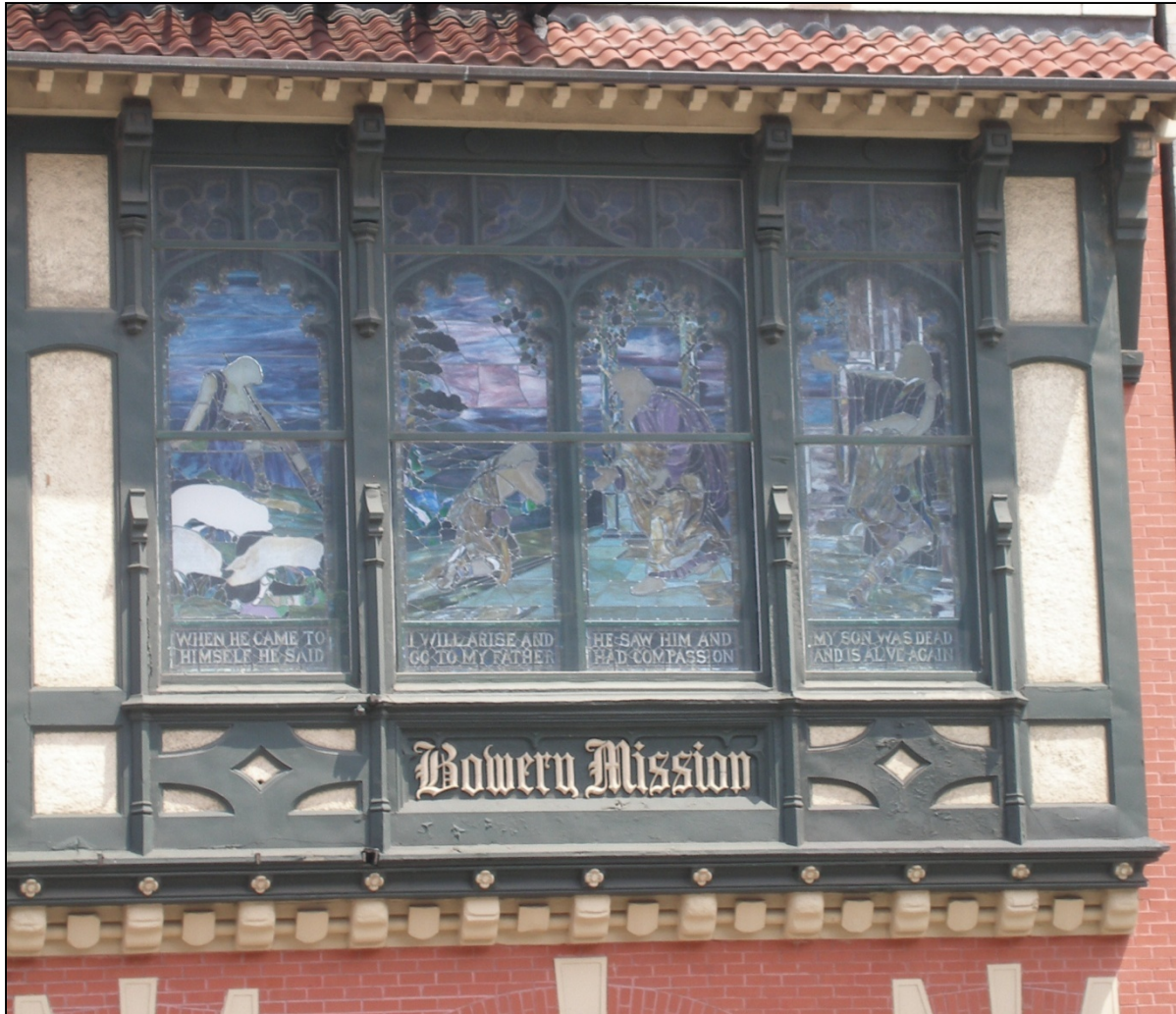
Bowery Mission 227 Bowery Borough of Manhattan Tax Map Block Block 426, Lot 8 in part Photo: Theresa C. Noonan, 2010