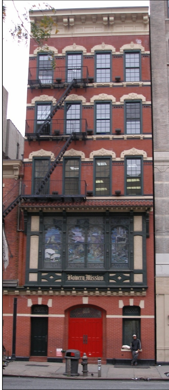
Bowery Mission 227 Bowery Borough of Manhattan Tax Map Block Block 426, Lot 8 in part Photo: Christopher D. Brazee, 2011