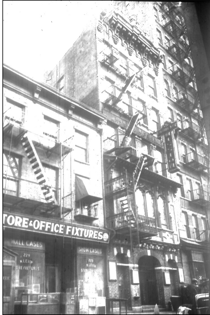
New York City Dept. of Taxes Photo c.1939