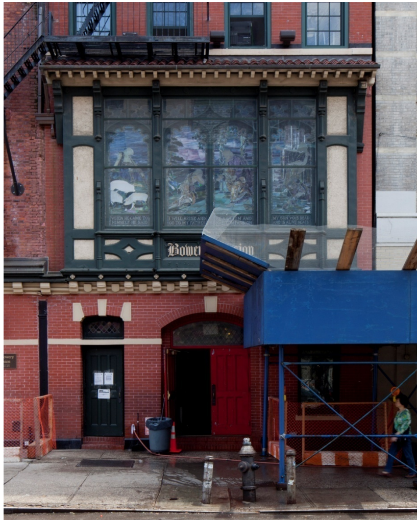
Bowery Mission 227 Bowery Borough of Manhattan Tax Map Block Block 426, Lot 8 in part Photo: Christopher D. Brazee, 2012