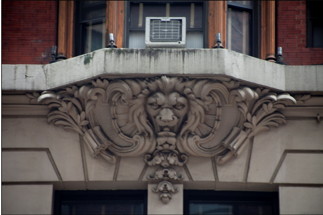
Hotel Mansfield (now the Mansfield Hotel) 12 West 44 th Street (aka 12-14 West 44 th Street), Manhattan Block: 1259, Lot: 47