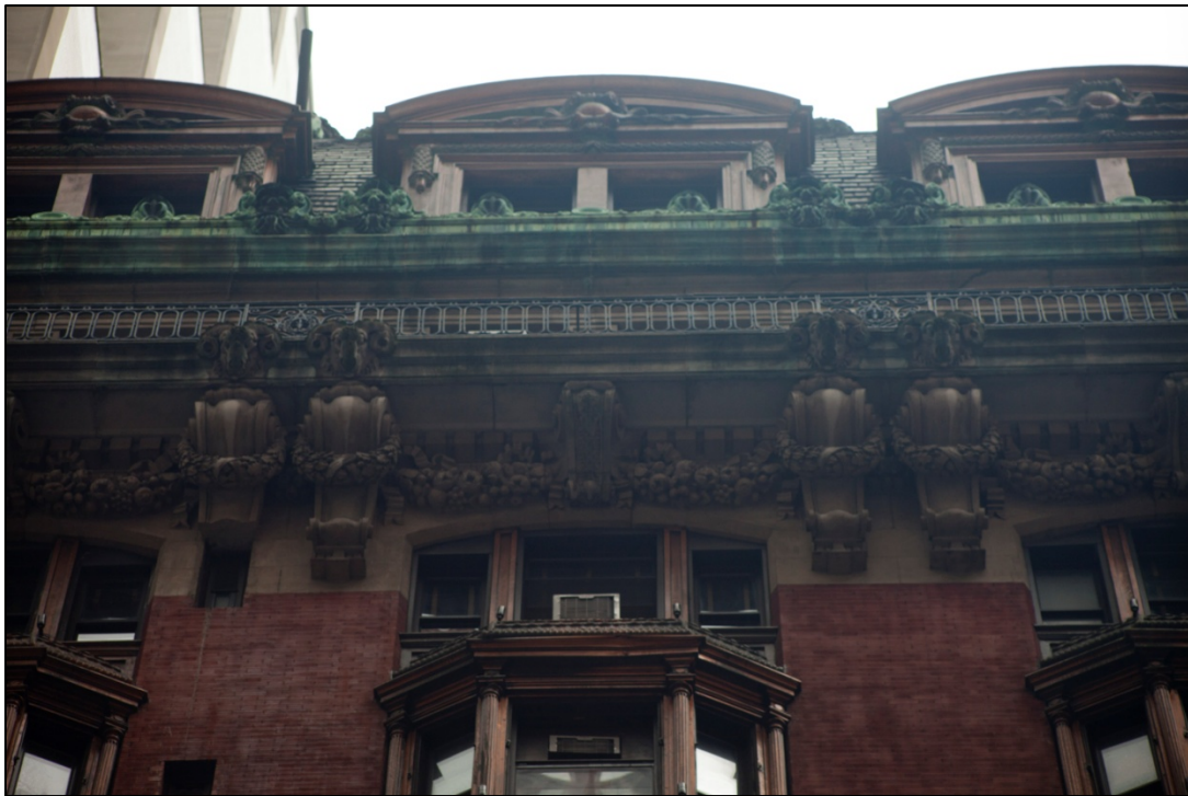
Hotel Mansfield (now the Mansfield Hotel) 12 West 44 th Street (aka 12-14 West 44 th Street), Manhattan Block: 1259, Lot: 47