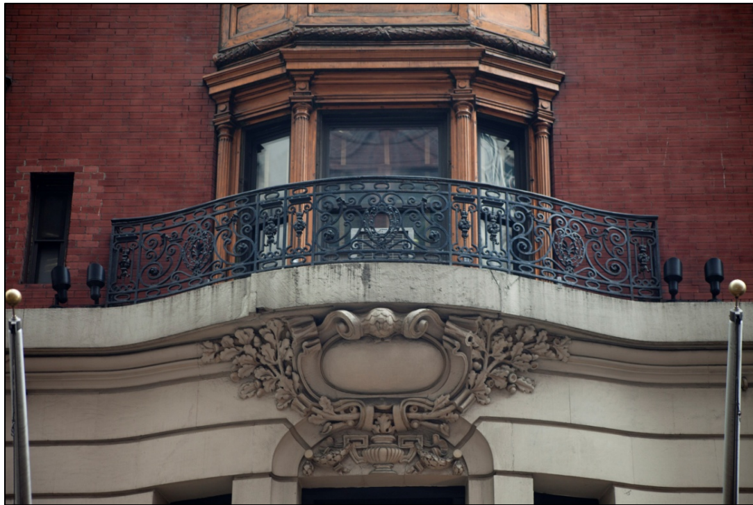
Hotel Mansfield (now the Mansfield Hotel) 12 West 44 th Street (aka 12-14 West 44 th Street), Manhattan Block: 1259, Lot: 47 Photo: Christopher D. Brazee (2012)