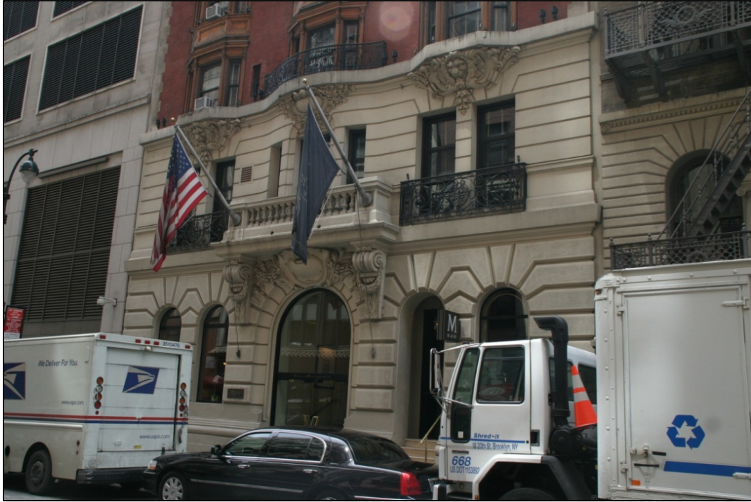
Hotel Mansfield (now the Mansfield Hotel) 12 West 44 th Street (aka 12-14 West 44 th Street), Manhattan Block: 1259, Lot: 47 Photo: LPC Staff (2009)