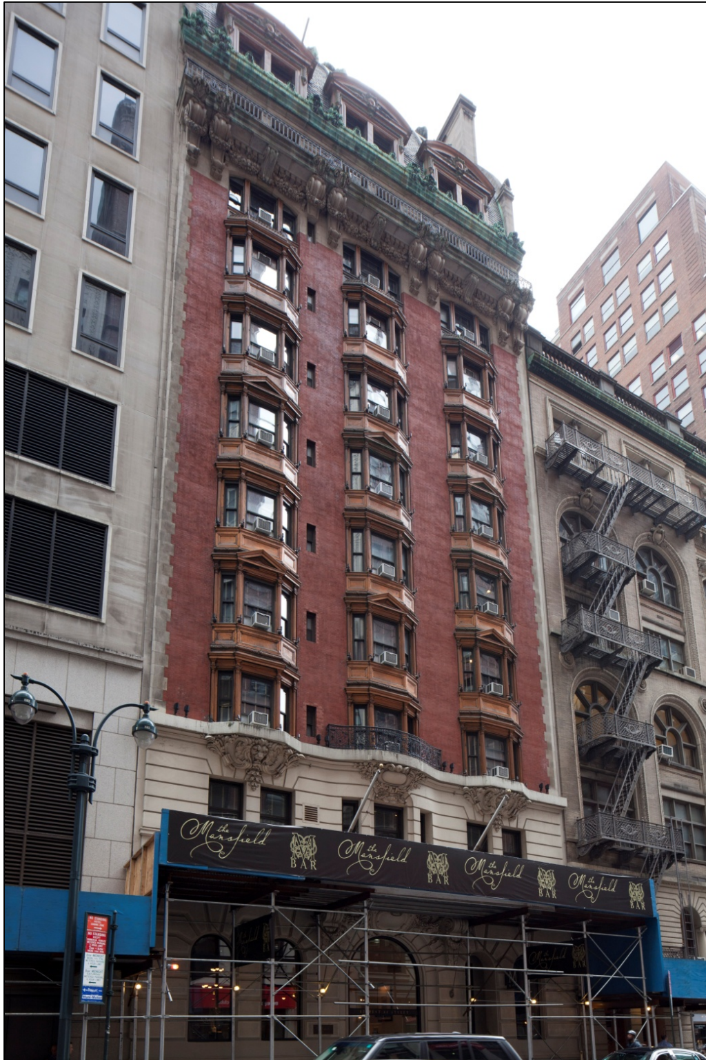
Hotel Mansfield (now the Mansfield Hotel) 12 West 44 th Street (aka 12-14 West 44 th Street), Manhattan Block: 1259, Lot: 47