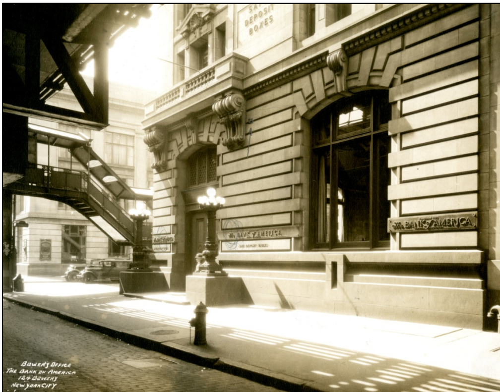
Bowery Bank of New York Building Bowery elevation, first story, view south Photo: Christopher D. Brazee, 2012 Bowery elevation, first story, view south, late 1920s Citi's Center for Culture, Heritage Collection