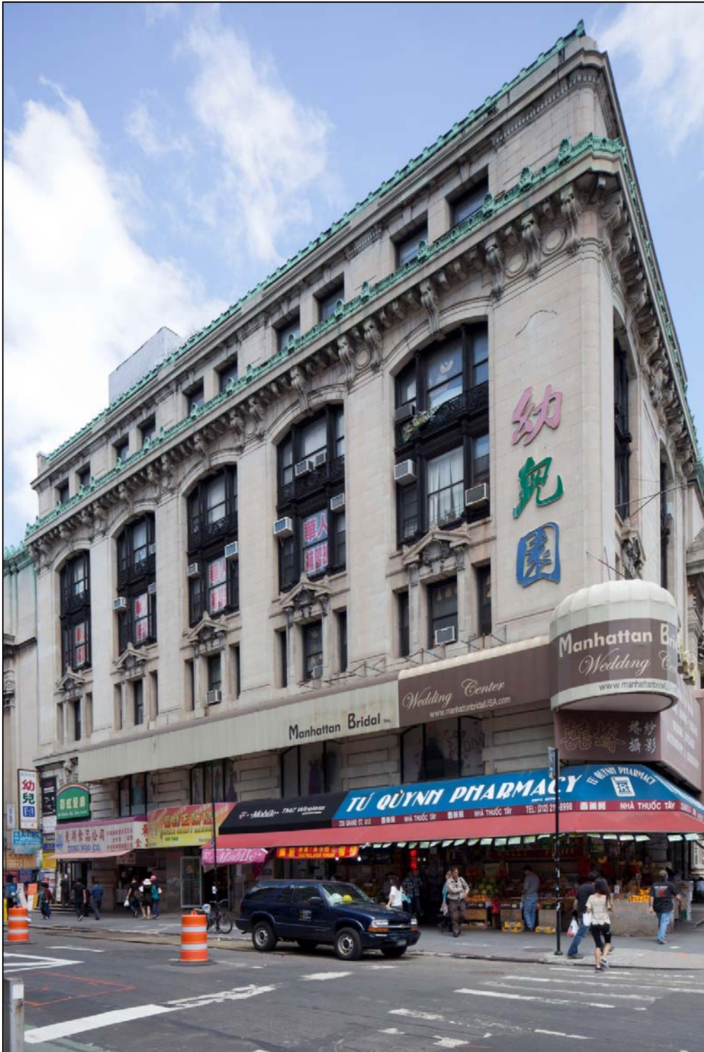
Bowery Bank of New York Building South elevation, facing Grand Street Photo: Christopher D. Brazee, 2012