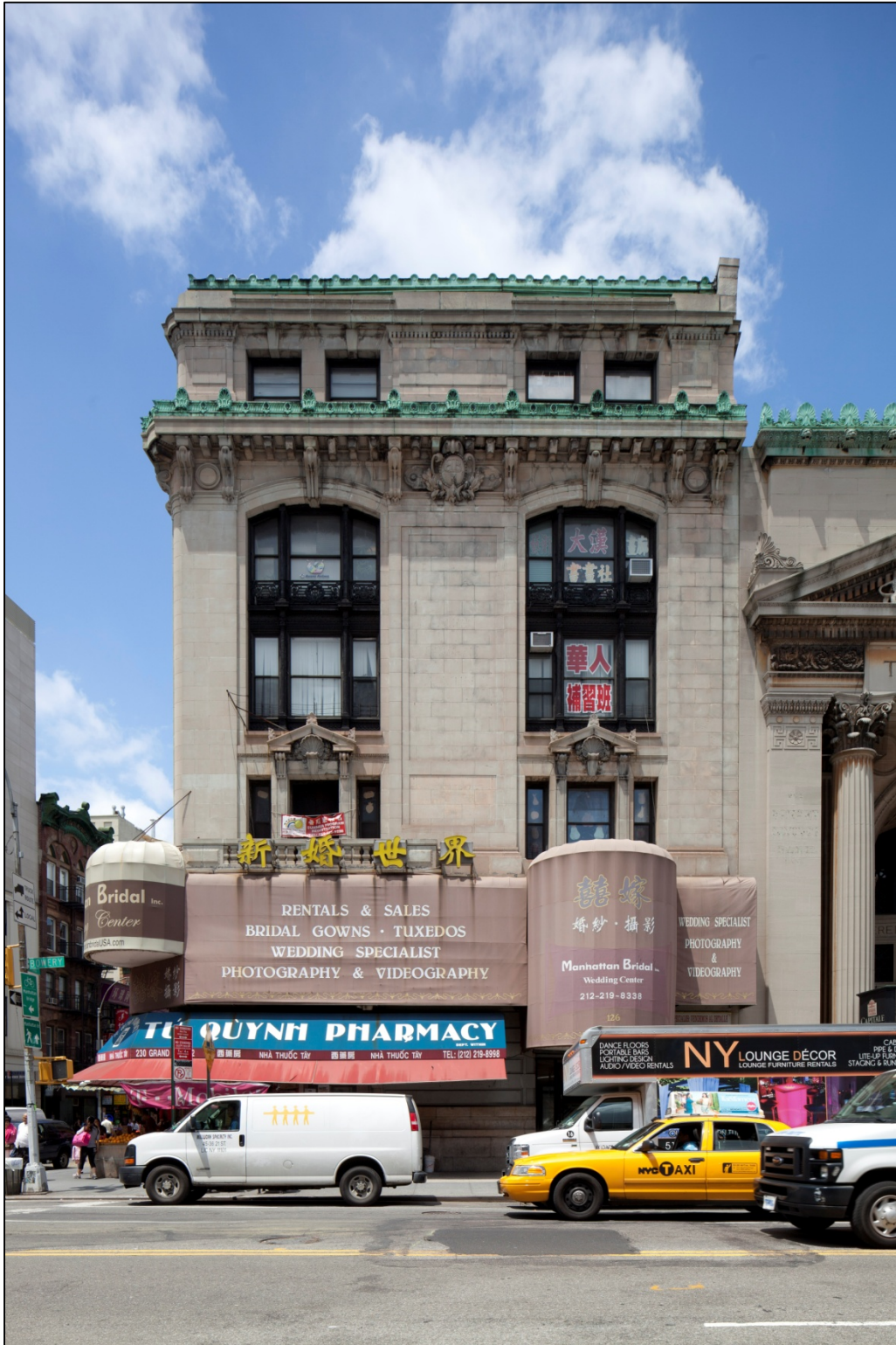
Bowery Bank of New York Building Elevation facing the Bowery