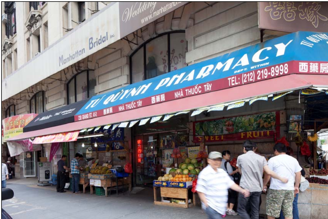
Bowery Bank of New York Building South elevation, Grand Street, lower stories