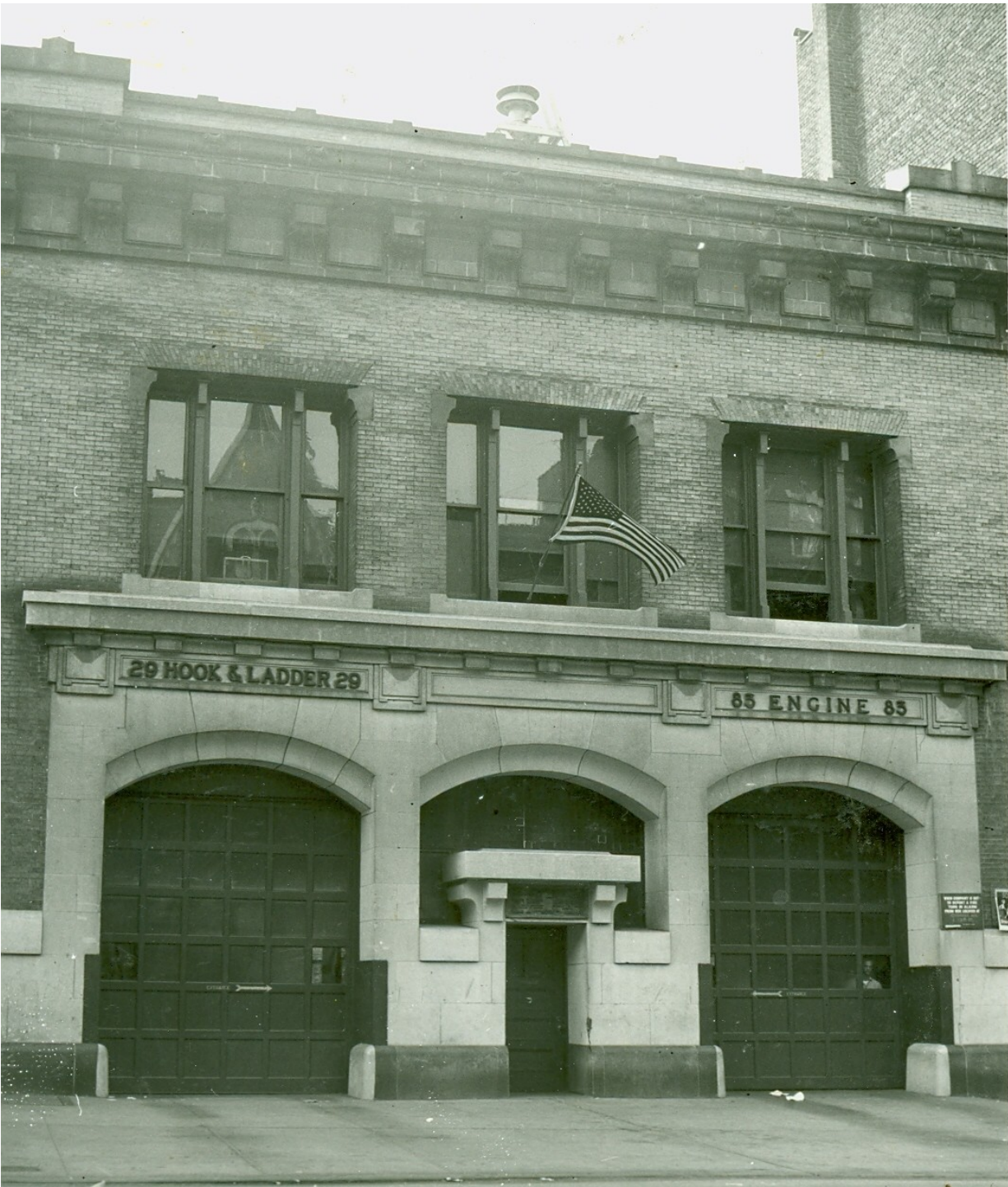
Firehouse, Engine Company 83, Hook & Ladder Company 29, 618 East 138 th Street, Bronx