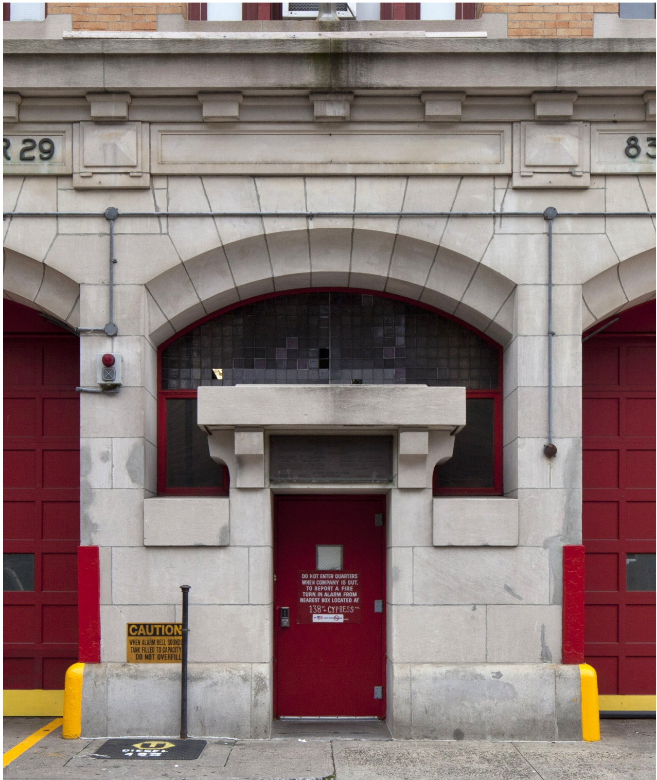
Firehouse, Engine Company 83, Hook & Ladder Company 29, entrance