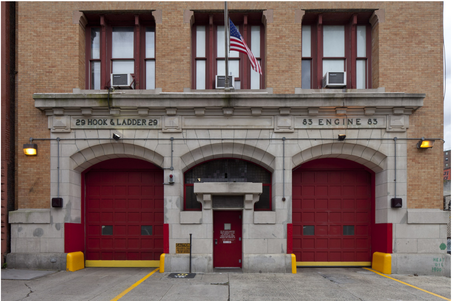
Firehouse, Engine Company 83, Hook & Ladder Company 29