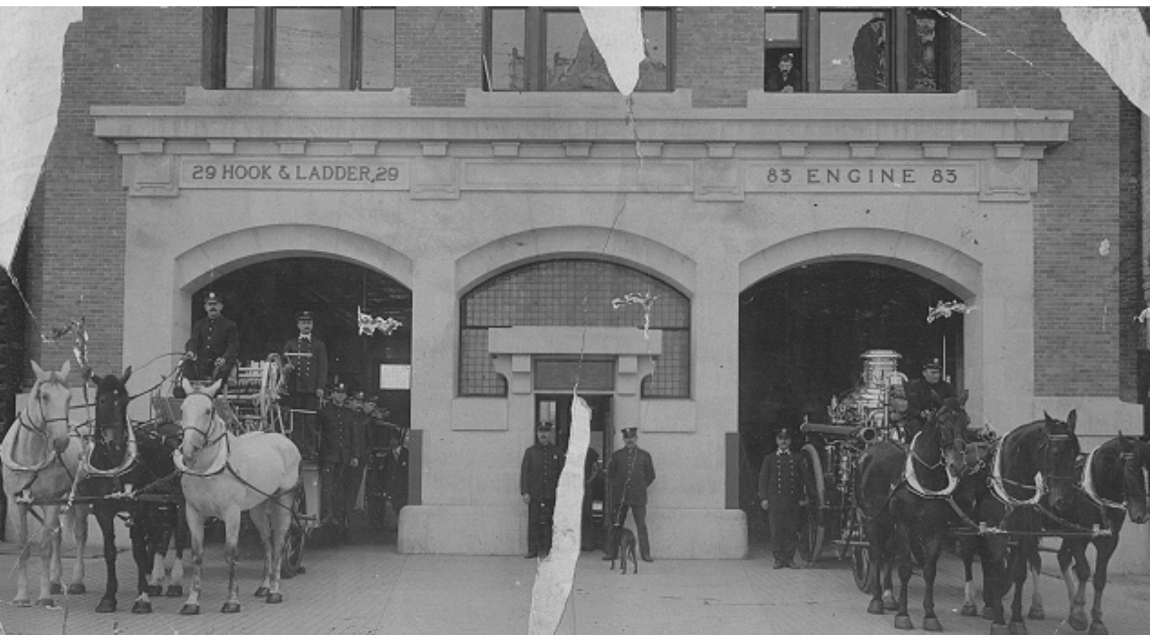
Firehouse, Engine Company 83, Hook & Ladder Company 29