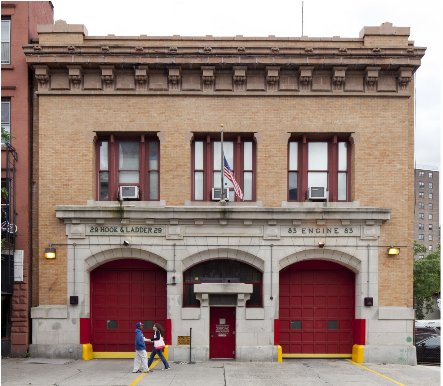
Firehouse, Engine Company 83, Hook & Ladder Company 29