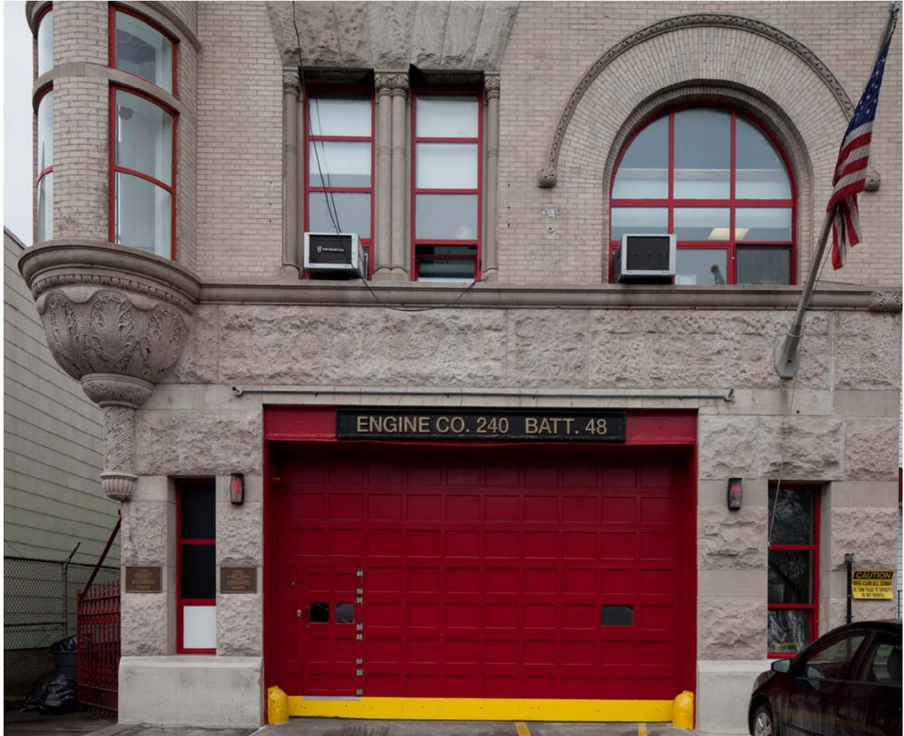
Firehouse, Engine Company 40/ Hook & Ladder Company 21 (now Engine Company 240/ Battalion 48)