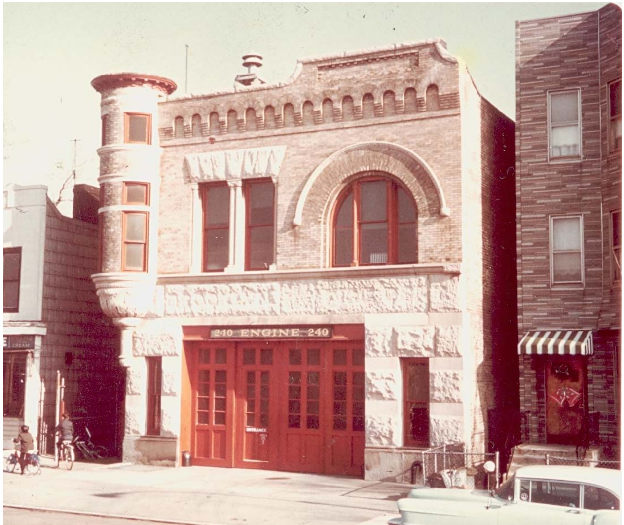
Firehouse, Engine Company 40/ Hook & Ladder Company 21 (now Engine Company 240/ Battalion 48) Historic Photo, c. 1960s-70s