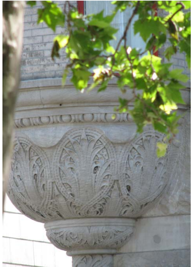
Firehouse, Engine Company 40/ Hook & Ladder Company 21 (now Engine Company 240/ Battalion 48)