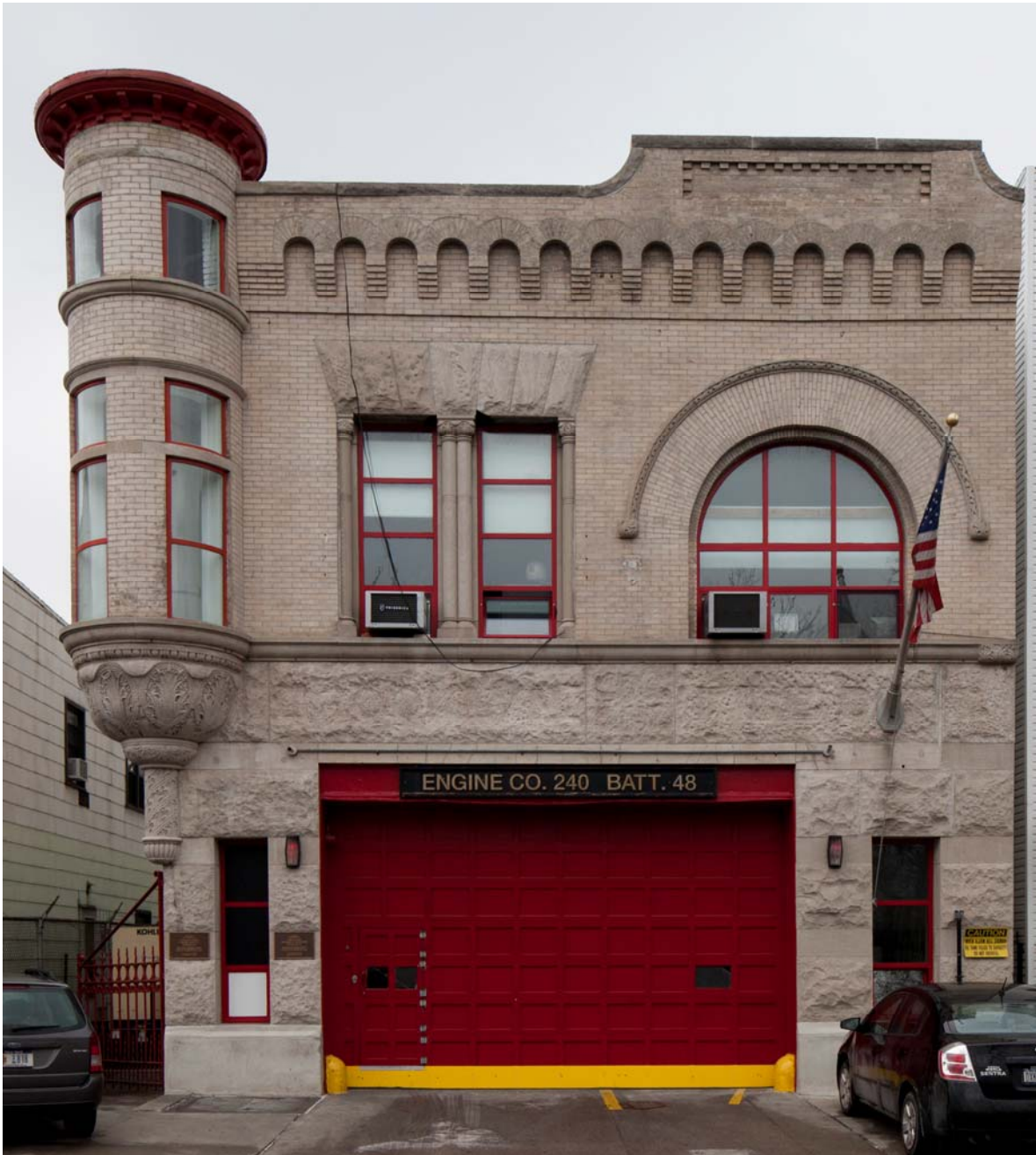
Firehouse, Engine Company 40/ Hook & Ladder Company 21 (now Engine Company 240/ Battalion 48) 1307-1309 Prospect Avenue, Brooklyn Landmark Site: Borough of Brooklyn Tax Map 5285/Lot 21