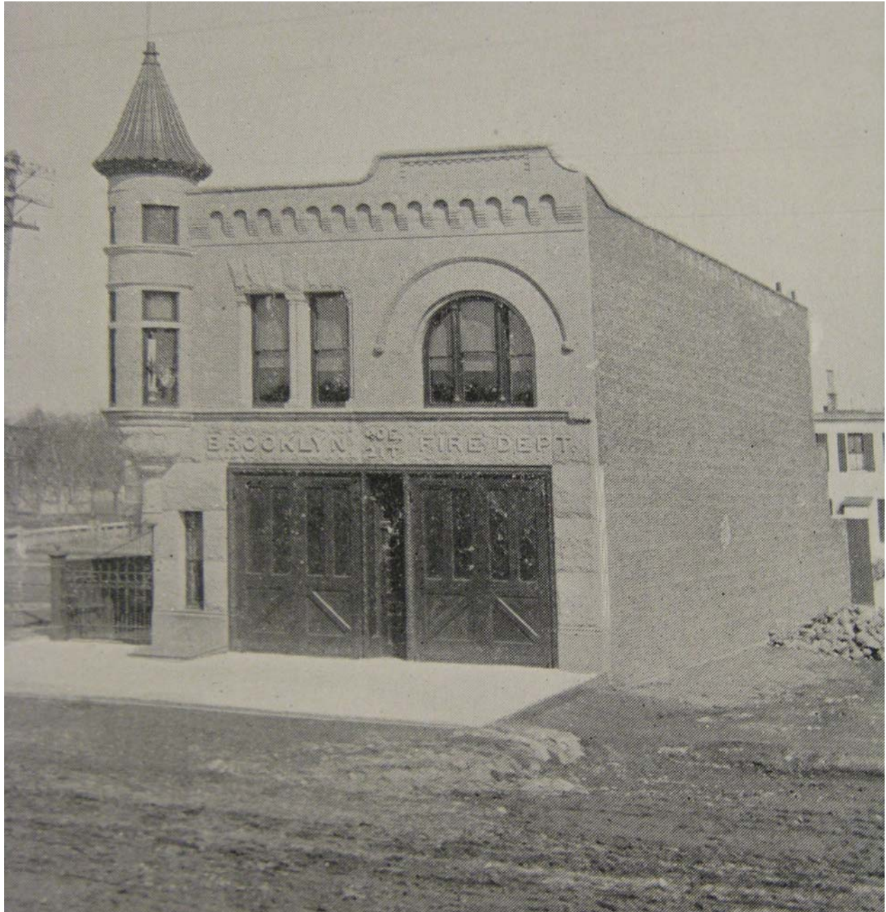
Firehouse, Engine Company 40/ Hook & Ladder Company 21 Historic Photograph, 1895