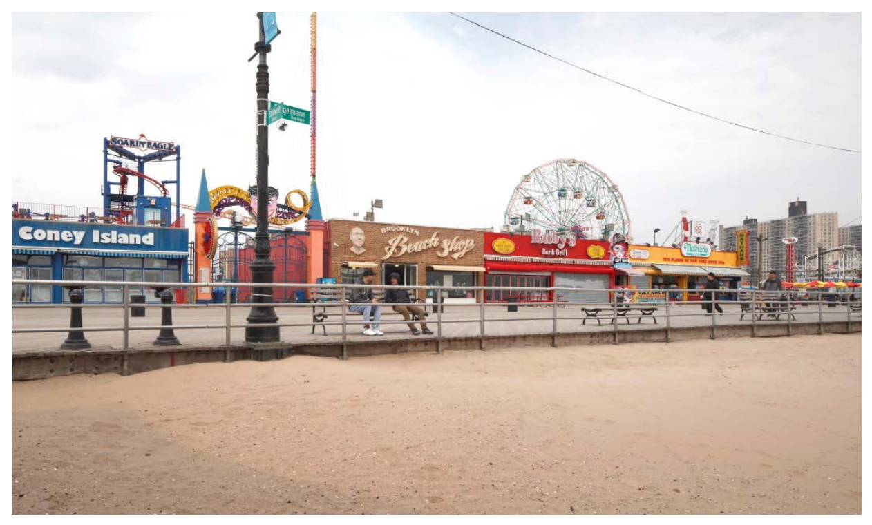
Coney Island (Riegelmann) Boardwalk , east of Stillwell Avenue 2018, LPC