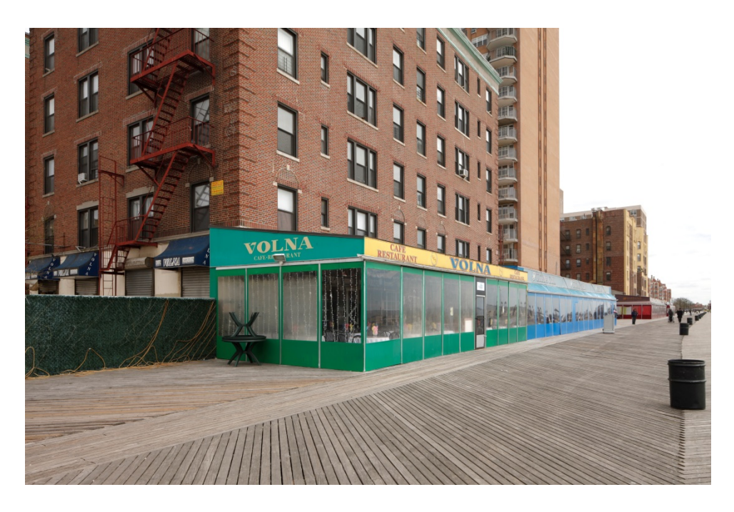
Coney Island (Riegelmann) Boardwalk , restaurants near Brighton 4th Street Sarah Moses (LPC), 2018