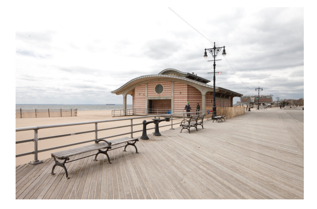
Coney Island (Riegelmann) Boardwalk , comfort station near Brighton 2<sup>nd</sup> Street Sarah Moses (LPC), 2018