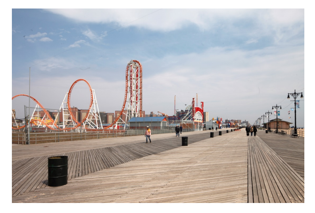
Coney Island (Riegelmann) Boardwalk , near West 15<sup>th</sup> Street Sarah Moses (LPC), 2018

Coney Island (Riegelmann) Boardwalk , close to west end, near West 32<sup>nd</sup> Street Sarah Moses (LPC), 2018