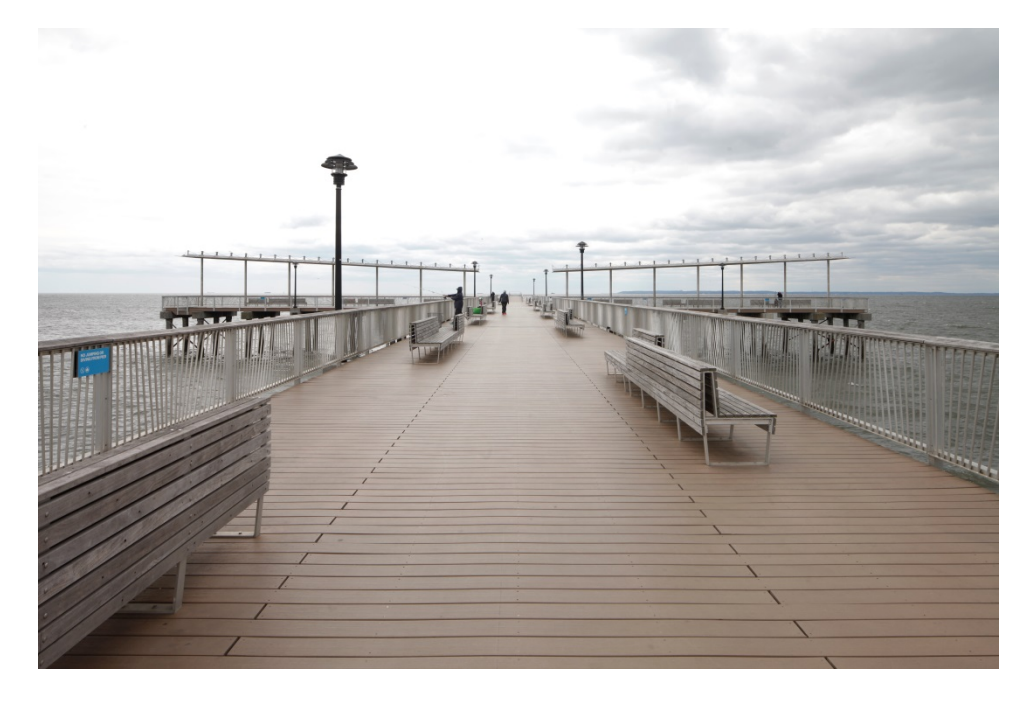
Coney Island (Riegelmann) Boardwalk, south end of Steeplechase Pier