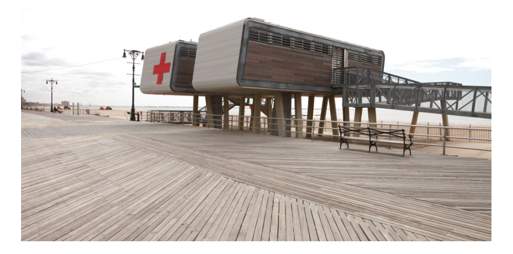
Coney Island (Riegelmann) Boardwalk , life guard station near Surf Avenue Sarah Moses (LPC), 2018