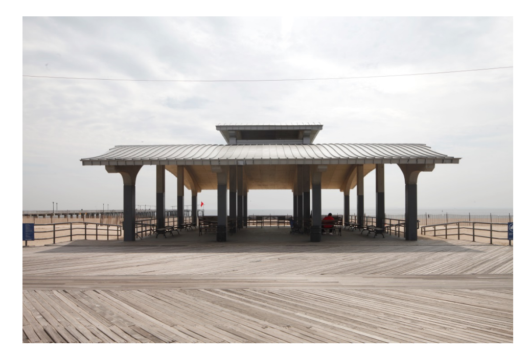
Coney Island (Riegelmann) Boardwalk , shade pavilion near Parachute Jump Sarah Moses (LPC), 2018