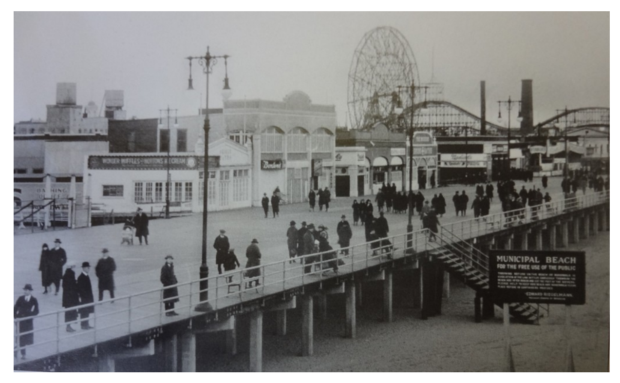
Coney Island (Riegelmann) Boardwalk, east of Stillwell Avenue 1923