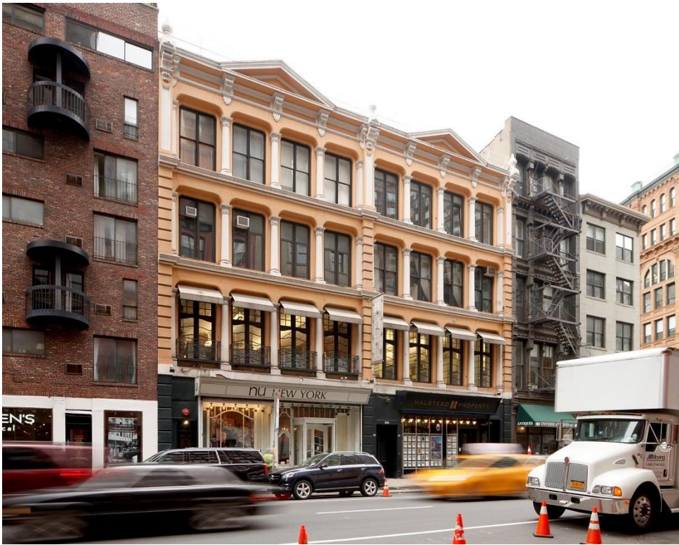
827-831 Broadway November 2017