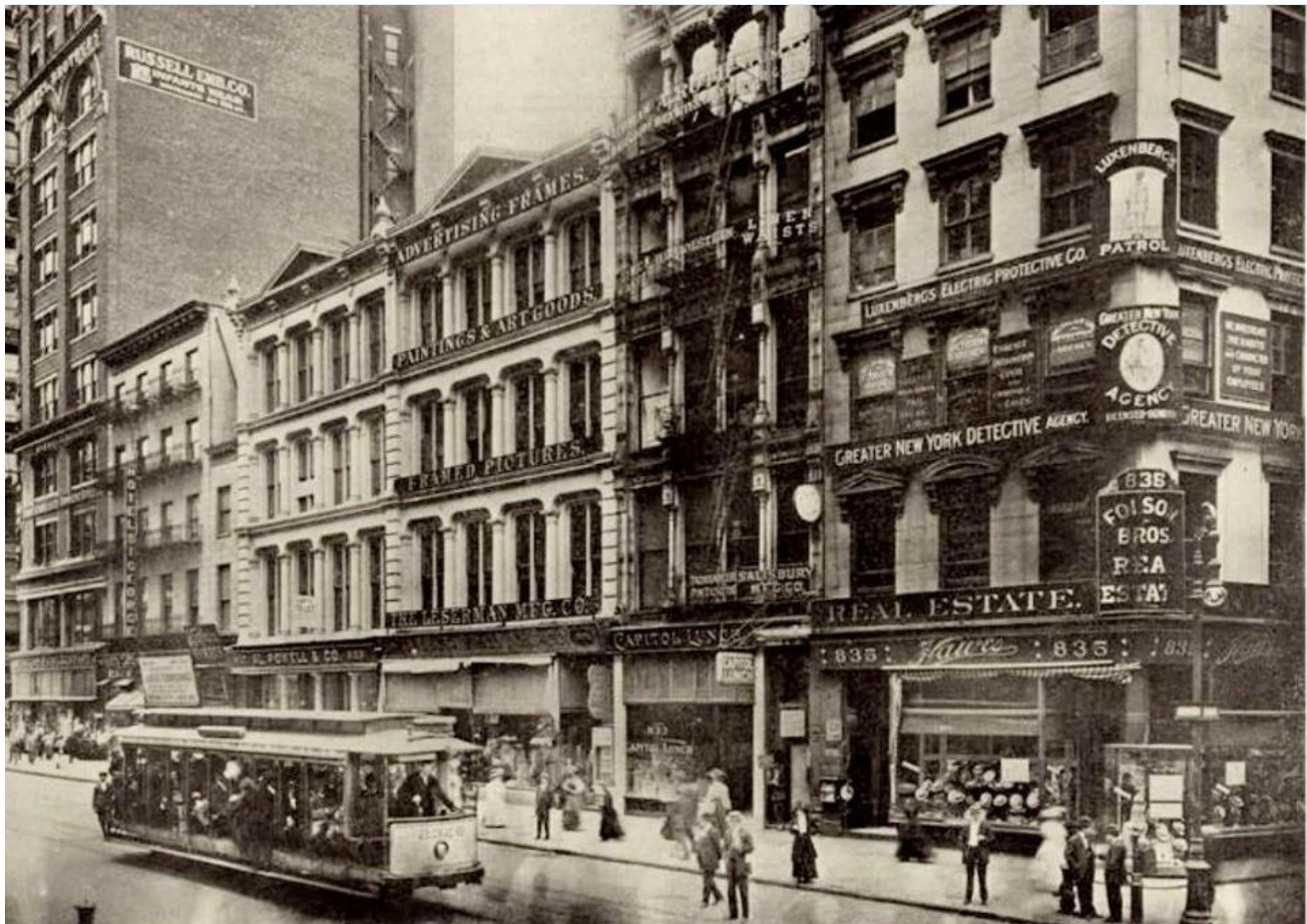
“Nos. 821 to 835 Broadway, between Twelfth and Thirteenth Streets”

The New York Public Library Digital Collections 1910