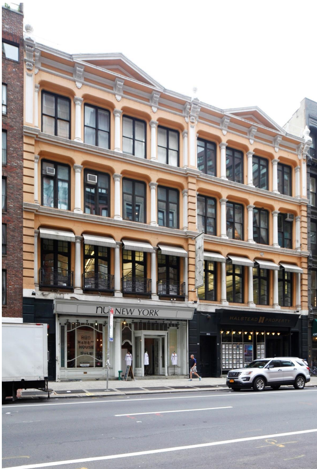
827-831 Broadway August 2017