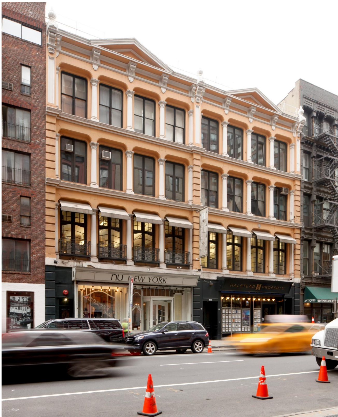
827-831 Broadway November 2017