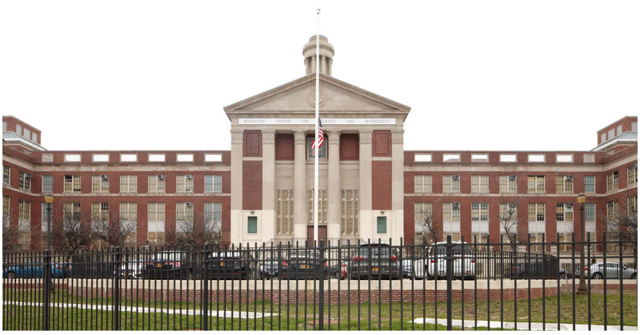
Benjamin Franklin High School, from FDR Drive (east facade)