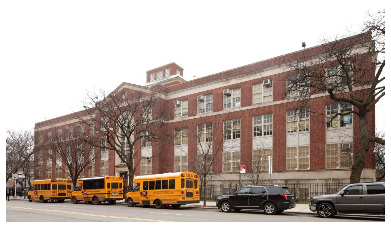
Benjamin Franklin High School, along East 116th Street (north facade)