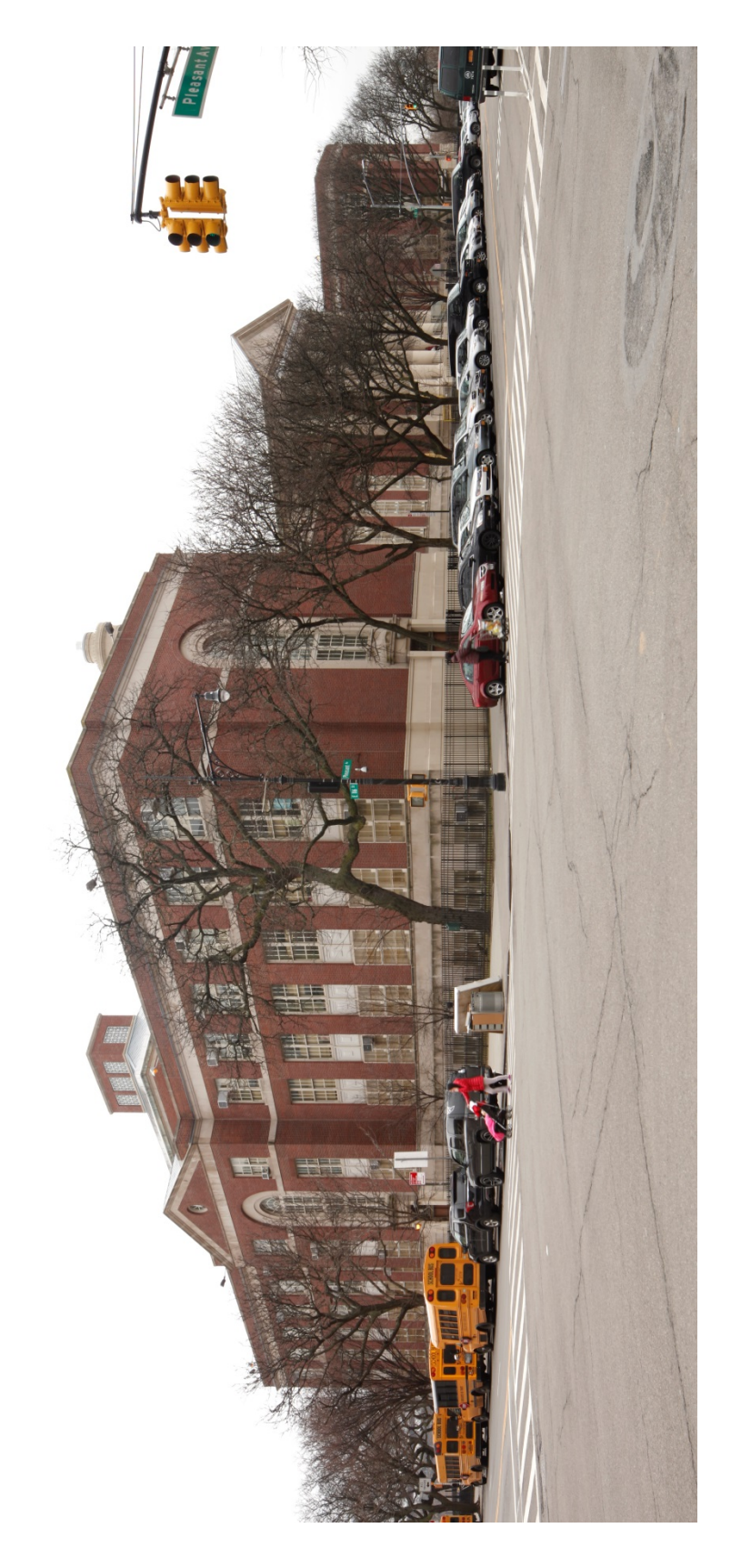
Benjamin Franklin High School, corner of East 116th Street and Pleasant Avenue