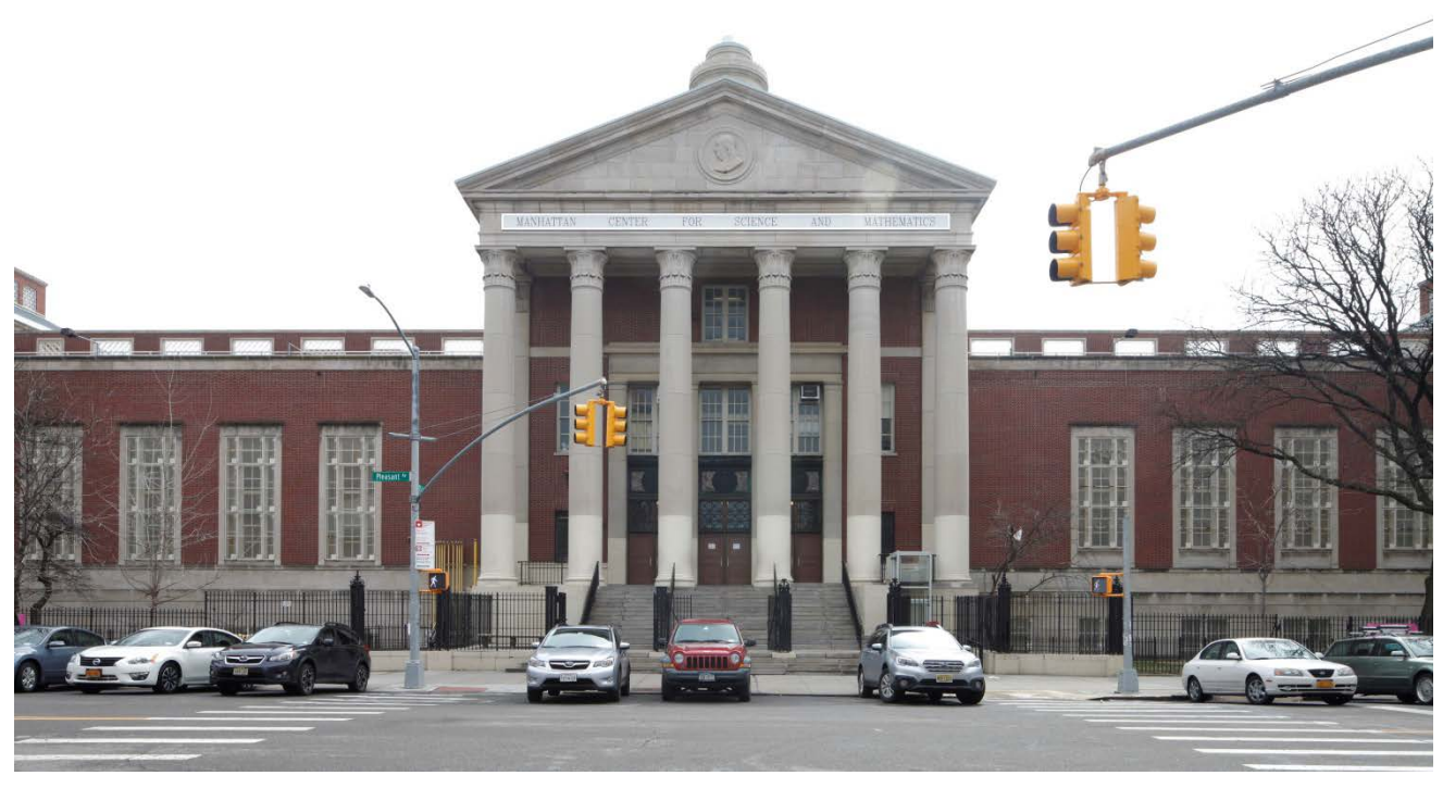
Benjamin Franklin High School, along Pleasant Avenue (west facade)