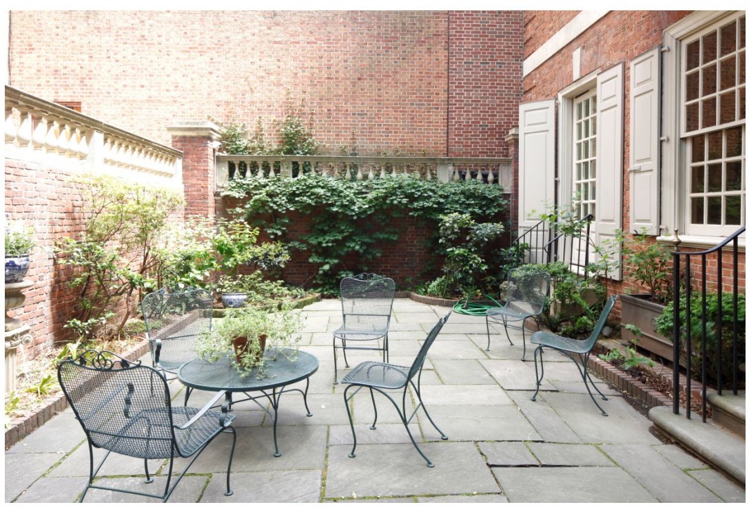
Garden, view to the east Sarah Moses, June 2019