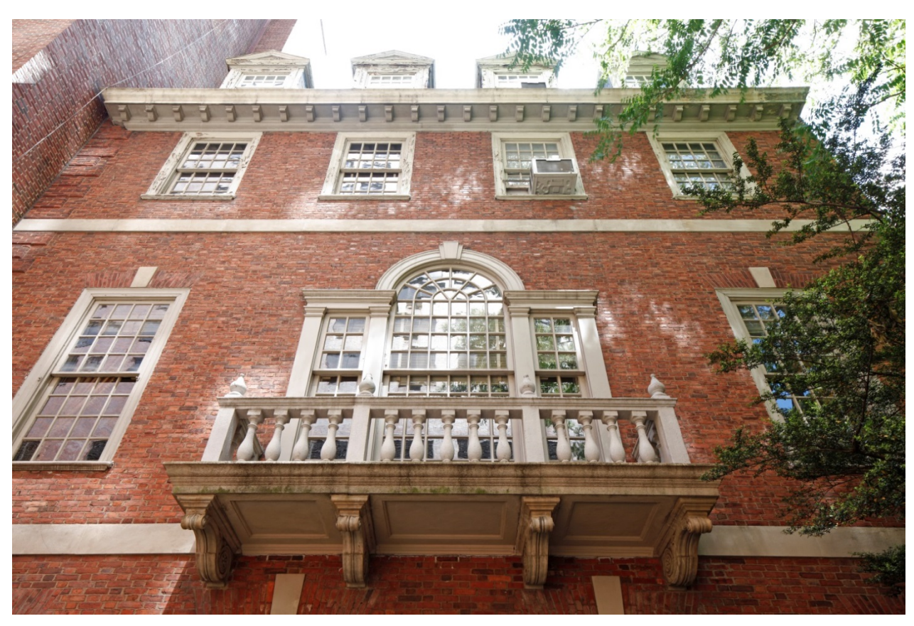
Rear facade, upper stories Sarah Moses, June 2019