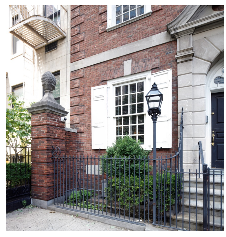
First story detail Sarah Moses, June 2019