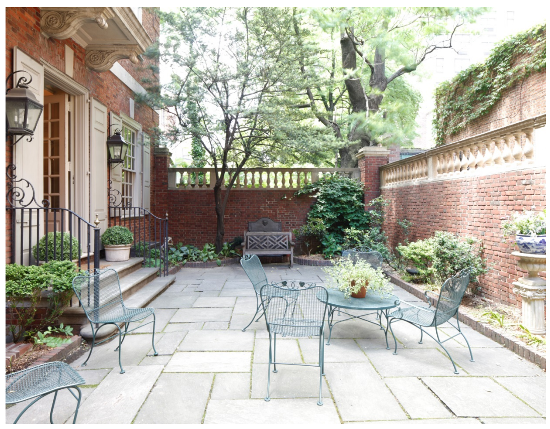
Garden, view to the west Sarah Moses, June 2019