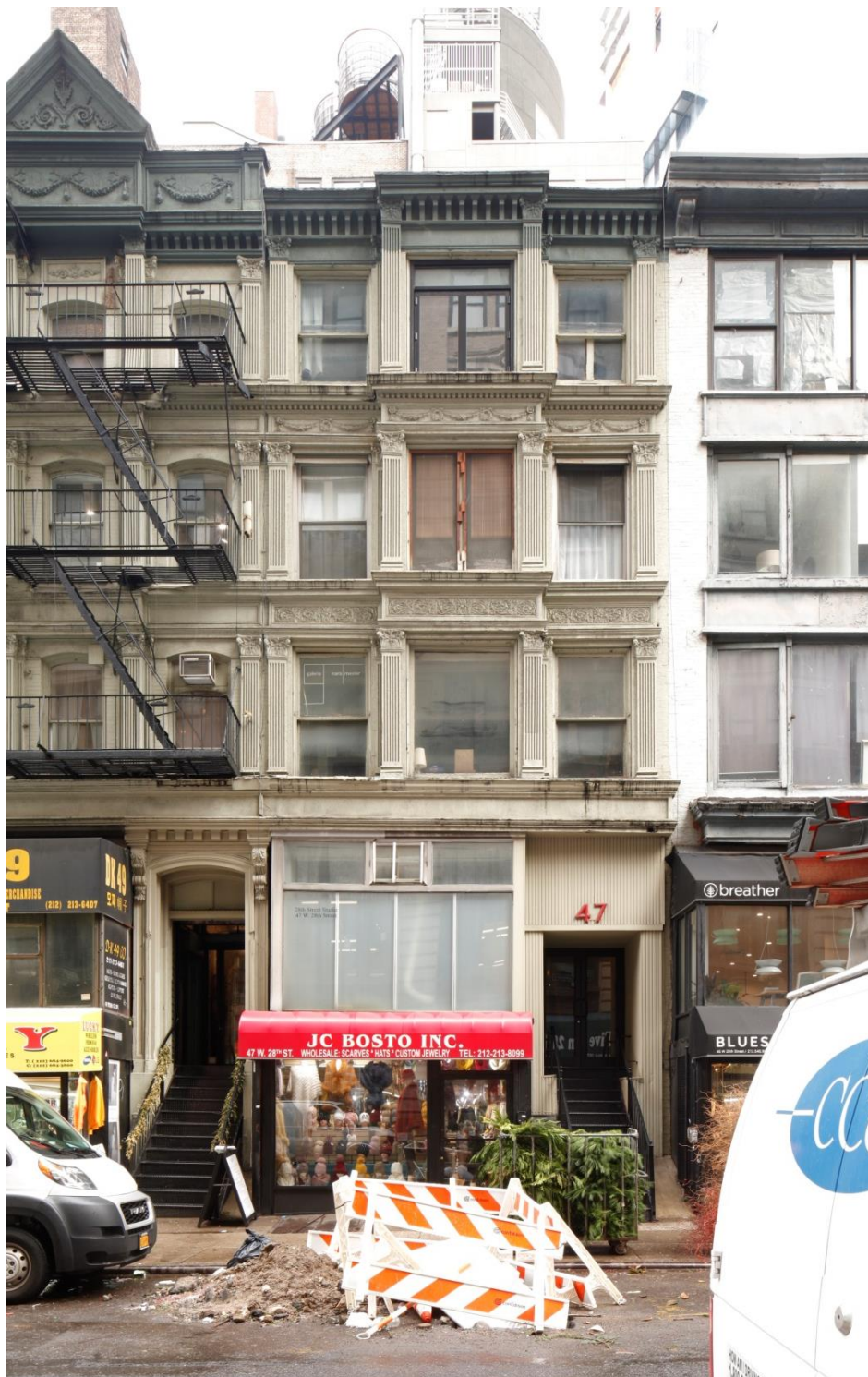
47 West 28th Street, Landmarks Preservation Commission, December 2019