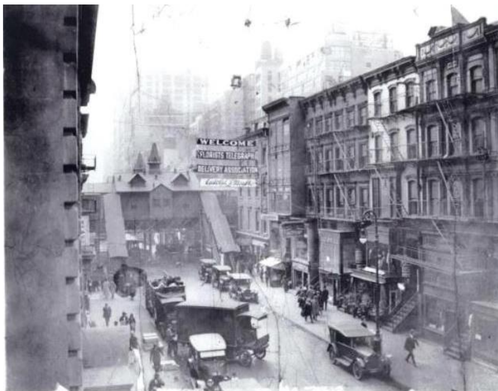
Banners welcome the Florists' Telegraph Delivery Association to West 28th Street in 1920,