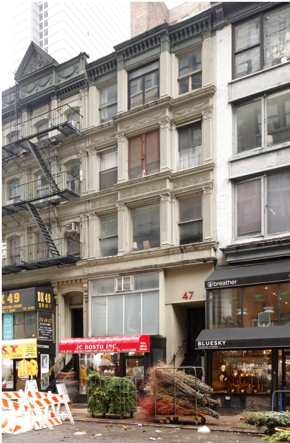
47 West 28th Street, Landmarks Preservation Commission, December 2019