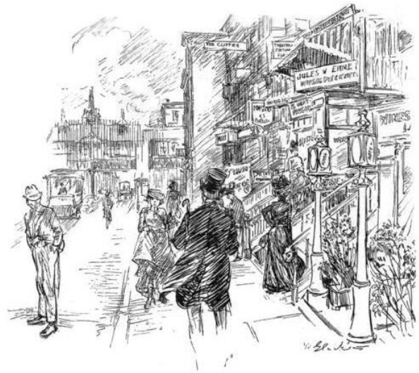
In Twenty-eighth Street.

(Right) Vignettes of the Tin Pan Alley streetscape and publishers' offices, William Glackens, Harper's Weekly XLIV, December 8, 1900