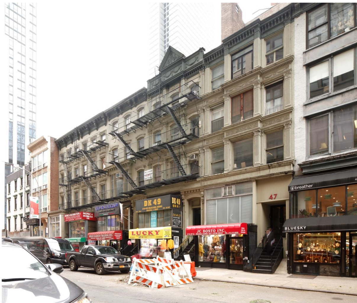
47-55 West 28th Street Buildings, Tin Pan Alley Landmarks Preservation Commission, December 2019