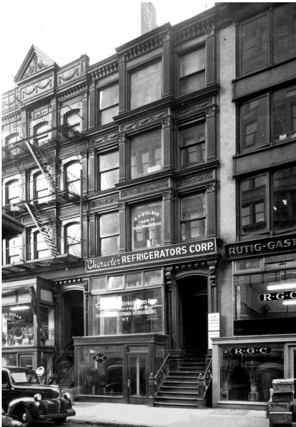
45-49 West 28th Street, New York Public Library Lloyd L. Acker Collection, Series 2522, Roll 29, Page 5, c.1955