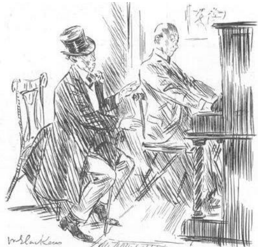
A Rehearsal in the Private Room.