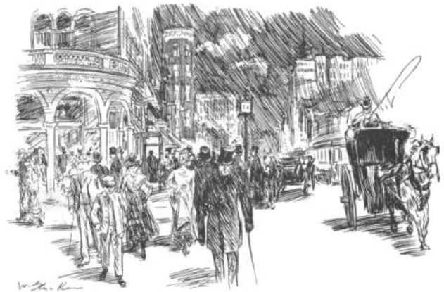
"That Fairyland of Theatres and gaudy Palaces which is Broadway."

Madison Square's tenure as a theater district was brief. By the 1890s, Longacre Square, which