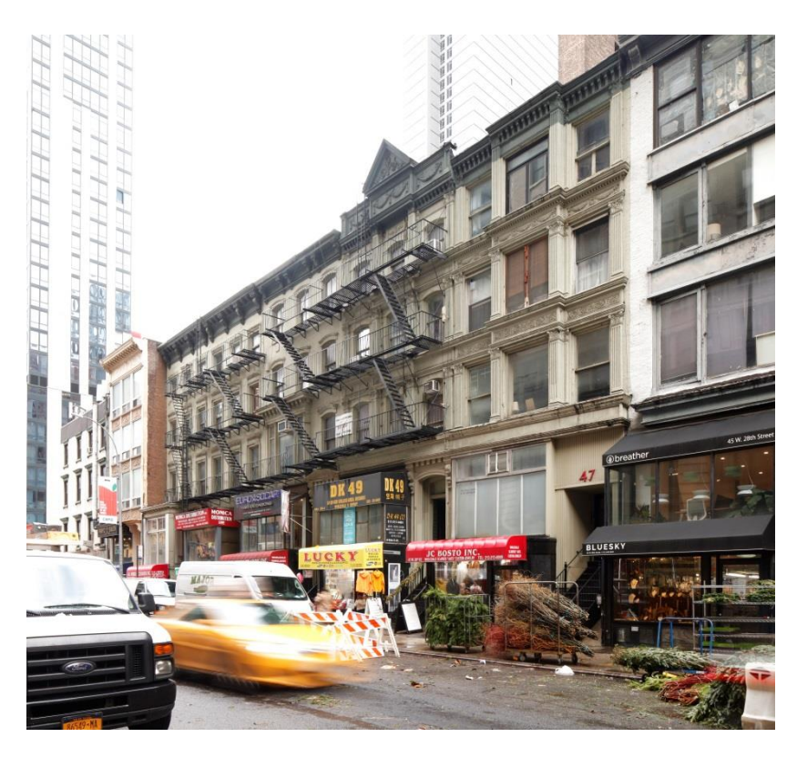
47 , 49 , 51 , 53 , and 55 West 28th Street , December 2019