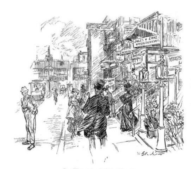
In Twenty-eighth Street.

(Right) Vignettes of the Tin Pan Alley streetscape and publishers' offices, William Glackens, Harper's Weekly XLIV, December 8, 1900