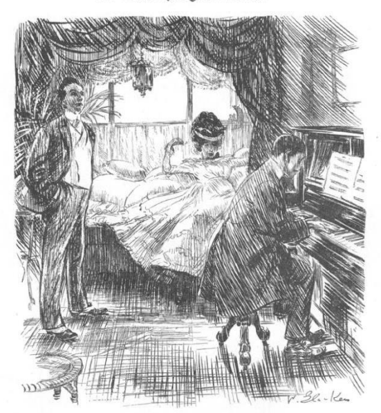
"In the exclusive Music-Room sits the Singer critically listening,"