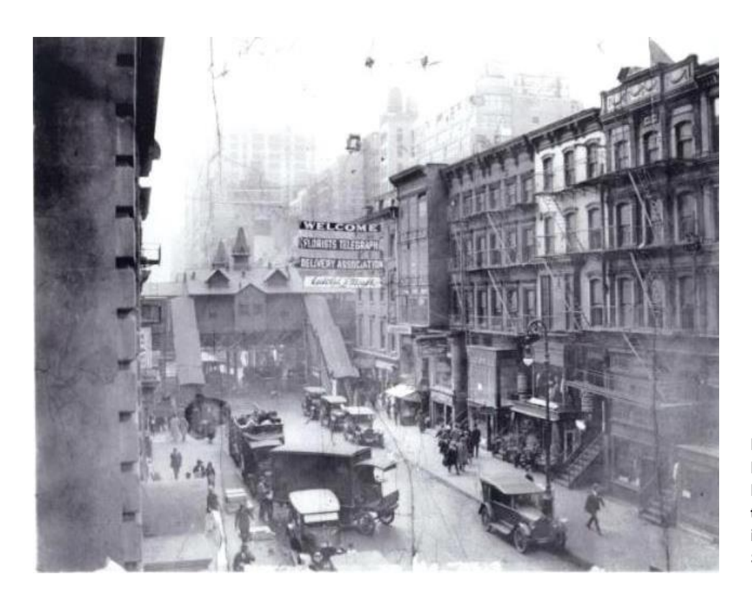
Banners welcome the Florists' Telegraph Delivery Association to West 28th Street in 1920