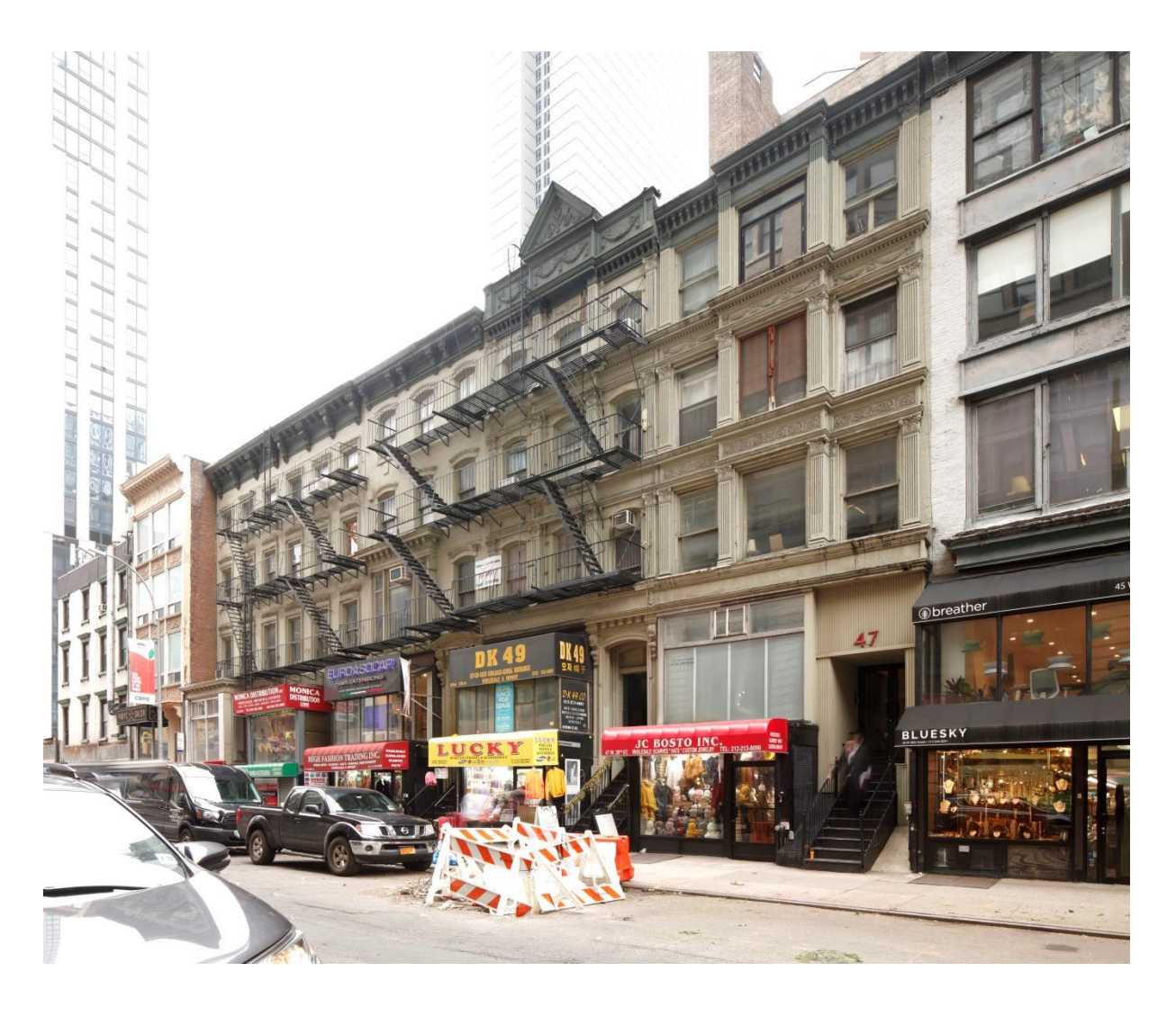
47-55 West 28th Street Buildings, Tin Pan Alley Landmarks Preservation Commission, December 2019