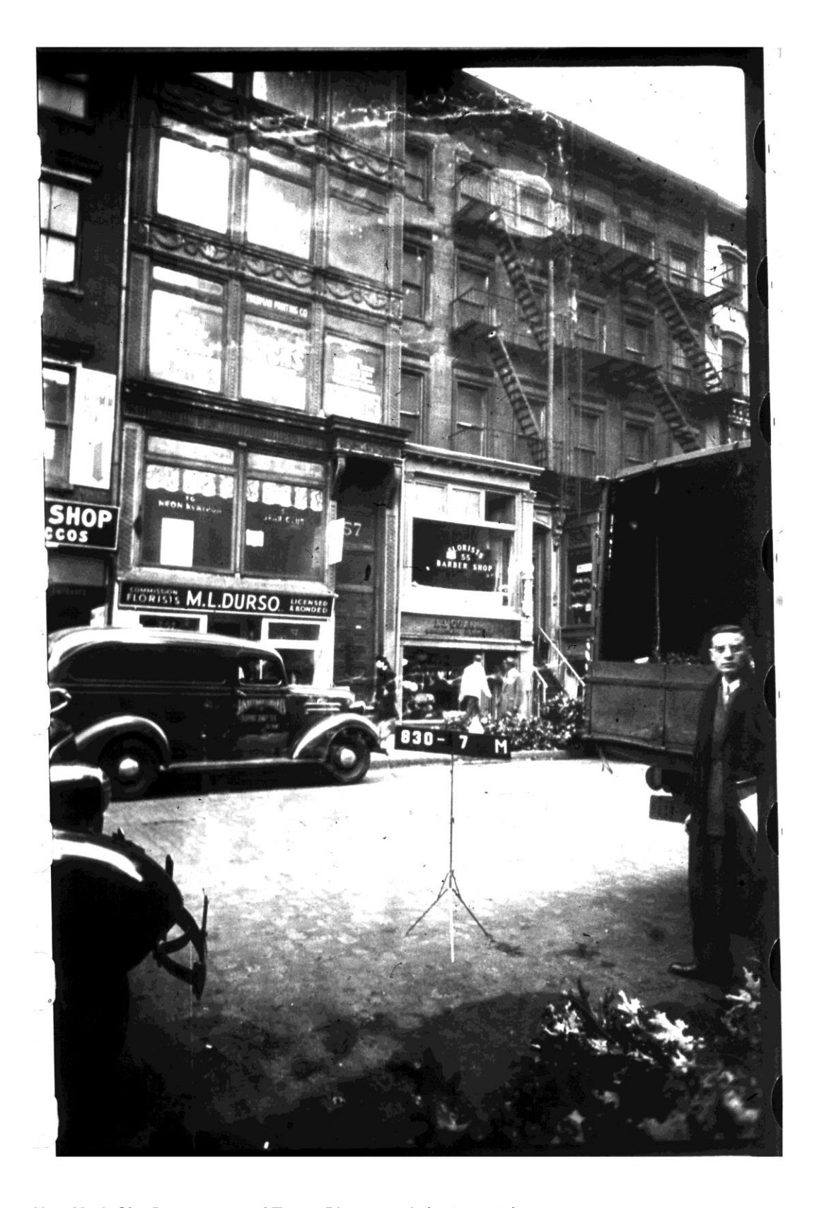
New York City Department of Taxes Photograph (c. 1938-43)