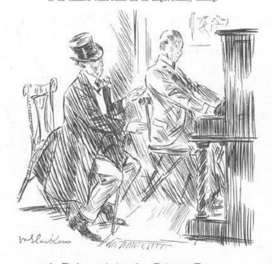
A Rehearsal in the Private Room.