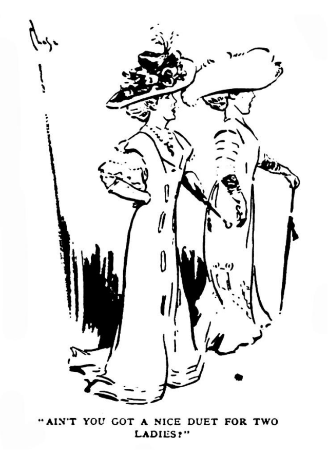
Tin Pan Alley's publishers sought to work with well-known female performers, J. C. Chase, Hampton's Broadway Magazine XXI, October 1908

classic was firmly planted in as many domes as were within hearing distance." Publishers' dependence on female consumers was evident in Charles Darnton's lamentation about Tin Pan Alley, which made a connection between women's alleged preferences and fads in music: "Songs are nearly always bought for or by women. For this reason the maudlin-pathetic ballad is the 'best seller,' while the comic song has little sale." <sup>66</sup>