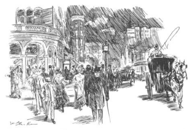
"That Fairyland of Theatres and gaudy Palaces which is Broadway."

Madison Square's tenure as a theater district