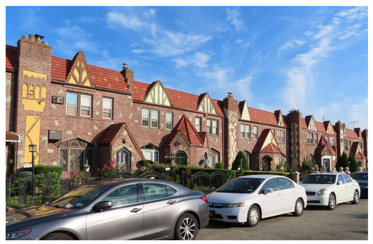
Figure 3: 222nd Street, west side Michael Caratzas, LPC, 2022