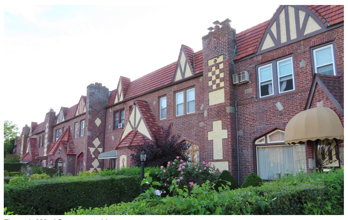
Figure 4: 222nd Street, east side Michael Caratzas, LPC, 2022