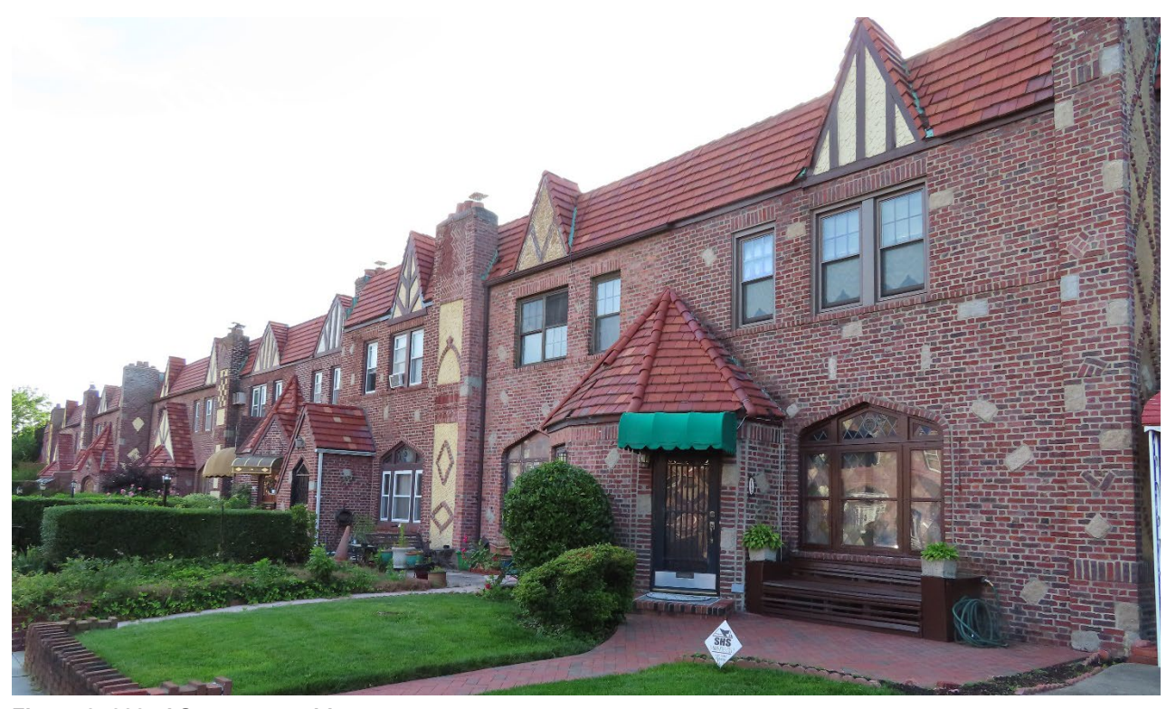
Figure 2: 222nd Street, east side Michael Caratzas, LPC, 2022