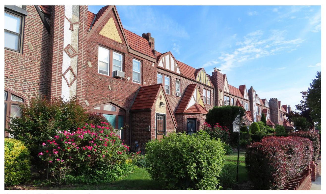
Figure 1: 222nd Street, west side