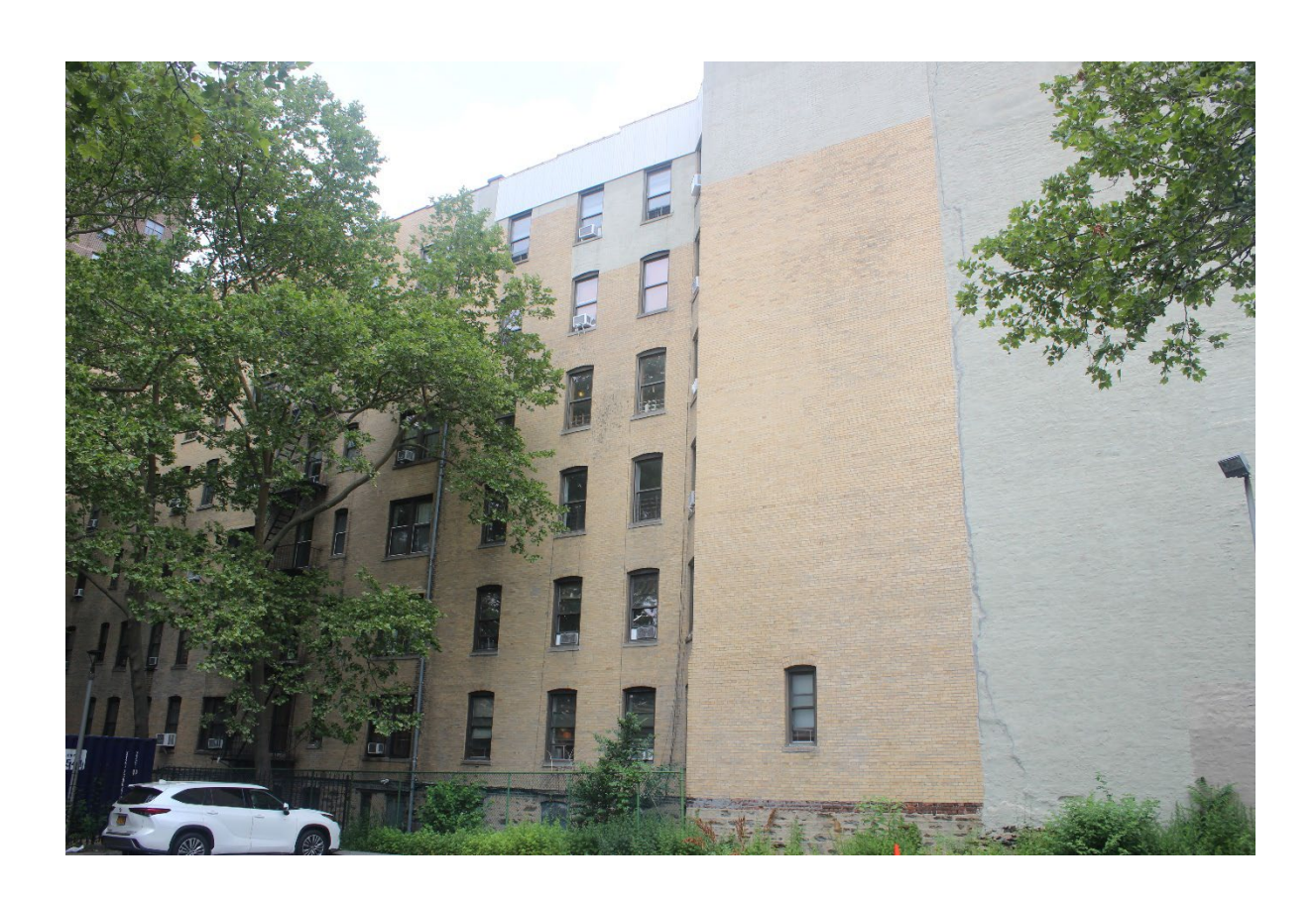
Eastern façade detail June 2023, Lisa Buckley