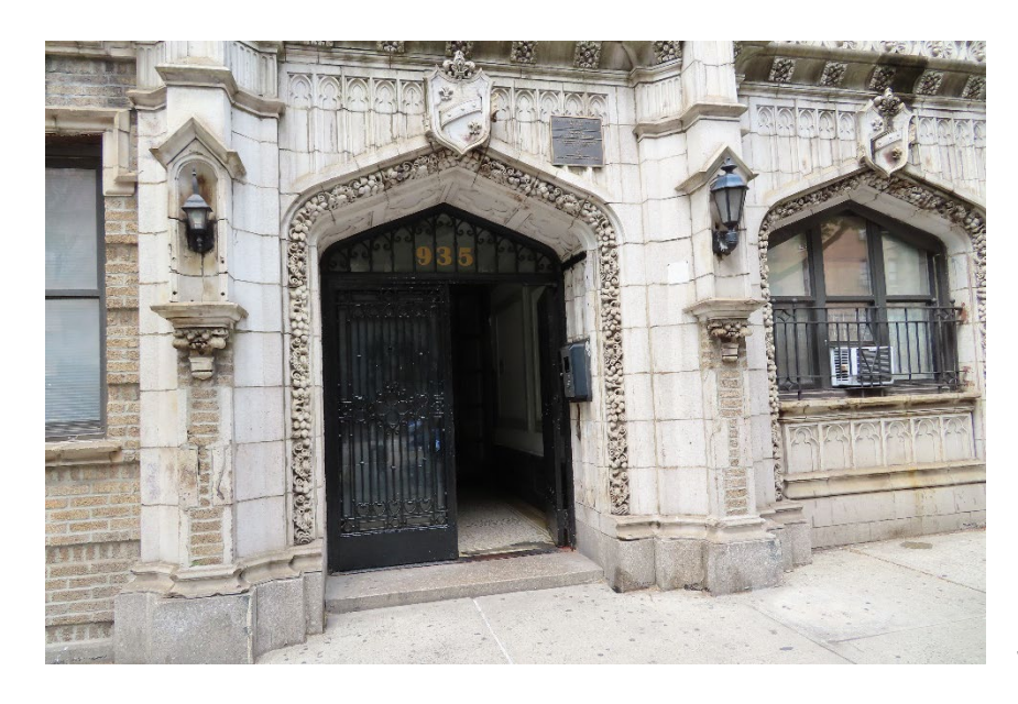
Main Entrance detail June 2023, Theresa C. Noonan