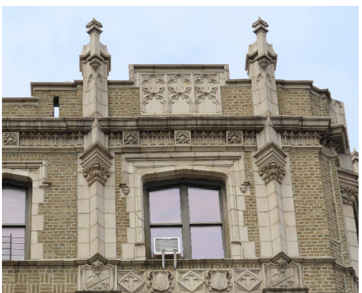
935 St. Nicholas Avenue June 2023