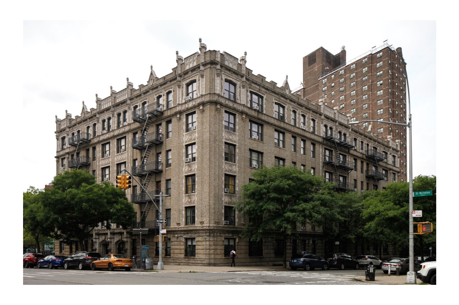
935 St. Nicholas Avenue Building, 935 St. Nicholas Avenue June 2023, Bilge Klose