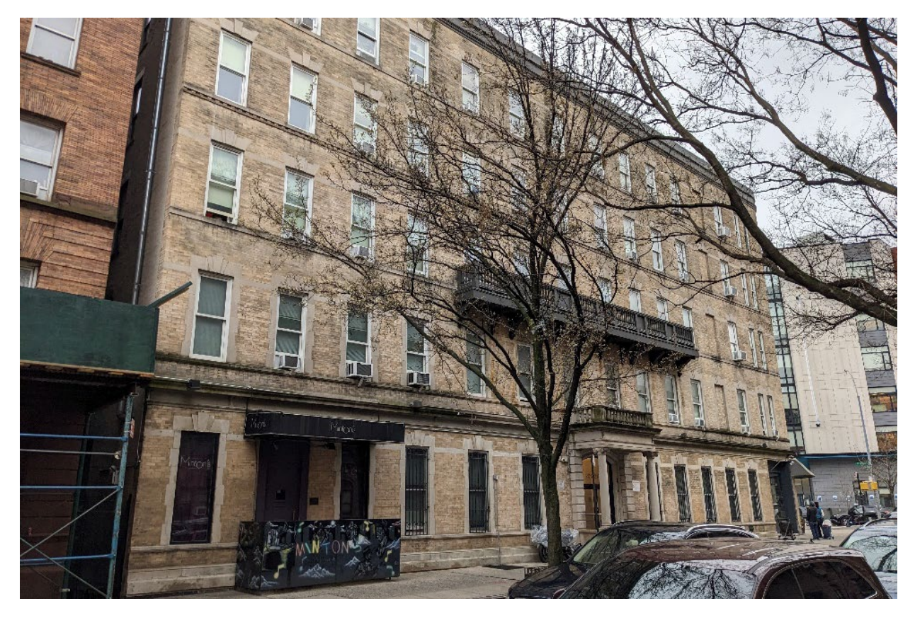
West 118<sup>th</sup> Street facade LPC Staff, March 2023