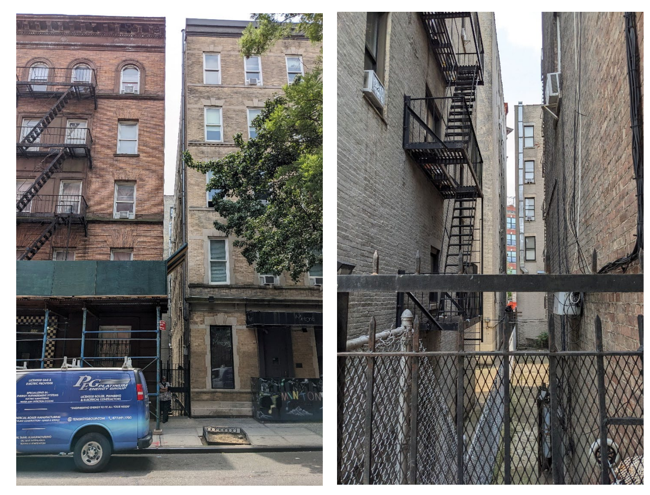
West 118<sup>th</sup> Street façade, east end (left) View from Adam C. Powell Jr. Boulevard (right)