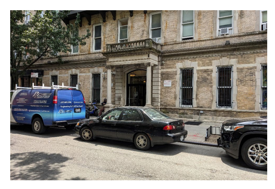
Hotel entrance West 118<sup>th</sup> Street LPC Staff, June 2023