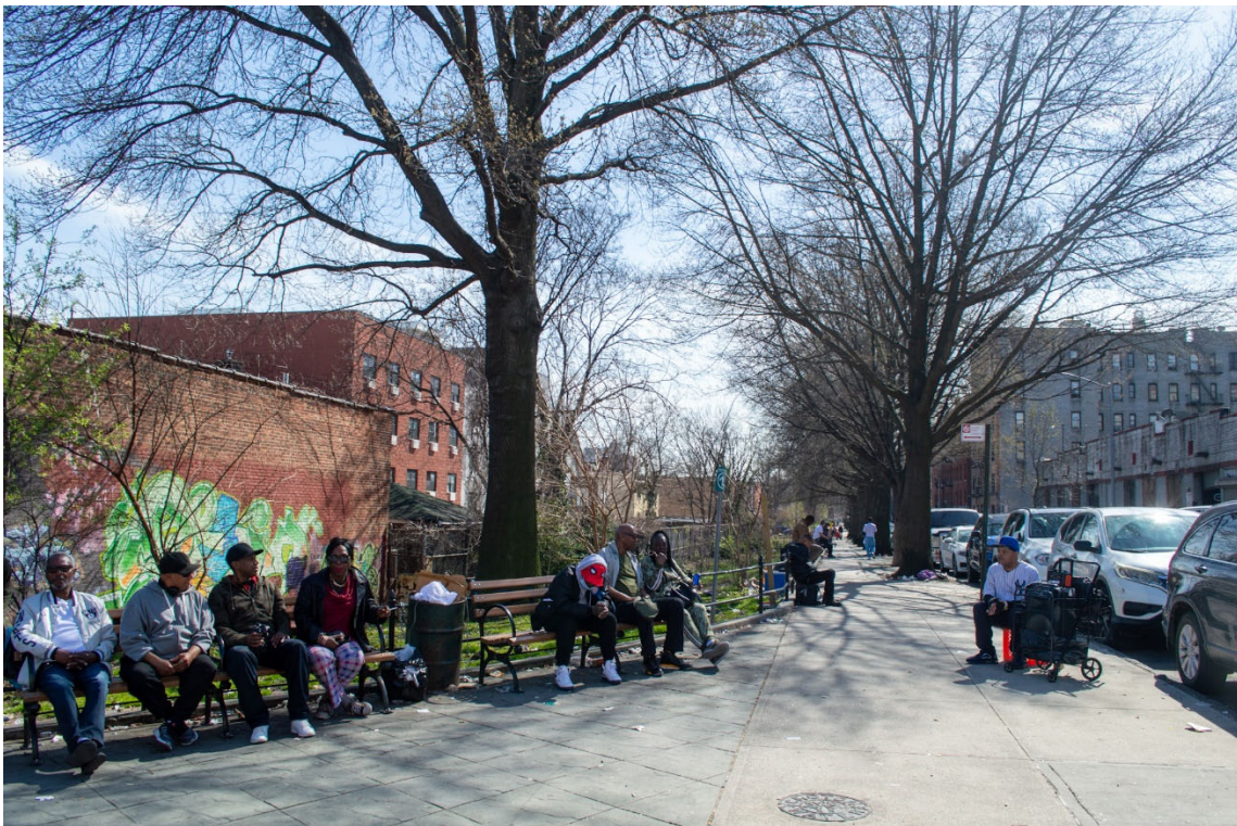
Aqueduct Walk, entrance and path, southern entrance on West Kingsbridge Road, 2024