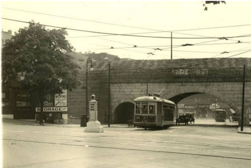
Burnside Avenue Bridge, Removed Lehman College Archives, 1920