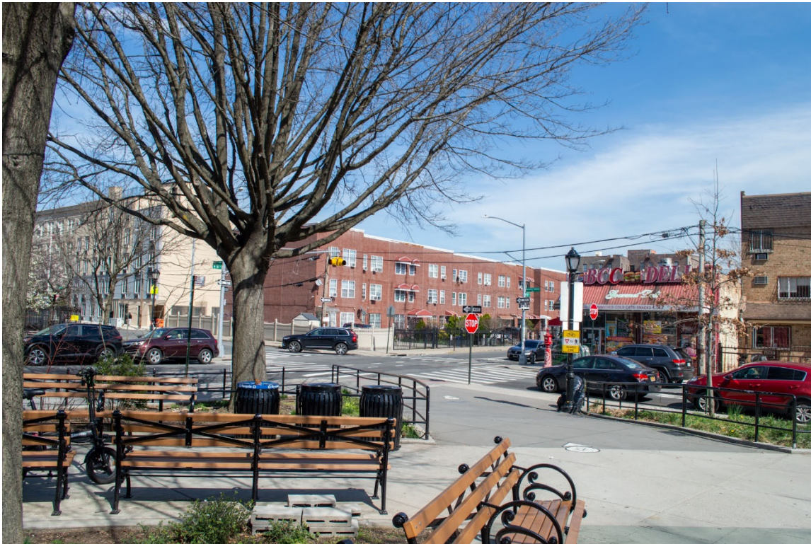
Aqueduct Walk, seating area, near West 181st Street and Aqueduct Avenue East, 2024