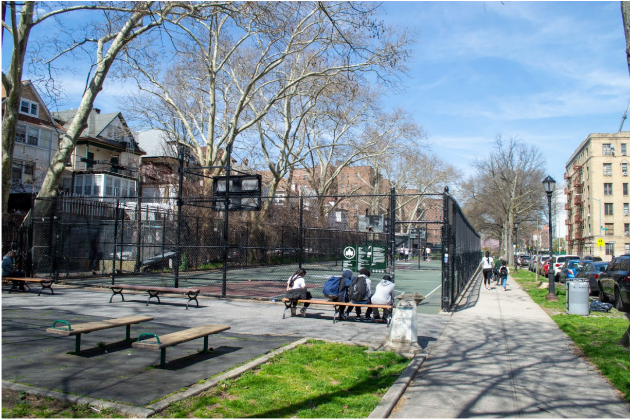
Aqueduct Walk, fitness area, basketball court, and path, near West 182nd Street and Aqueduct Avenue East, 2024