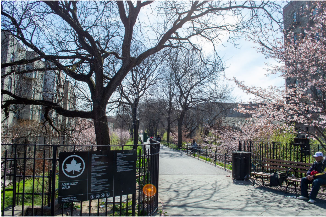
Aqueduct Walk, entrance and path, southern entrance on West Fordham Road, 2024