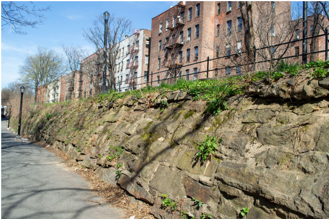
Aqueduct Walk, path and embankment wall, north from West Fordham Road entrance, 2024