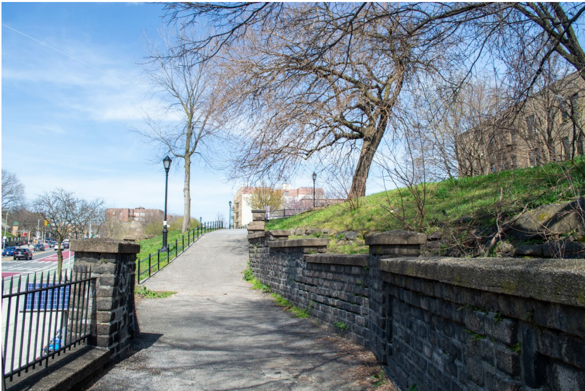
Aqueduct Walk, path, near University and West Burnside Avenues, 2024