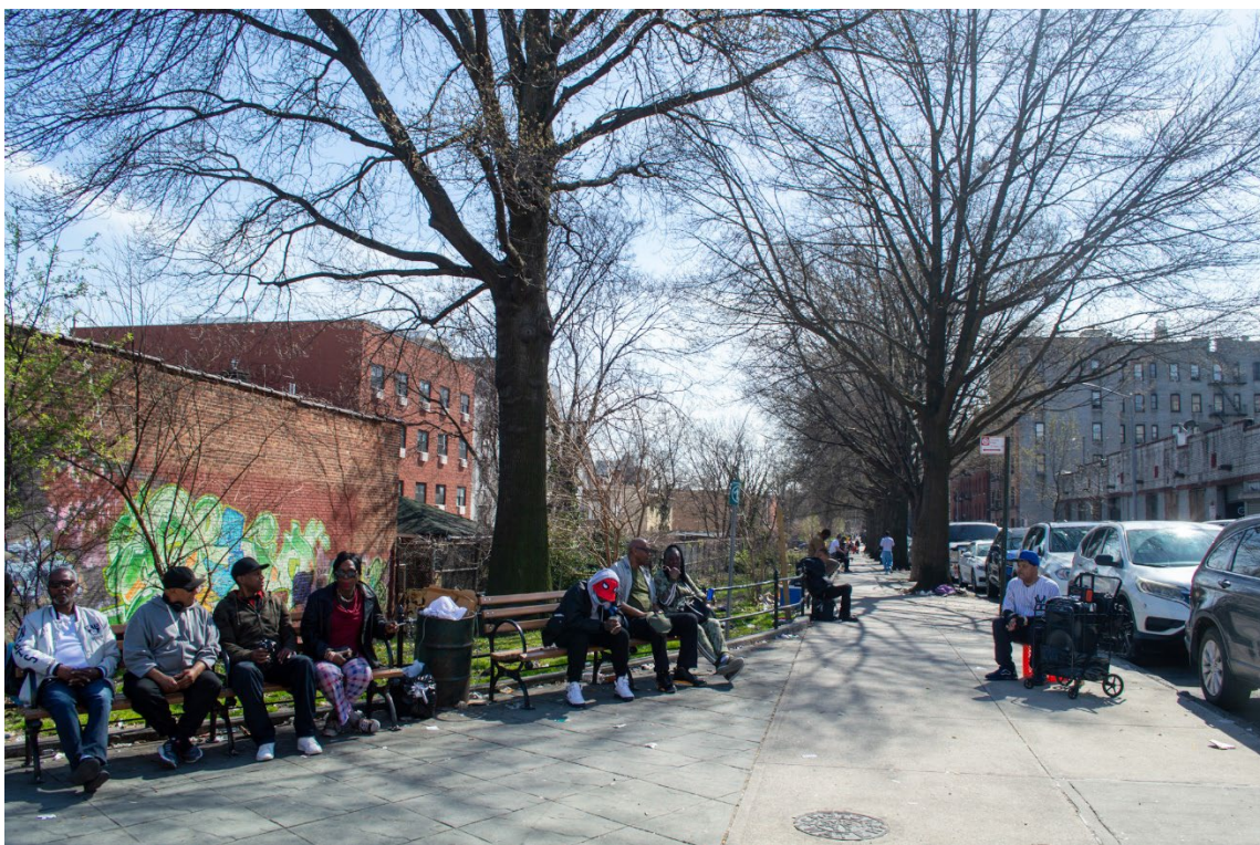
Aqueduct Walk, entrance and path, southern entrance on West Kingsbridge Road, 2024