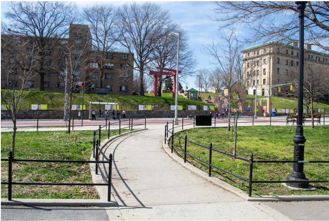
Aqueduct Walk, entrance and path, near West 181st Street and Aqueduct Avenue East, 2024