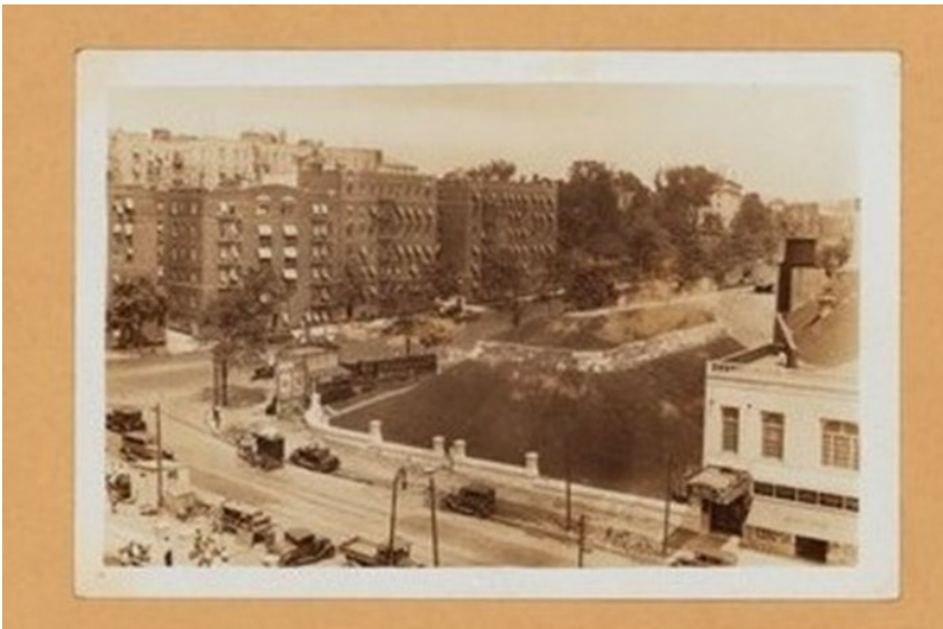
University and Burnside Avenue NYPL Digital Collections, 1931