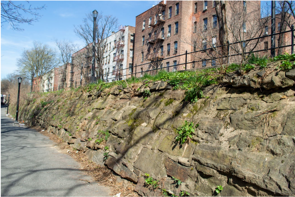
Aqueduct Walk, path and embankment wall, north from West Fordham Road entrance, 2024