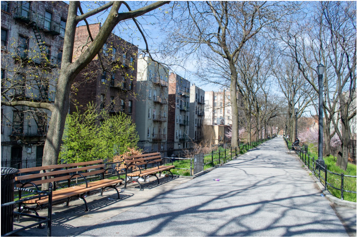
Aqueduct Walk, seating area and path, near Evelyn Place and Aqueduct Avenue East, 2024