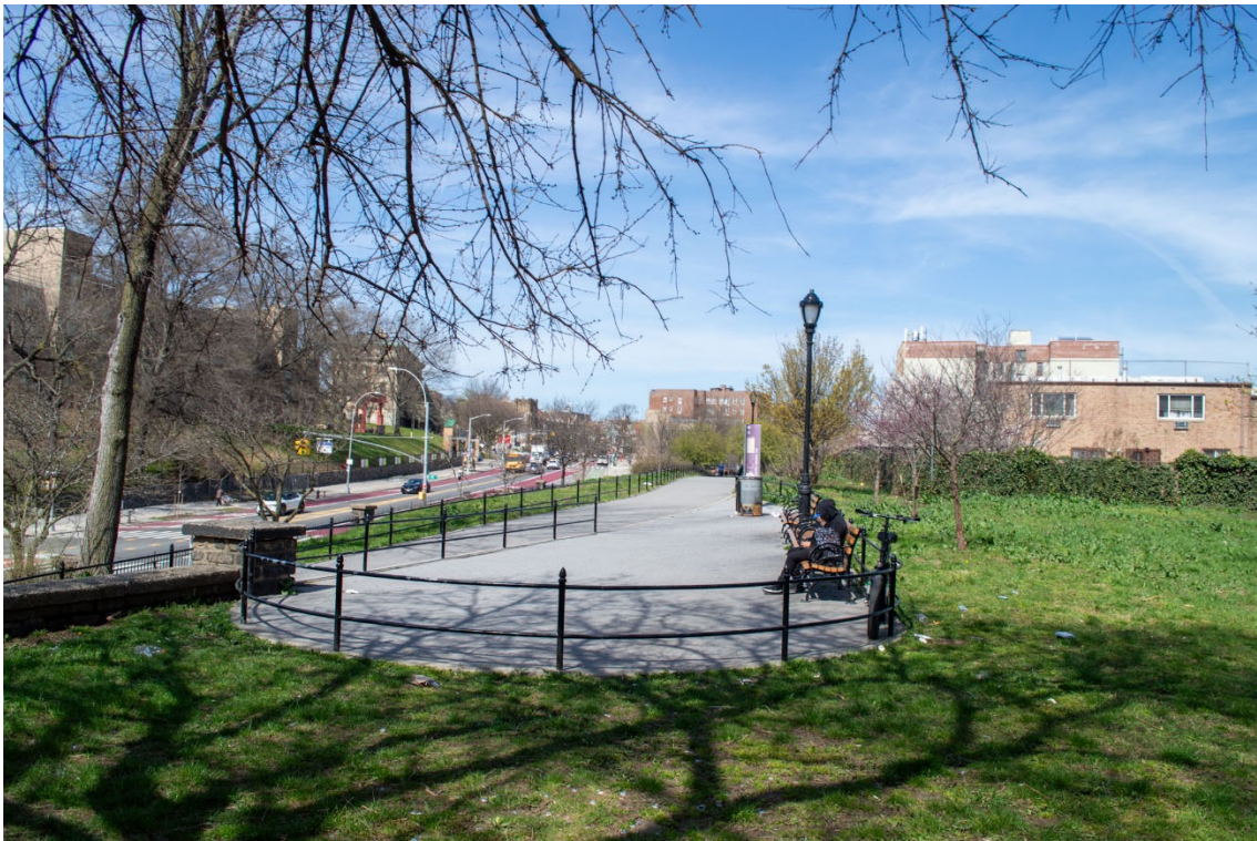
Aqueduct Walk, path, near University and West Burnside Avenues, 2024