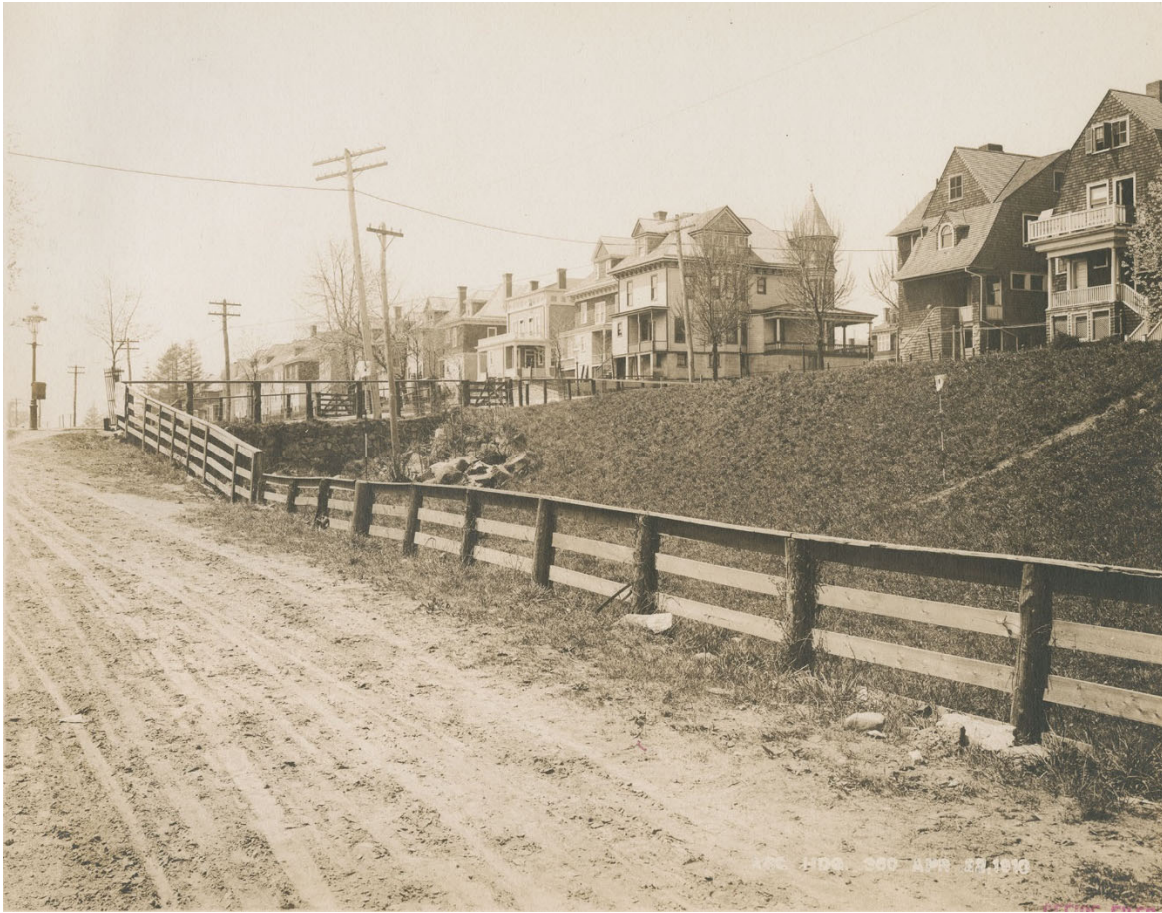
Aqueduct Walk , near 181 st Street, Copyright New York City Department of Environmental Protection, DEP Archives, Digital Image ID p009937