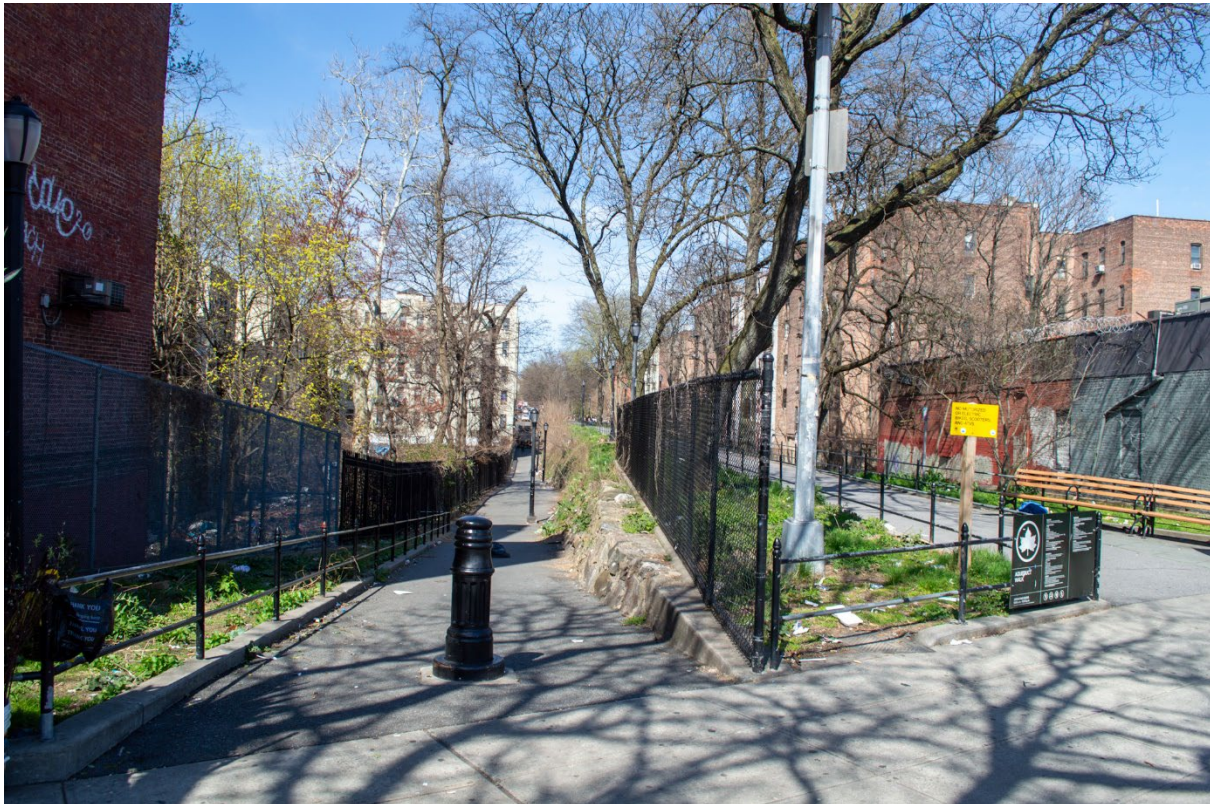
Aqueduct Walk, entrance and path, norther entrances on West Fordham Road, 2024