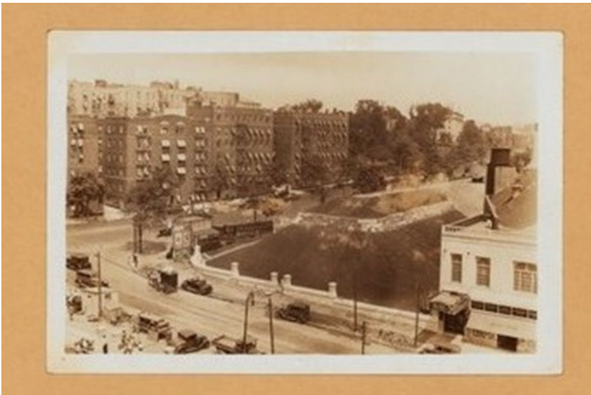
University and Burnside Avenue, 1931