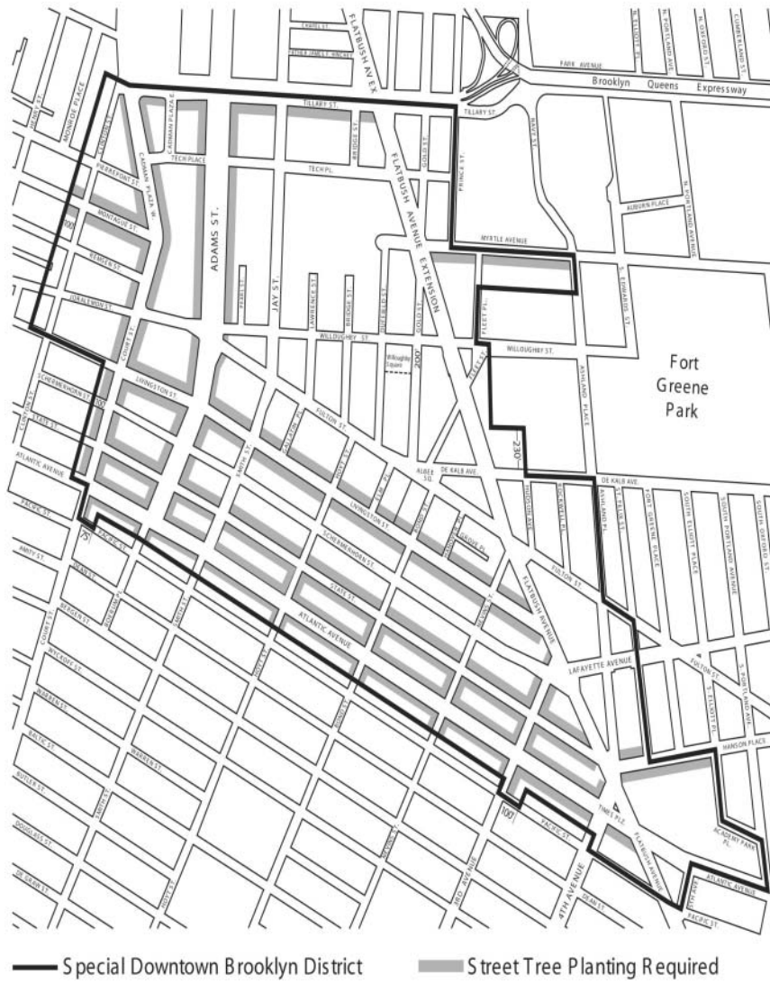
Map 6 Street Tree Planting