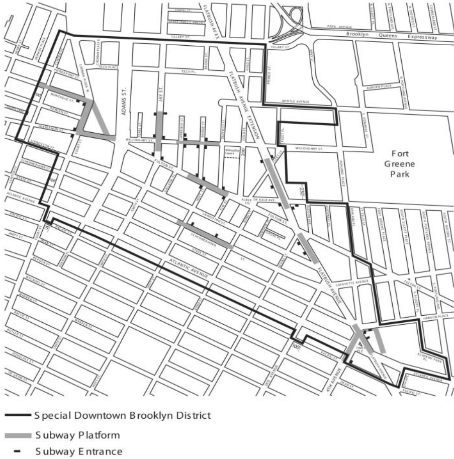
Map 8. Subway Station Improvement Areas

(On March 10, 2004, Cal. No. 7 the Commission scheduled March 24, 2004 for a public hearing. On March 24, 2004, Cal. No. 16, the hearing was closed.)