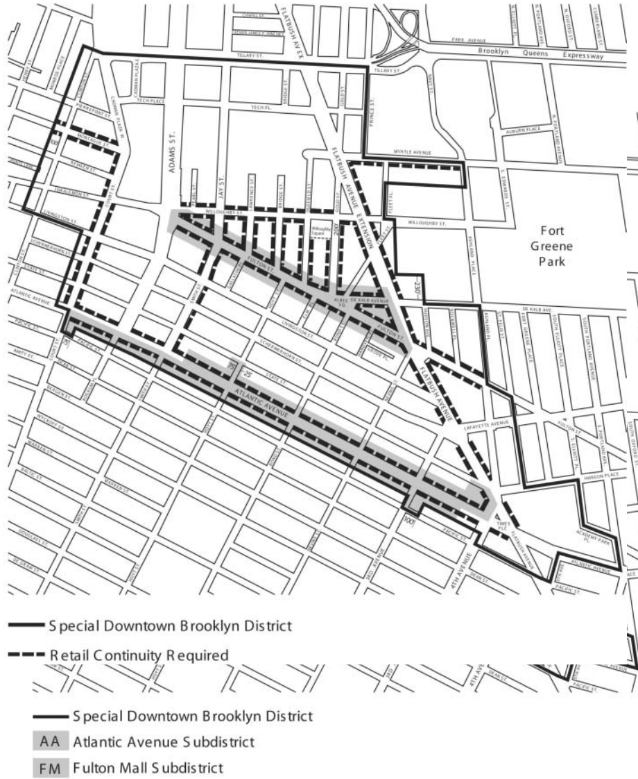
Map 2 Ground Floor Retail Frontage