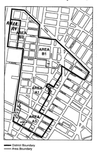
APPENDIX A Special Tribeca Mixed Use District Map - Proposed

Area A1: General Mixed Use Area Area A2: Limited Mixed Use Area Area A3: General Mixed Use Area Area A4: General Mixed Use Area Area B1: Limited Mixed Use Area Area B2: Limited Mixed Use Area