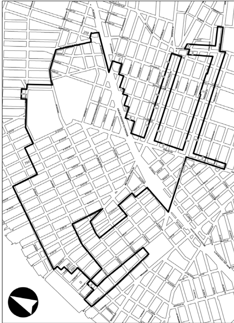
EXISTING Portion of Community District 1, Brooklyn