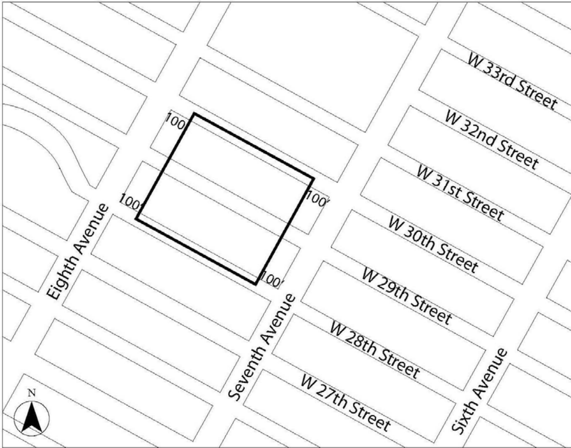
Map _____. Portion of Community District 5, Manhattan

(On July 13, 2011, Cal. No. 10, the Commission scheduled July 27, 2011 for a public hearing which has been duly advertised.)