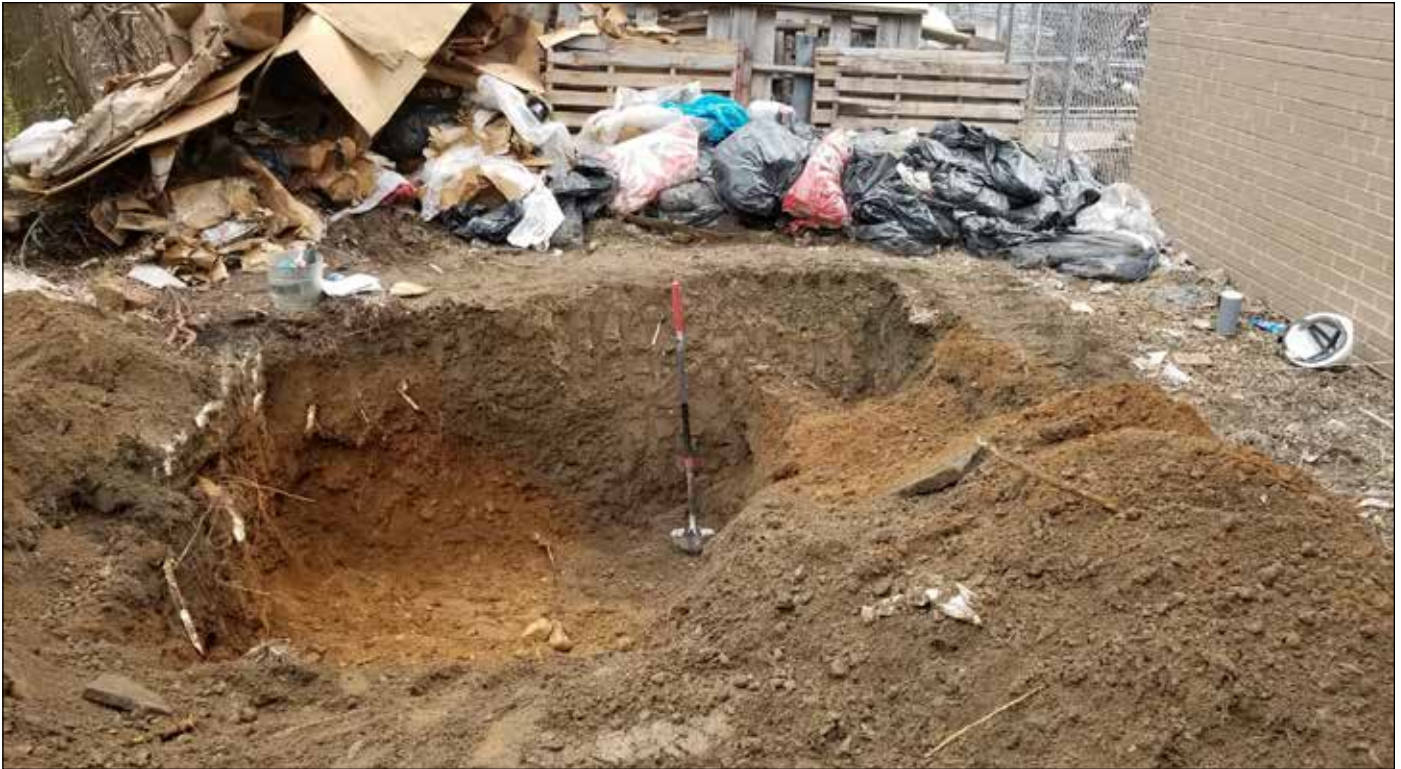
Facing southeast showing excavation of north half of Trench 3. The dark grey sandy soil to the right is clean fill associated with construction of the building at the right edge of photo. The brown sandy soil to the left is natural