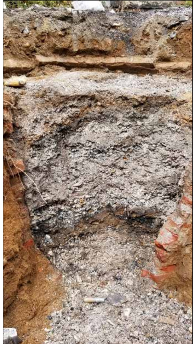
Facing west from within Trench 2 showing that the ash deposits extended to a depth of 5 feet below the top of the feature