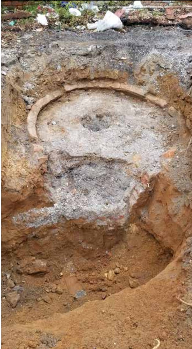
Facing west showing Trench 2 after removal of a portion of the cistern's eastern side, revealing dense deposits of coal ash