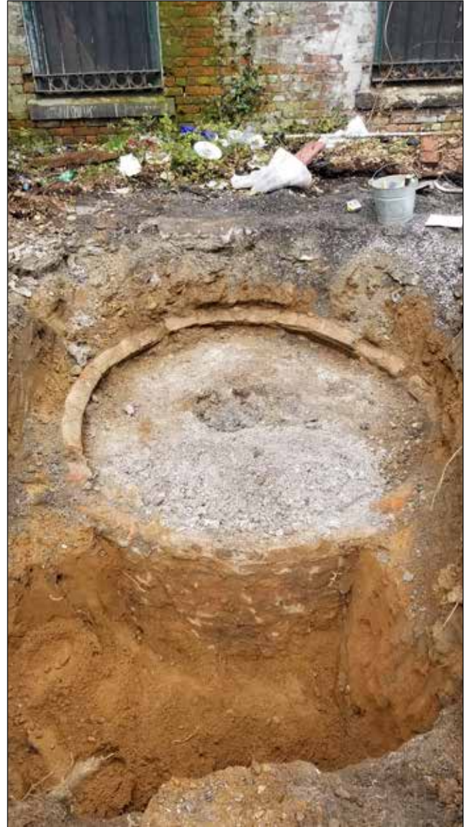
Facing west showing Trench 2 after excavation of a shovel test pit into center of brick-lined cistern and excavation of several feet of natural sandy brown soil from east side of cistern