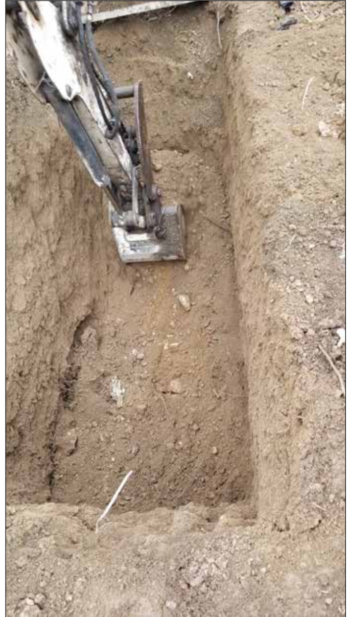
Completed excavation of the south half of Trench 3 to a depth of 8 feet below ground surface. Note that excavated soil consisted of clean dark grey fill