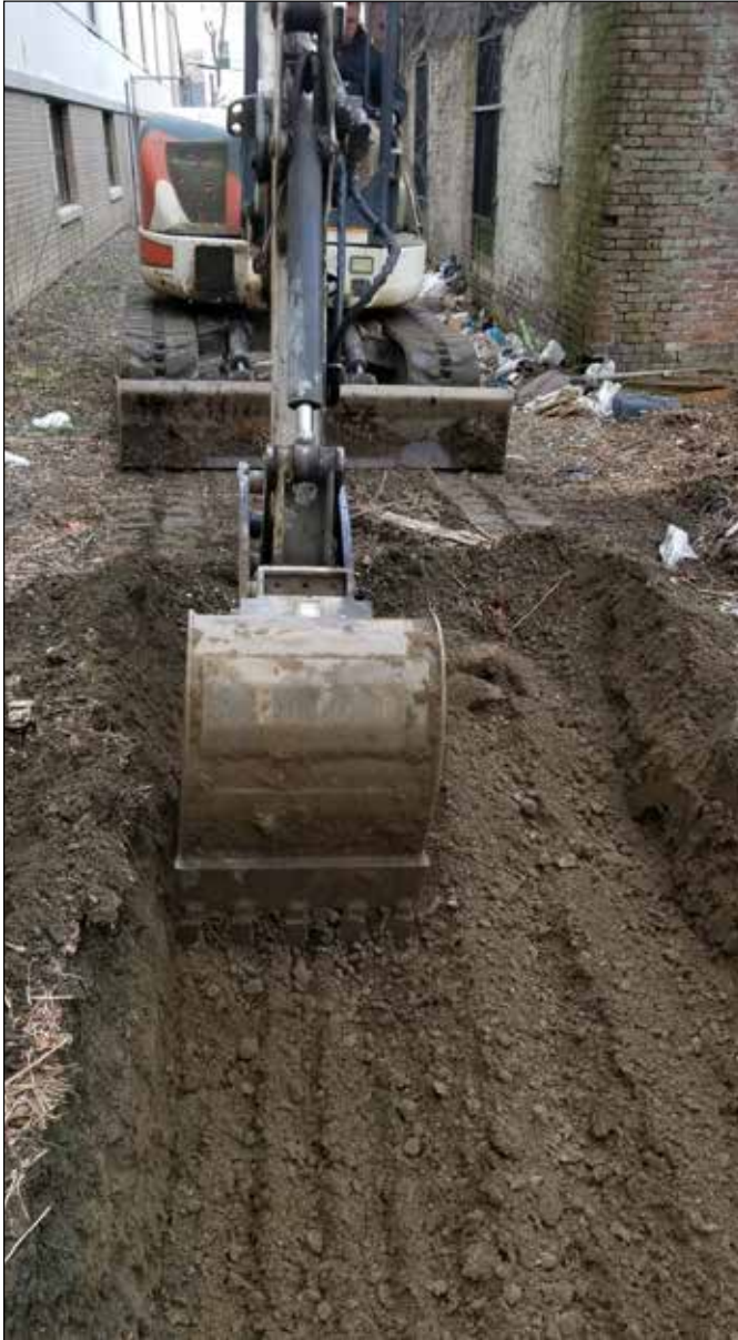
Facing northwest from the southeast corner of the backyard area showing excavation of Trench 3