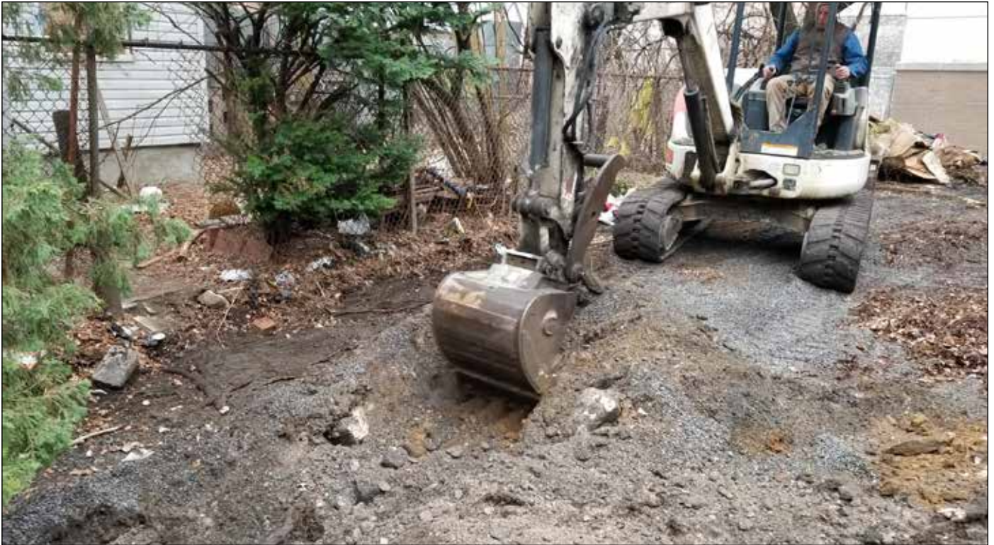
Facing southeast from center of site showing rear yard of church and excavation of Trench 1