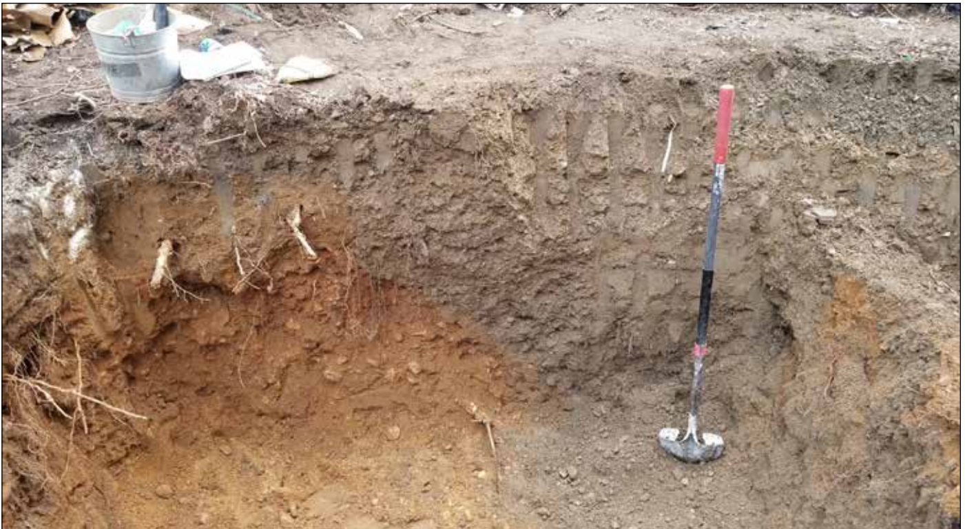
Detail of east wall of Trench 3 showing natural brown sands to the left and dark grey fill to the right