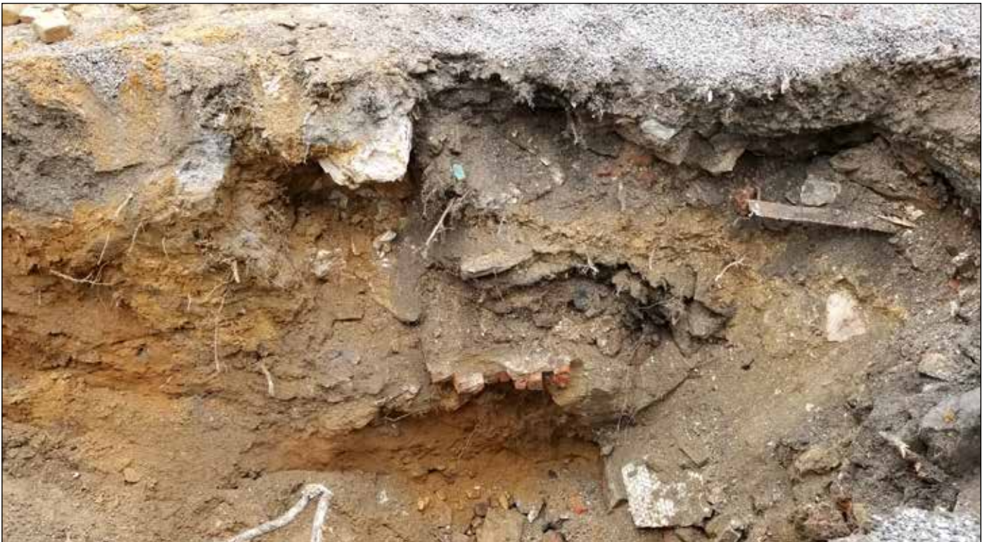
Facing west showing the western wall of Trench 1. Note natural brown sandy soil to the left and demolition debris and fill to the right