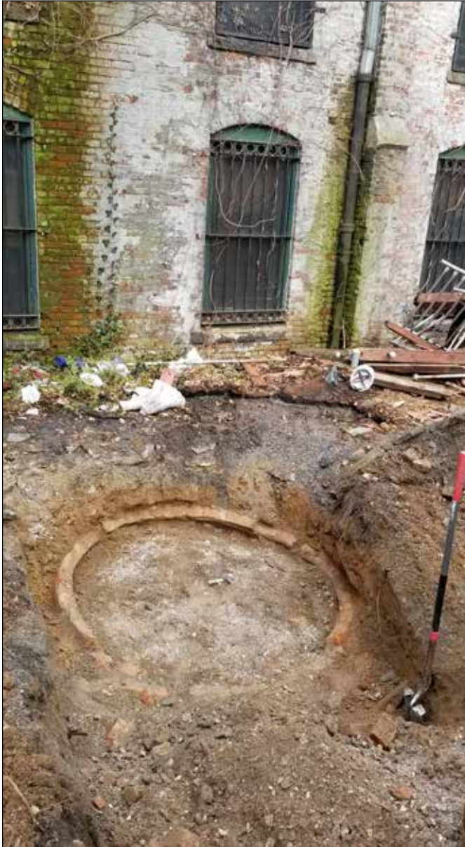
Facing west showing Trench 2 close to the rear wall of the church. Note circular brick-lined cistern