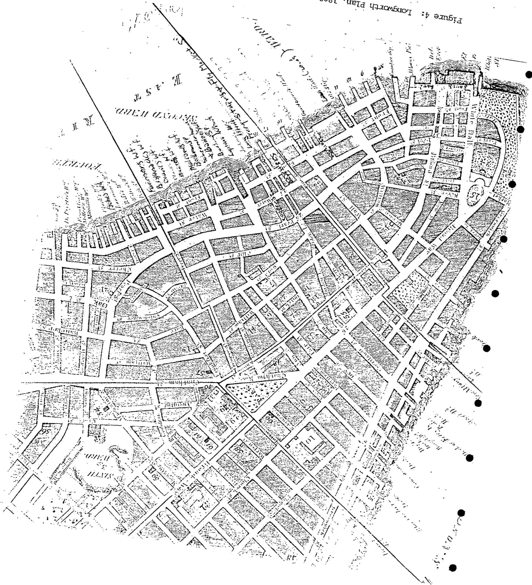
Figure 4: Longworth Plan, 1808