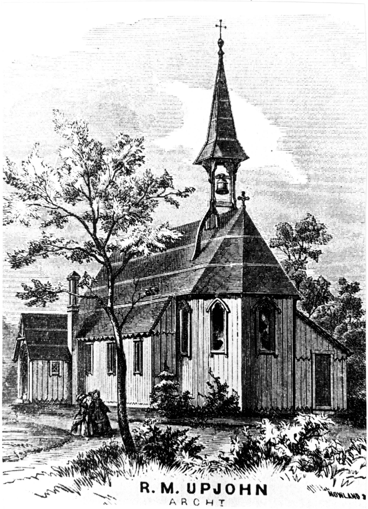
St. Alban's Episcopal Church (originally Church of the Holy Comforter) Original Building