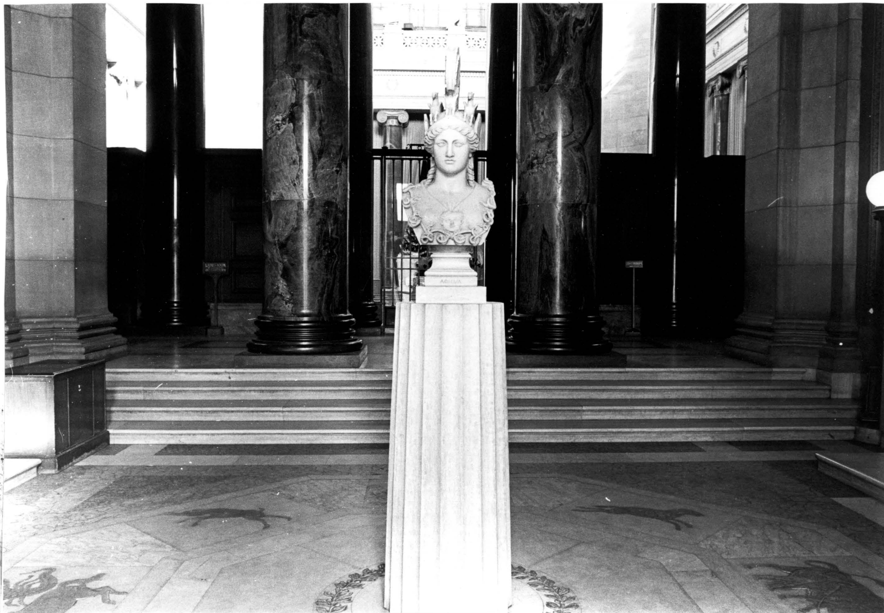
Low Memorial Library Interior Vestibule Built 1895-97

Architect: Charles F. McKim of McKim, Mead & White