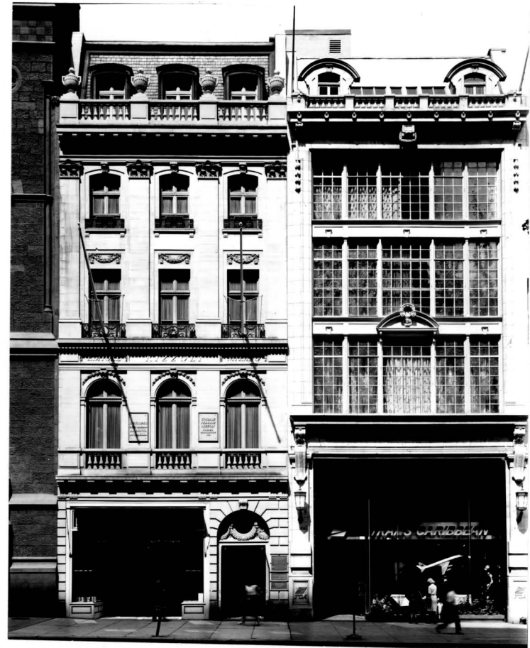
Rizzoli and former Coty Building 712 and 714 Fifth Avenue