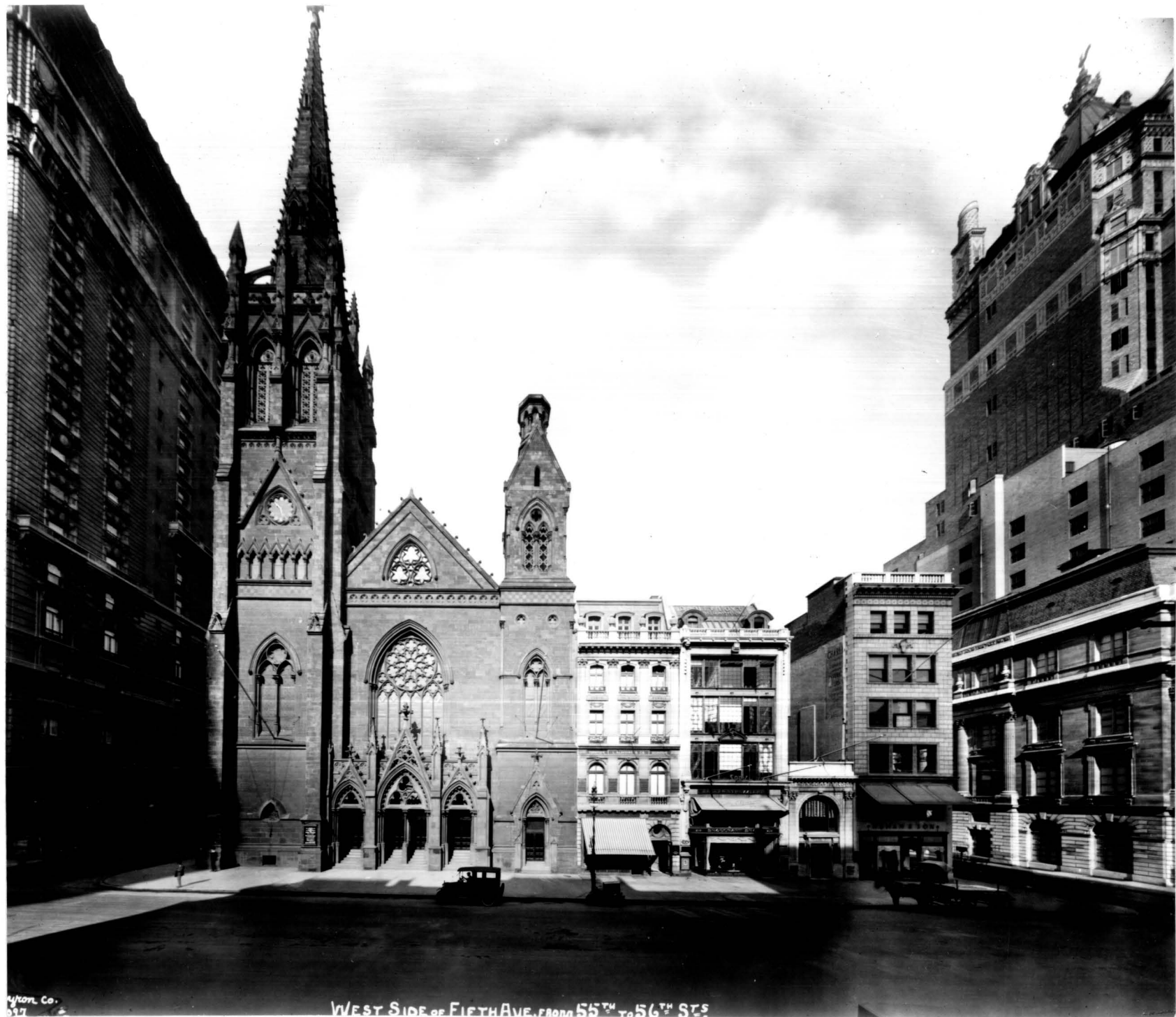
West side of Fifth Avenue between 55th and 56th Streets 1924 photograph