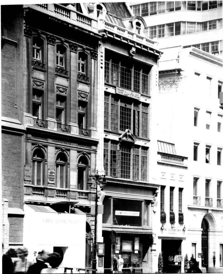
Rizzoli and former Coty Building 712 and 714 Fifth Avenue