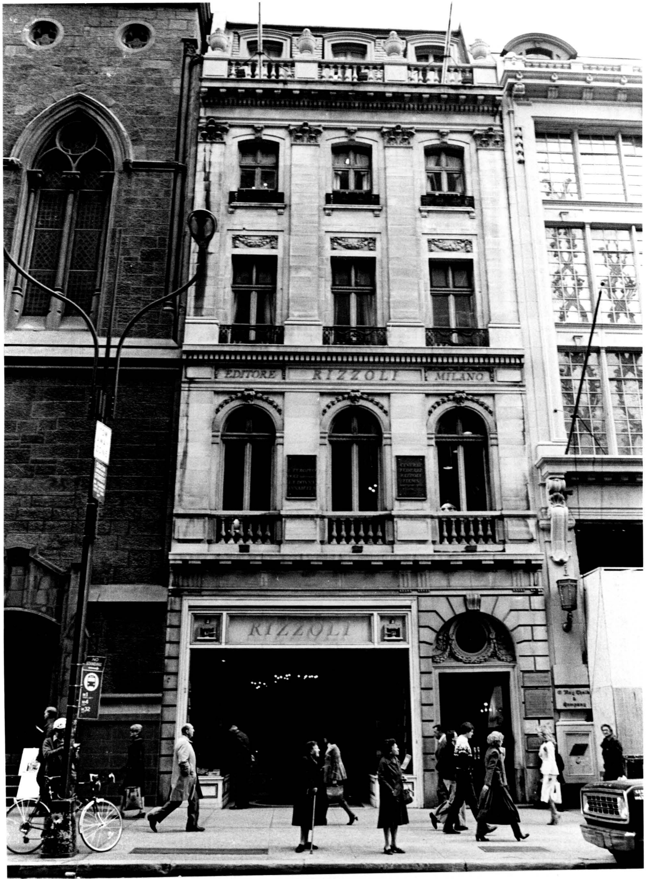
Rizzoli Building 712 Fifth Avenue Manhattan