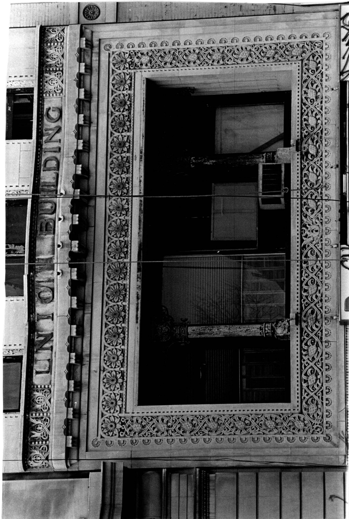
The Union Building (originally the Decker Building) Second story enframement