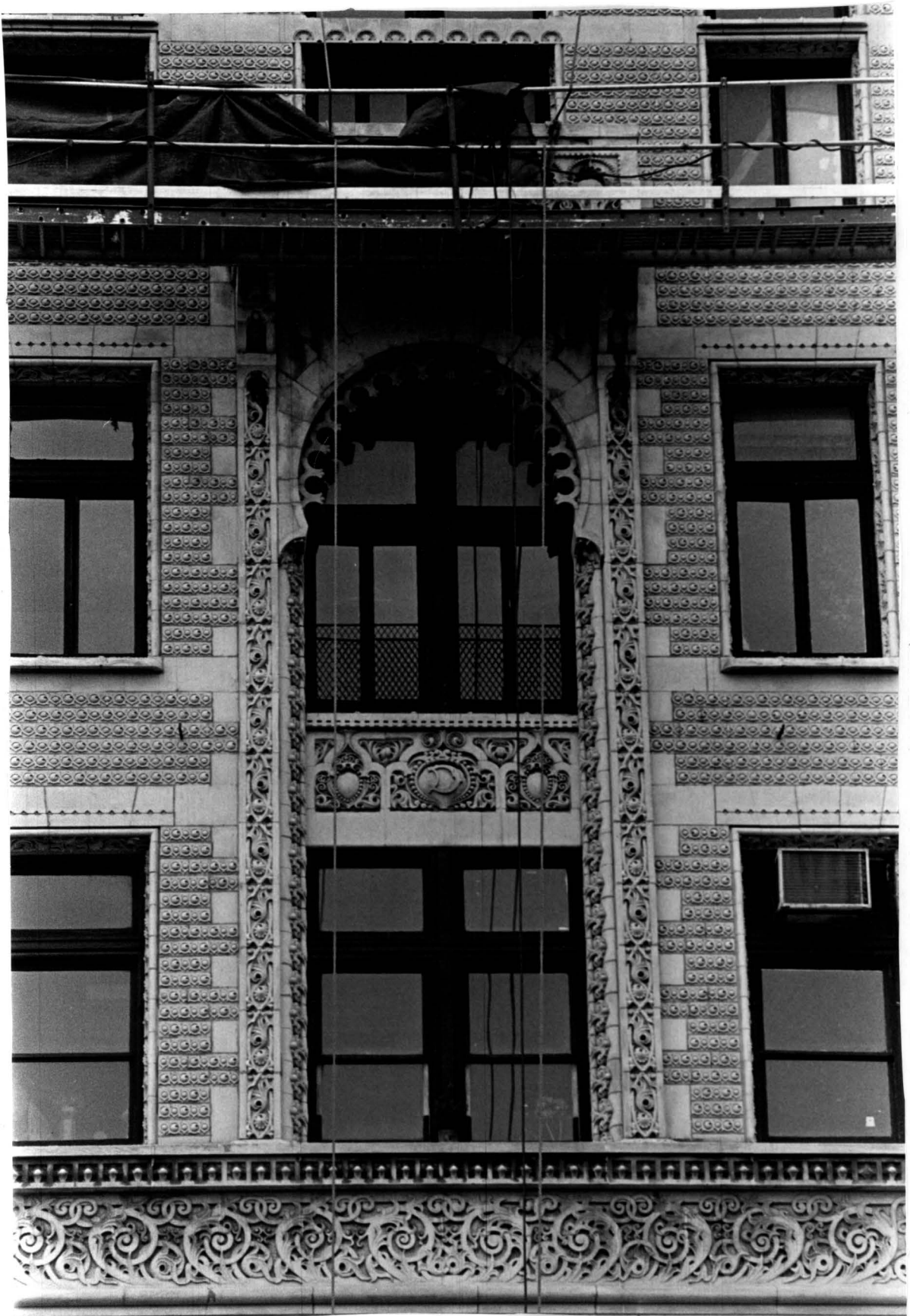
The Union Building (originally the Decker Building) Detail, fourth and fifth story alfiz