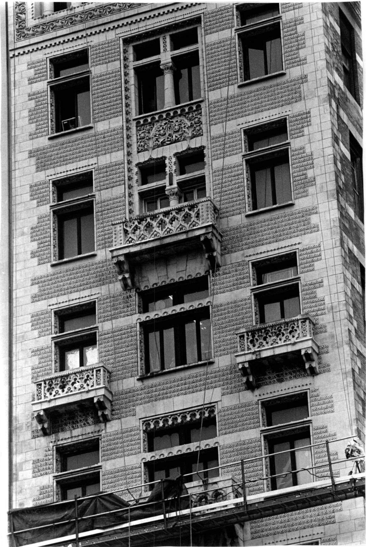
The Union Building (originally the Decker Building) Facade, sixth through ninth stories