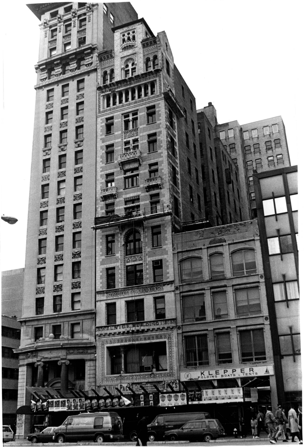
The Union Building (originally the Decker Building) 33 Union Square West

Architect: John Edelmann for Alfred Zucker