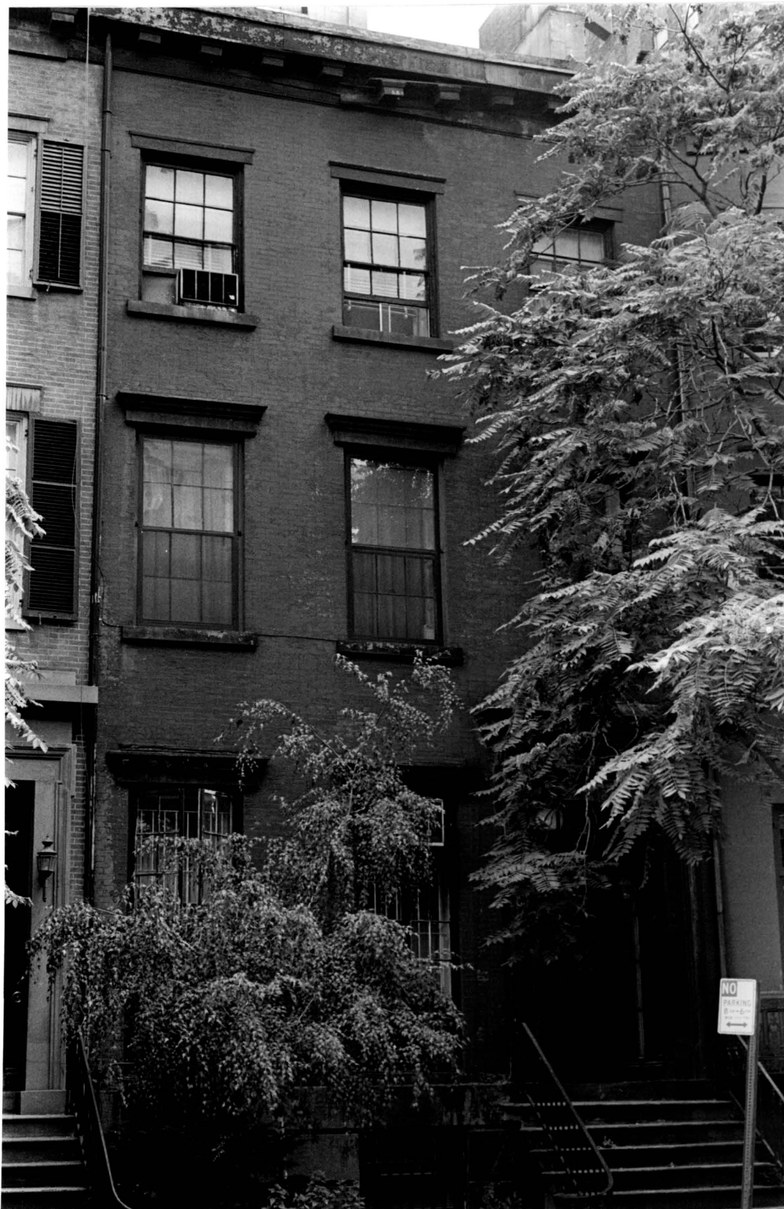
19 West 16th Street Building: 19 West 16th Street, c.1846