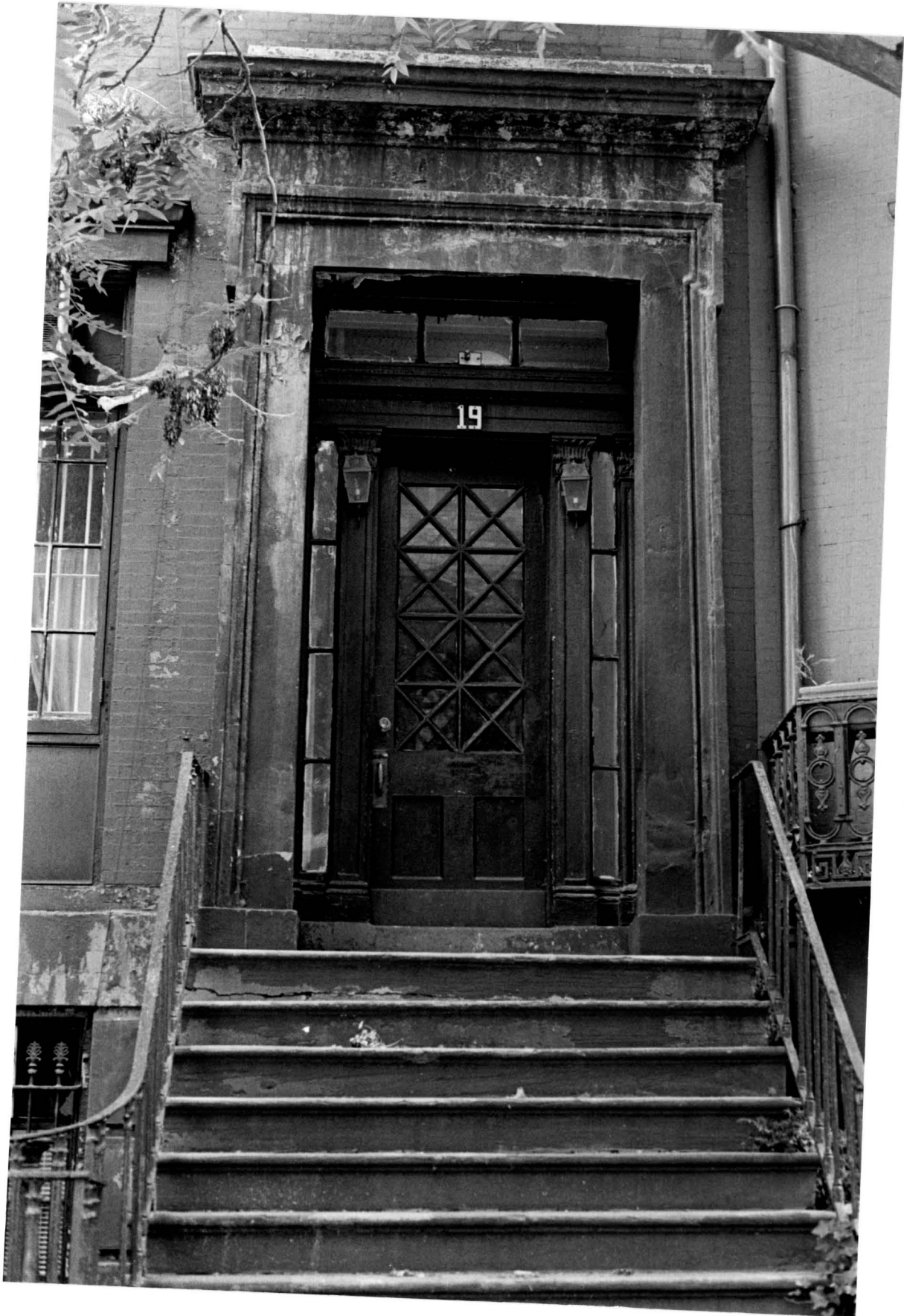
19 West 16th Street Building (entrance detail)