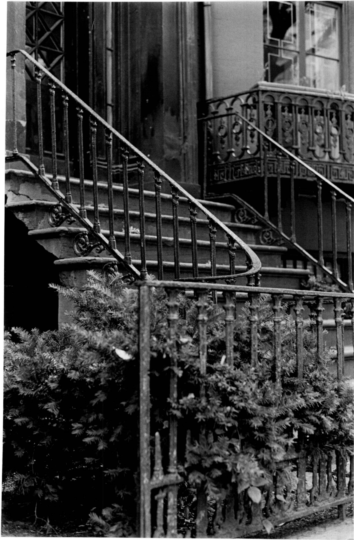
19 West 16th Street Building (ironwork detail)