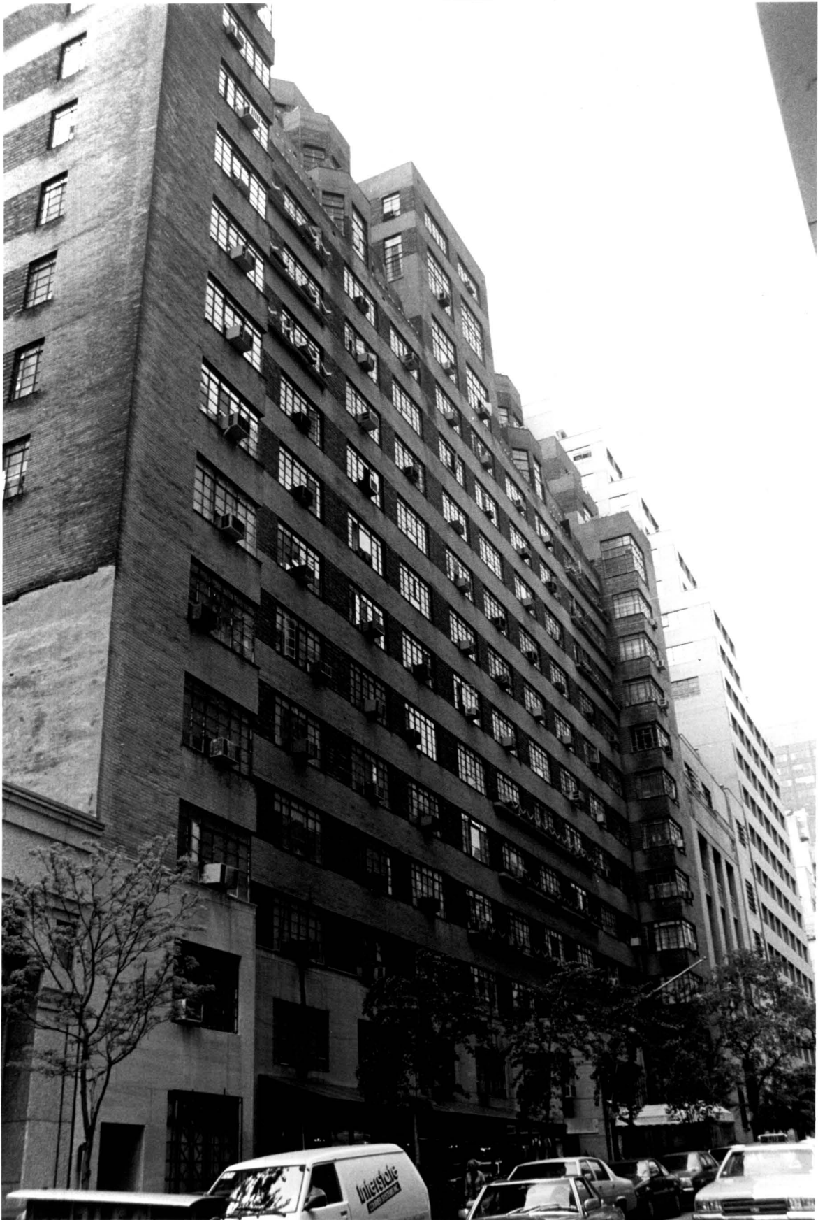
Beaux-Arts Apartments, 1929-30 310 East 44th Street