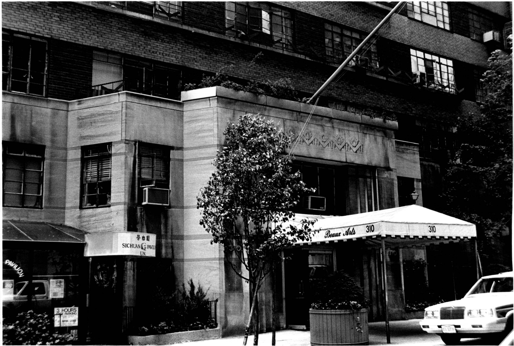
Beaux-Arts Apartments Entrance