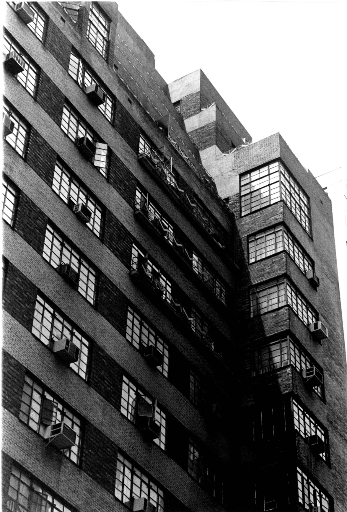
Beaux-Arts Apartments Upper stories and corner windows