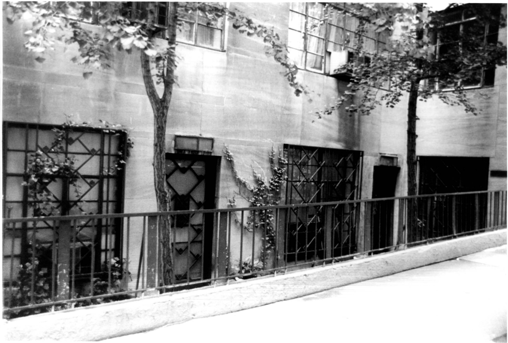
Beaux-Arts Apartments Ground story