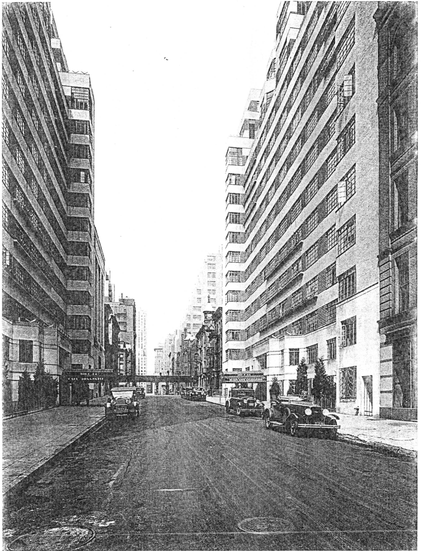
Beaux-Arts Apartments Historical Photograph