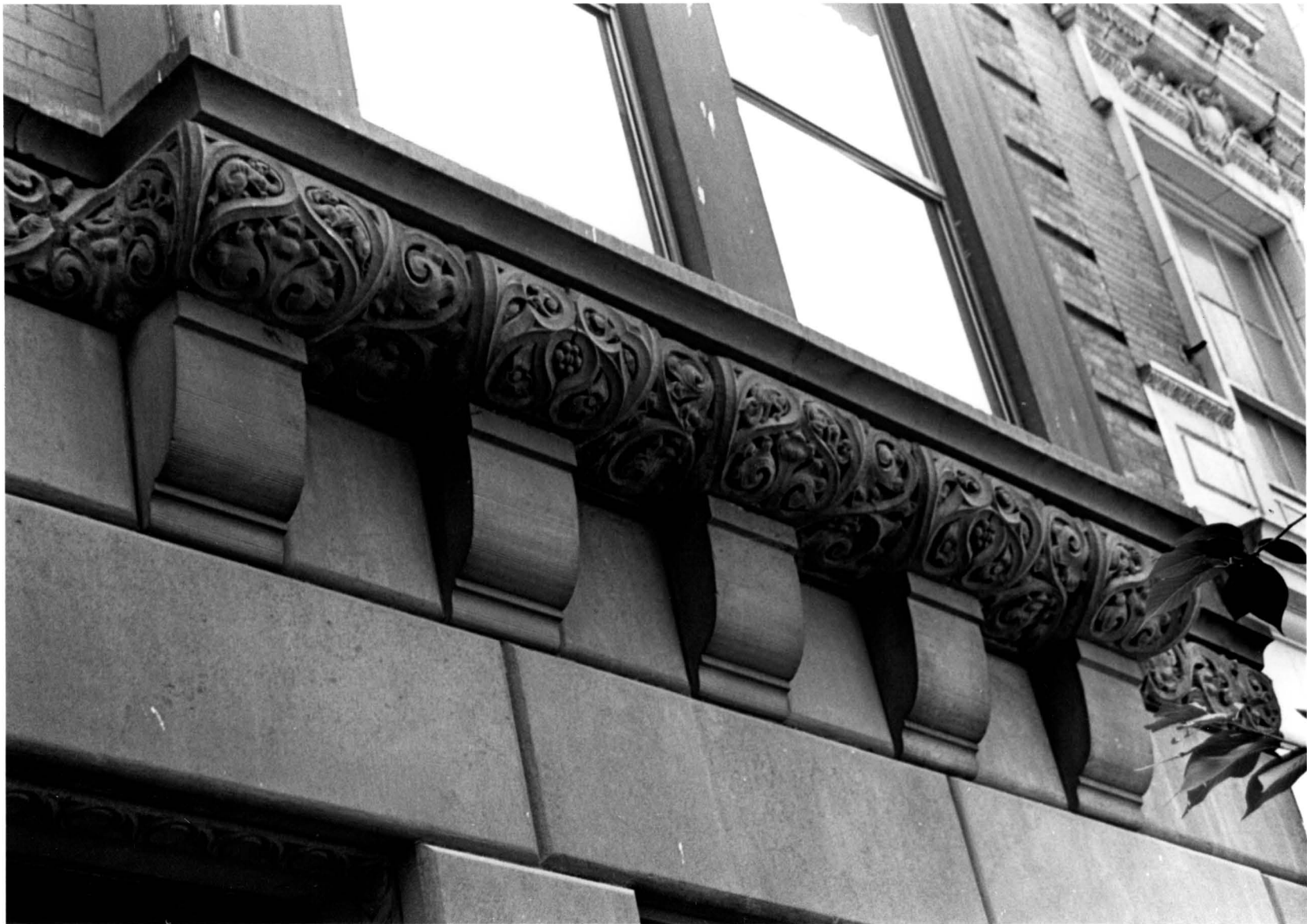
Plate 4. 326 West 85th Street. Detail, foliated course.