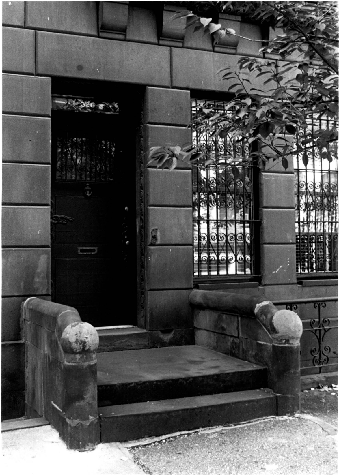
Plate 3. 326 West 85th Street. Detail, entrance.