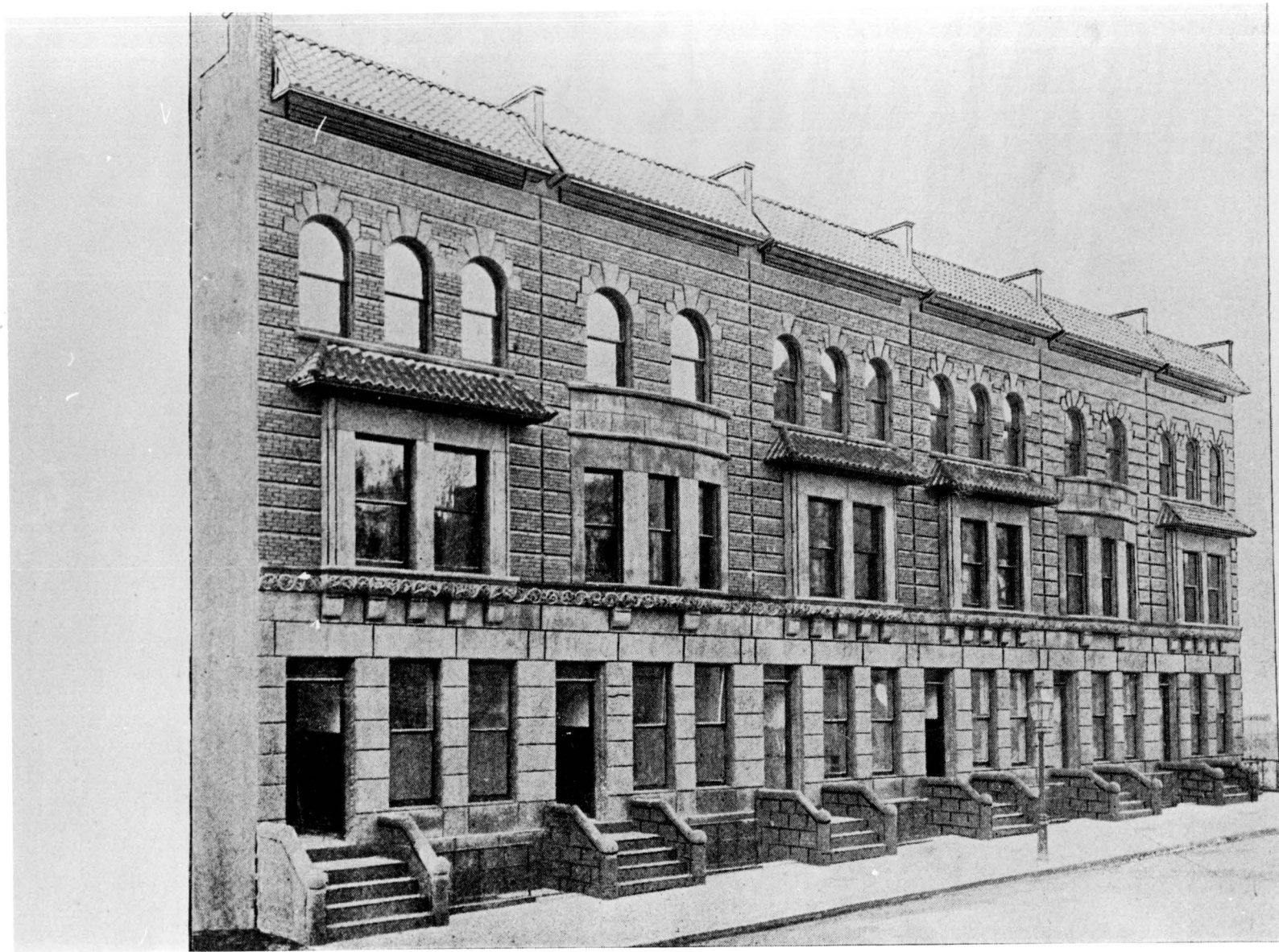
Plate 1. 316 - 326 West 85th Street. Real Estate Record & Guide (Supplement), Jan. 28, 1893.