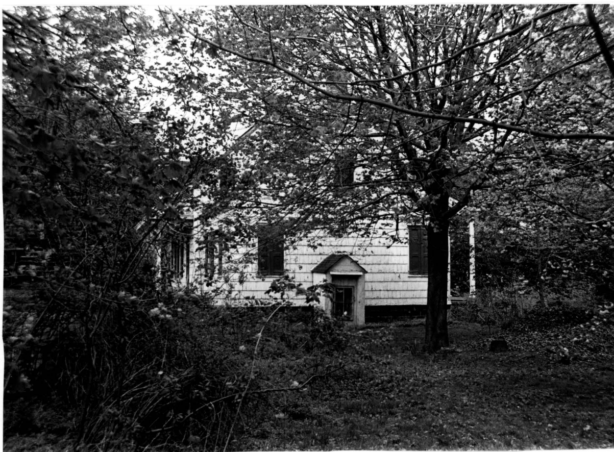
Hendrick I. Lott House west side