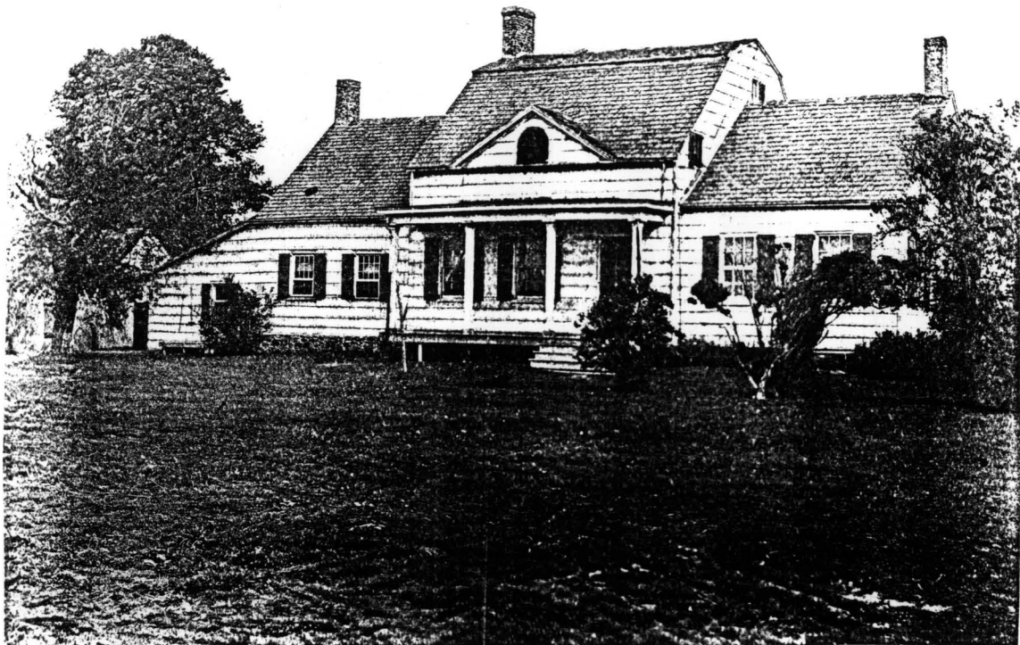
Hendrick I. Lott House north side

Graphic source: Bailey, (plate 11) photo, c. 1920