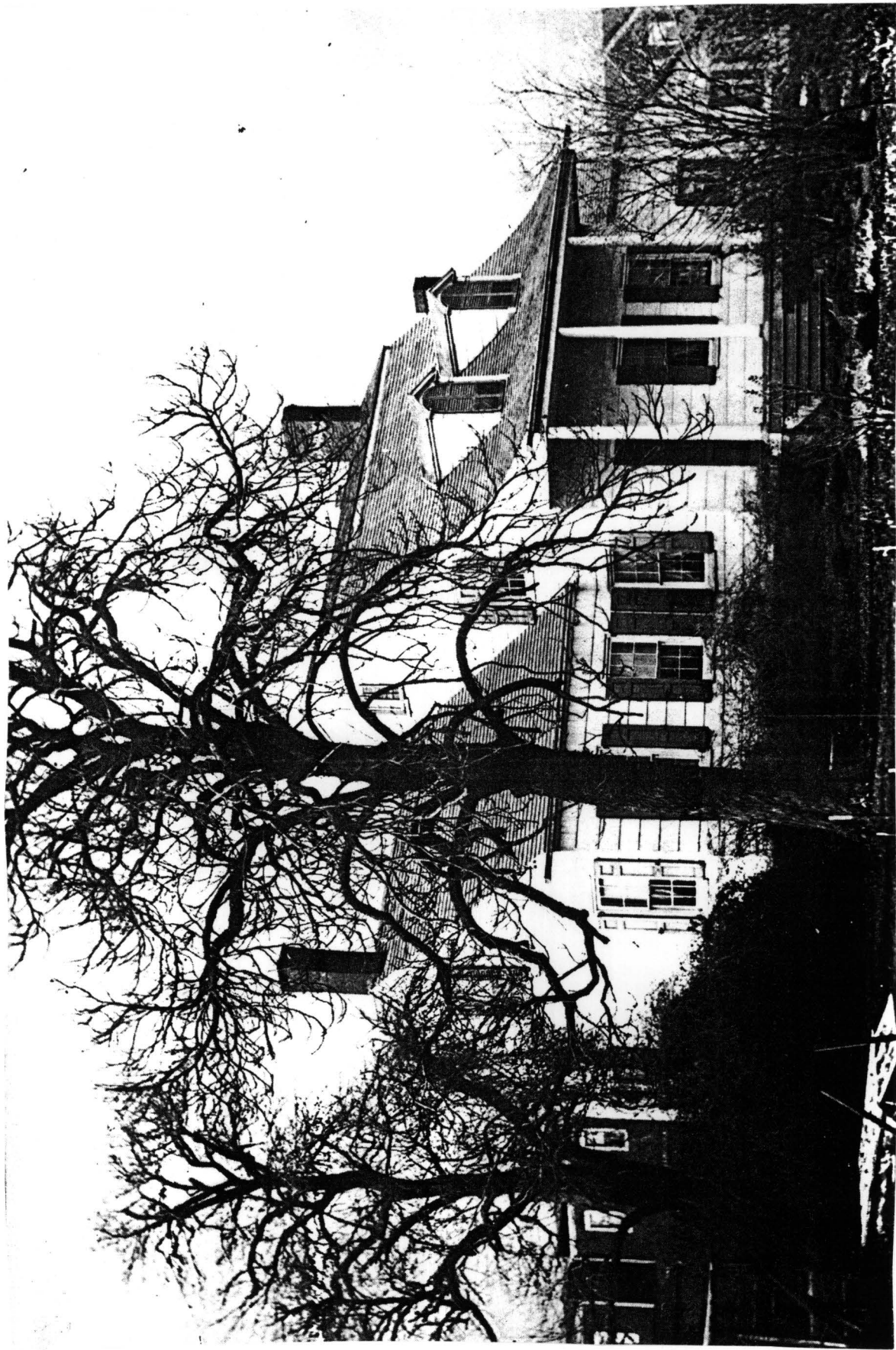
Hendrick I. Lott House south side