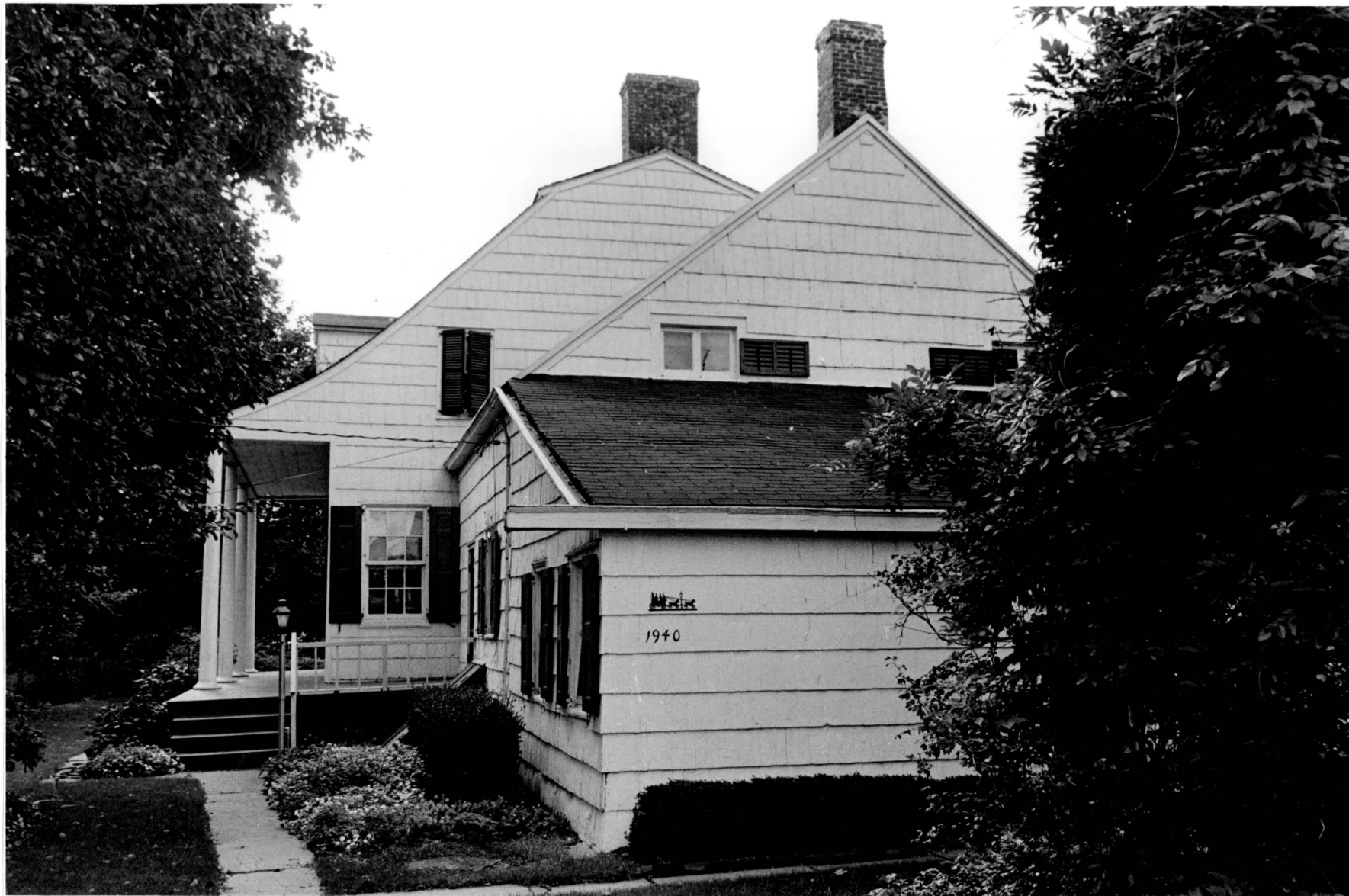
Hendrick I. Lott House 1940 East 36th Street, Brooklyn east side