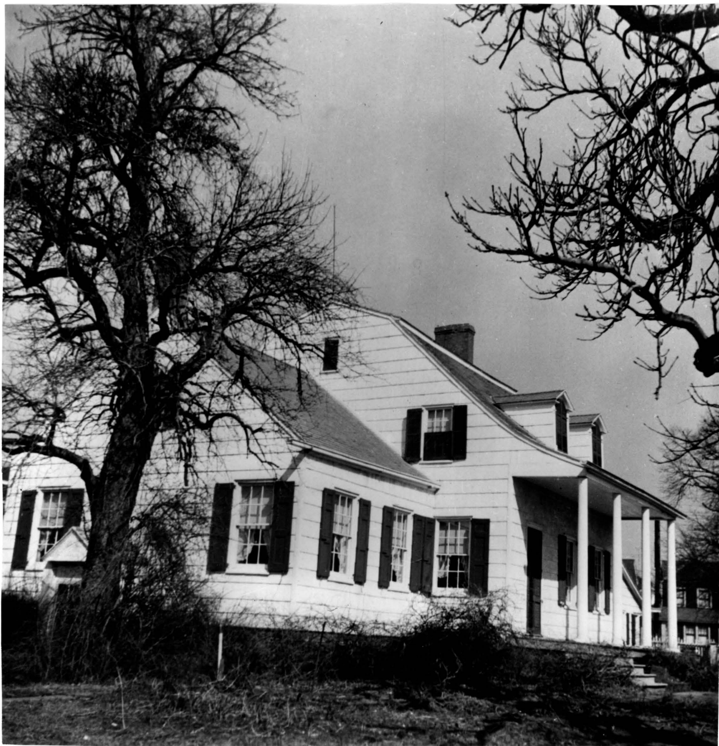
Hendrick I. Lott House view from the southwest