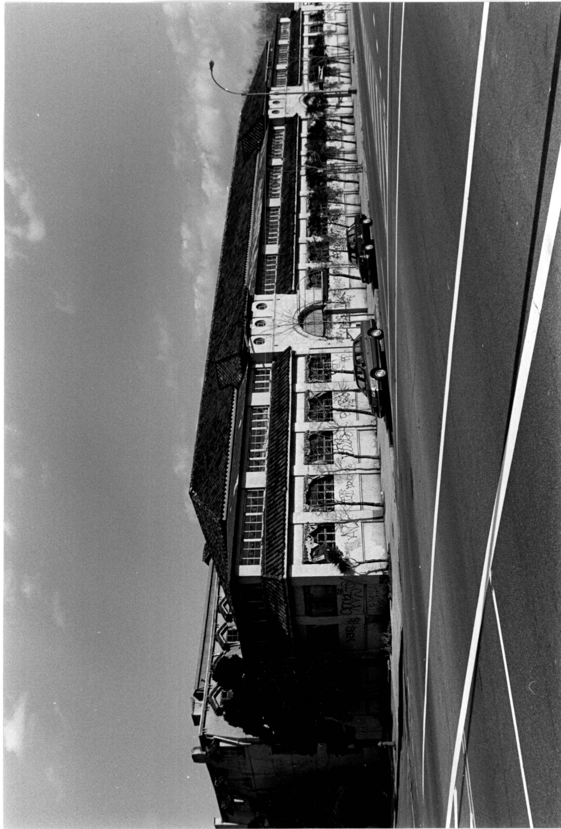
F.W.I.L. LUNDY BROTHERS RESTAURANT BUILDING 1901-1929 Emmons Avenue, Brooklyn