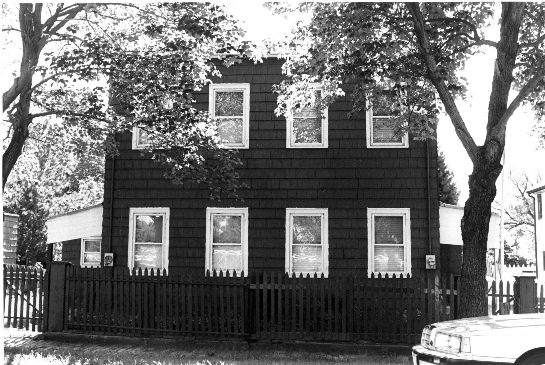
Kreischerville Workers' Houses, 71-73 Kreischer Street, Charleston, Staten Island.