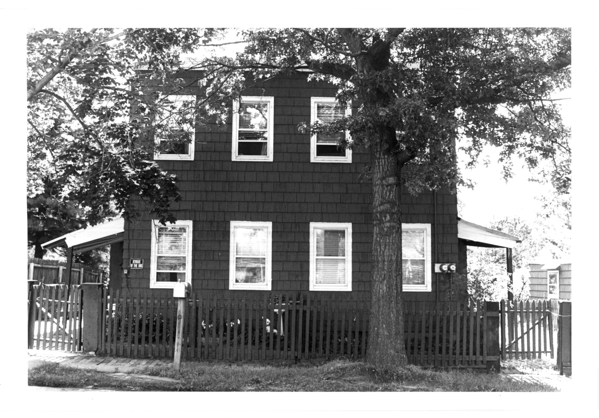
Kreischerville Workers' Houses, 75-77 Kreischer Street, Charleston, Staten Island.