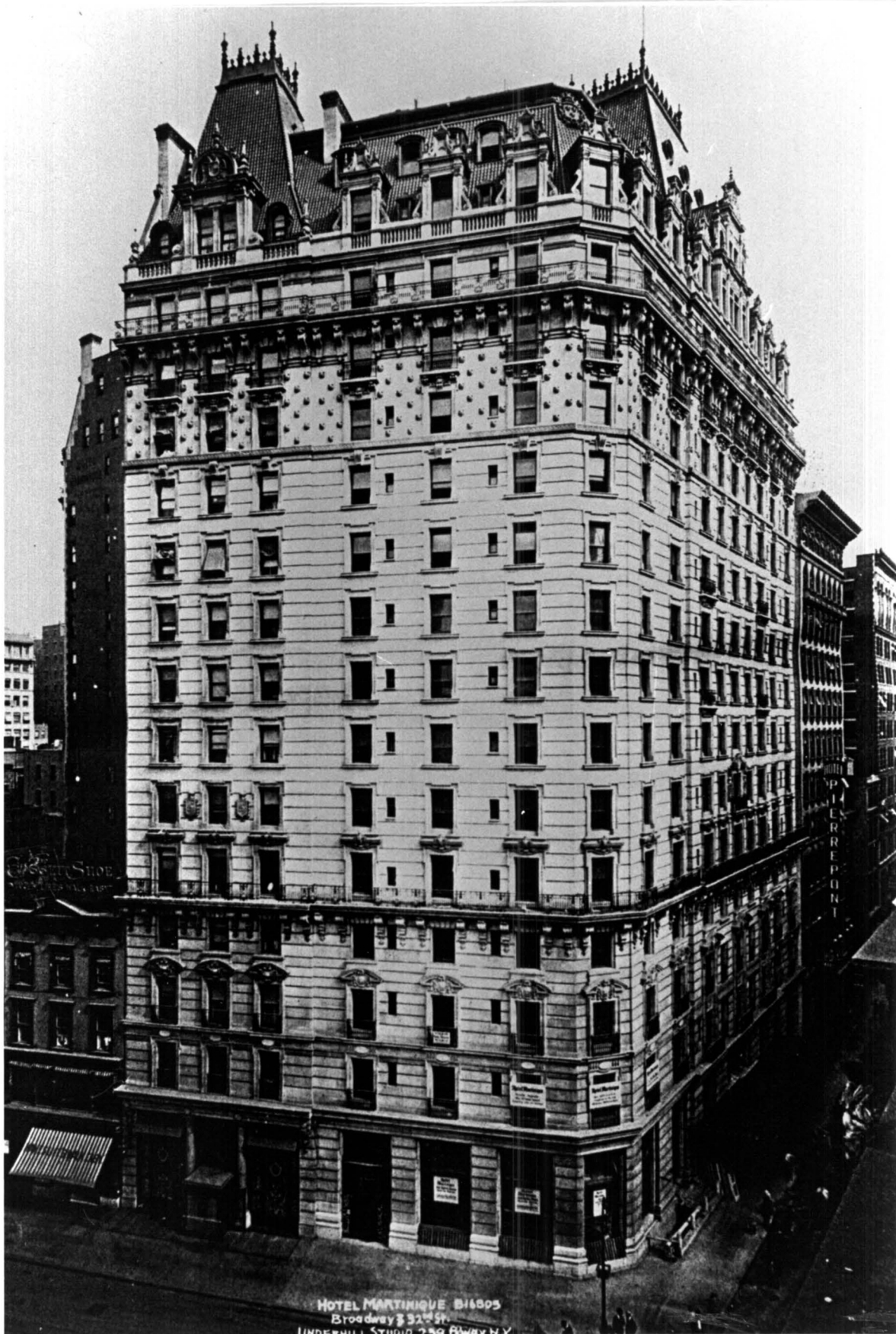
Hotel Martinique, Broadway, 1897