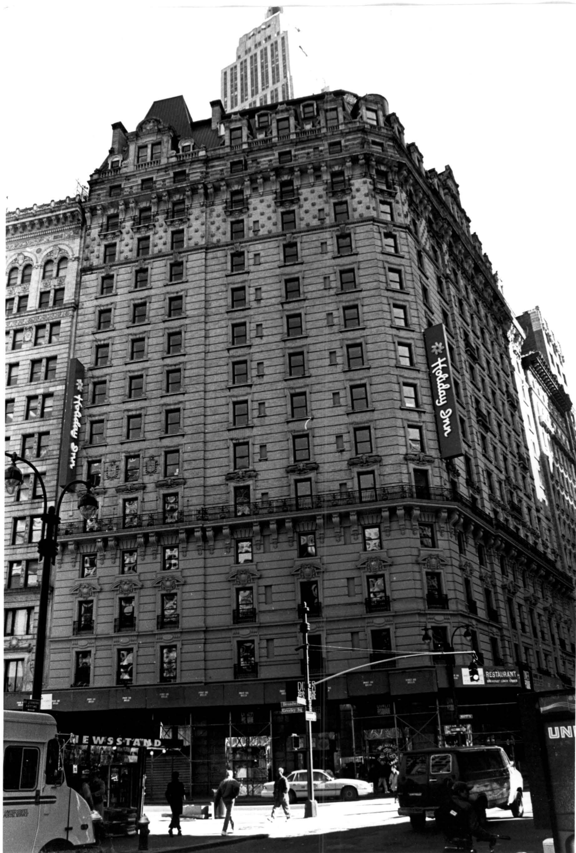
Hotel Martinique, 1260 Broadway, Manhattan Broadway Facade