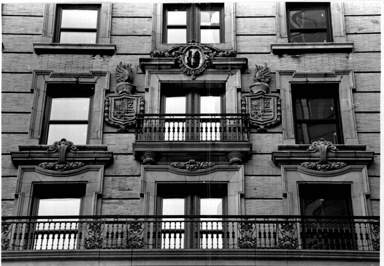
Hotel Martinique Details of West 32nd Street Facade