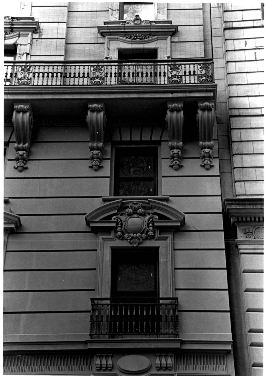
Hotel Martiniue West 33rd Street Facade Details