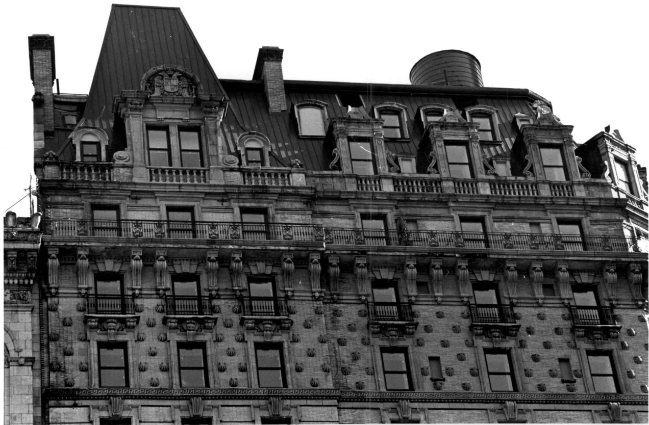
Hotel Martinique, Roof Detail, Broadway Facade