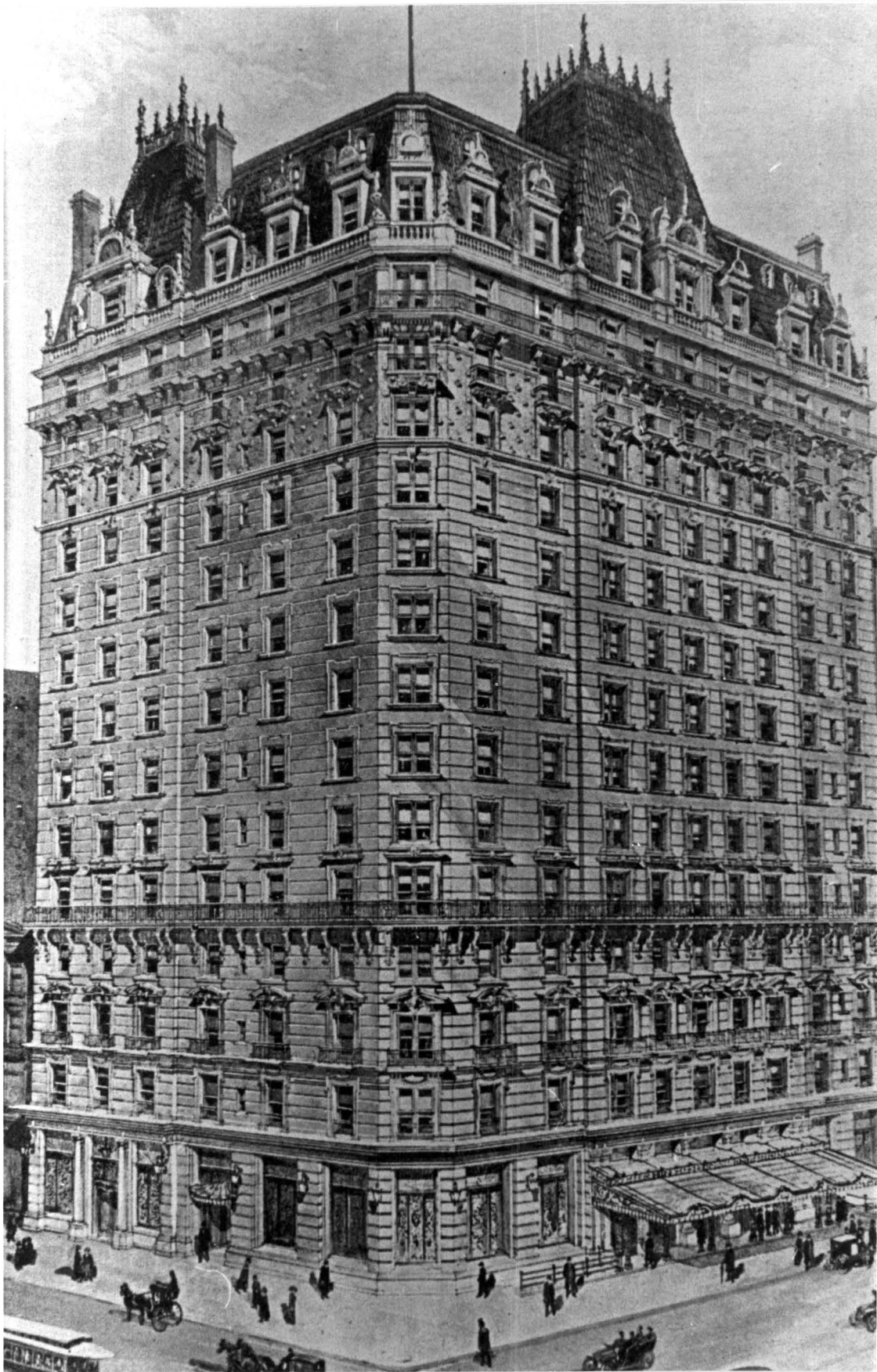
Hotel Martinique, 1908-09