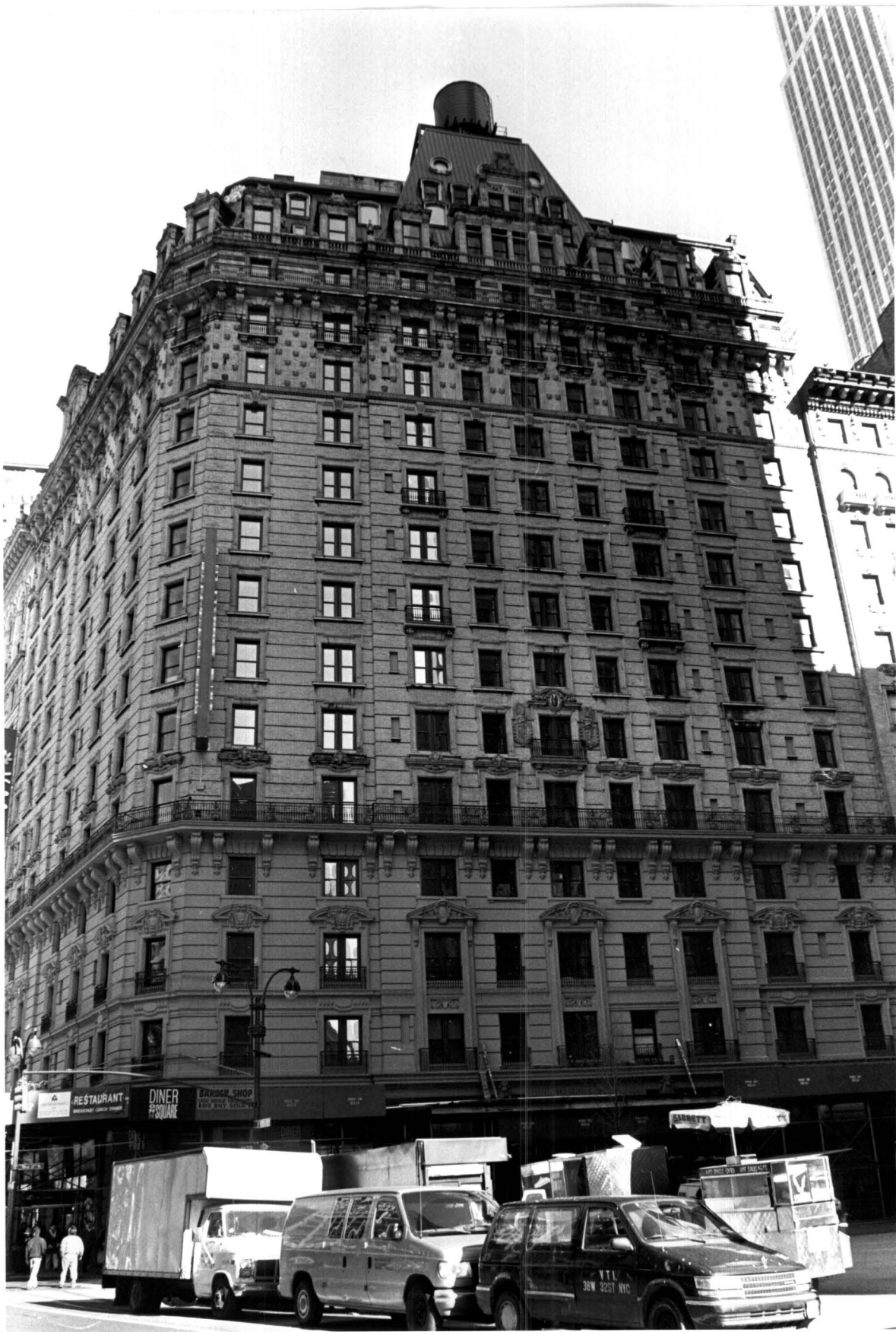
Hotel Martinique, 1260 Broadway, Borough of Manhattan West 32nd Street Facade