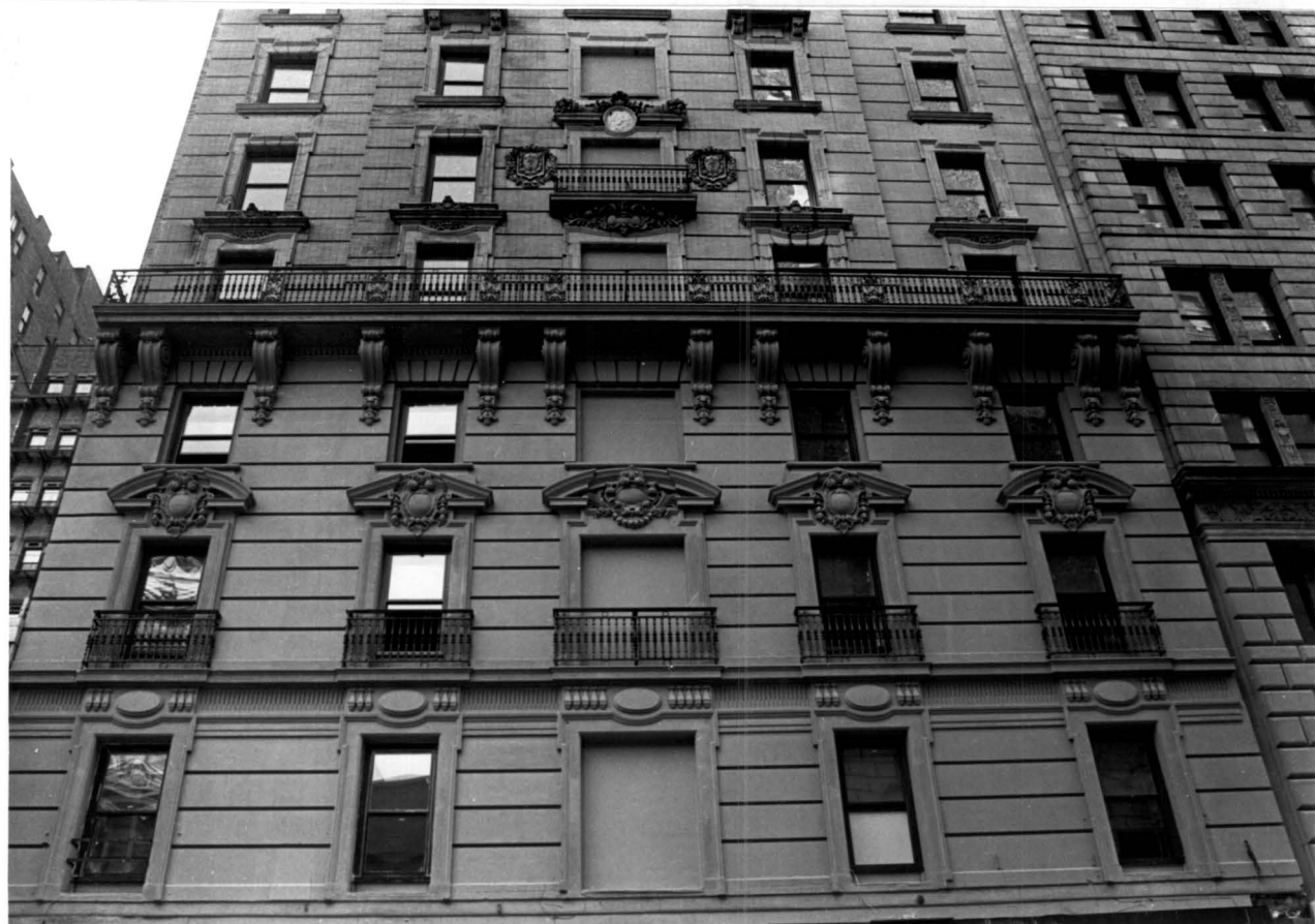
Hotel Martinique, West 33rd Street Facade Detail