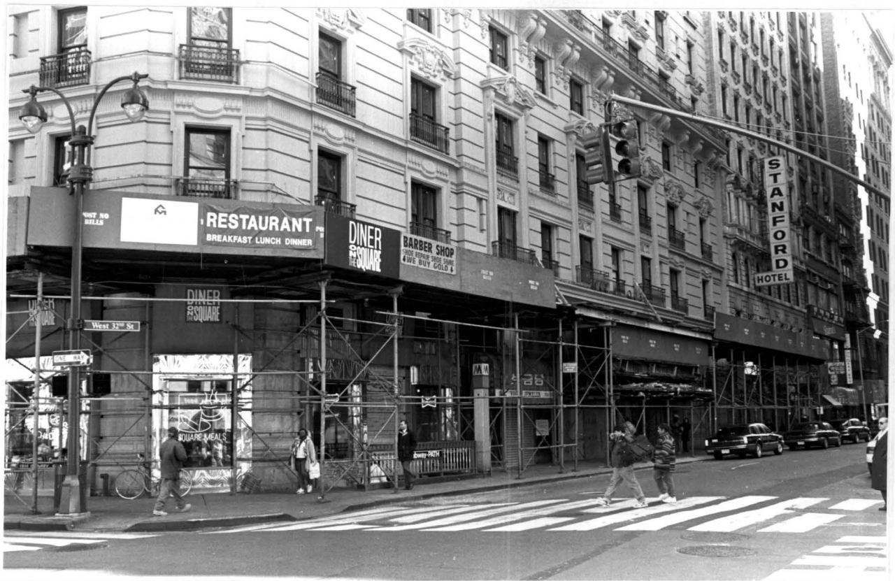
Hotel Martiniue Ground story and roof details, West 32nd Street Facade