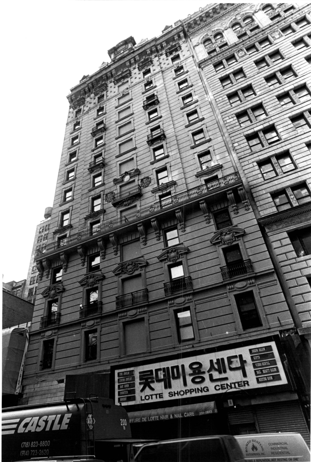
Hotel Martinique, 1260 Broadway, Manhattan West 33rd Street Facade