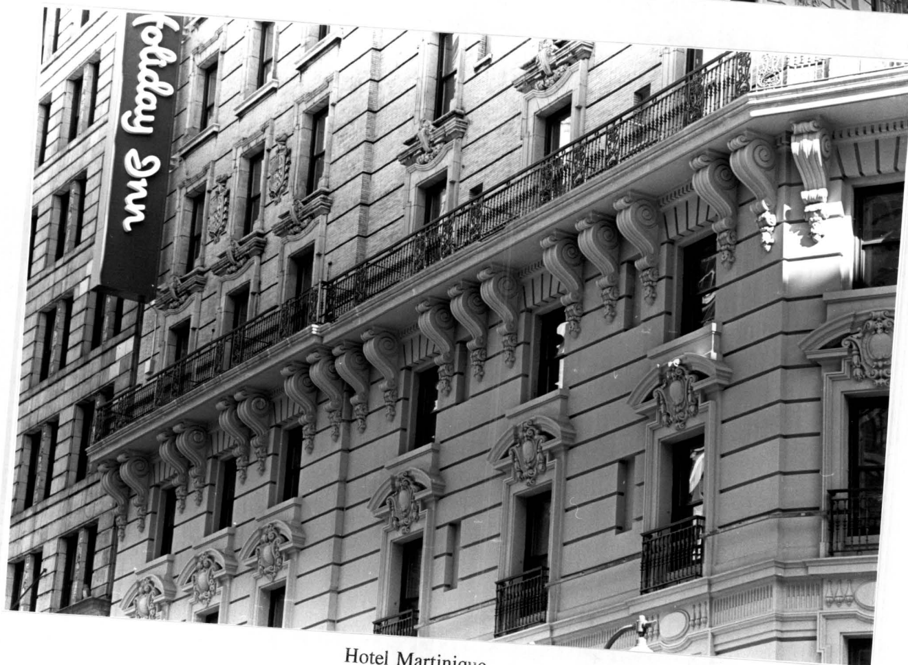
Hotel Martinique Broadway Facade Details