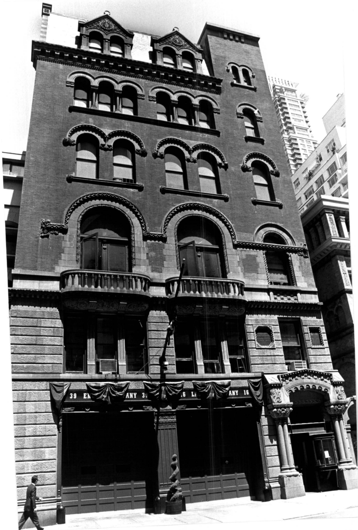
Fire Engine Company 39 and Ladder Company 16 Station House, Manhattan 157-59 East 67th Street