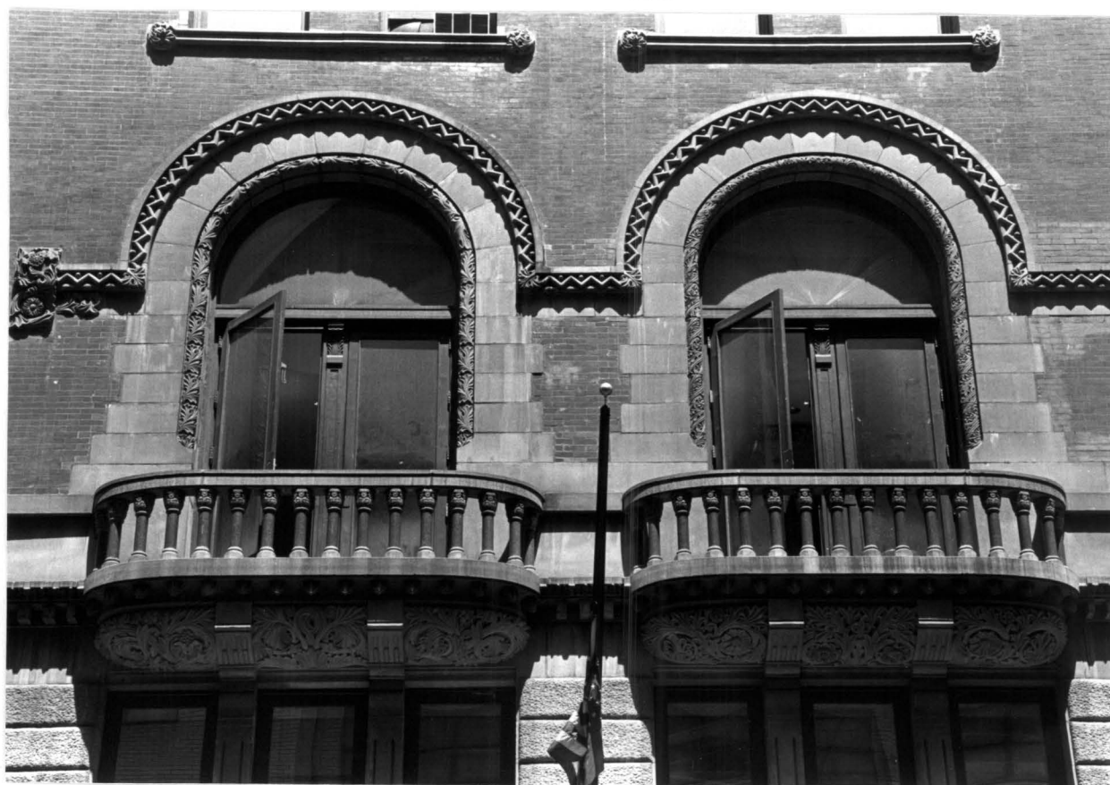
Fire Engine Company 39 and Ladder Company 16 Station House Third floor window and balconies