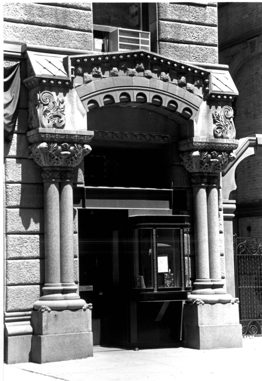
Fire Engine Co. 39 and Ladder Co. 16 Station House Entrance portico