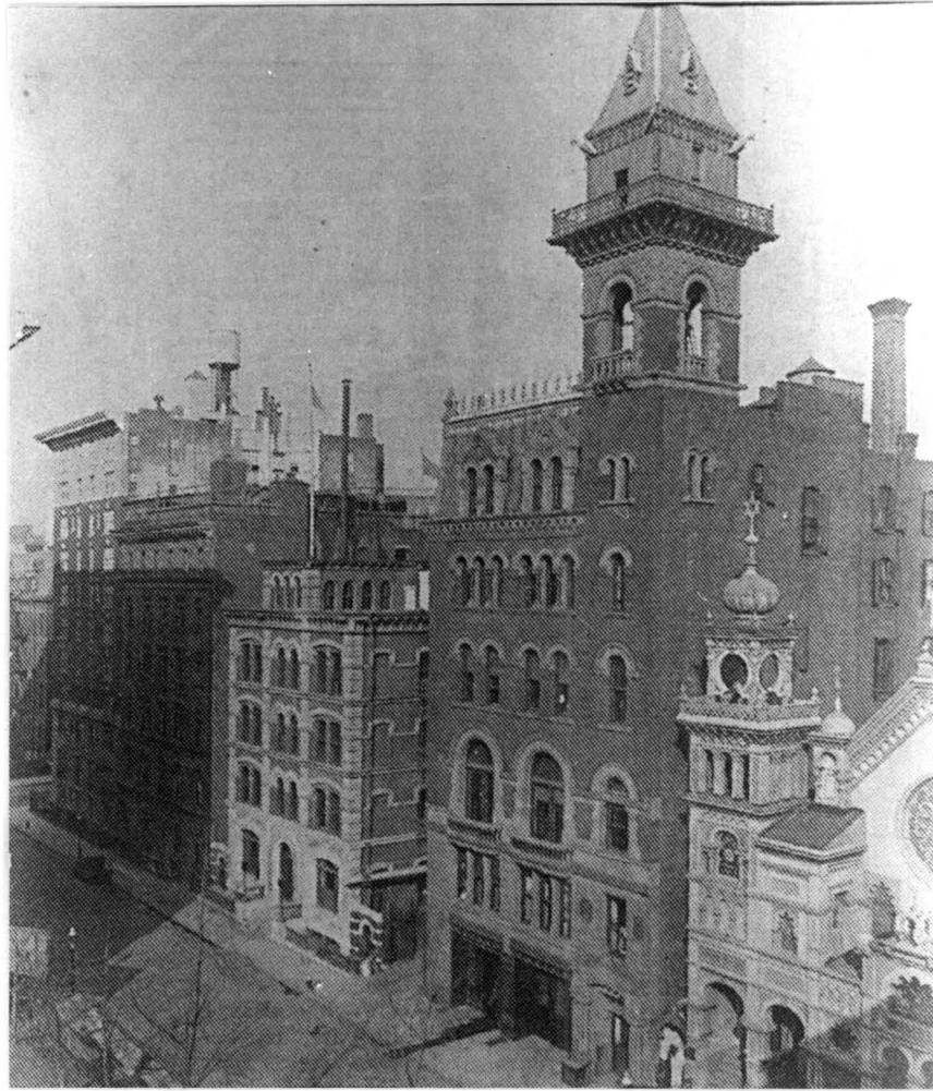
East 67th Street, between Third and Lexington Avenues, looking west, circa 1920