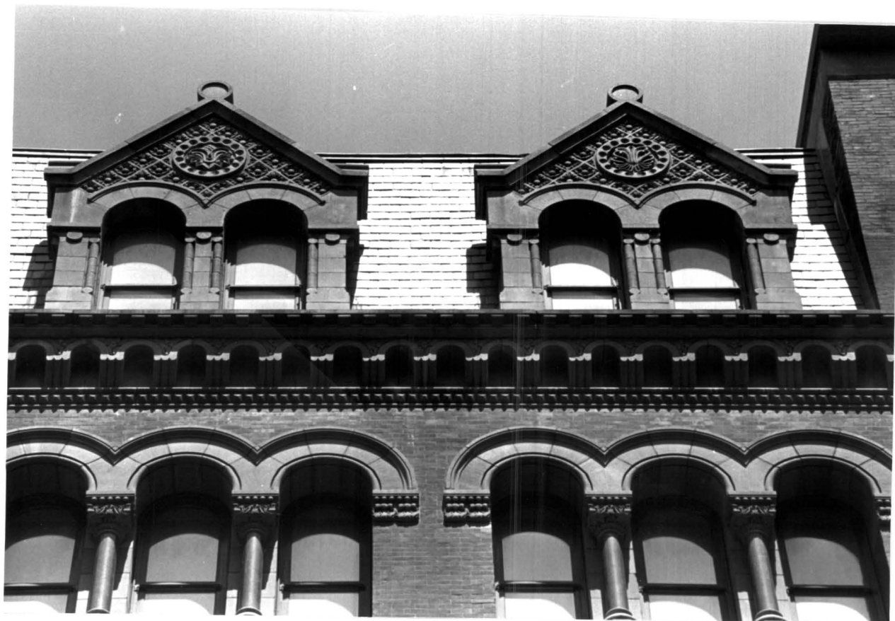
Fire Engine Company 39 and Ladder Company 16 Station House Fifth and sixth floors