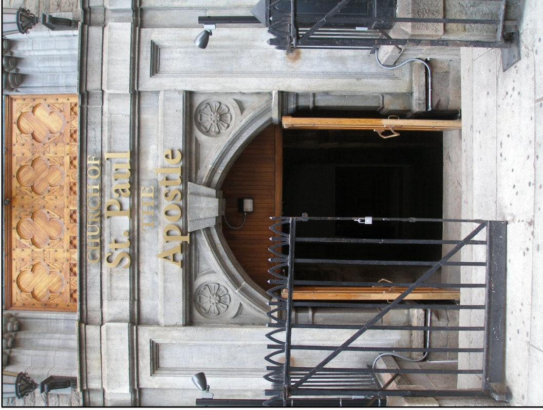
Church of St. Paul the Apostle Columbus Avenue facade Main (center) entrance, entrance to lower level