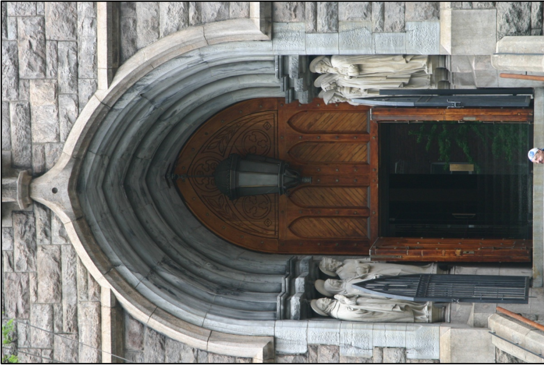
Church of St. Paul the Apostle Columbus Avenue facade Left: south entrance Right: north entrance Photos: Carl Forster, 2007