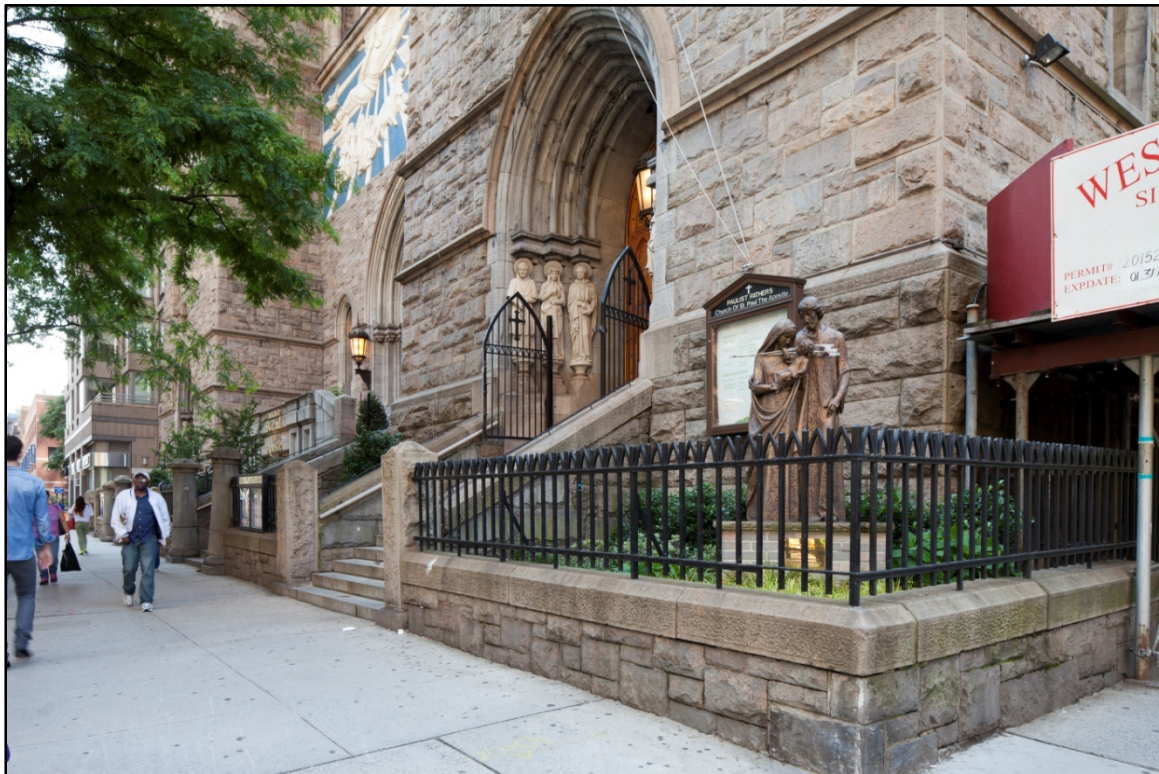
Church of St. Paul the Apostle Columbus Avenue facade Upper: south/center entrance Lower: north entrance, corner of 60 th Street