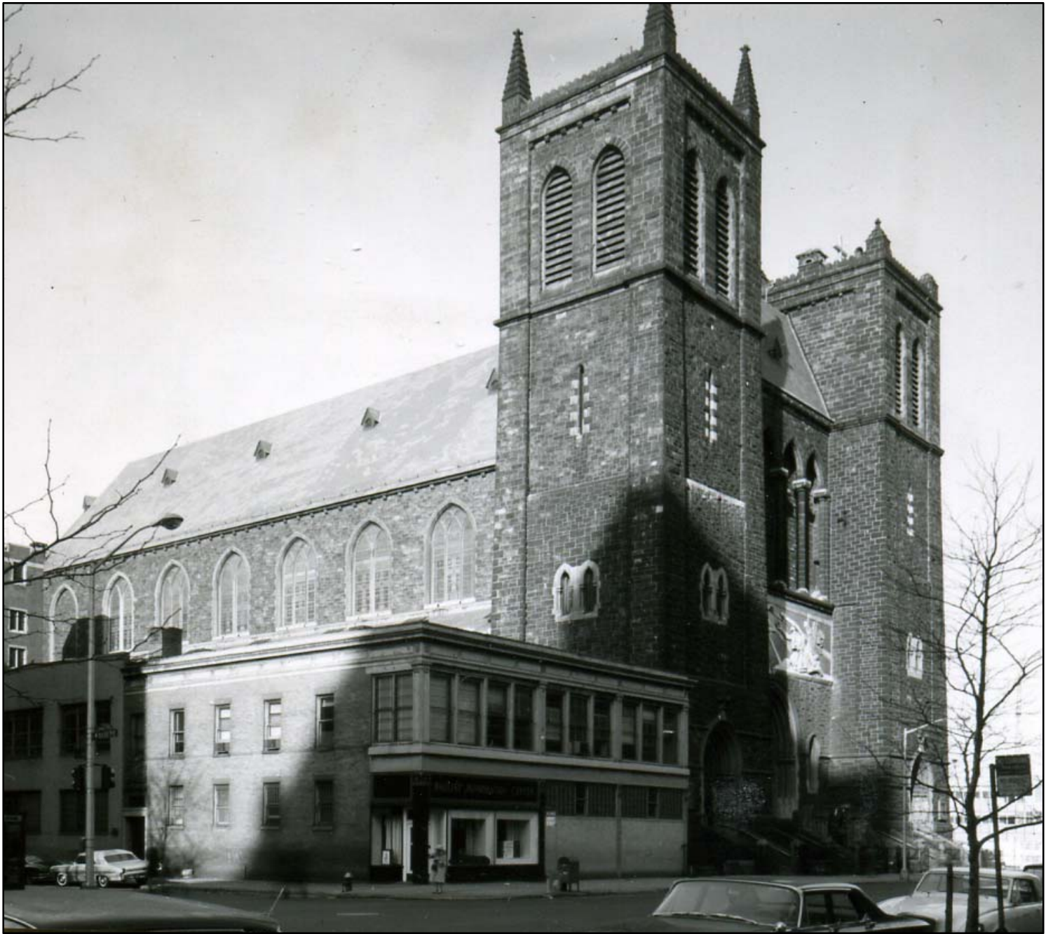
Church of St. Paul the Apostle View from Columbus Avenue and 59 th Street Photo: Landmarks Preservation Commission, c. 1966