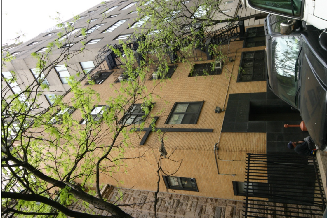
Church of St. Paul the Apostle Left: south facade, from 59 th Street Right: 120 West 60 th Street