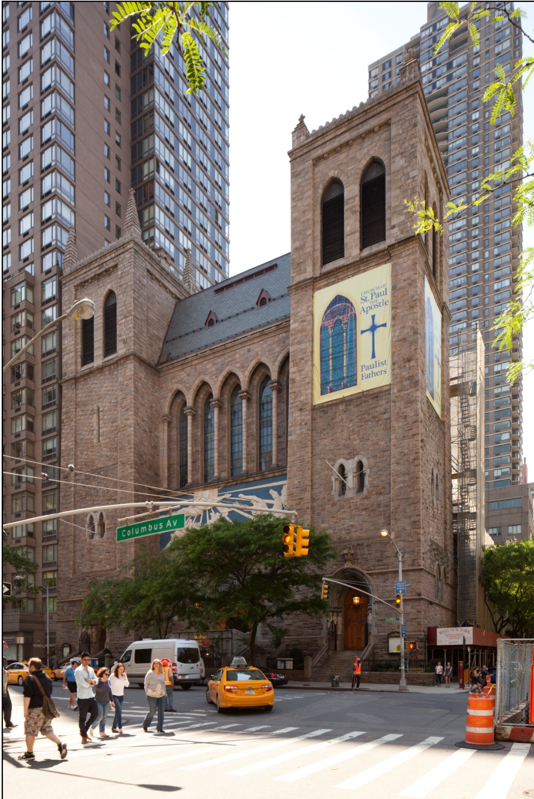
Church of St. Paul the Apostle 8 Columbus Avenue (aka 8-10 Columbus Avenue, 120 West 60 th Street) Borough of Manhattan Block 1131, Lot 31 Columbus Avenue (east) facade