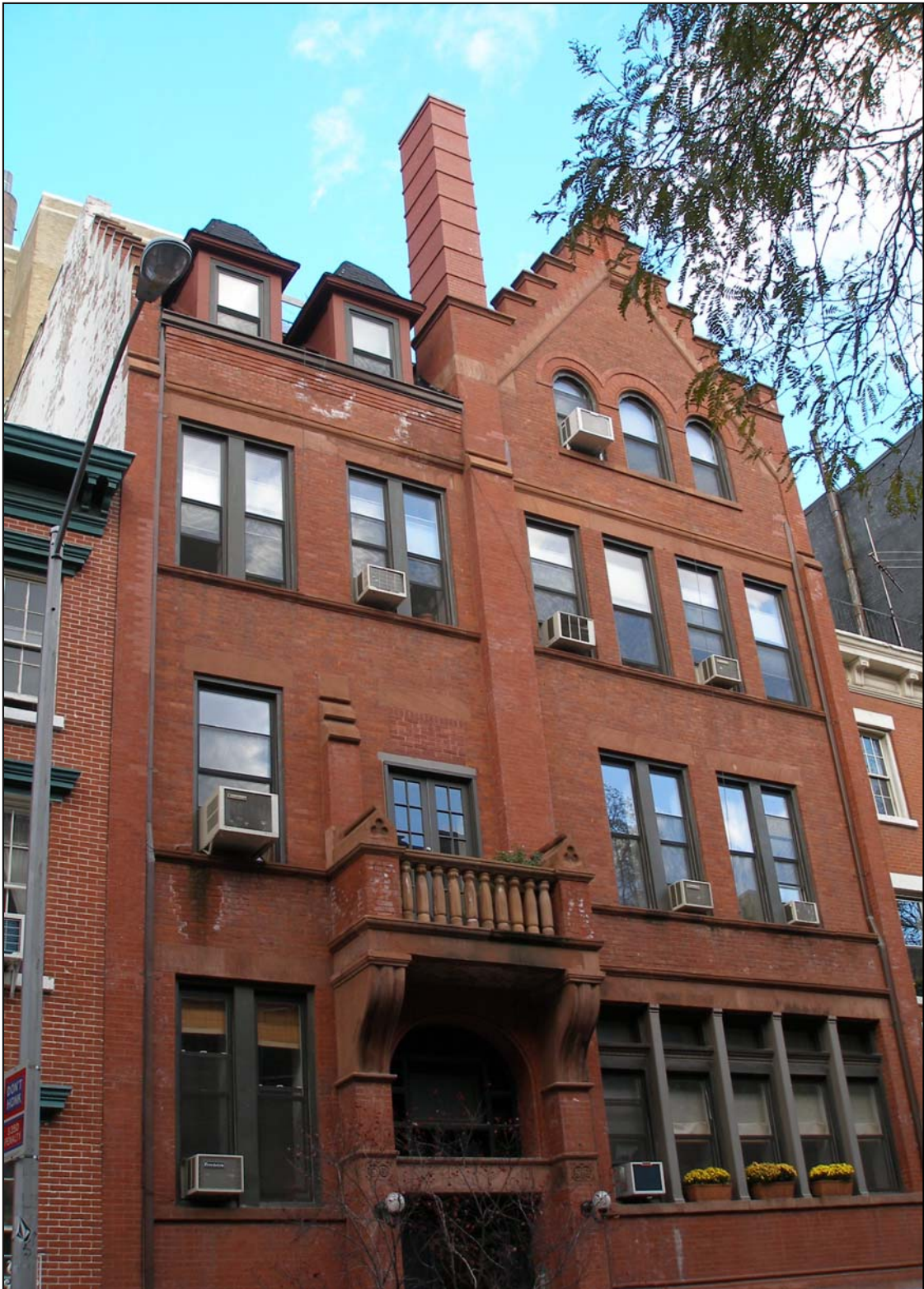
Children's Aid Society, Elizabeth Home for Girls 307 East 12 th Street Manhattan