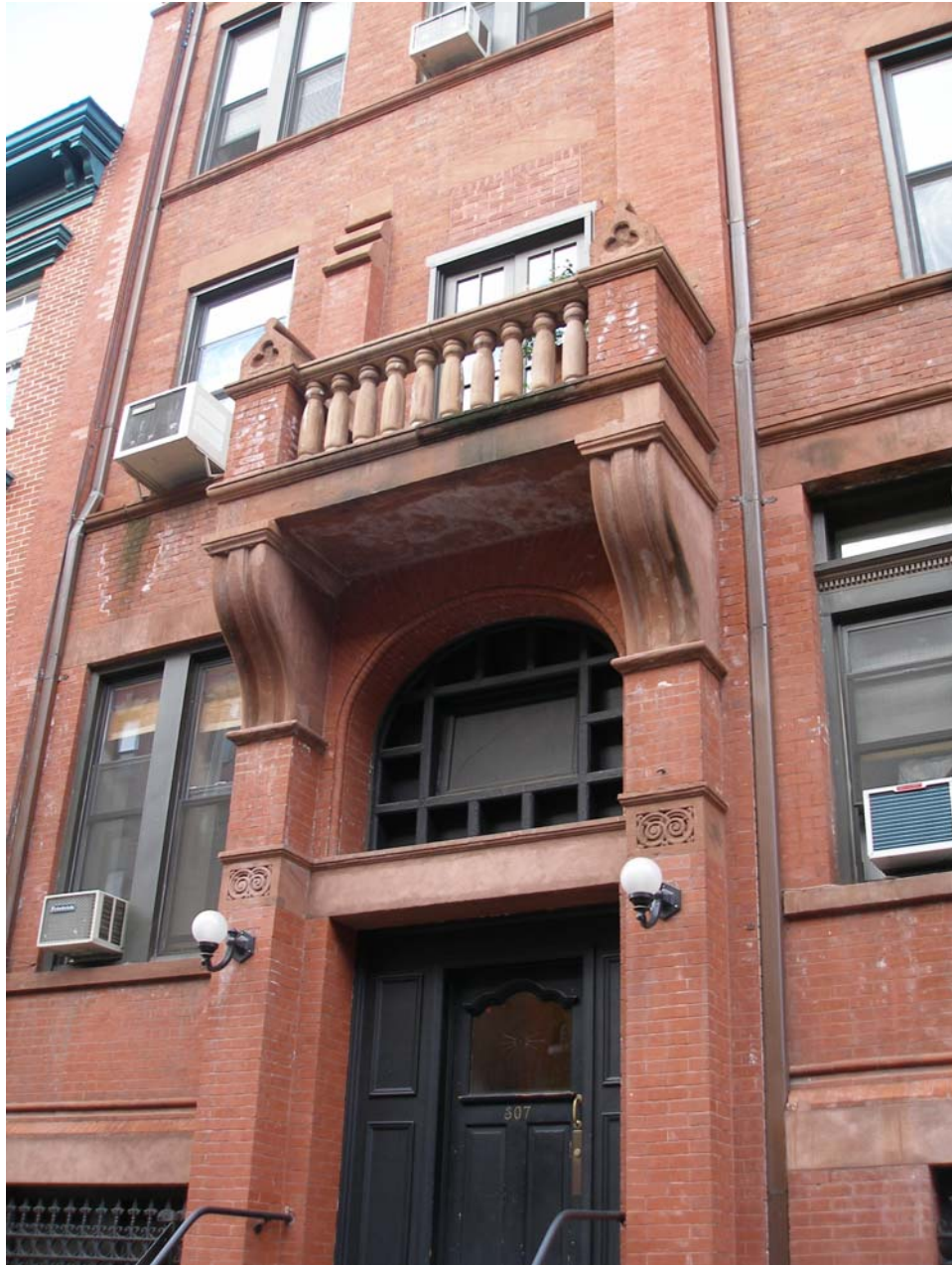
Children's Aid Society, Elizabeth Home for Girls Entrance detail