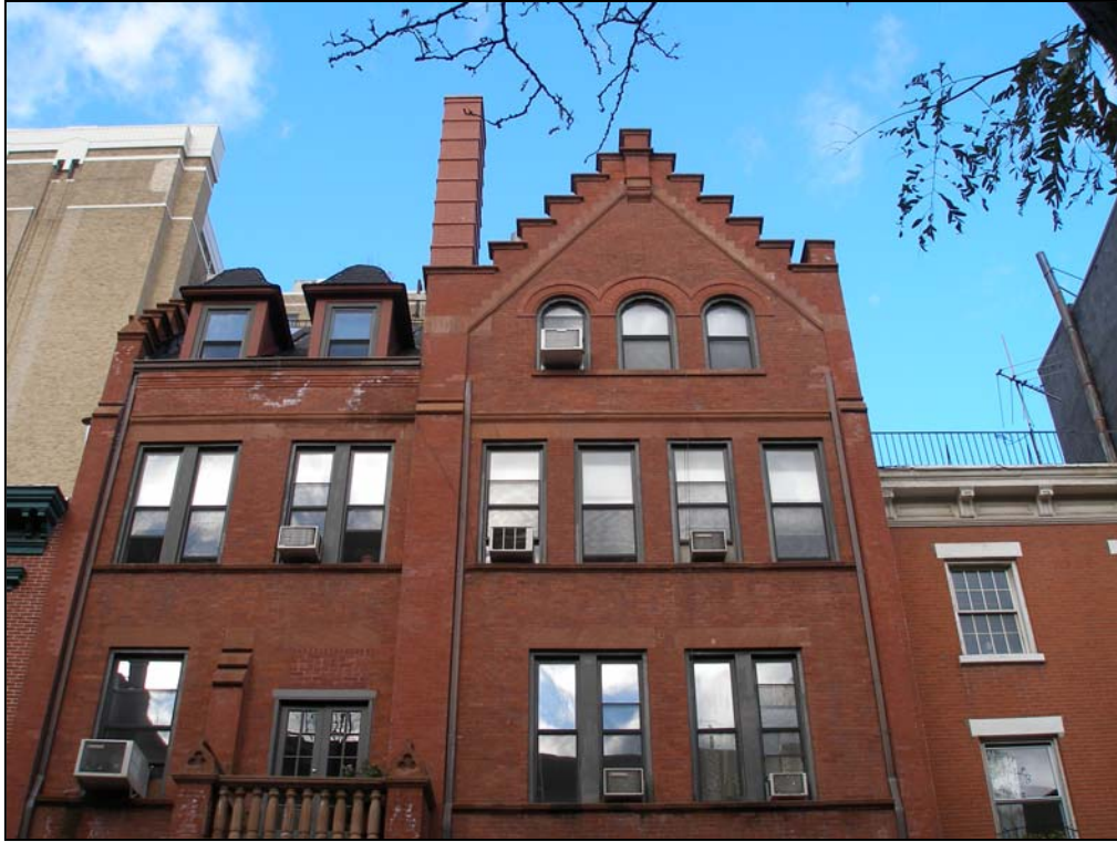
Children's Aid Society, Elizabeth Home for Girls 307 East 12 th Street, Manhattan