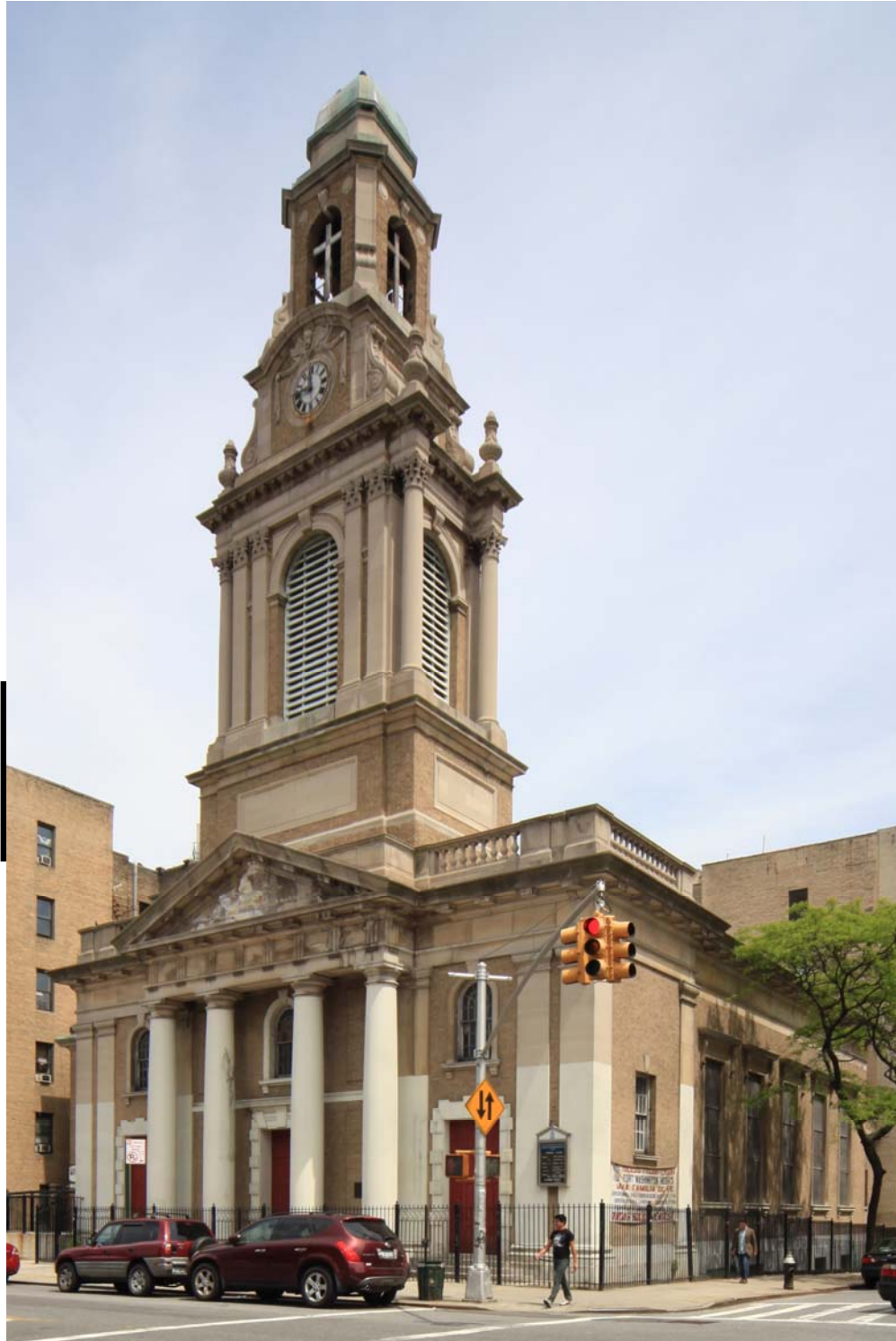
Fort Washington Presbyterian Church 21 Wadsworth Avenue (aka 21-27 Wadsworth Avenue, 617-619 West 174 th Street), Manhattan