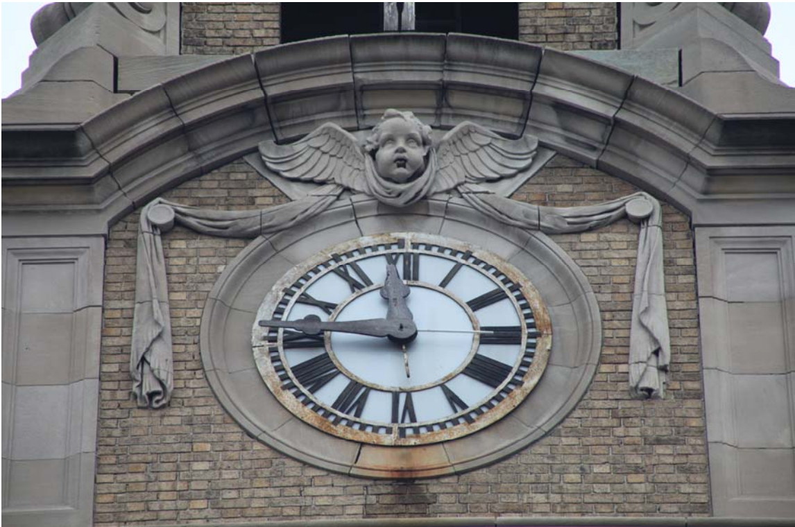
Fort Washington Presbyterian Church Tower details