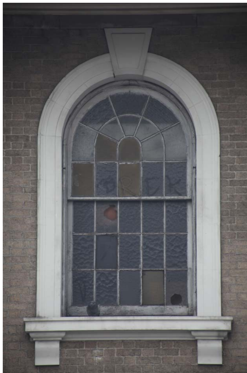
Fort Washington Presbyterian Church Window details Photos: Christopher D. Brazee, 2009