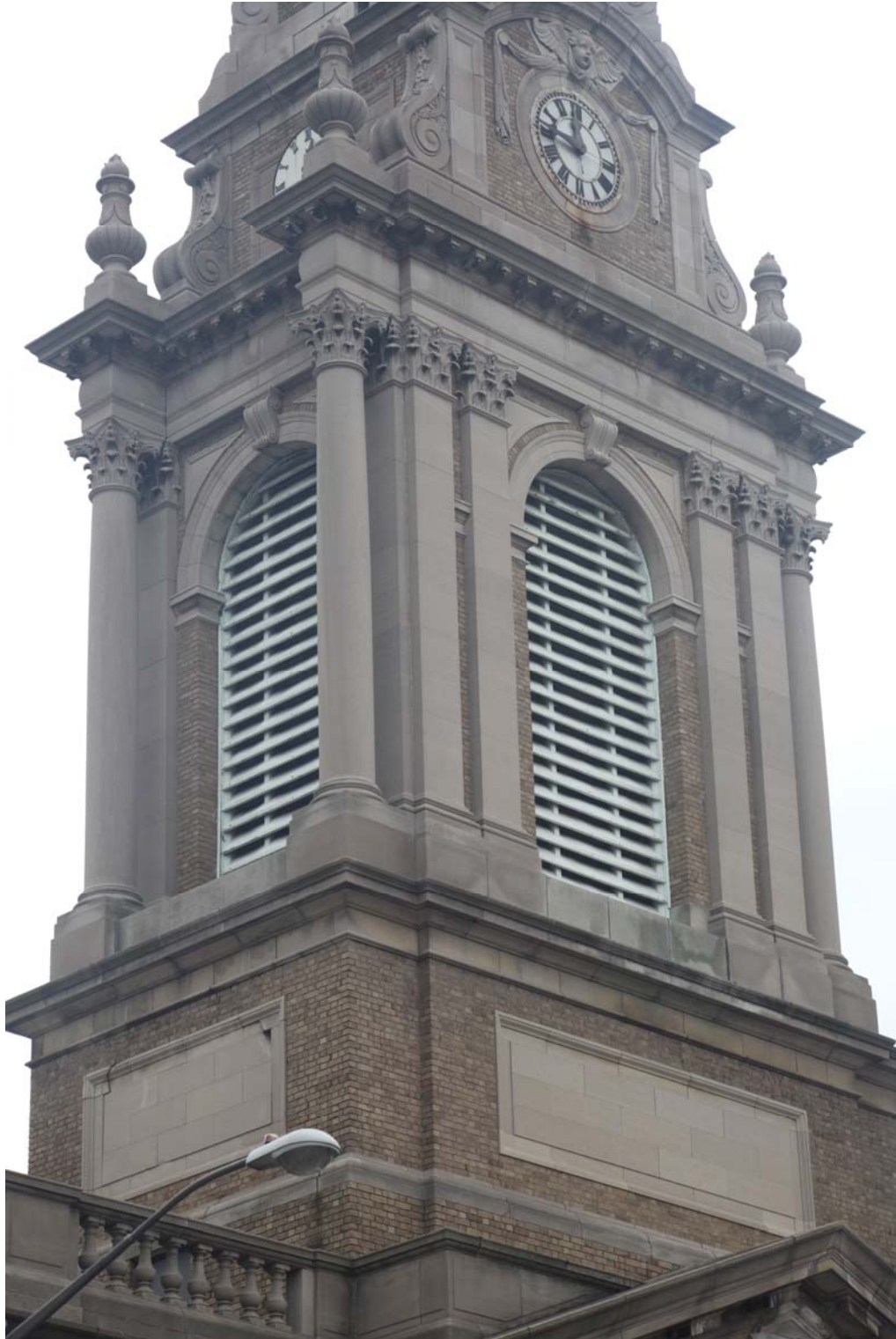
Fort Washington Presbyterian Church Tower