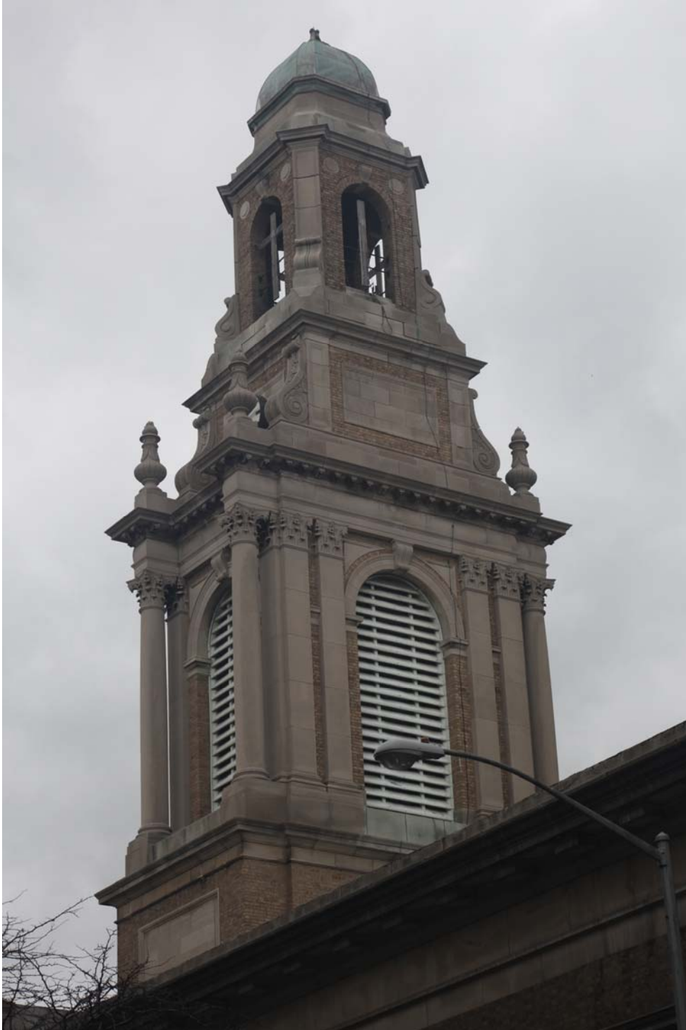
Fort Washington Presbyterian Church Tower