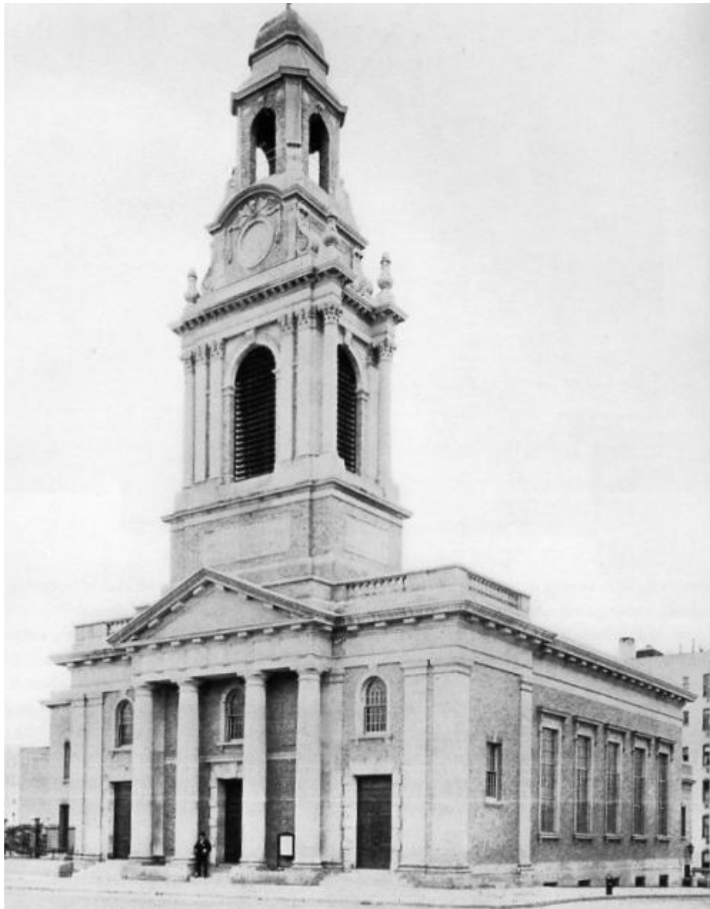
Fort Washington Presbyterian Church Historic Photograph, c. 1915