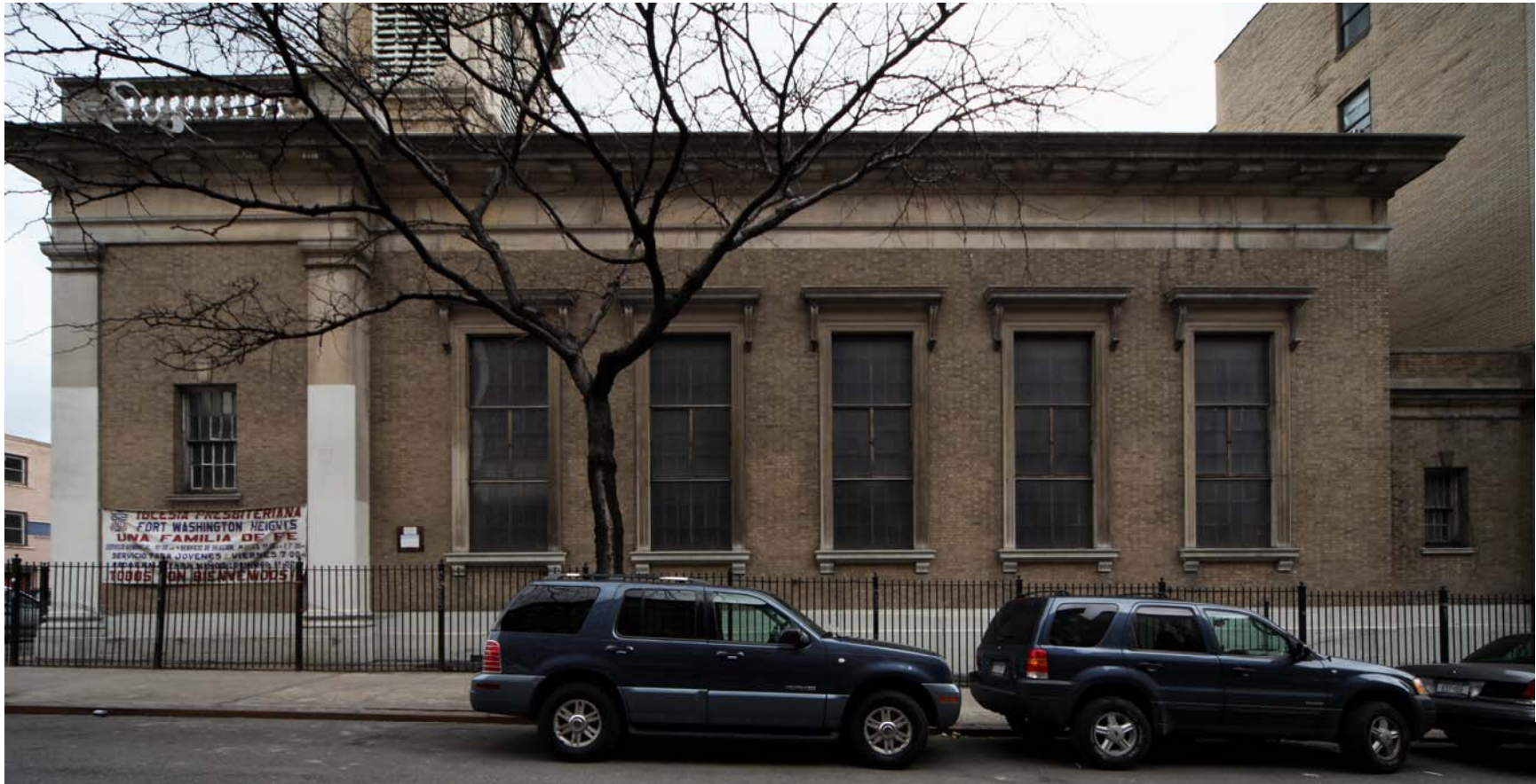
Fort Washington Presbyterian Church West 174th Street Facade