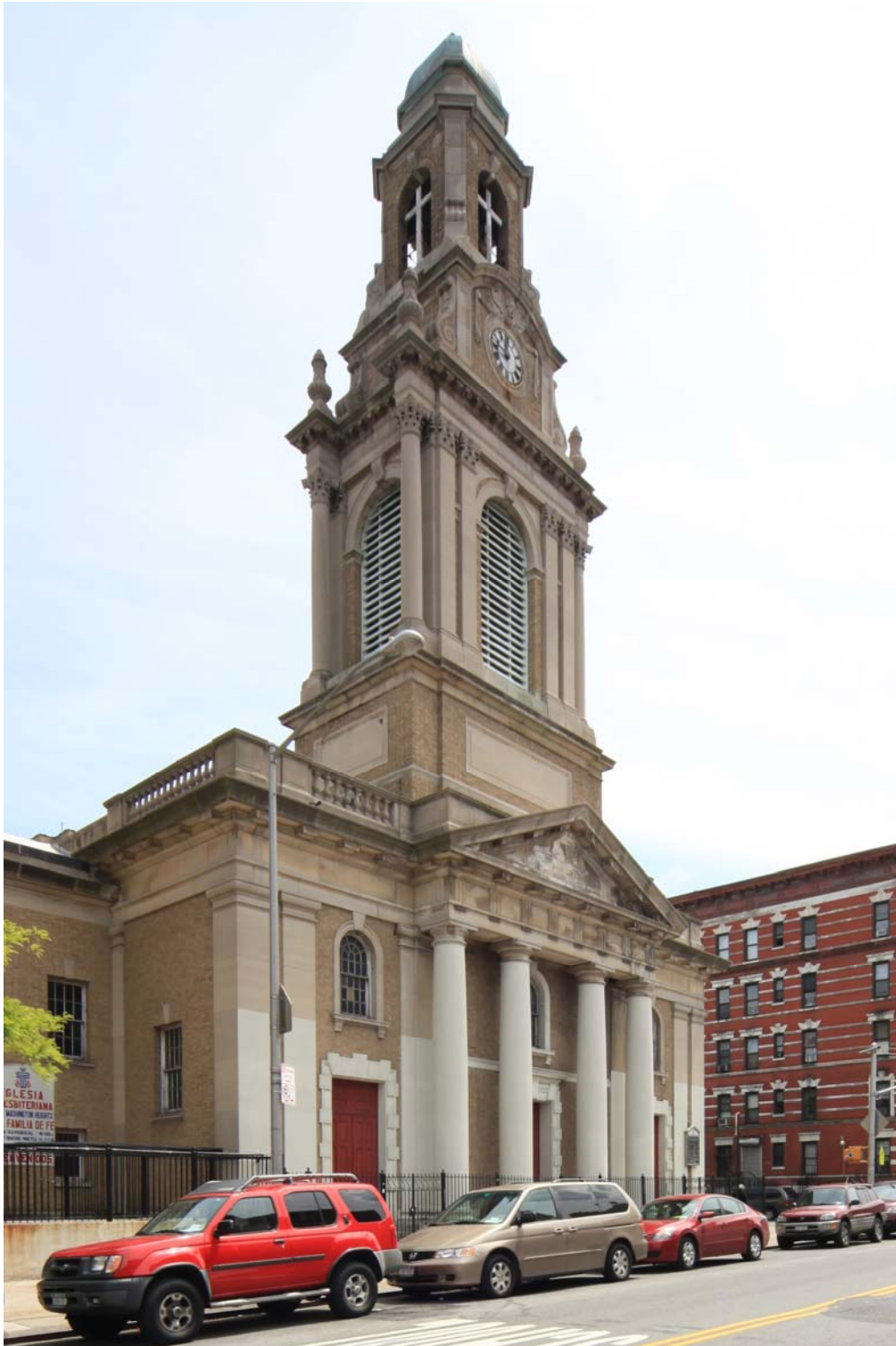
Fort Washington Presbyterian Church Wadsworth Avenue Facade