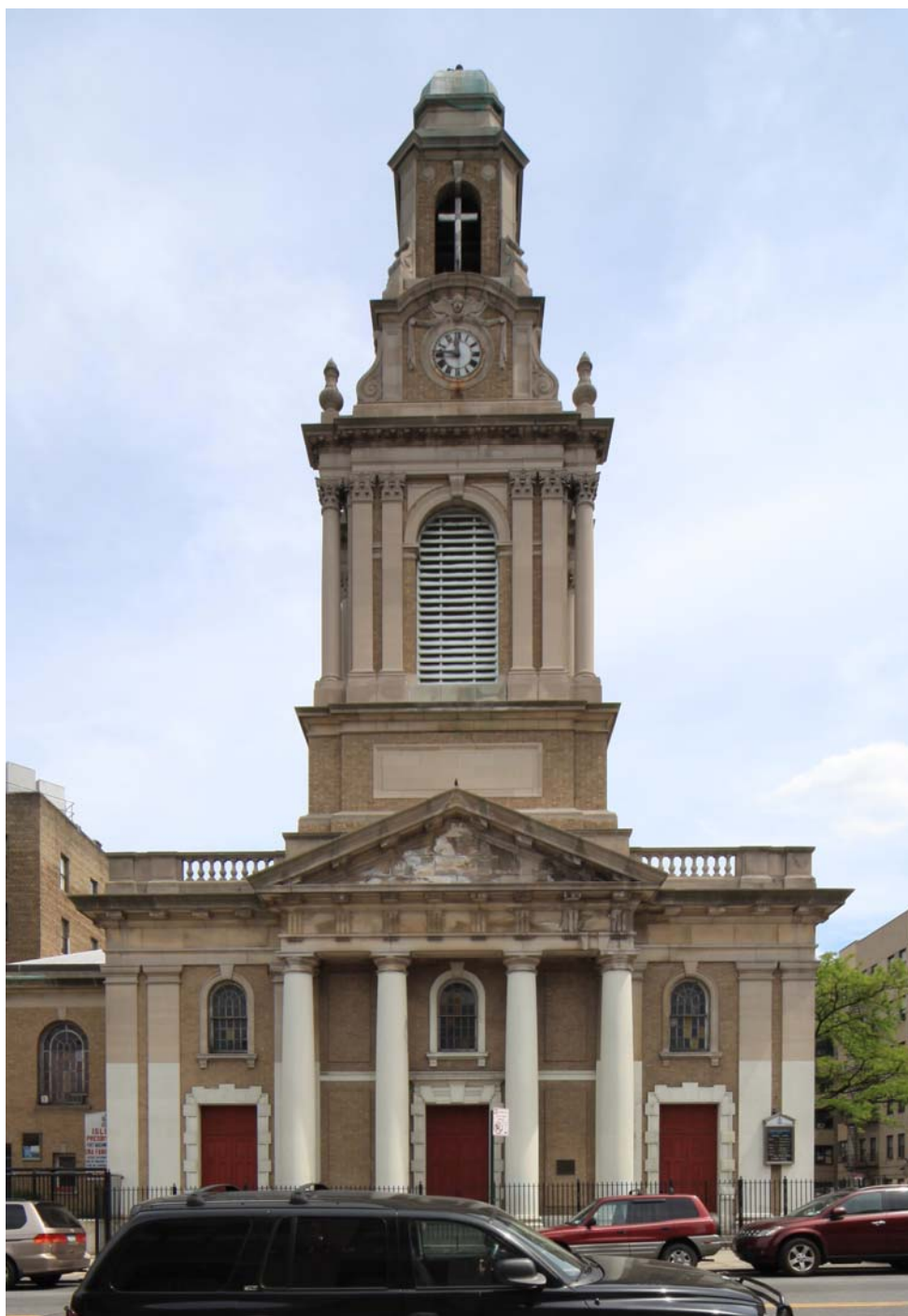
Fort Washington Presbyterian Church Wadsworth Avenue Facade