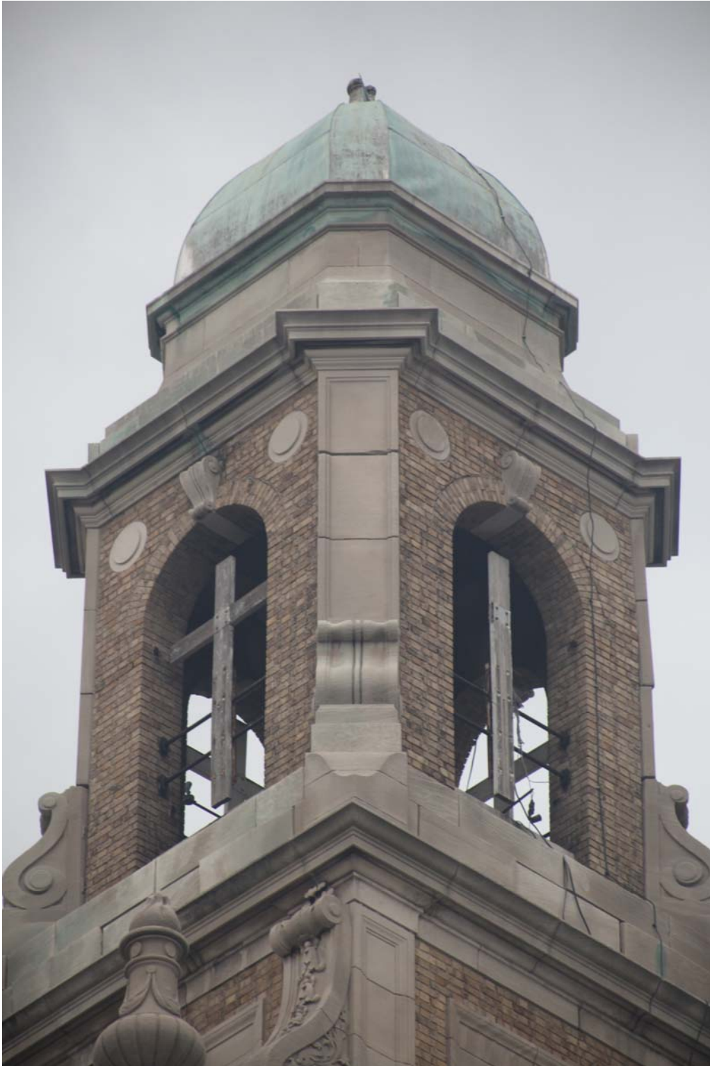
Fort Washington Presbyterian Church Tower