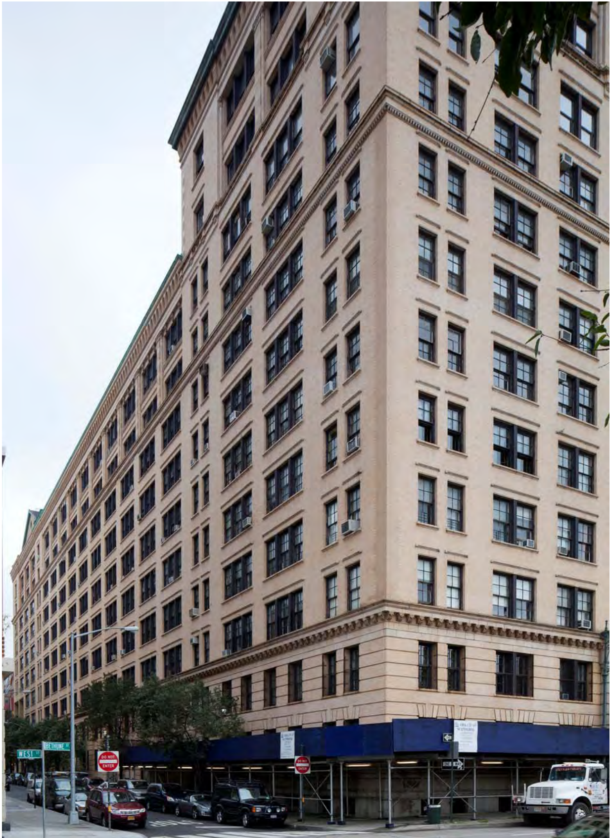
Bell Telephone Laboratories Complex (former Western Electric Company Building) (now Westbeth Artists' Housing), Sections D and C