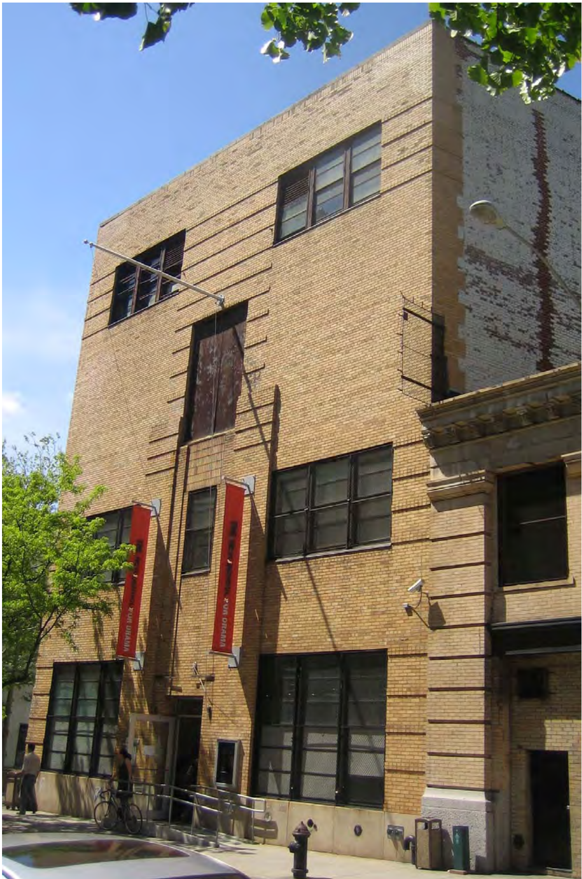
Bell Telephone Laboratories Complex (now Westbeth Artists' Housing), Section L