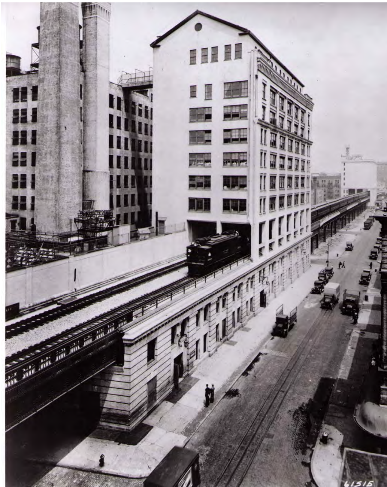
Bell Telephone Laboratories Complex (including former Western Electric Company Building) (now Westbeth Artists' Housing) , showing Sections G and H after construction of the New York Central Railroad elevated freight railway (1934)