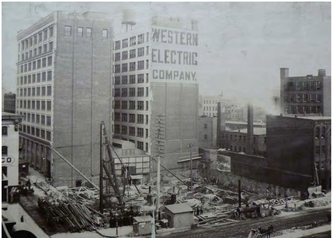
Western Electric Company Building, Sections C and B, and Hook's Steam-powered Factory Building (Section I)