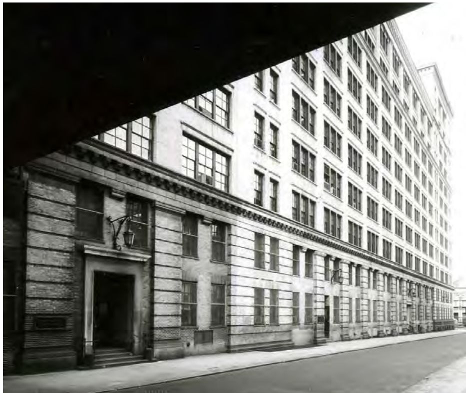
Bell Telephone Laboratories Complex (now Westbeth Artists' Housing), Section H