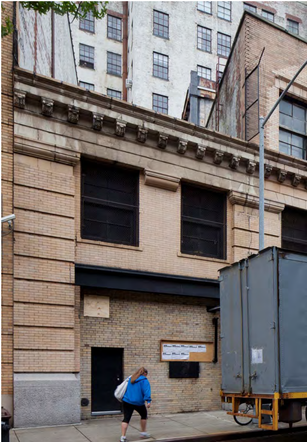
Bell Telephone Laboratories Complex (former Western Electric Company Building) (now Westbeth Artists' Housing), Section E