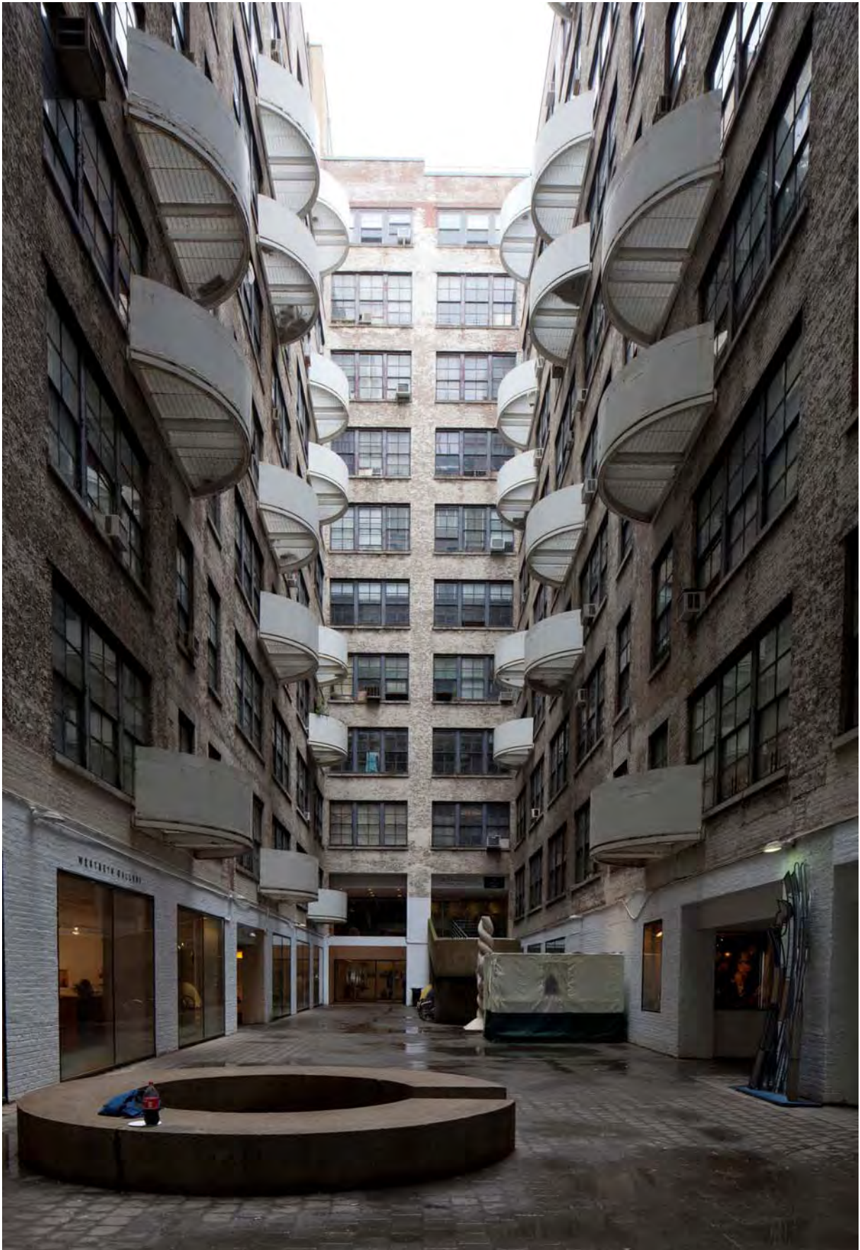
Bell Telephone Laboratories Complex (former Western Electric Company Building) (now Westbeth Artists' Housing), Sections A-D, Interior Light Court