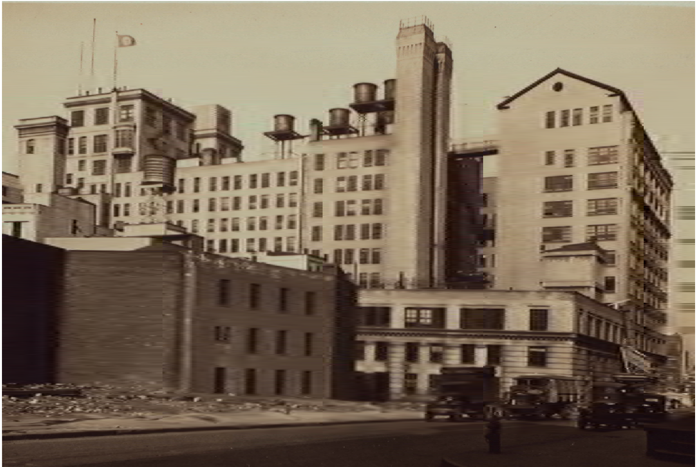
Bell Telephone Laboratories Complex (including former Western Electric Company Building) (now Westbeth Artists' Housing) , showing Section G prior to the construction of the New York Central Railroad elevated freight railway (1931)