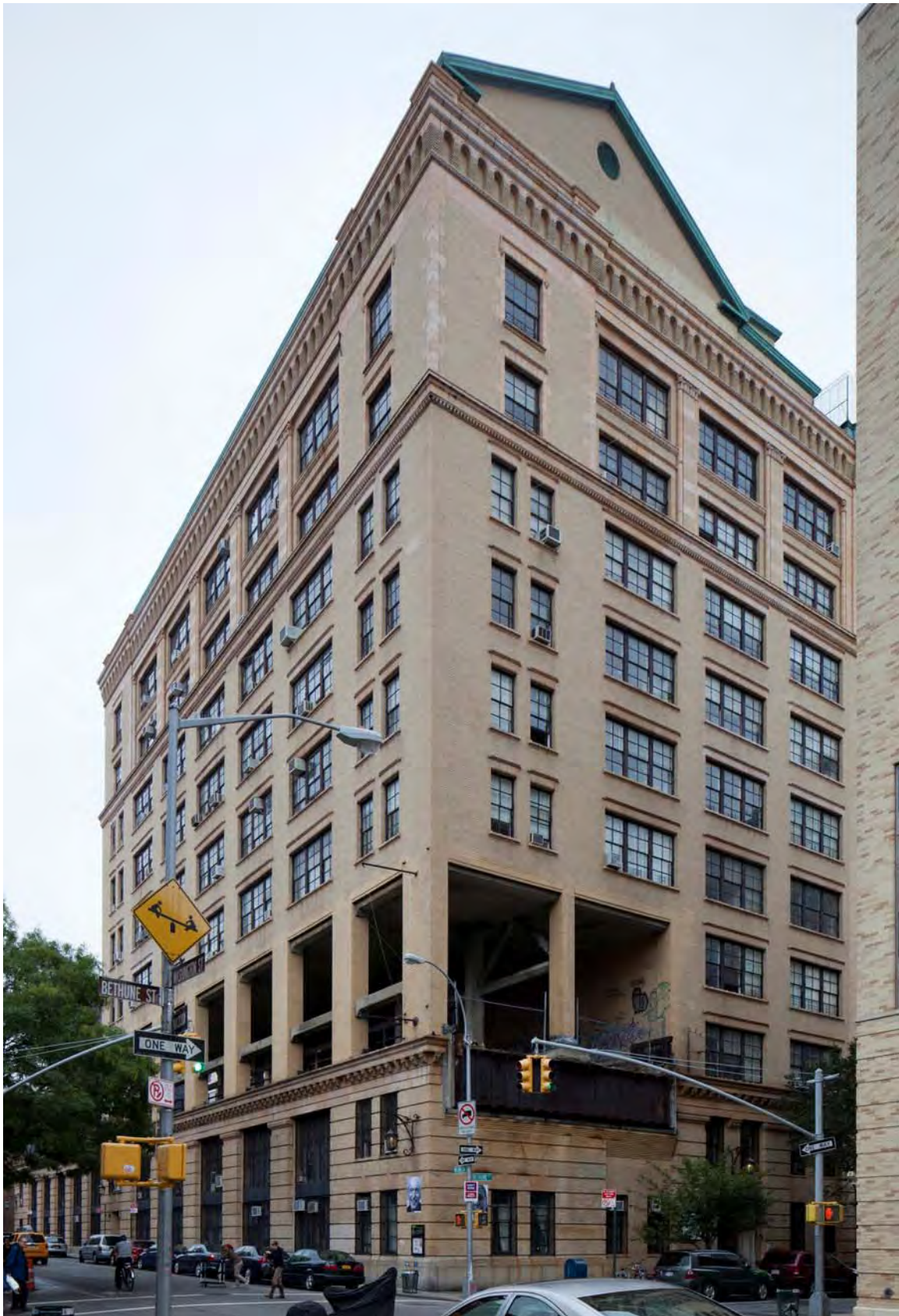
Bell Telephone Laboratories Complex (now Westbeth Artists' Housing), Section H