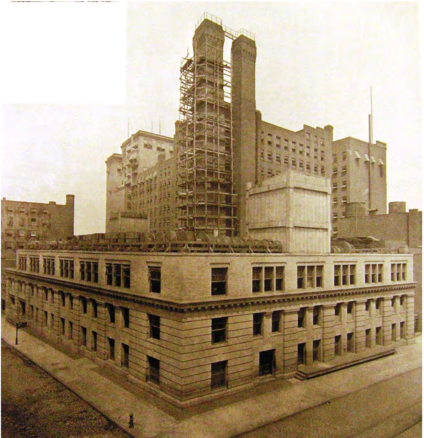
Western Electric Company Building, Section G