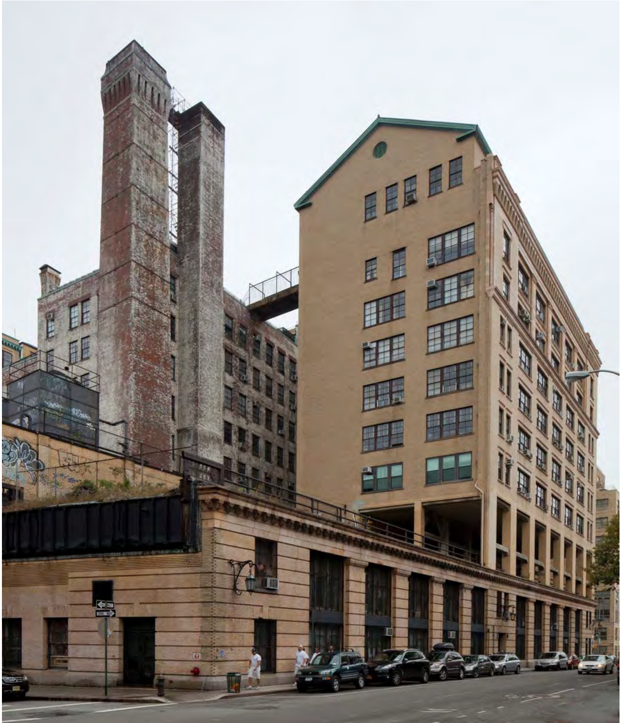
Bell Telephone Laboratories Complex (now Westbeth Artists' Housing), Section H