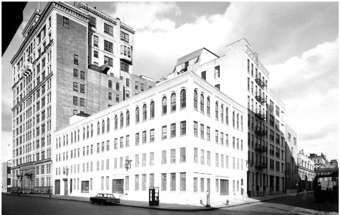
Bell Telephone Laboratories Complex (including the former Western Electric Company and Hook's Steam-powered Factory Buildings) (now Westbeth Artists' Housing), 445-465 West Street, 137-169 Bank Street, 51-77 Bethune Street, and 734-754 Washington Street, Manhattan.