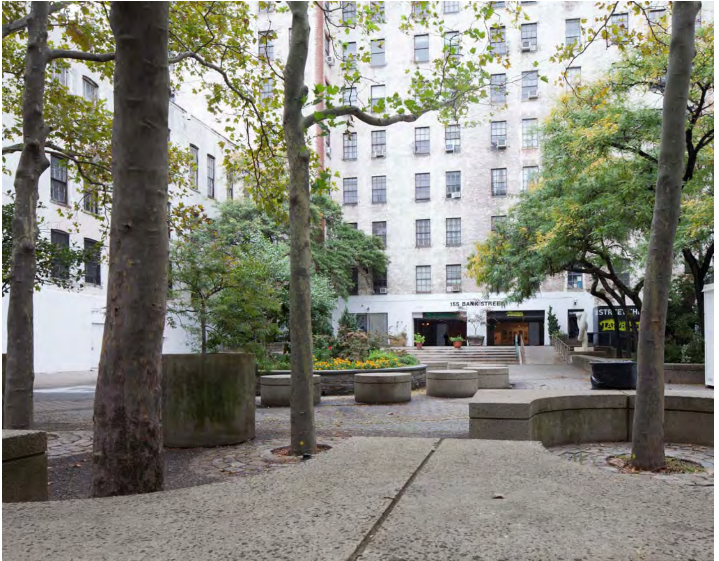
Westbeth Artists' Housing, Westbeth Park