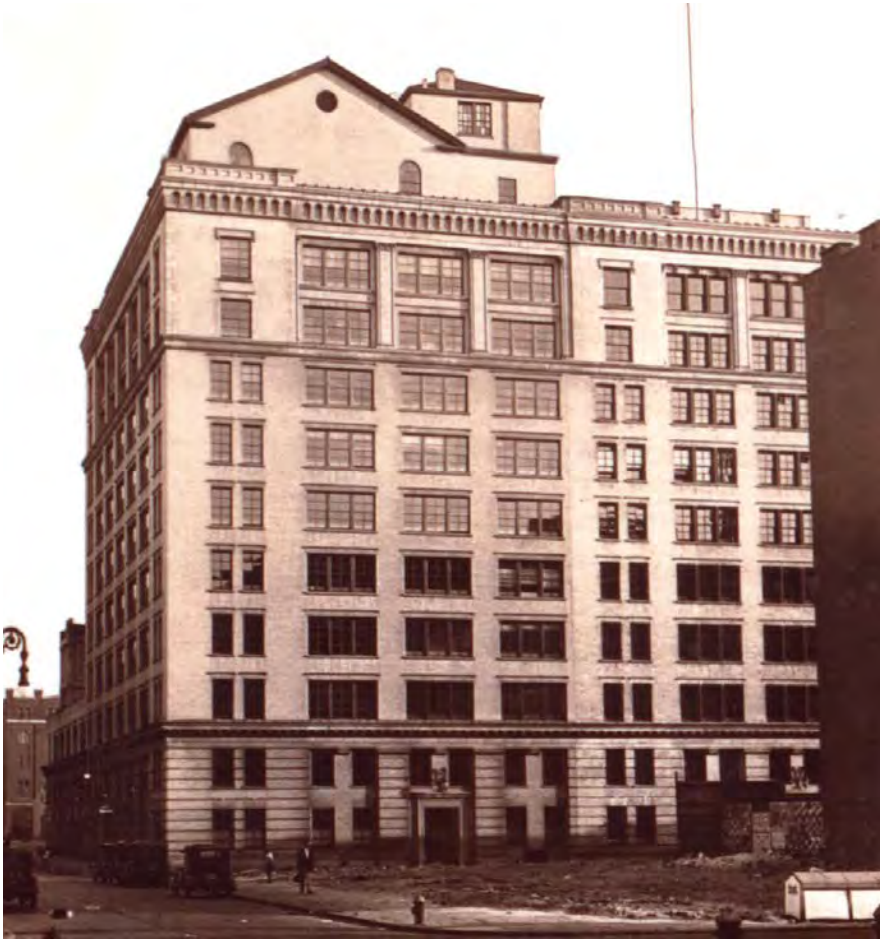
Bell Telephone Laboratories Complex (now Westbeth Artists' Housing) , showing Section H prior to and during the construction of the New York Central Railroad elevated freight railway (c. 1931 and 1933)