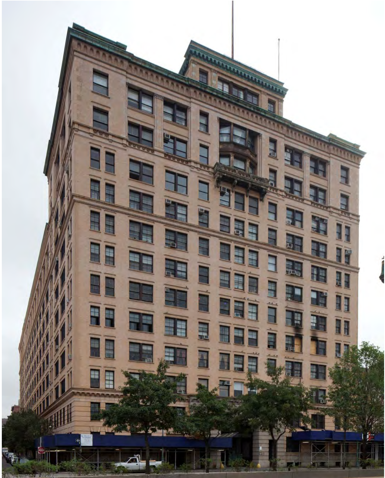
Bell Telephone Laboratories Complex (former Western Electric Company Building) (now Westbeth Artists' Housing), Sections A-D