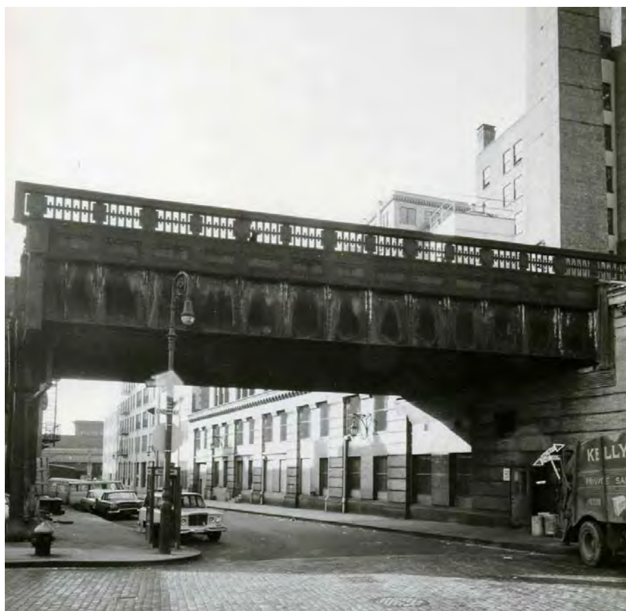
Bell Telephone Laboratories Complex (former Western Electric Company Building), Section G