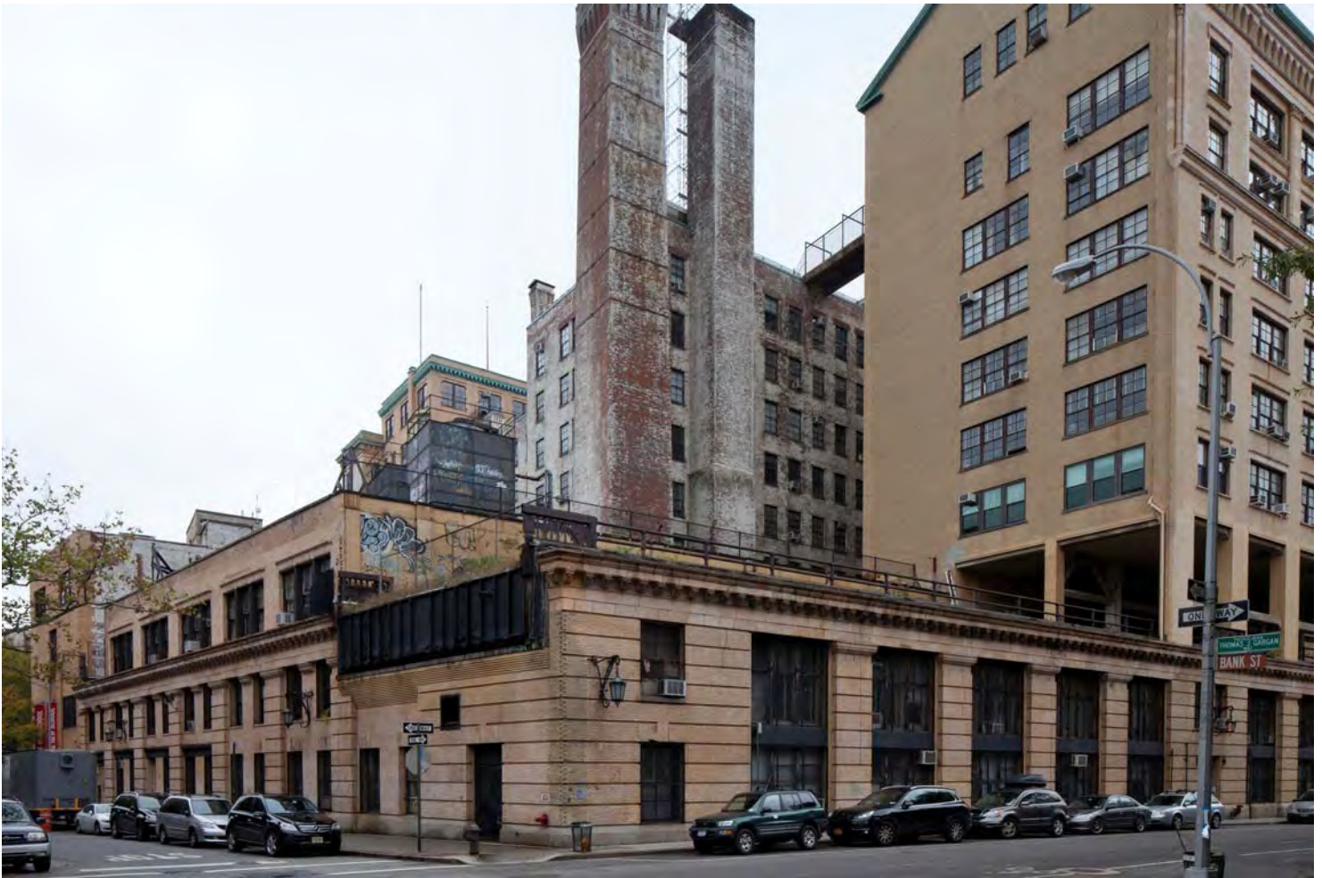
Bell Telephone Laboratories Complex (former Western Electric Company Building) (now Westbeth Artists' Housing), Section G