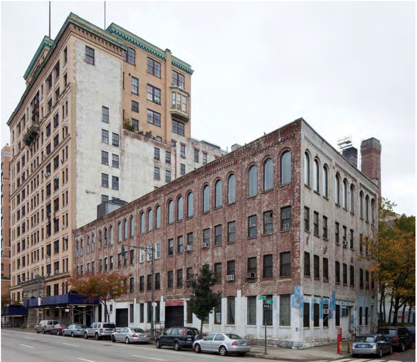
Bell Telephone Laboratories Complex (former Hook's Steam-powered Factory Building) (now Westbeth Artists' Housing), Section I