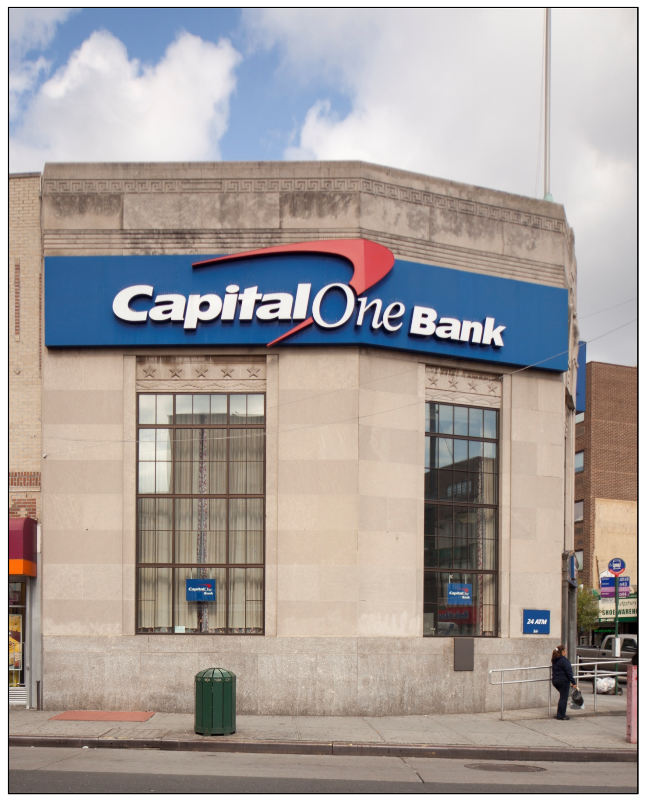
Jamaica Savings Bank Jamaica Avenue facade