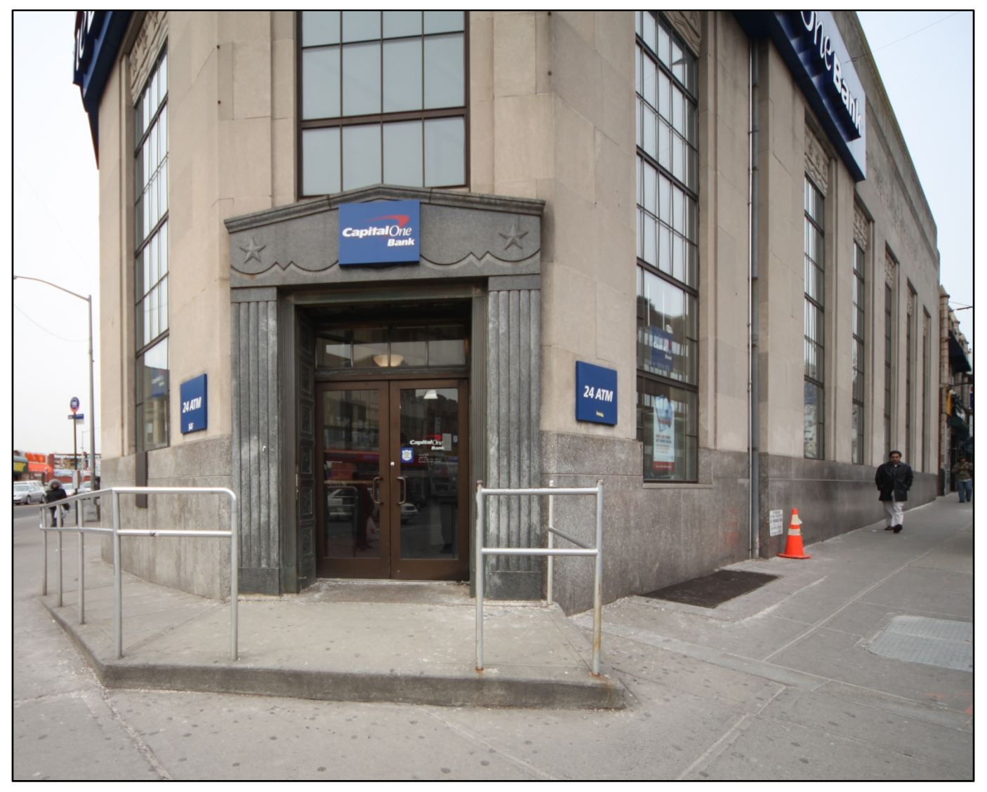
Jamaica Savings Bank Detail