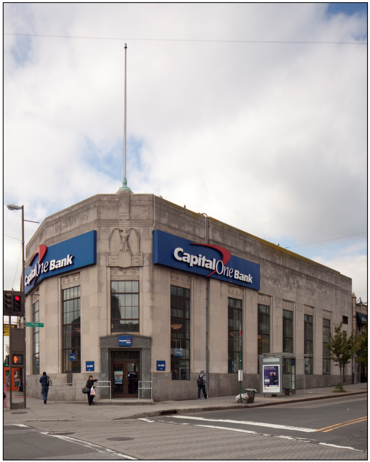
Jamaica Savings Bank 146-21 Jamaica Avenue (aka 146-19 to 146-21 Jamaica Avenue, 90-32 to 90-44 Sutphin Boulevard), Queens Jamaica Avenue and Sutphin Boulevard facades