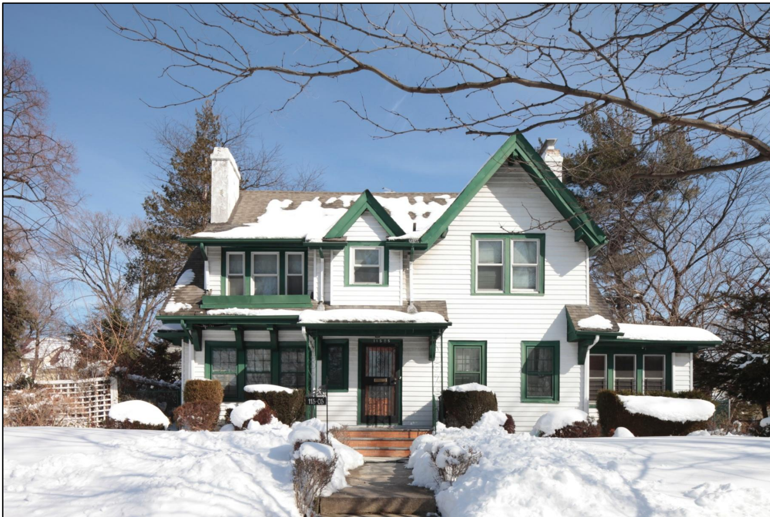
115-05 179th Street