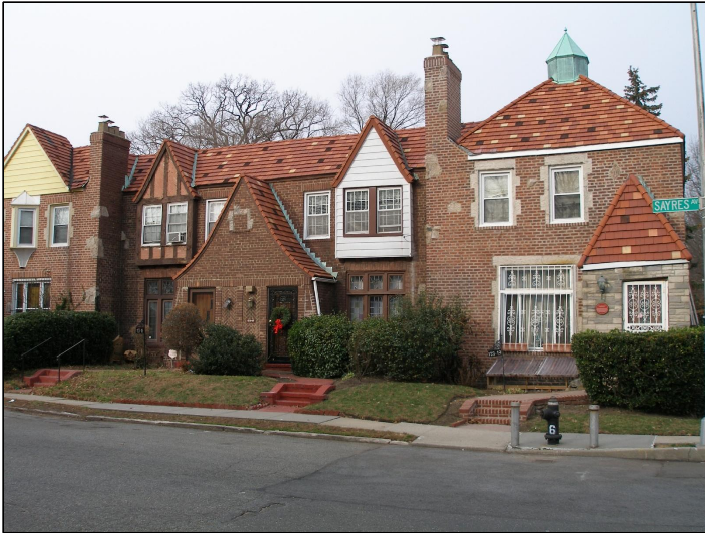
173-15 to 173-19 Sayres Avenue Photo by Theresa C. Noonan, 2006