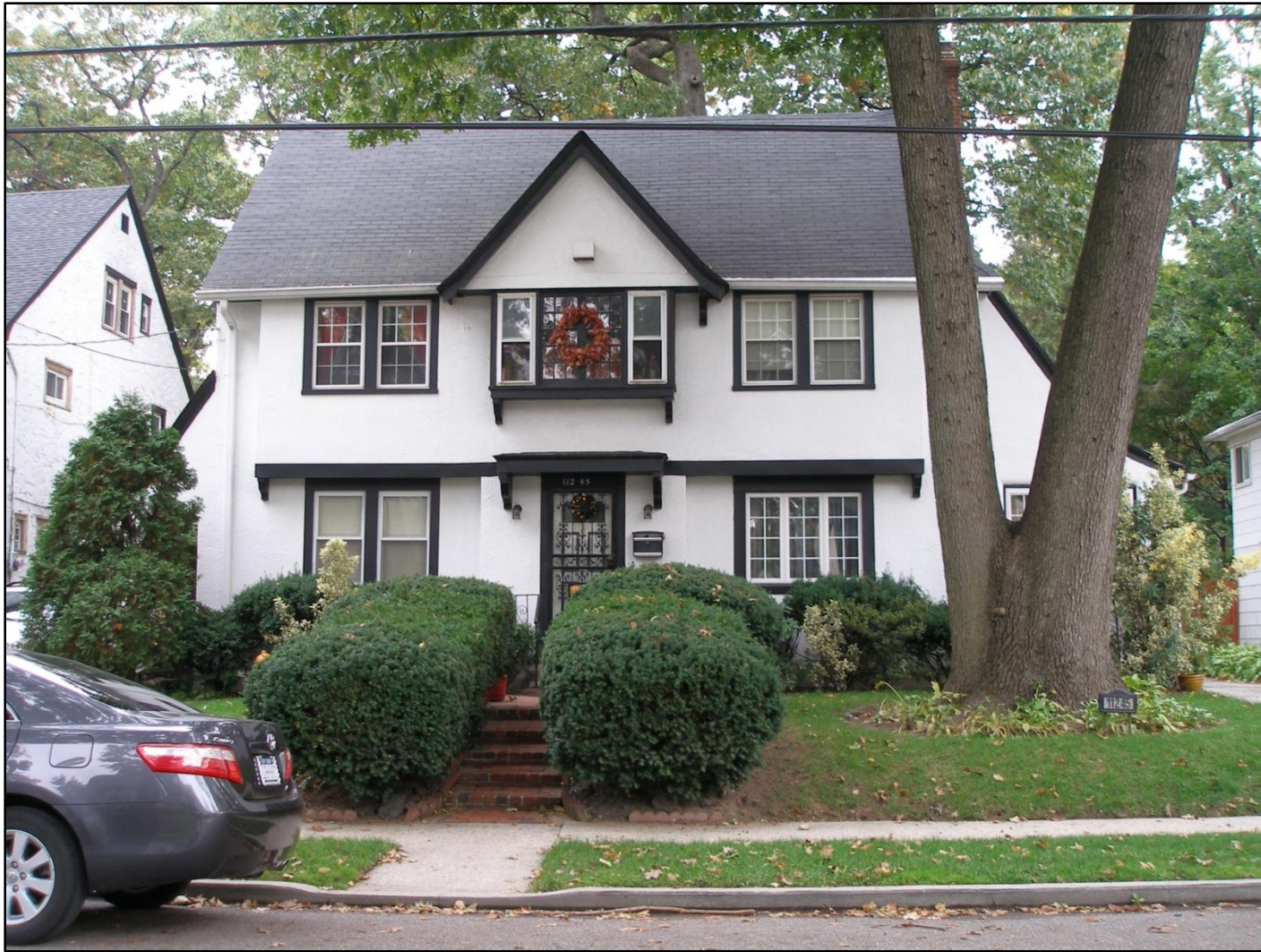
112-45 178th Street, former home of Lena Horne