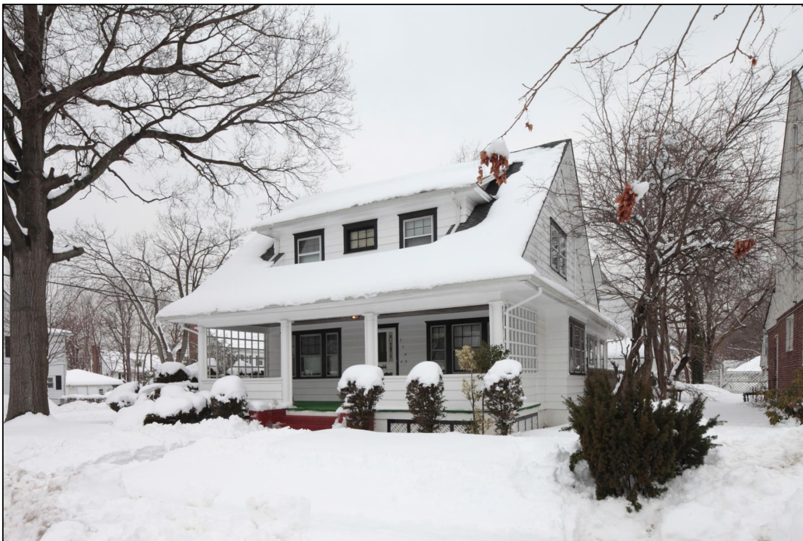
178-03 114th Road