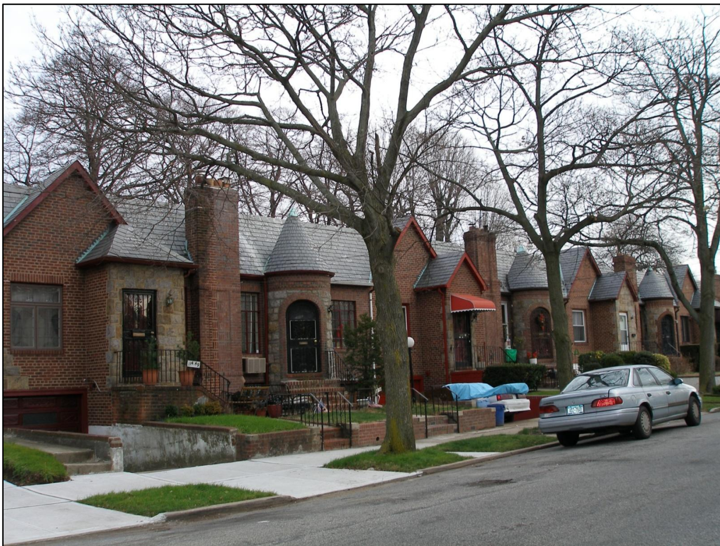
114-49 to 114-59 180th Street