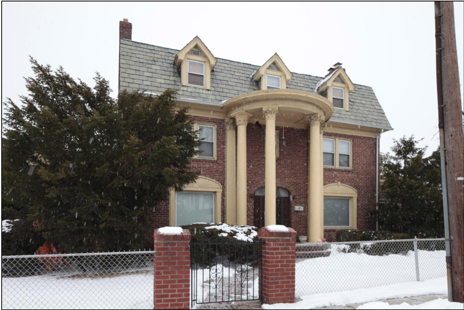
114-07 175th Street