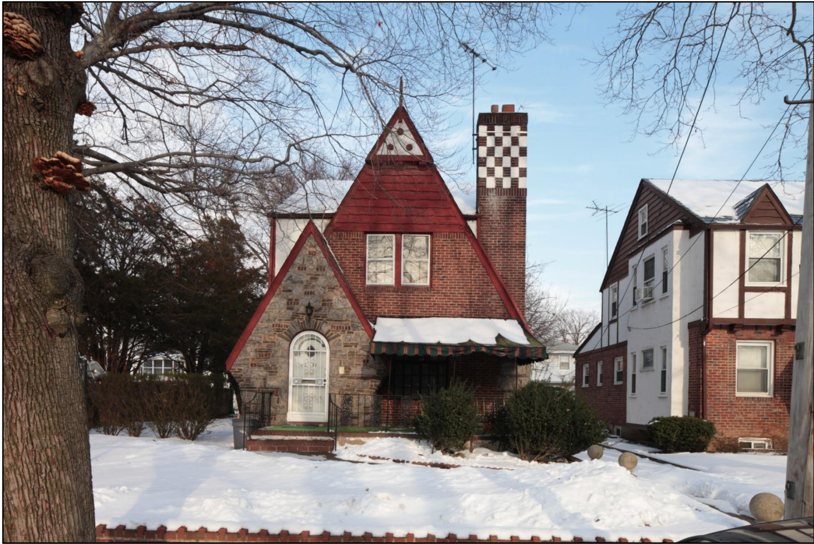
112-19 179th Street