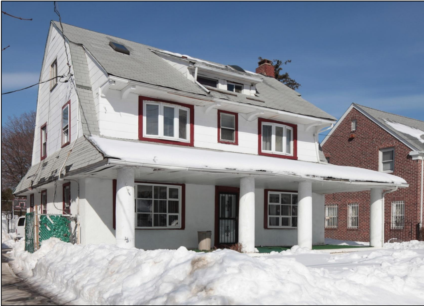
179-07 114th Road