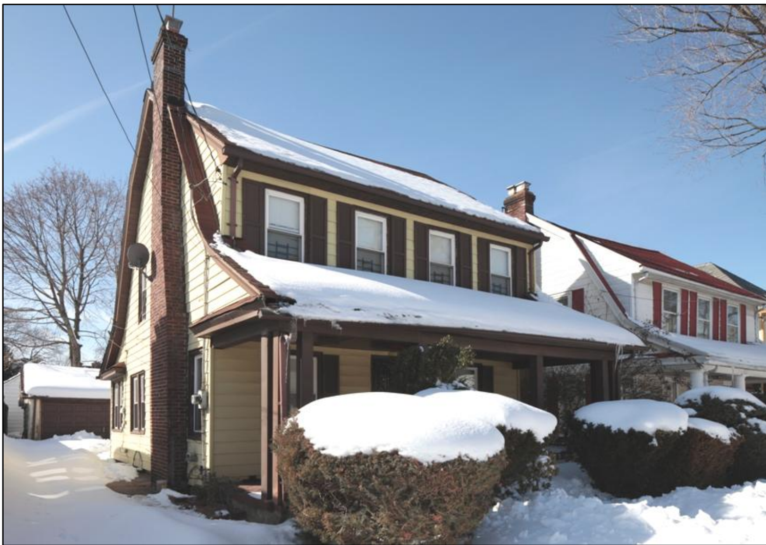
114-16 180th Road