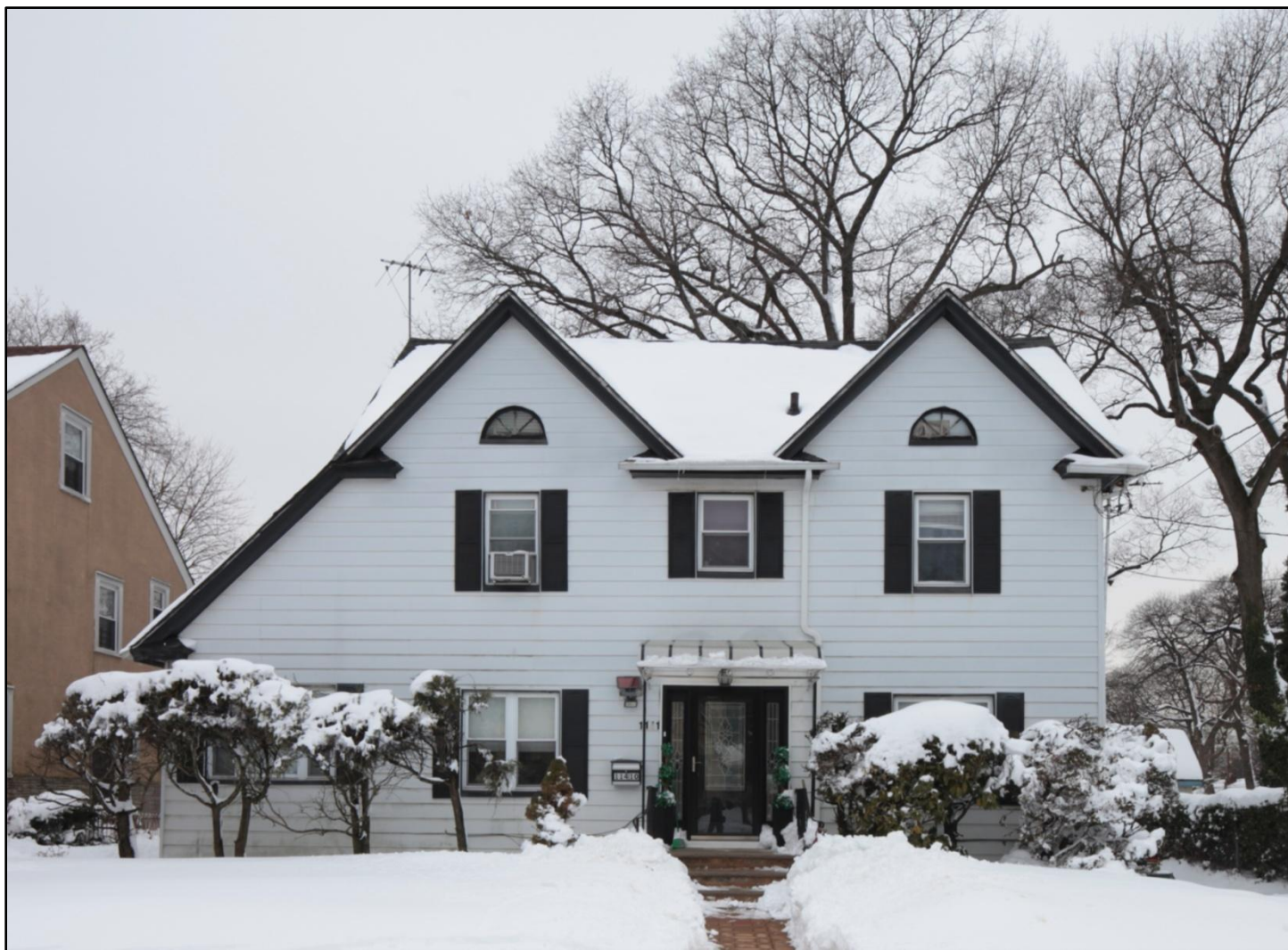
114-10 179th Street, former home of Roy Campanella