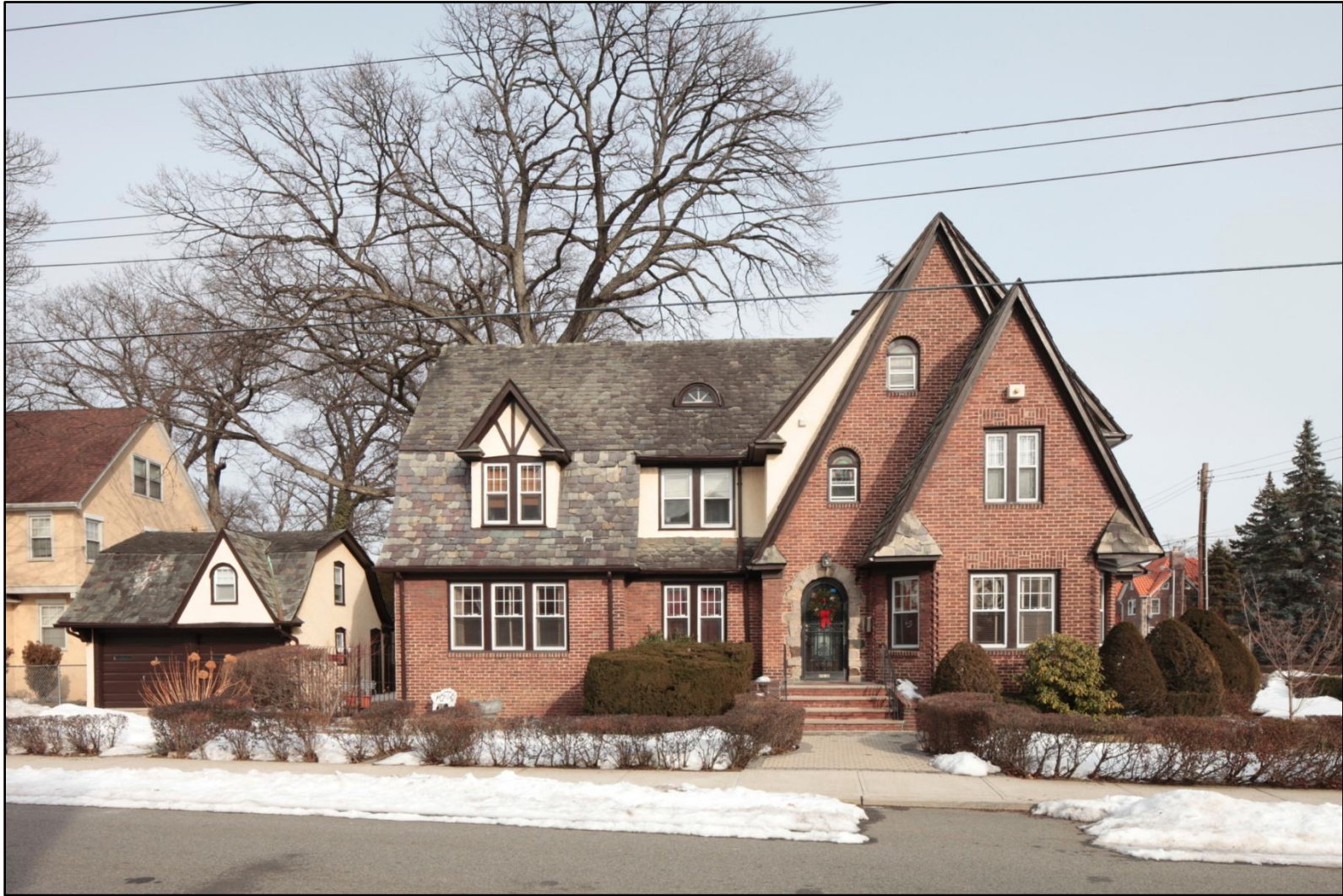
175-01 Murdock Avenue