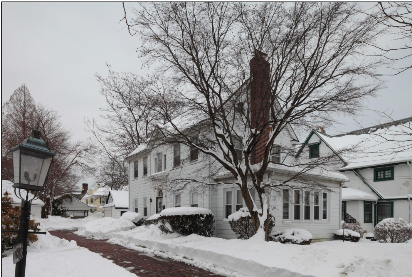
178-34 114th Road