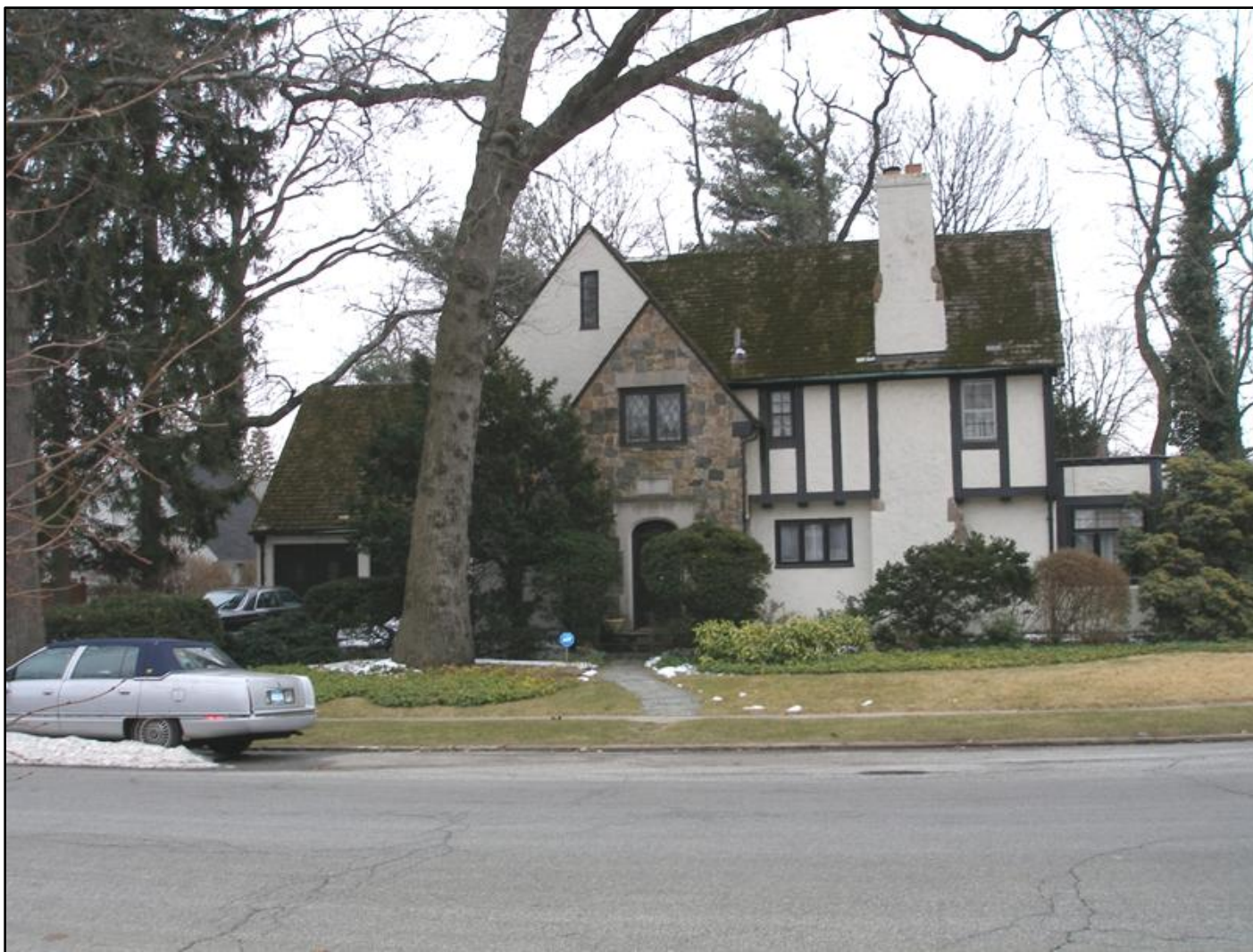
176-10 Murdock Avenue Photo by Theresa C. Noonan, 2007