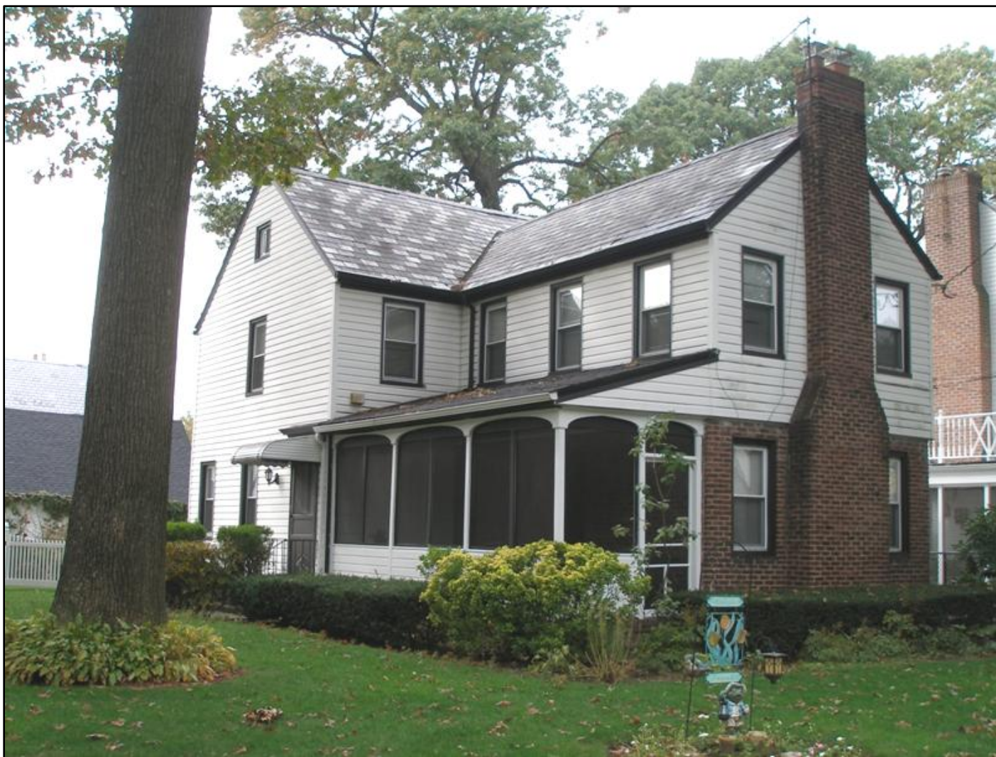
112-30 178th Place