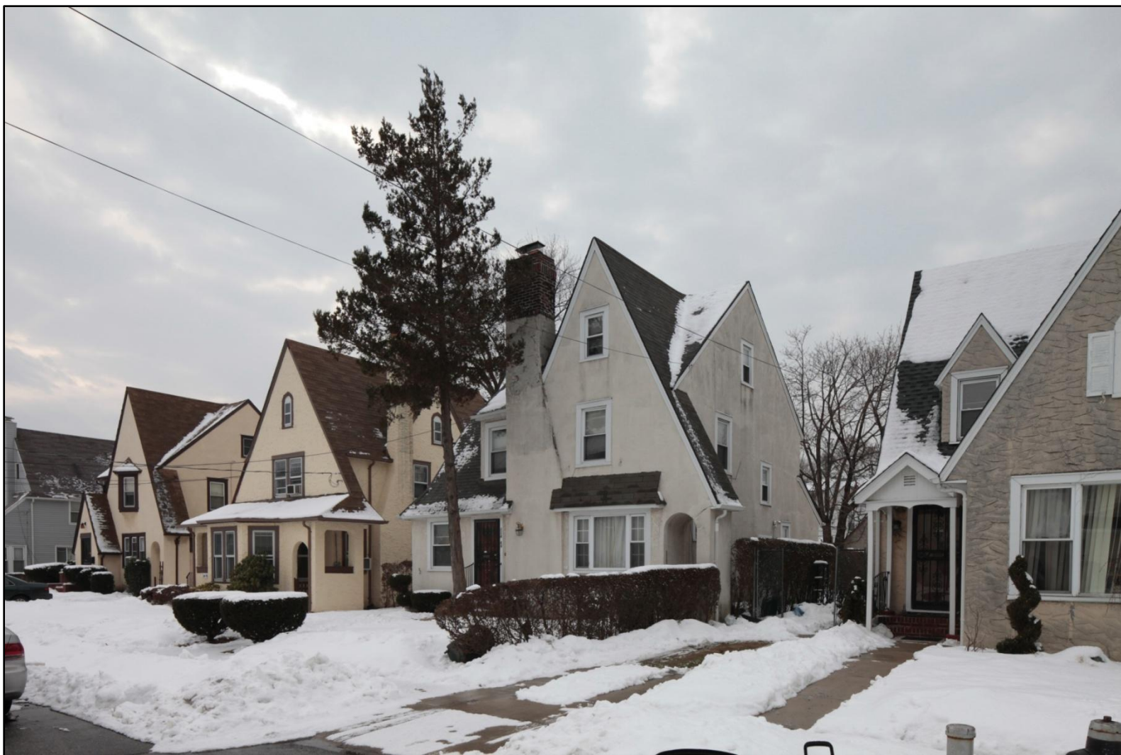
114-74 to 114-62 175th Place