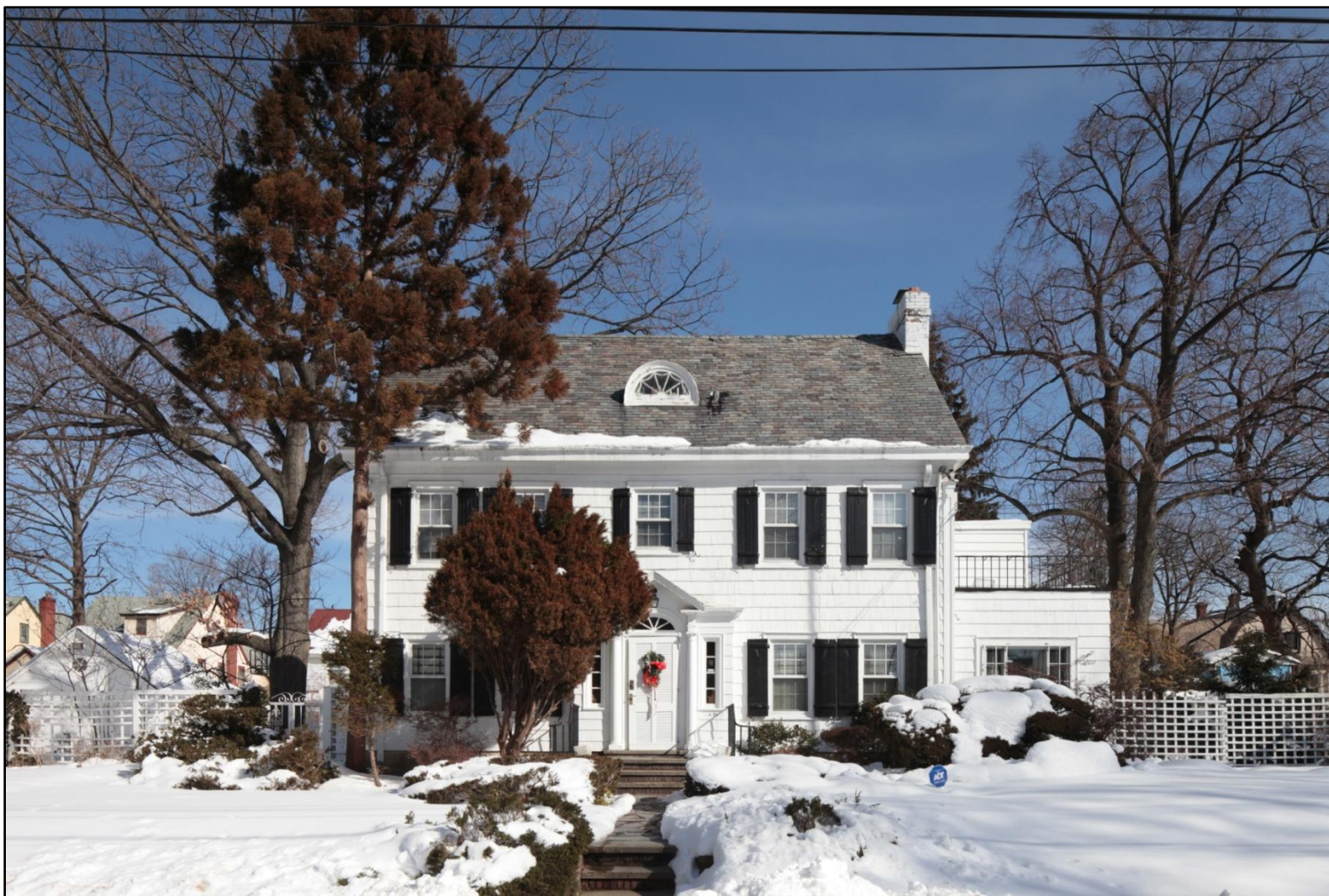
114-91 179th Street