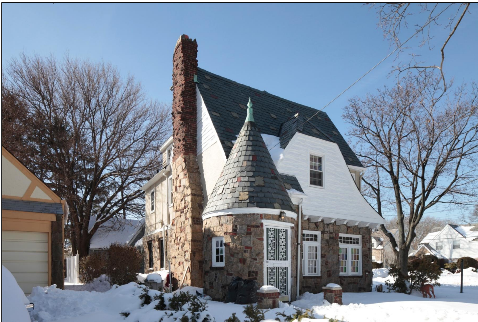
114-04 180th Street