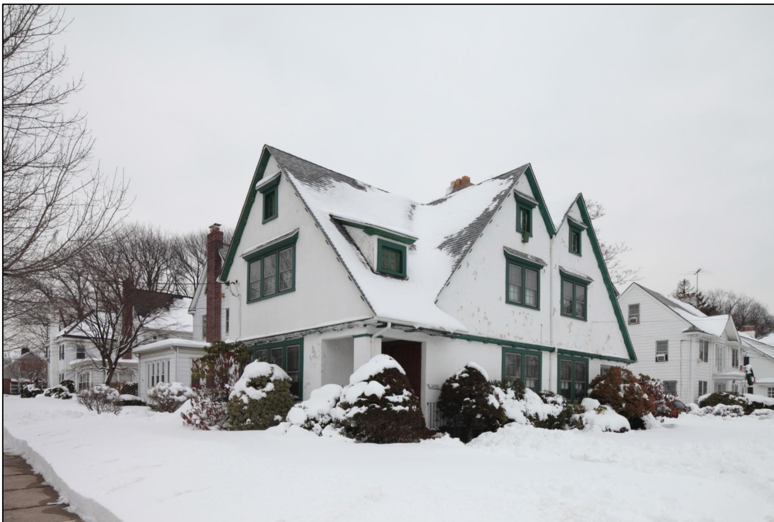
114-73 178th Place