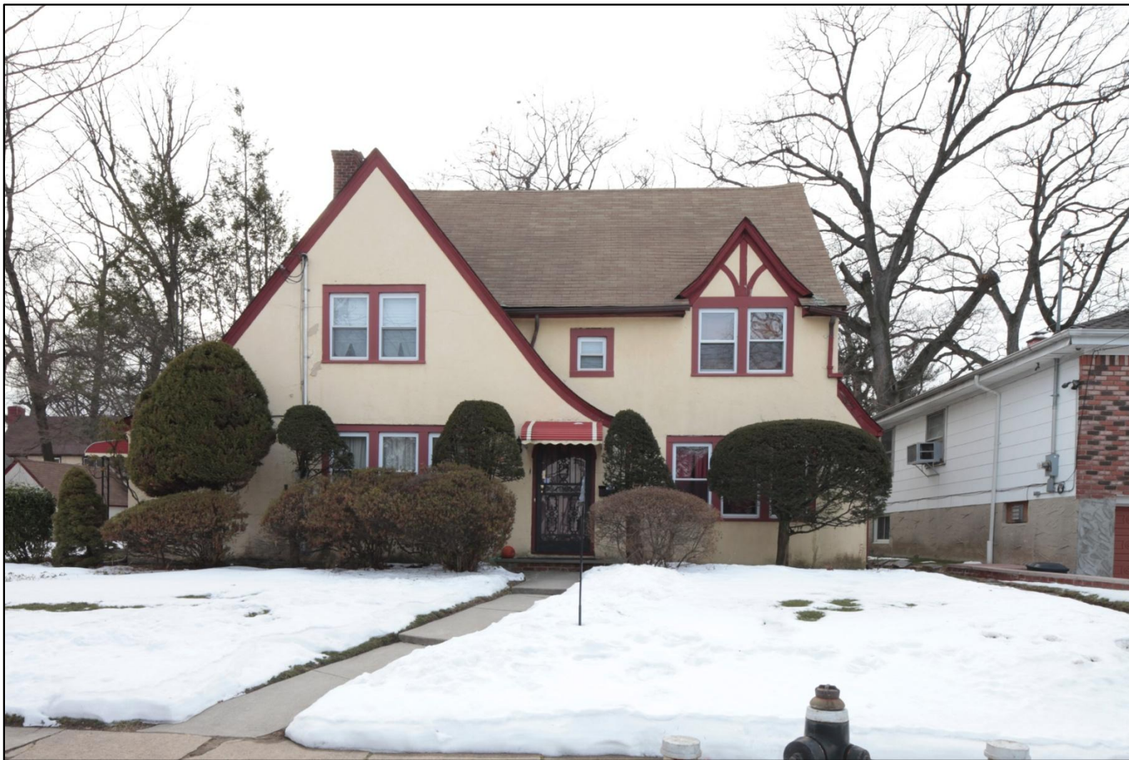
112-40 177th Street, former home of Jack Roosevelt "Jackie" Robinson