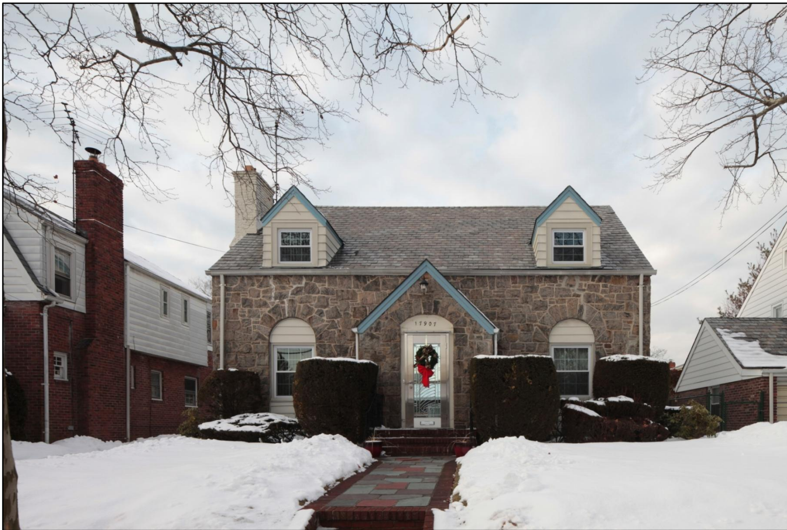
179-07 Murdock Avenue, former home of Ella Fitzgerald