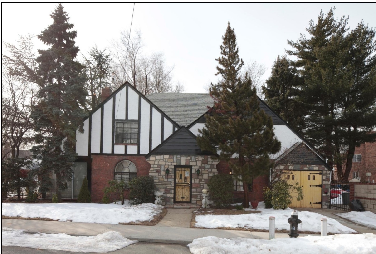
174-27 Adelaide Road, former home of William “Count” Basie