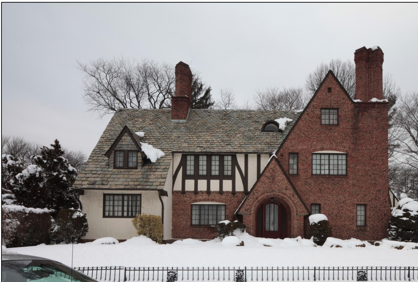
115-05 178th Place