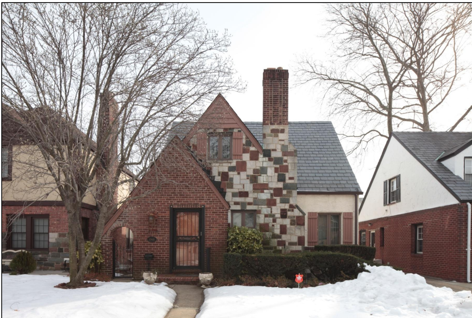
174-18 Adelaide Road Photo by Christopher D. Brazee. 2011