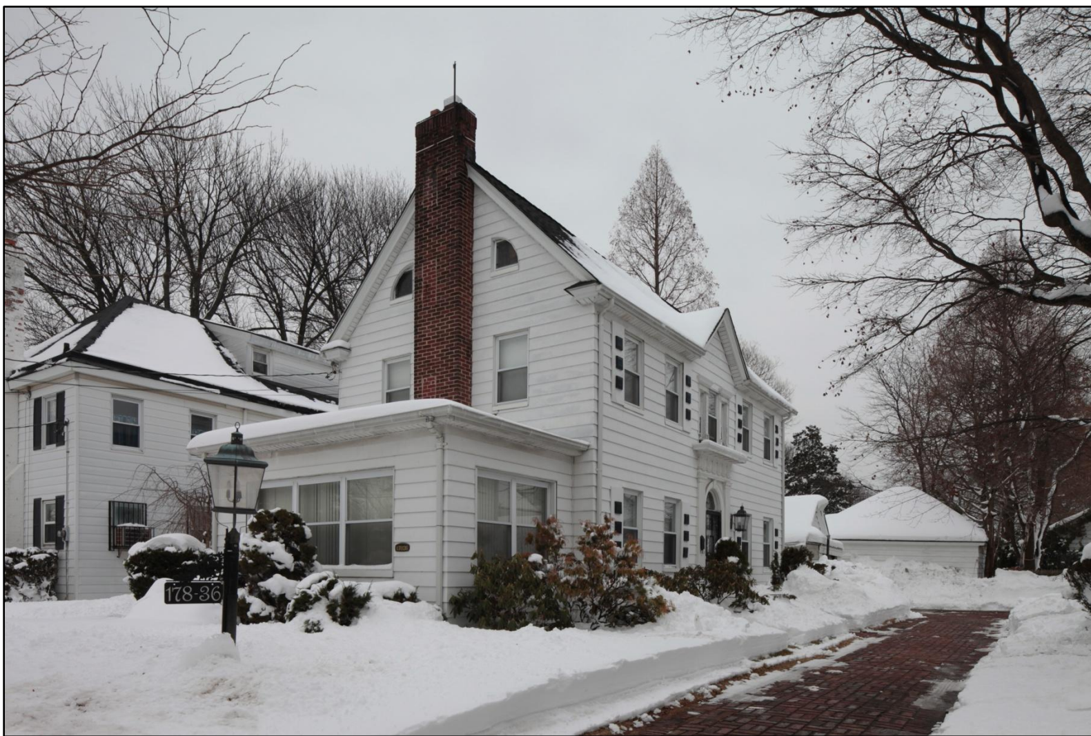
178-36 114 th Road