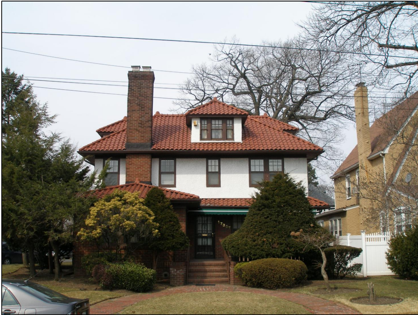
173-07 Murdock Avenue