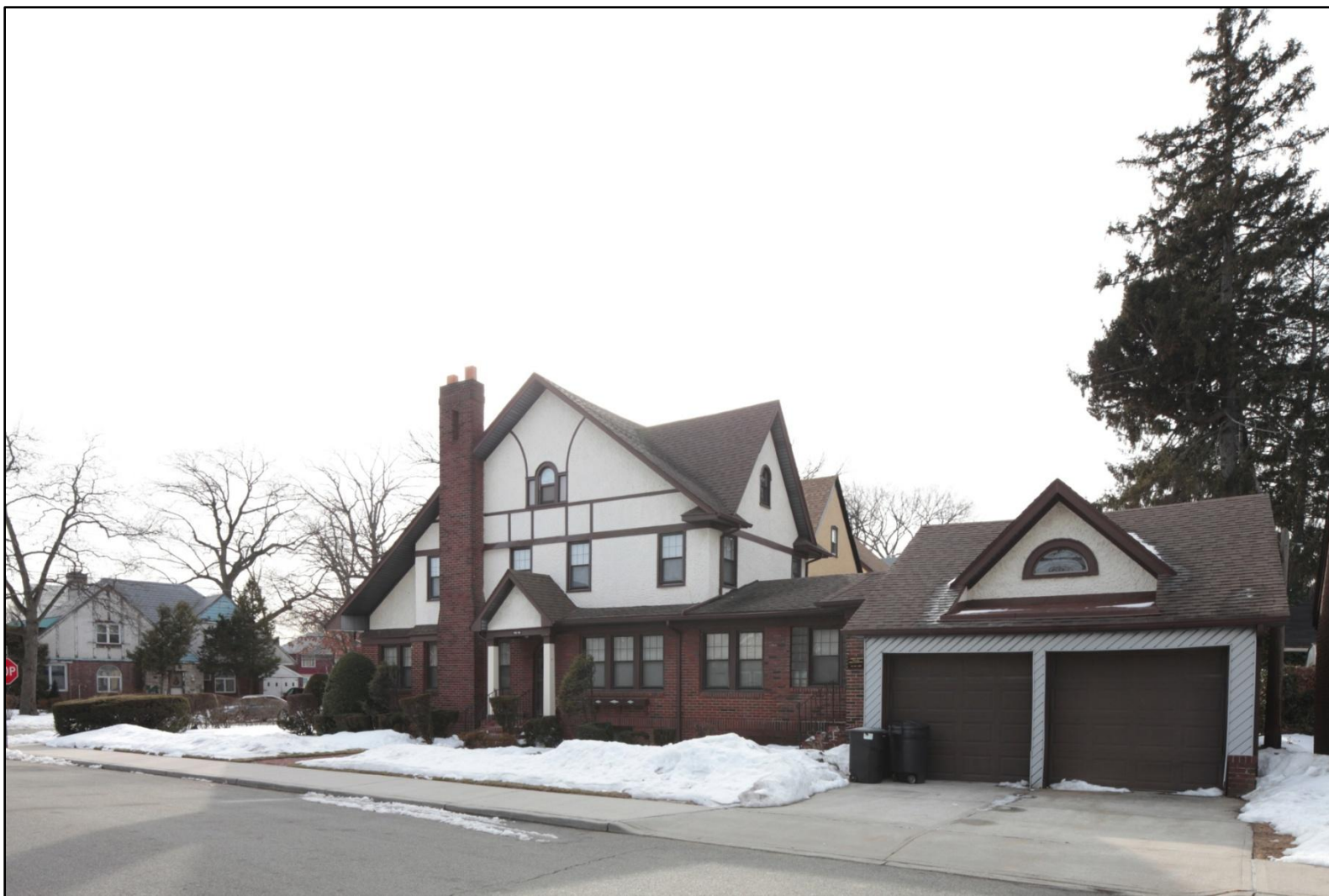
113-10 175th Street (aka 174-23 Murdock Avenue)