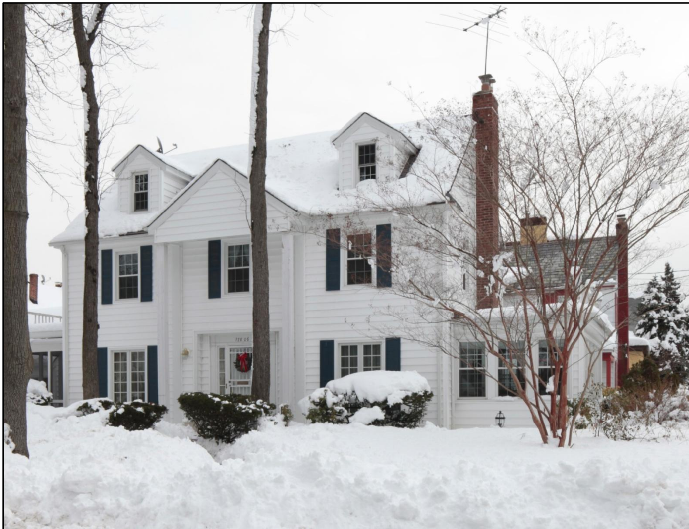
178-06 Murdock Avenue