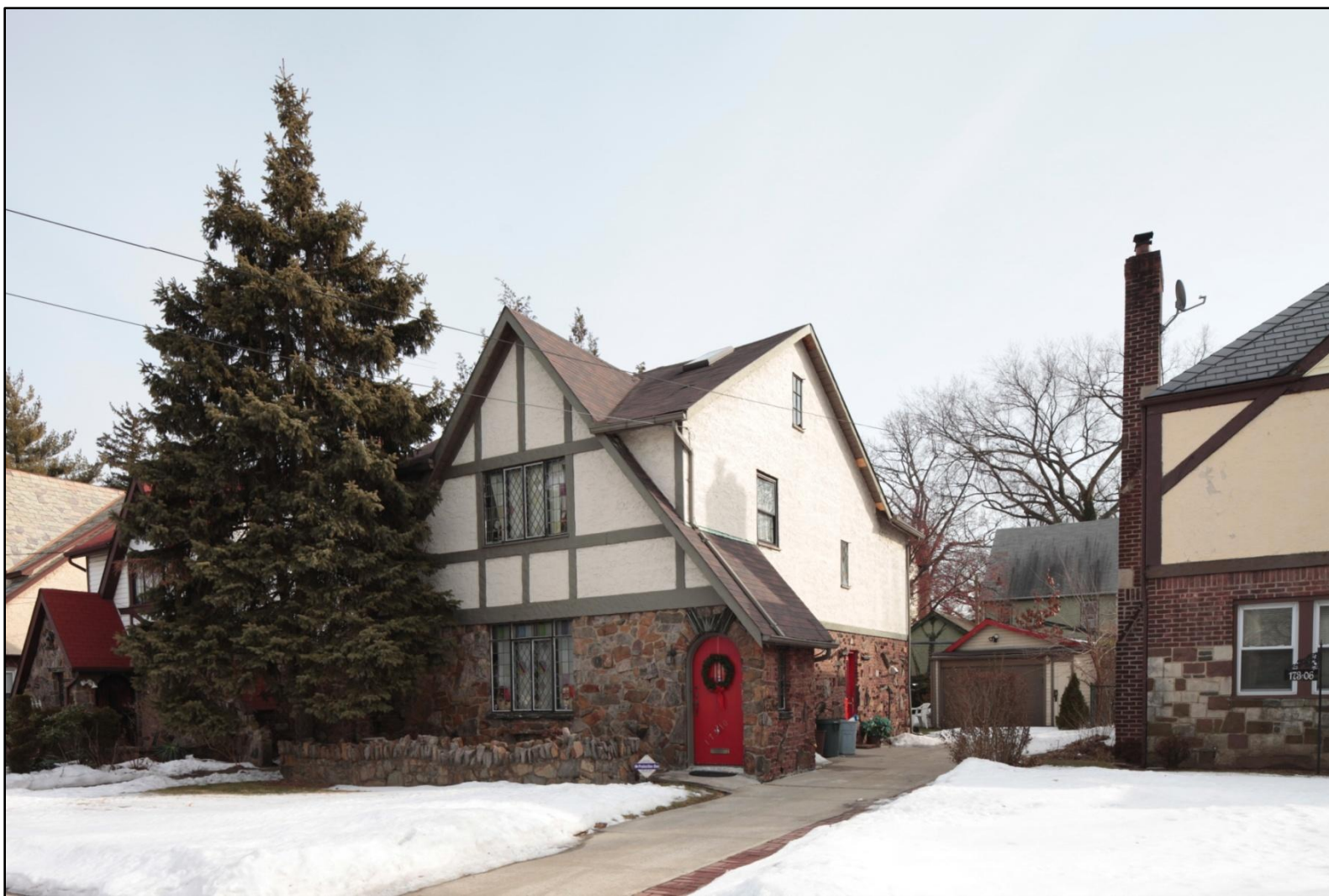
173-10 113th Avenue