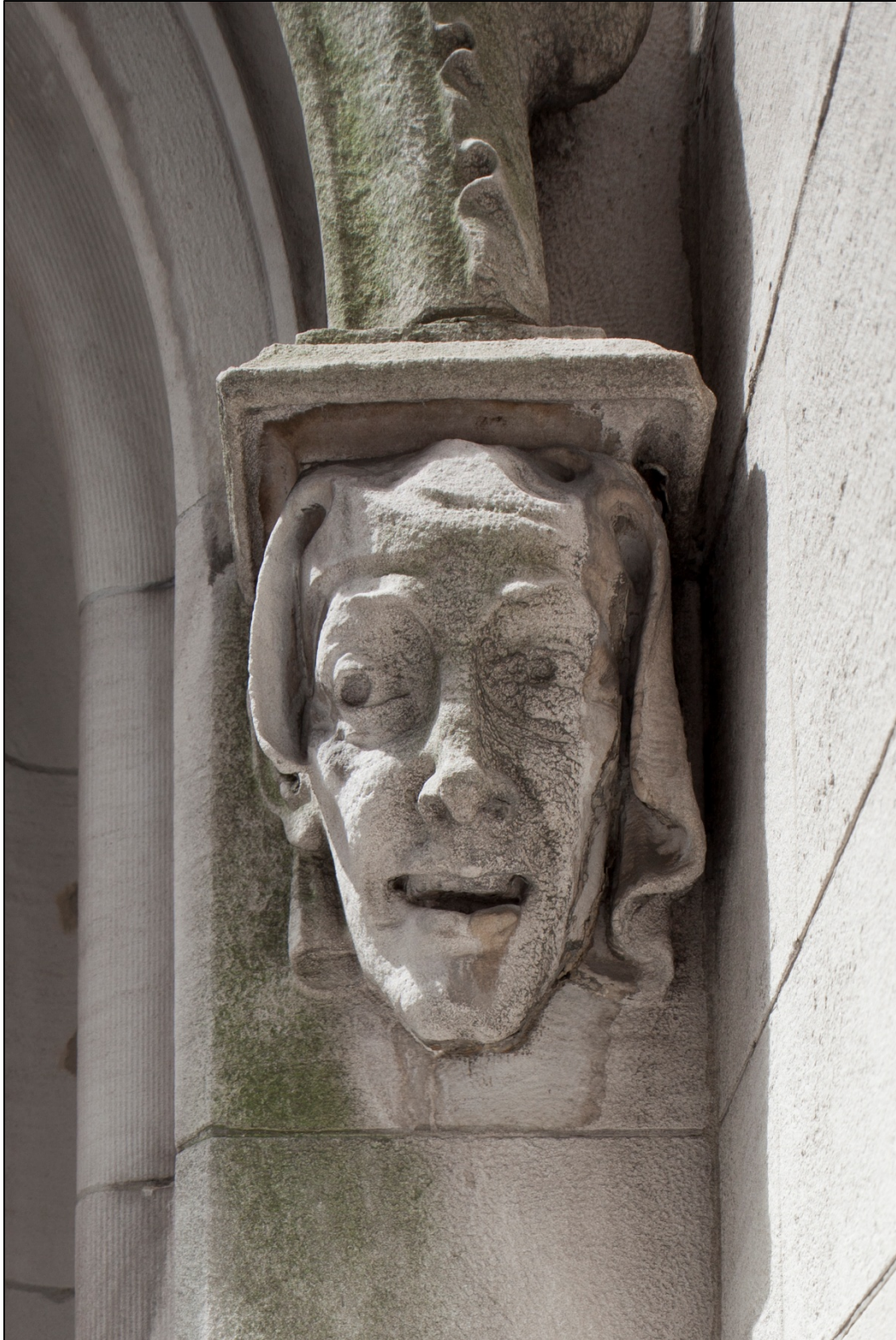
Fisk-Harkness House Detail of gargoyle Photo: Christopher D. Brazee, 2011