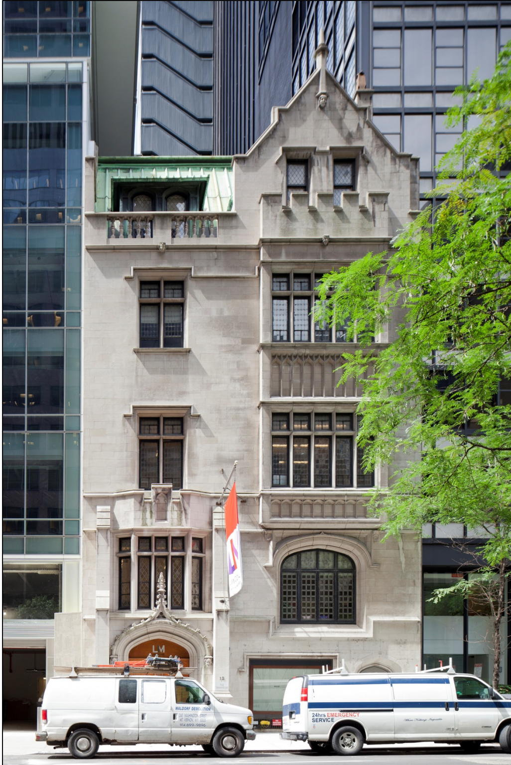
Fisk-Harkness House 12 East 53 rd Street, Manhattan Built: 1871; Renovated: 1906