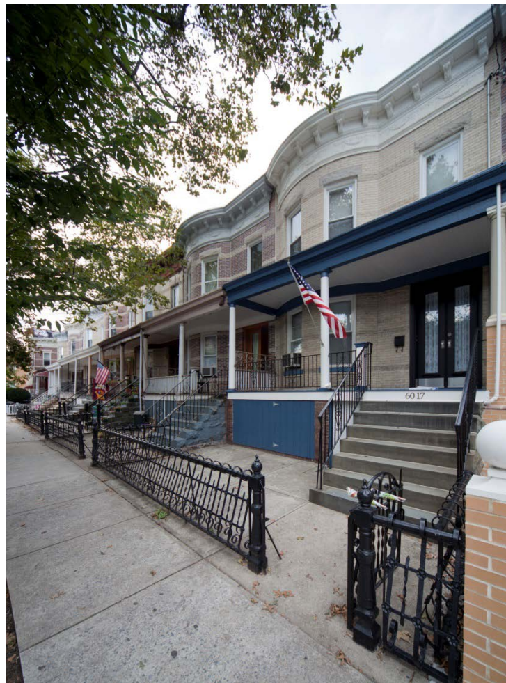
Illustration 4: Shallow bayfront houses with wood porches on 69 th Avenue developed by Louis Berger & Co., architects, and Paul Stier, builder. Photo: Donald G. Presa, 2013