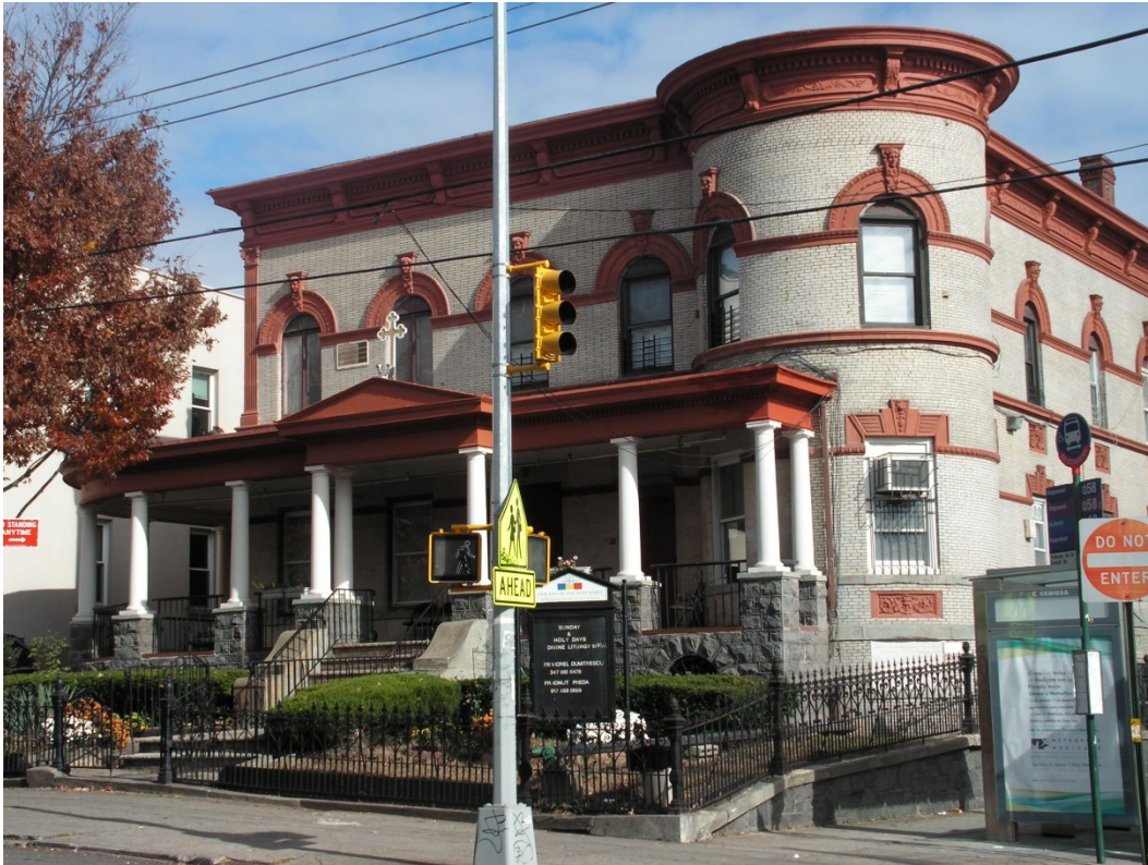
Illustration 1: 66-75 Forest Avenue the Joseph Meyerrose House, built 1906, Louis Berger & Co., architects. Photo: Theresa Noonan, 2014