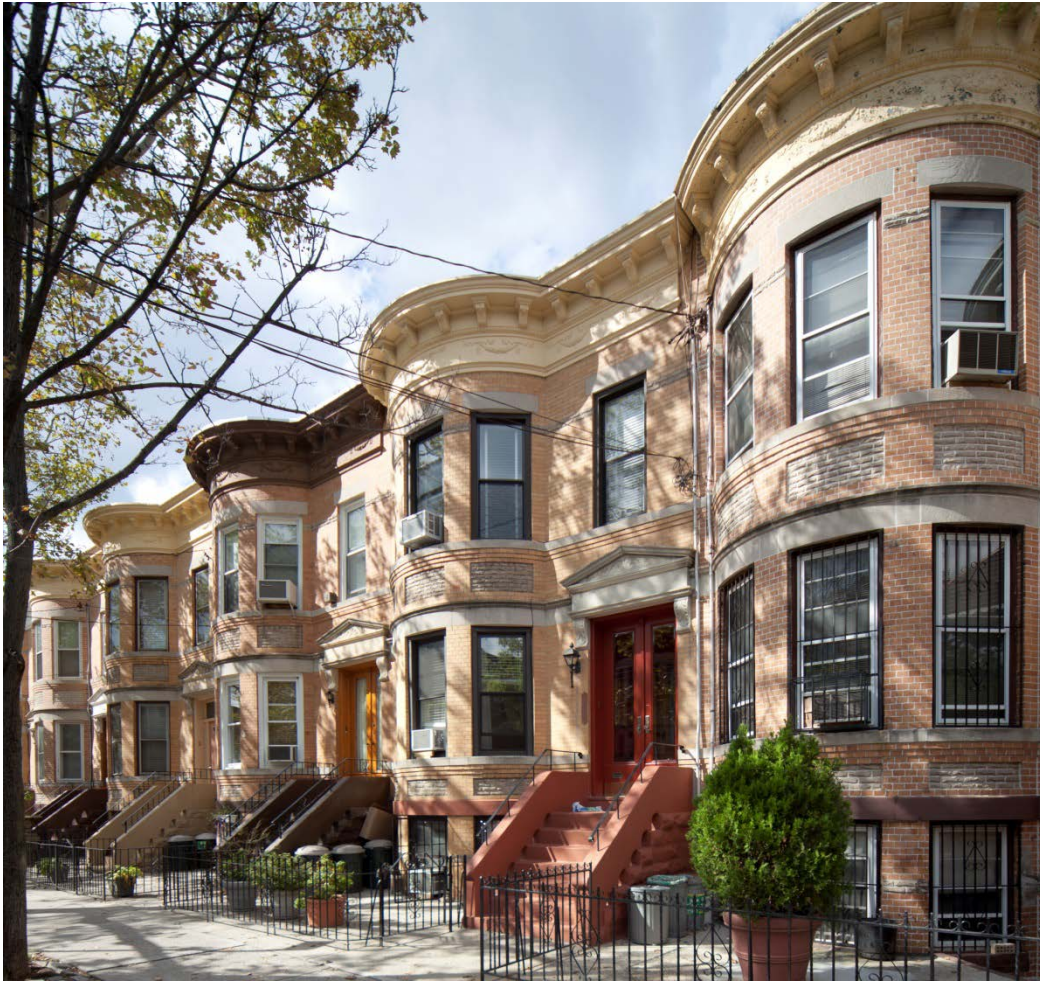
Illustration 5: Pronounced bayfront houses on 69 th Avenue developed by Louis Berger & Co., architects, and Paul Stier, builder.