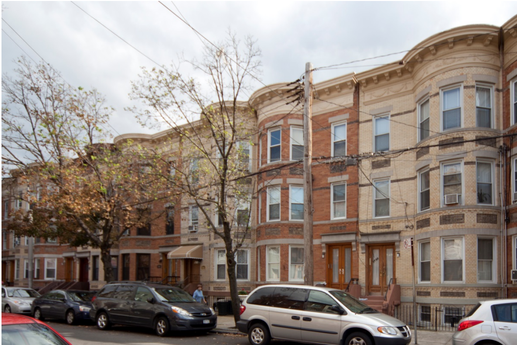
Illustration 6: Three story, bayfront houses on Catalpa Avenue developed by Louis Berger & Co., architects, and Paul Stier, builder. Photo: Donald G. Presa, 2013