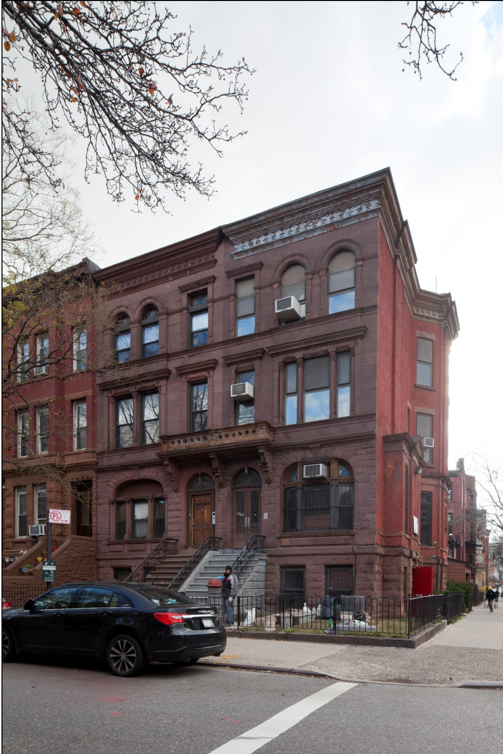
Figure 32 272 and 274 Jefferson Avenue (W. R. Bell & Company, c. 1889)