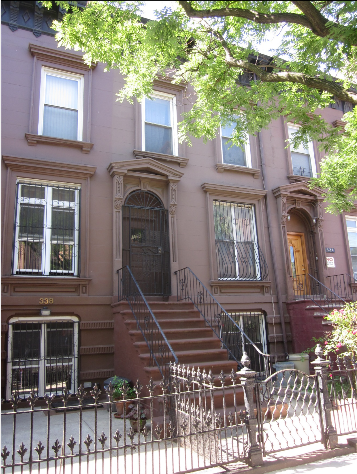
Figure 3 336 Putnam Avenue (Theodore Swimm, c. 1878) Photo: Michael Caratzas, 2015