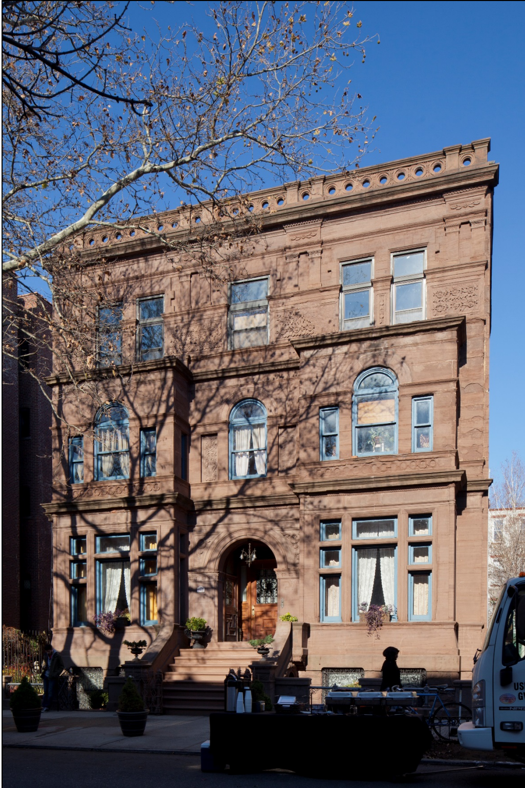
Figure 31 247 Hancock Street (Montrose W. Morris, c. 1887)