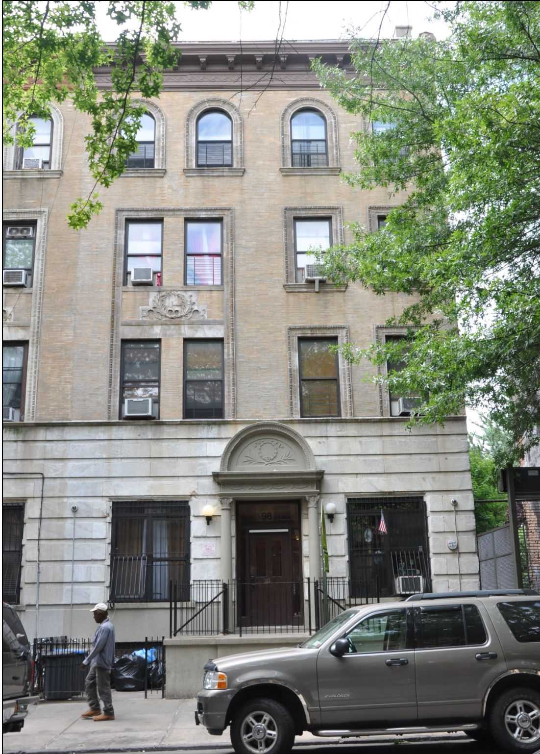
Figure 39 98 Macon Street (Frank S. Lowe, c. 1896) Photo: Corinne Engelbert, 2015