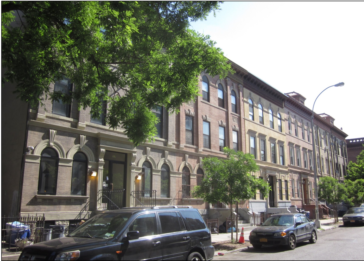
Figure 41 317 to 327 Putnam Avenue (Max J. Smallheiser, c. 1899) Photo: Michael Caratzas, 2015