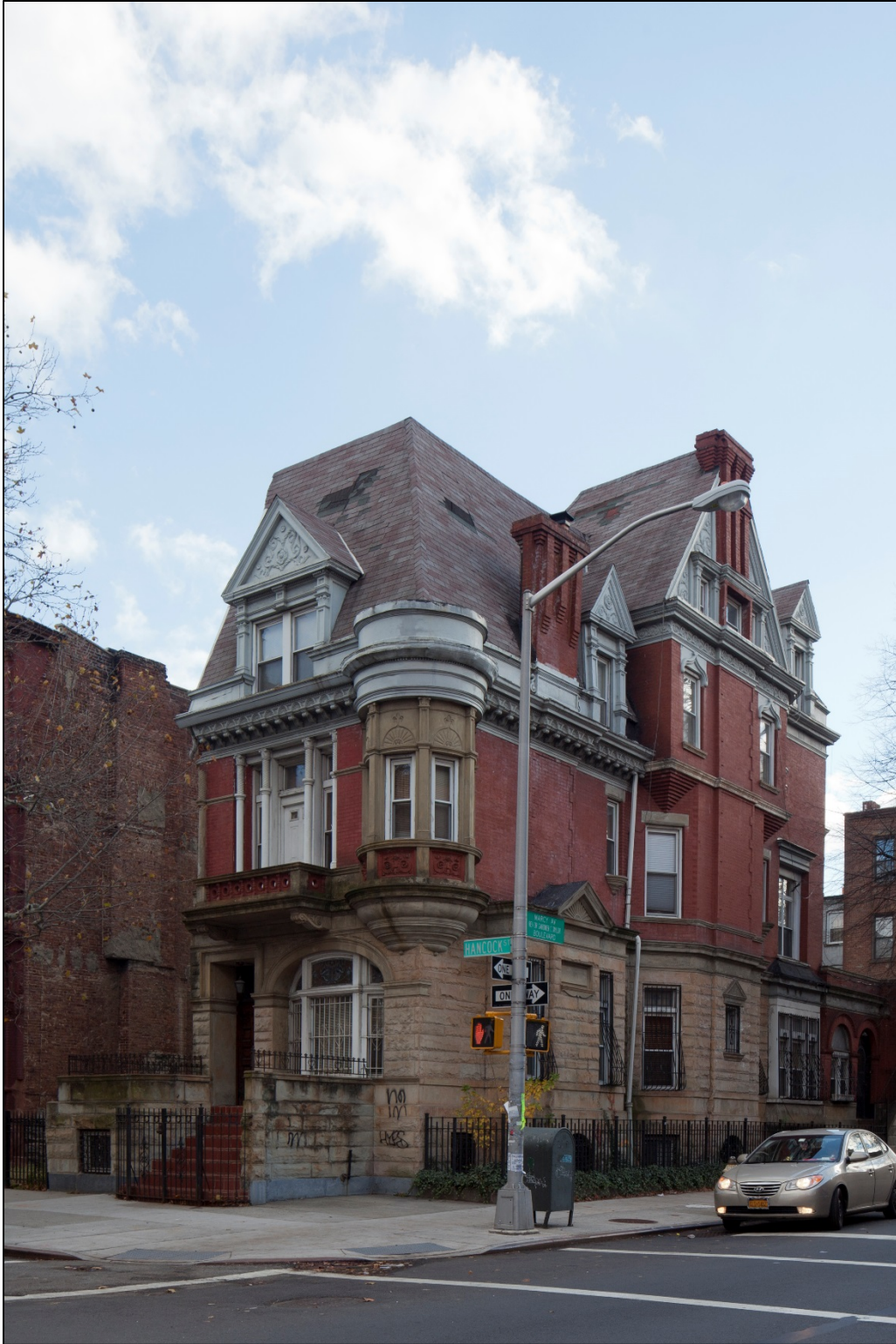
Figure 22 232 Hancock Street (Montrose W. Morris, c. 1888)