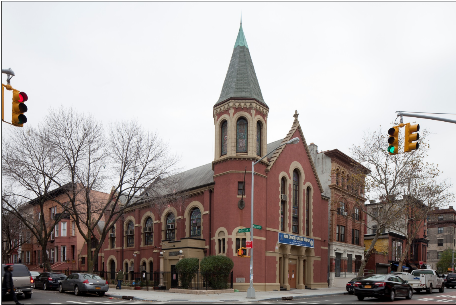
Figure 50 Reformed Episcopal Church of the Reconciliation (originally)/Most Worshipful Enoch Grand Lodge (since 1944) 423 Nostrand Avenue (Heins & LaFarge, c. 1890)