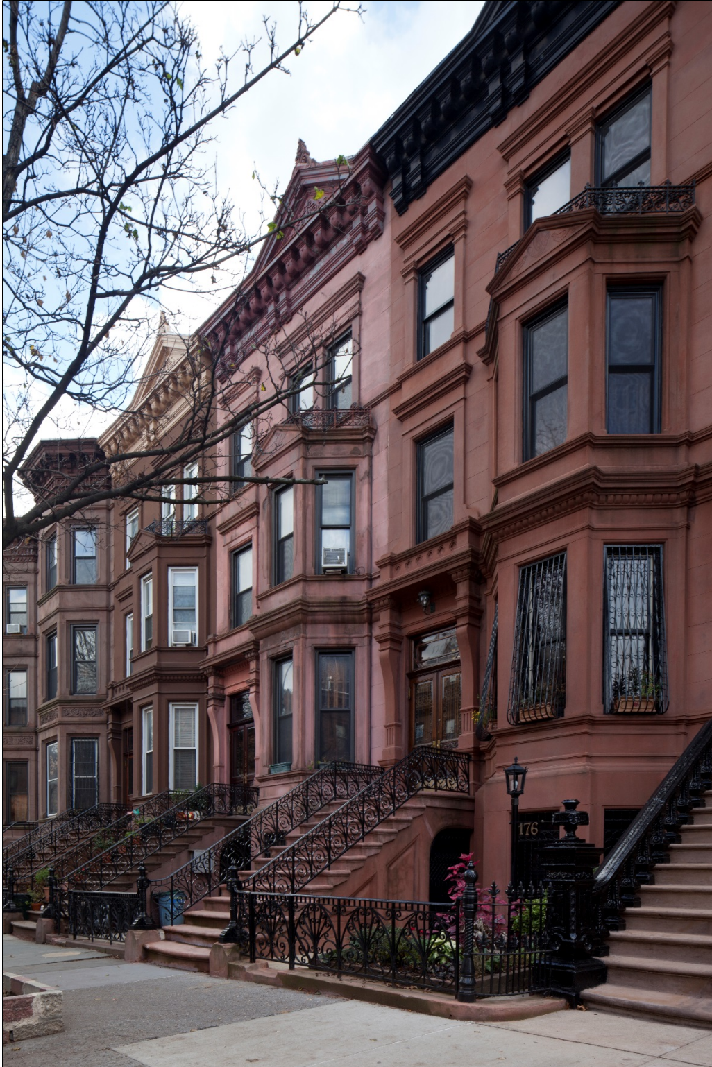
Figure 17 176 to 180 Hancock Street (John B. Snook, c. 1885) Photo: Christopher D. Brazee, 2015