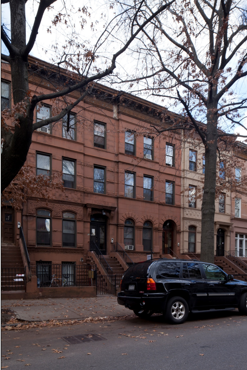
Figure 34 97 to 101 Macon Street (Robert Dixon, c. 1892) Photo: Christopher D. Brazee, 2015