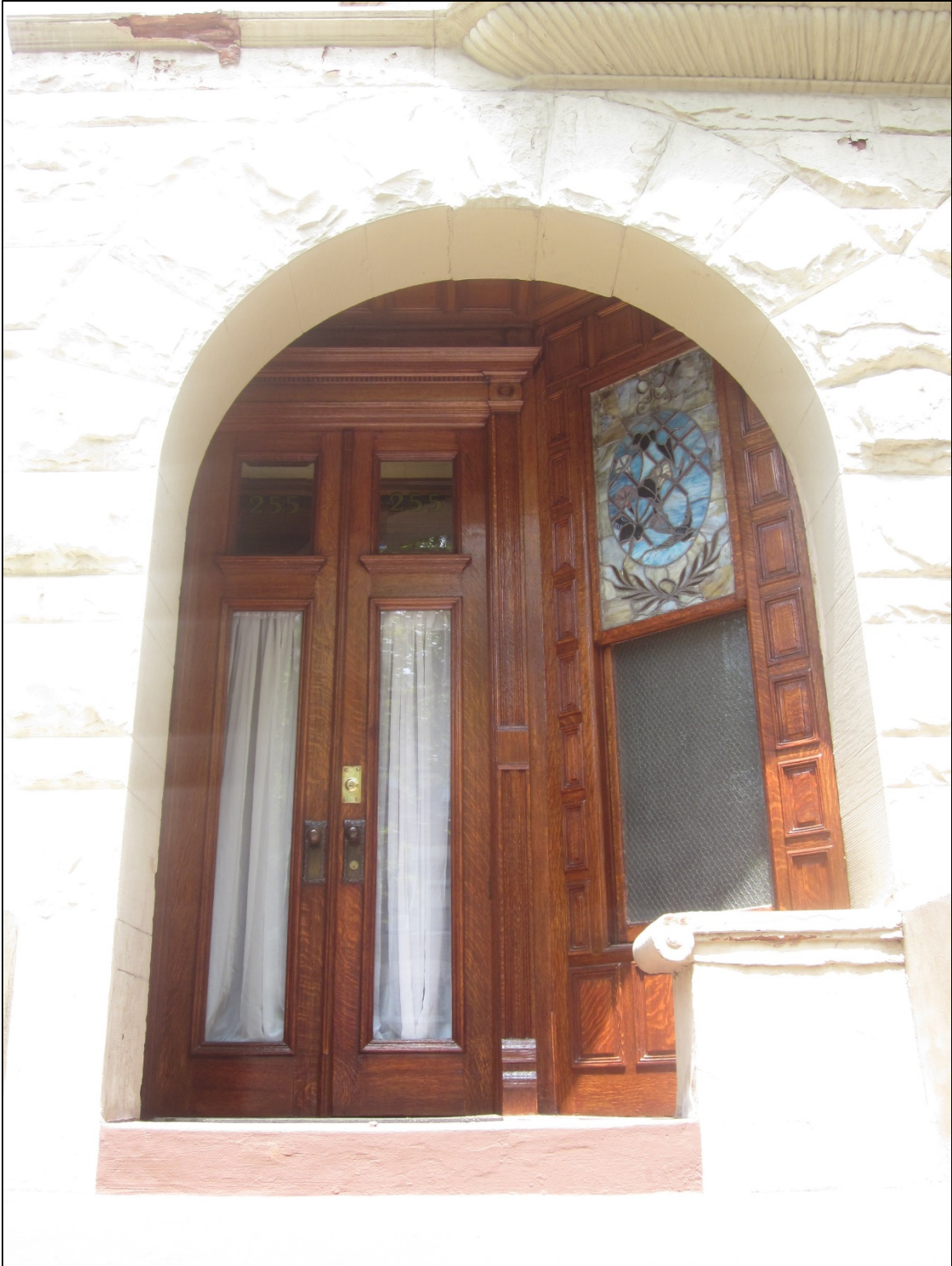
Figure 25 255 Hancock Street (main entrance) (Montrose W. Morris, c. 1889) Photo: Michael Caratzas, 2015