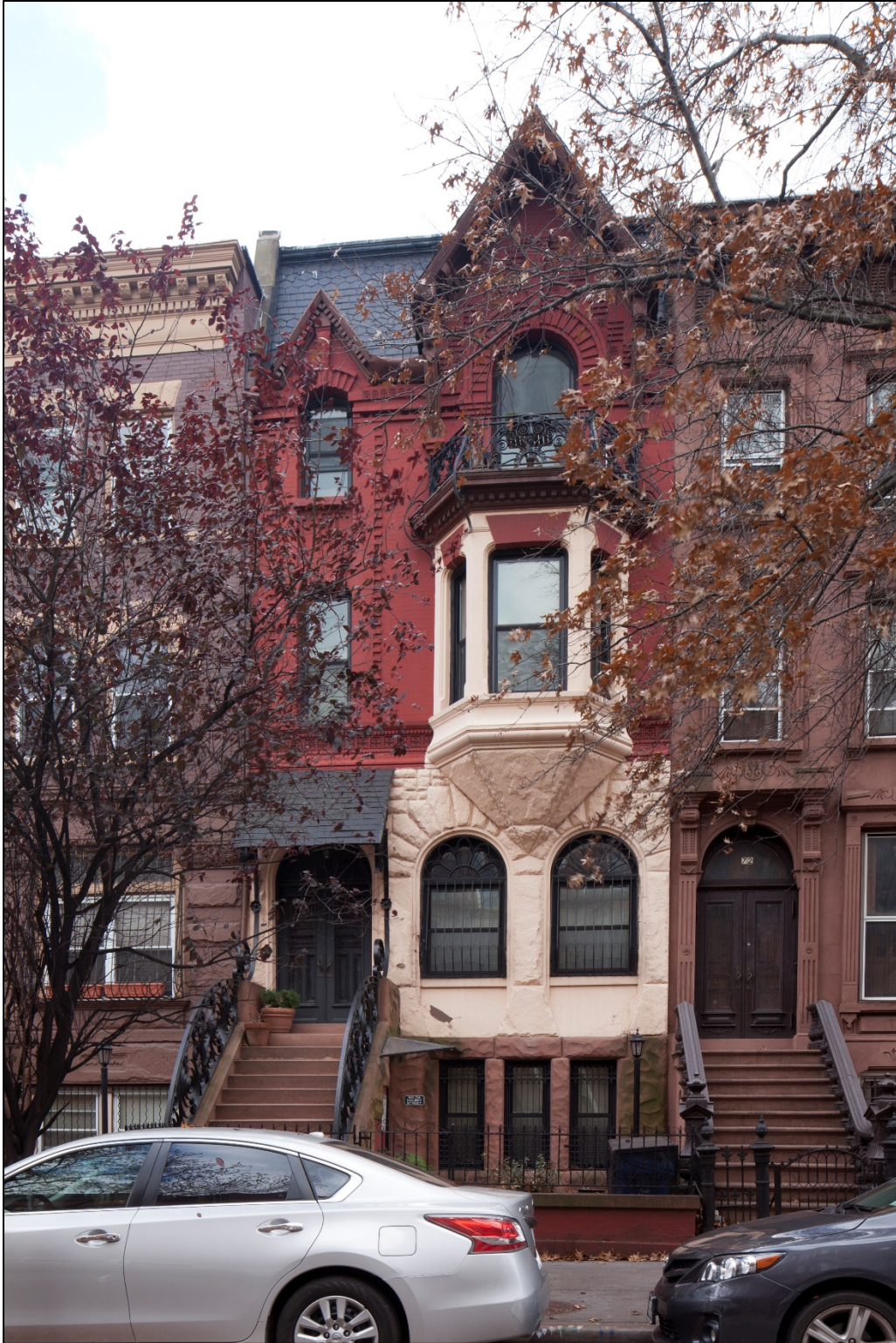
Figure 19 74 Halsey Street (Rudolphe L. Daus, c. 1886)