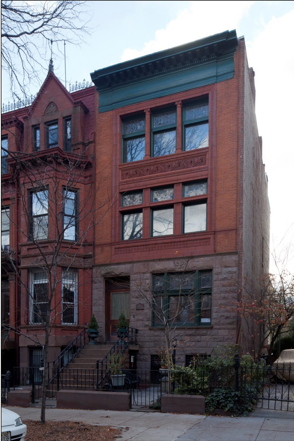
Figure 18 194 Hancock Street (George P. Chappell, c. 1886)