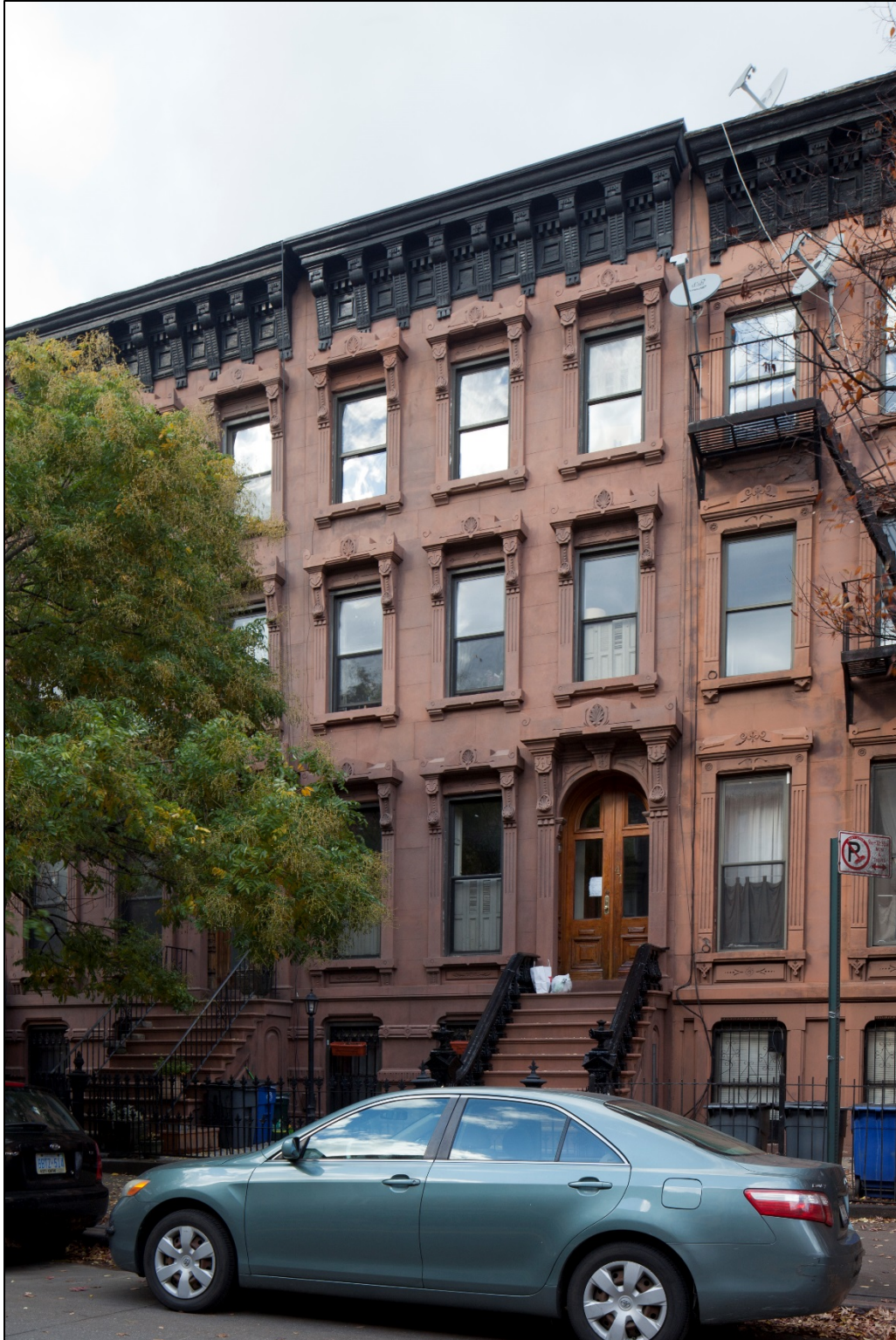
Figure 5 41 Halsey Street (Thomas B. Jackson, c. 1878-82)