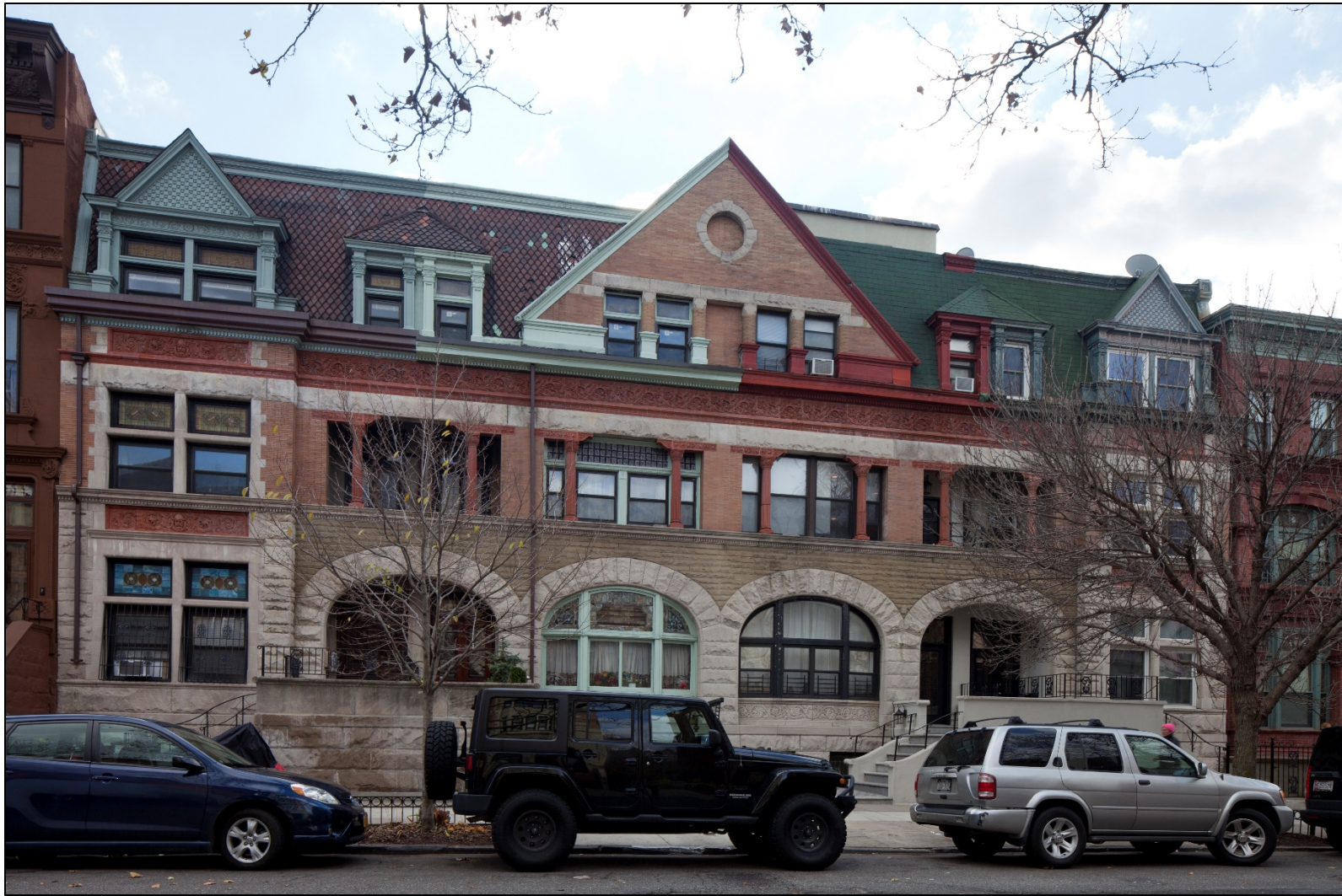
Figure 23 246 to 252 Hancock Street (Montrose W. Morris, c. 1889) Photo: Christopher D. Brazee, 2015