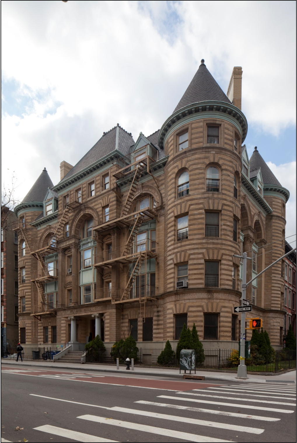
Figure 45 The Renaissance 480-482 Nostrand Avenue (Montrose W. Morris, 1892)