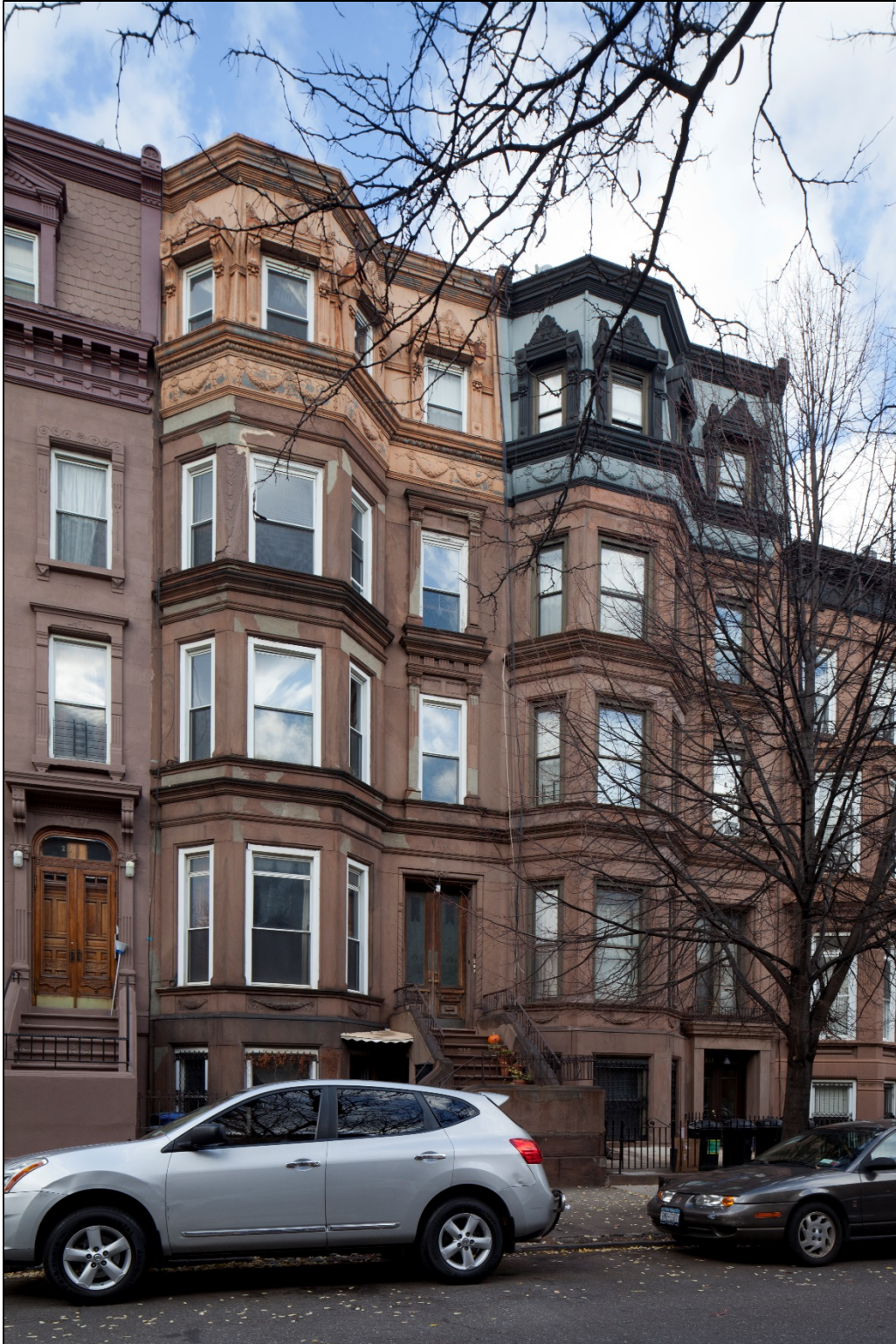
Figure 29 215 and 217 Hancock Street (Frederick B. Langston, c. 1890) Photo: Christopher D. Brazee, 2015