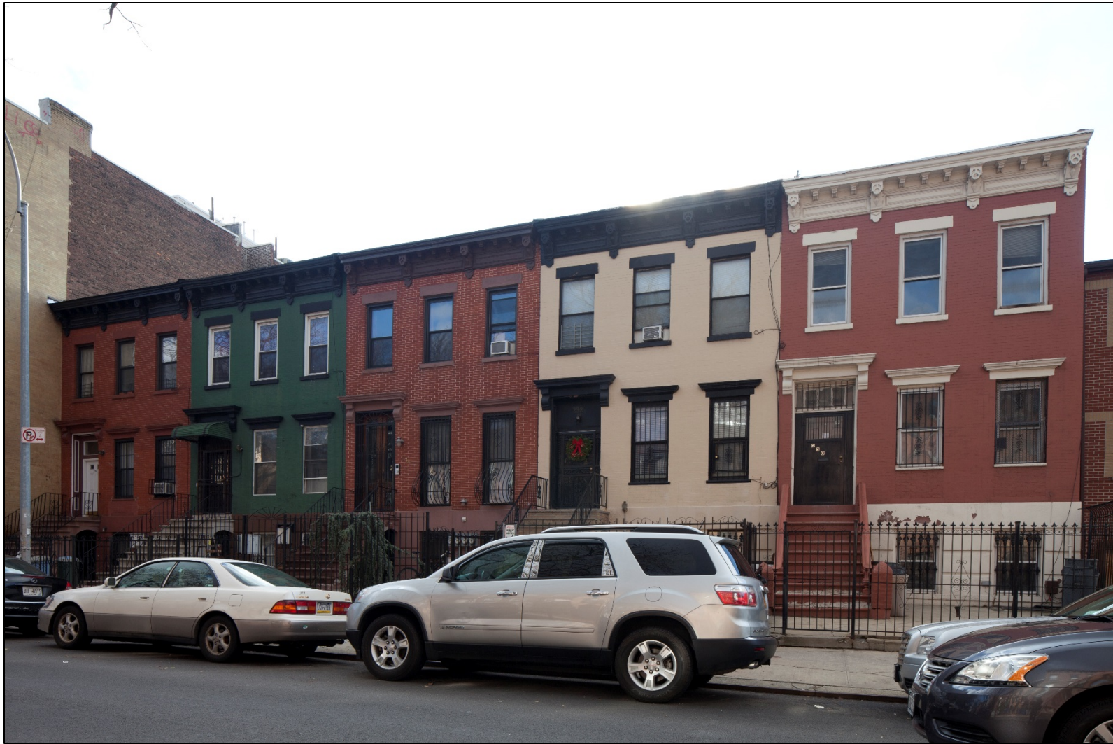
Figure 2 230 to 238 Madison Street (Attributed to Francis Wood, c. 1874-75)