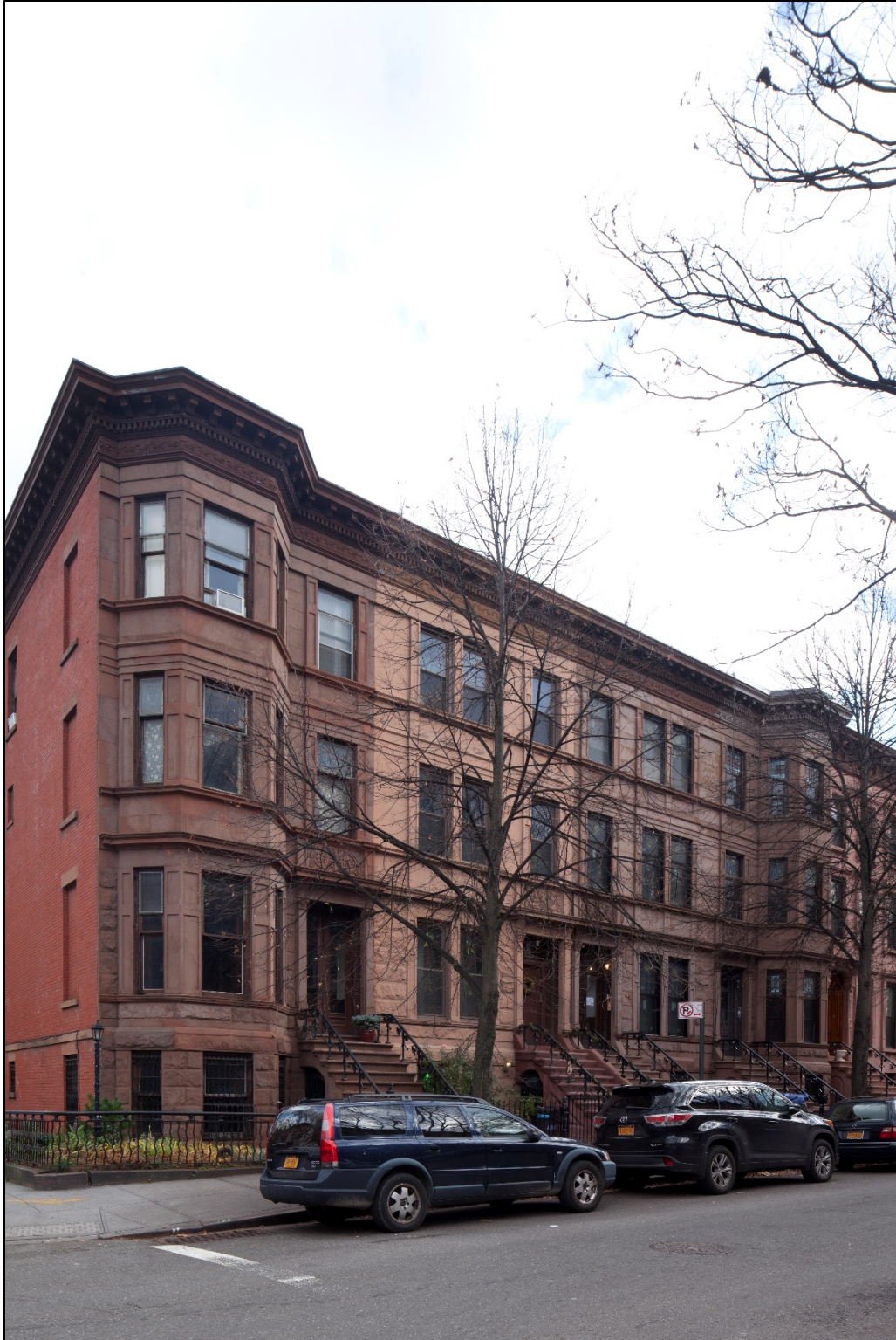
Figure 28 1 to 7 Arlington Place (George P. Chappell, c. 1887)