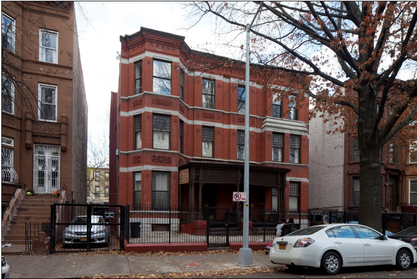
Figure 13 73 and 75 Macon Street (Amzi Hill, c. 1884)