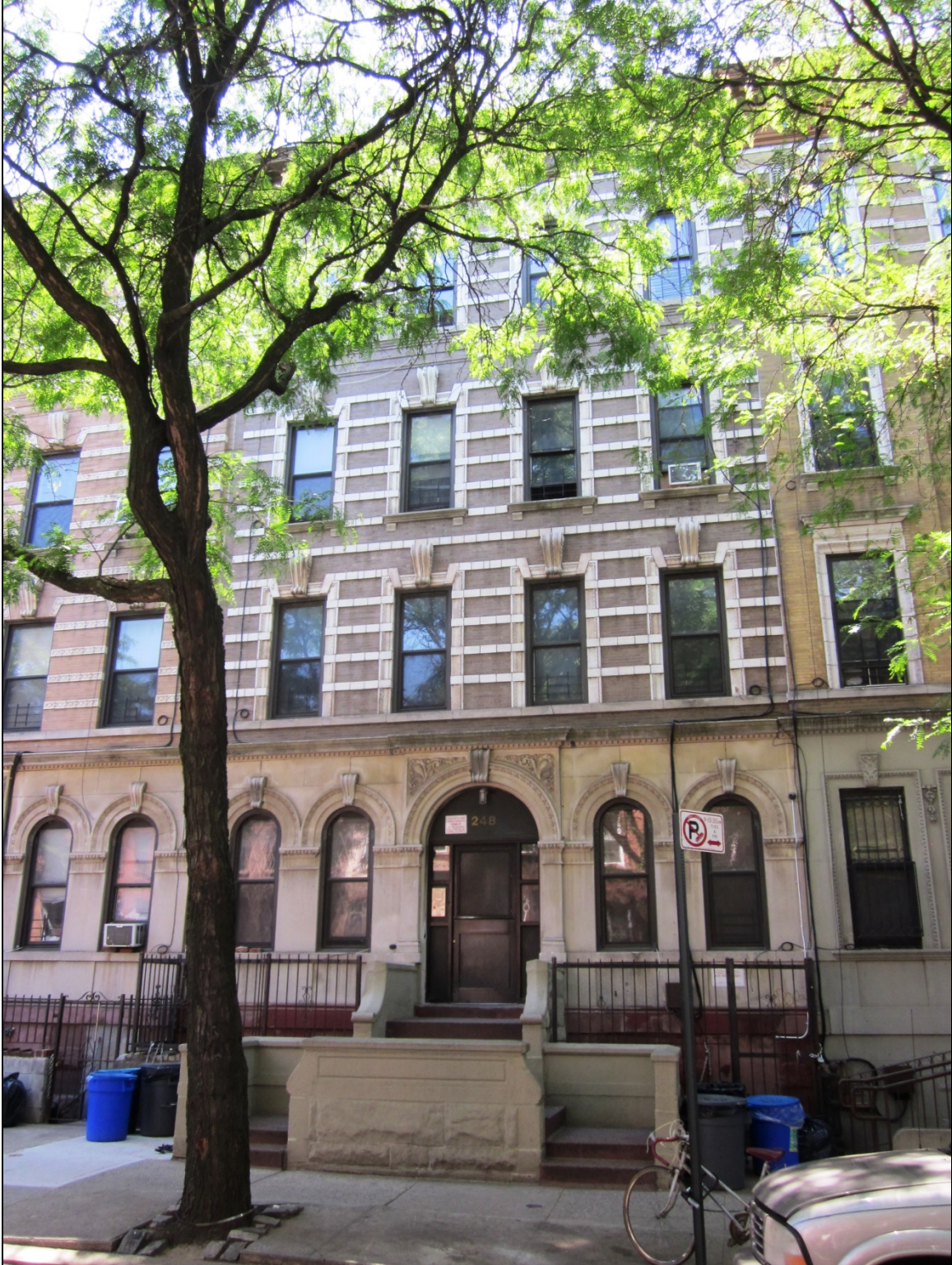
Figure 42 248 Madison Street (Max J. Smallheiser, c. 1899)