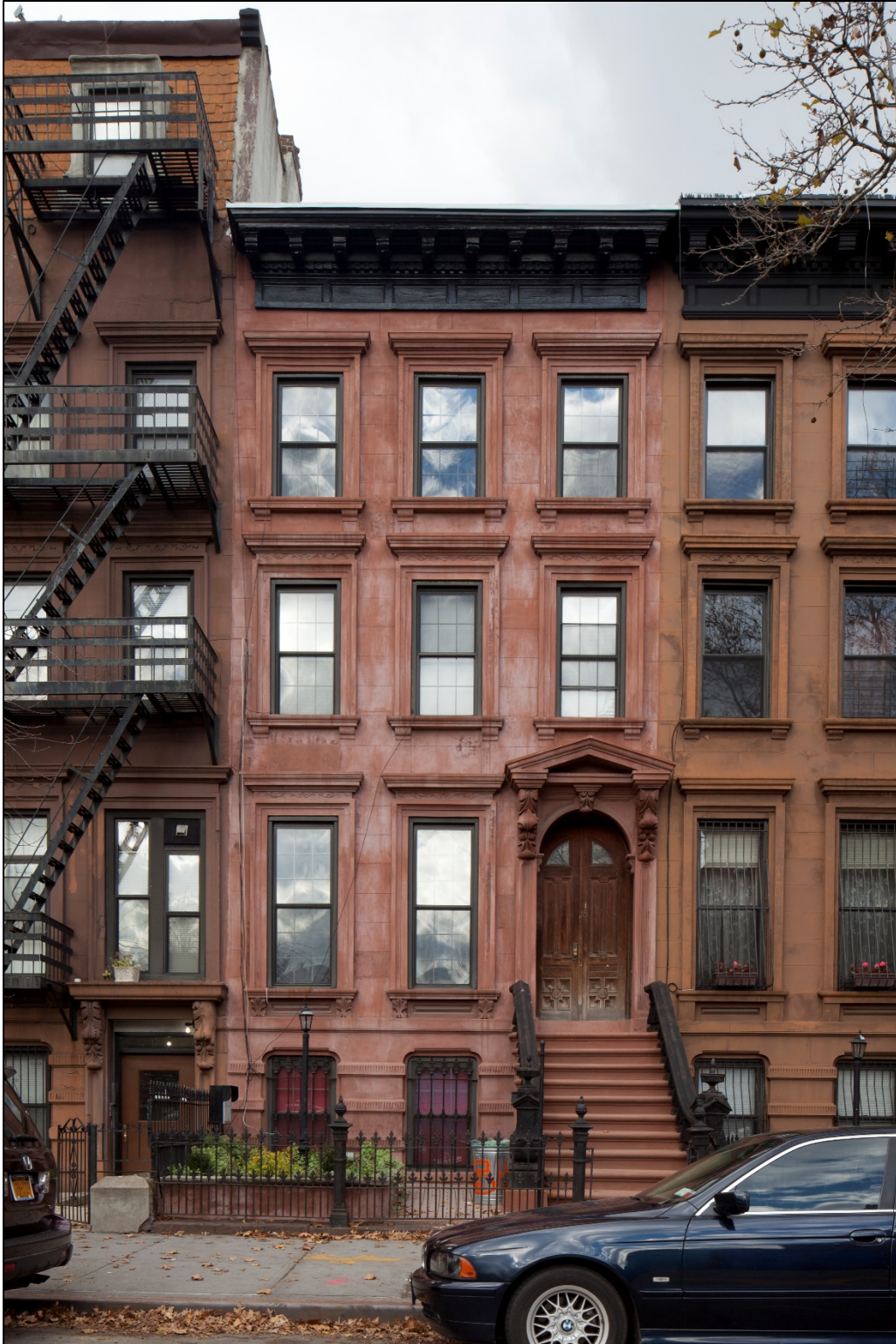
Figure 4 15 Halsey Street (Thomas B. Jackson, c. 1878-79) Photo: Christopher D. Brazee, 2015