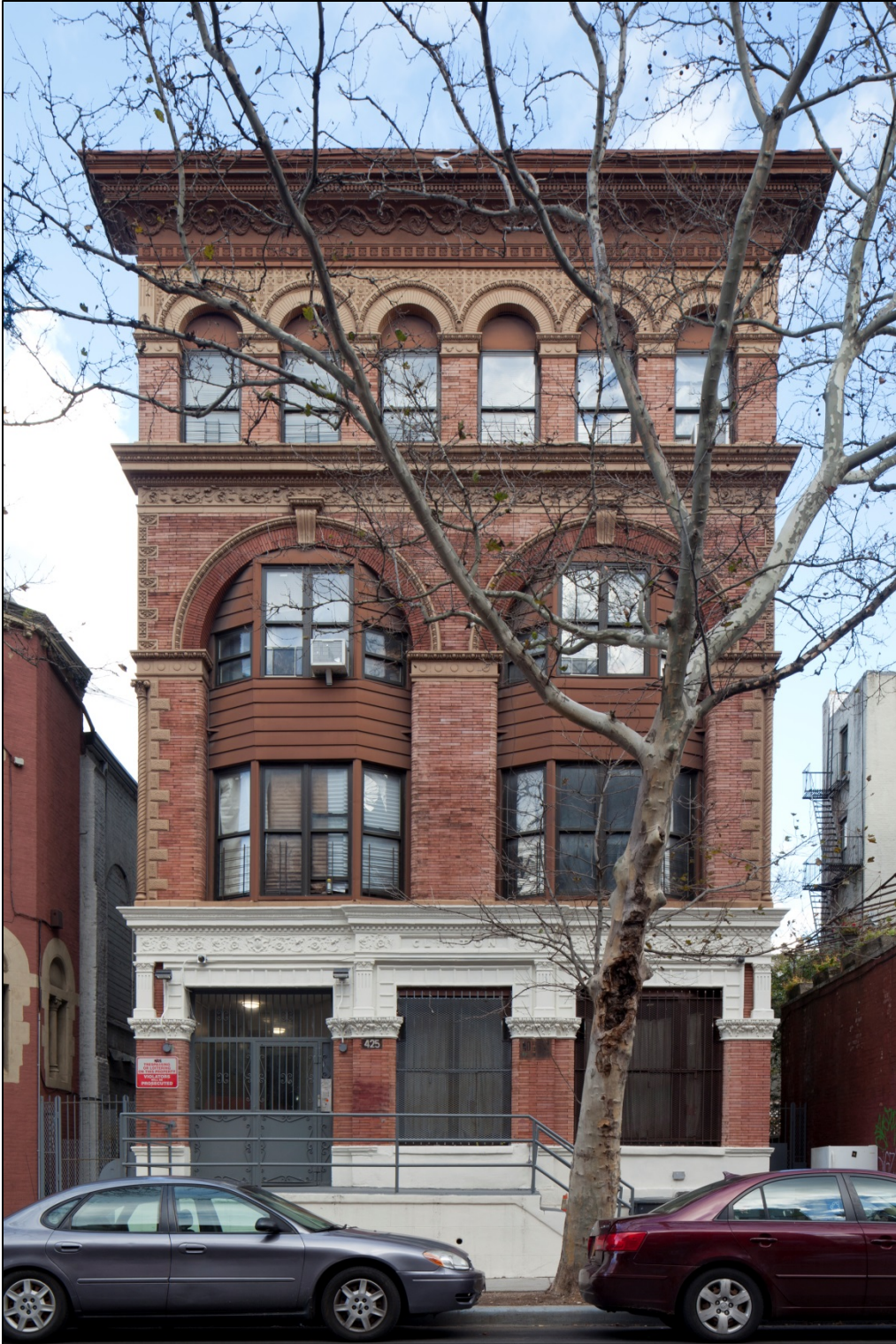
Figure 43 The Clinton 425 Nostrand Avenue (Montrose W. Morris, c. 1888) Photo: Christopher D. Brazee, 2015