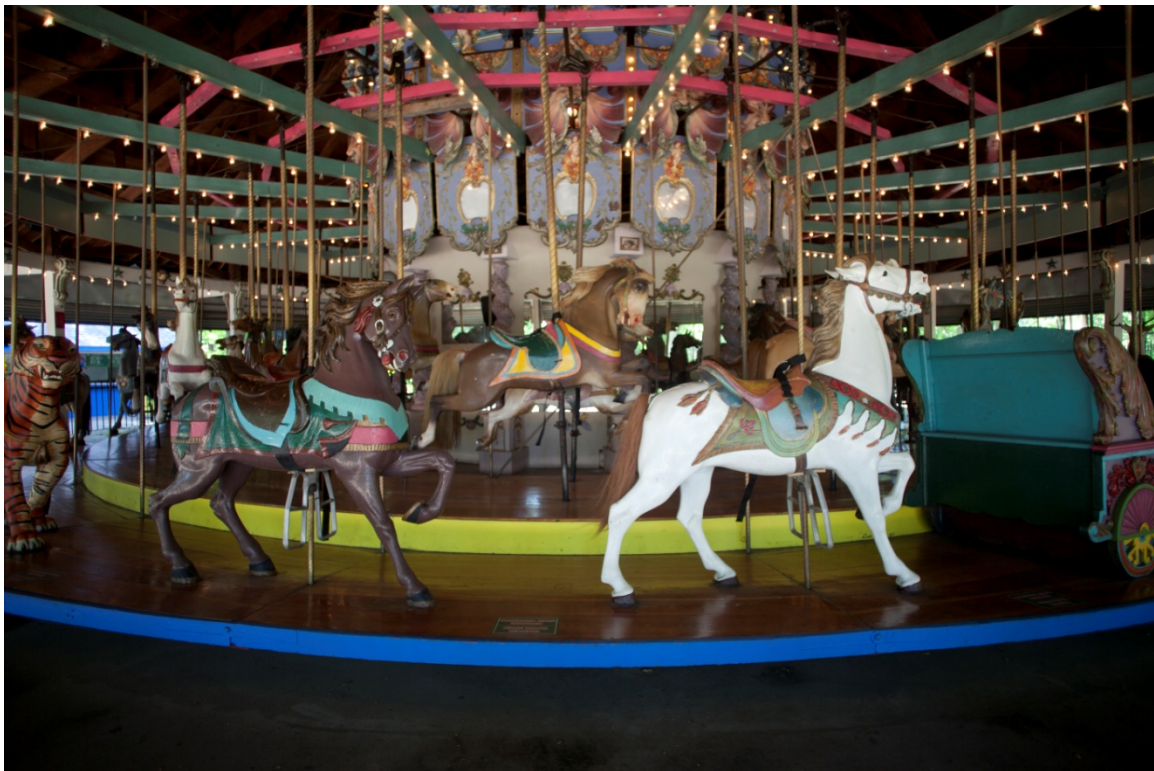
Forest Park Carousel Rounding boards and wood ceiling; outside row with white horse attributed to Charles Carmel