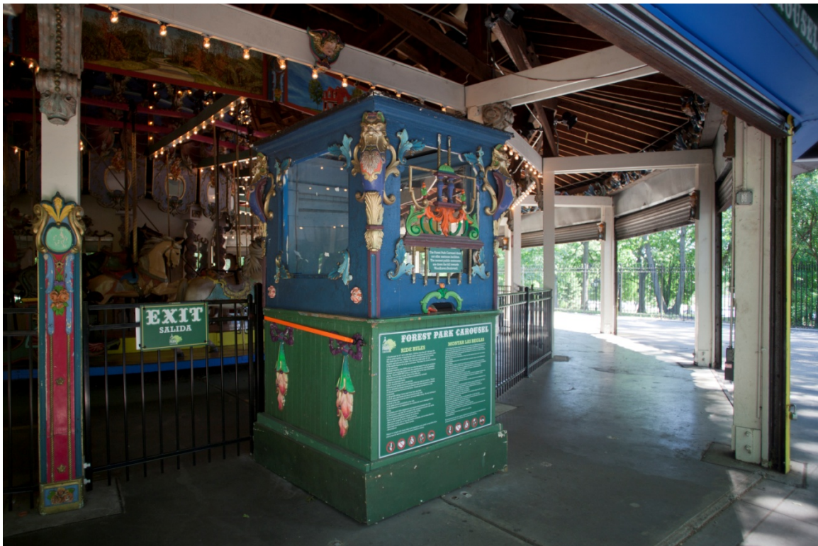
Forest Park Carousel Forest Park, Woodhaven Borough of Queens Tax Map Block 3866, Lot 70 in part Date: c. 1903 or 1910; pavilion, c. 1972 Pavilion; Ticket Booth