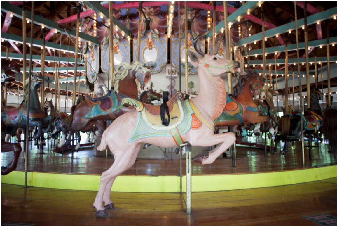
Forest Park Carousel