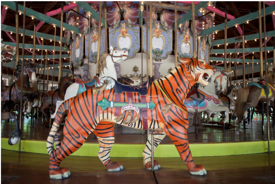
Forest Park Carousel