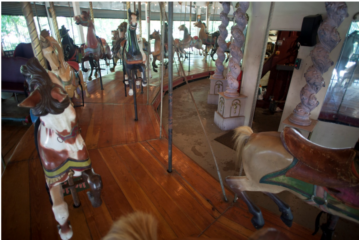
Forest Park Carousel Lower image: empty pole, inside row