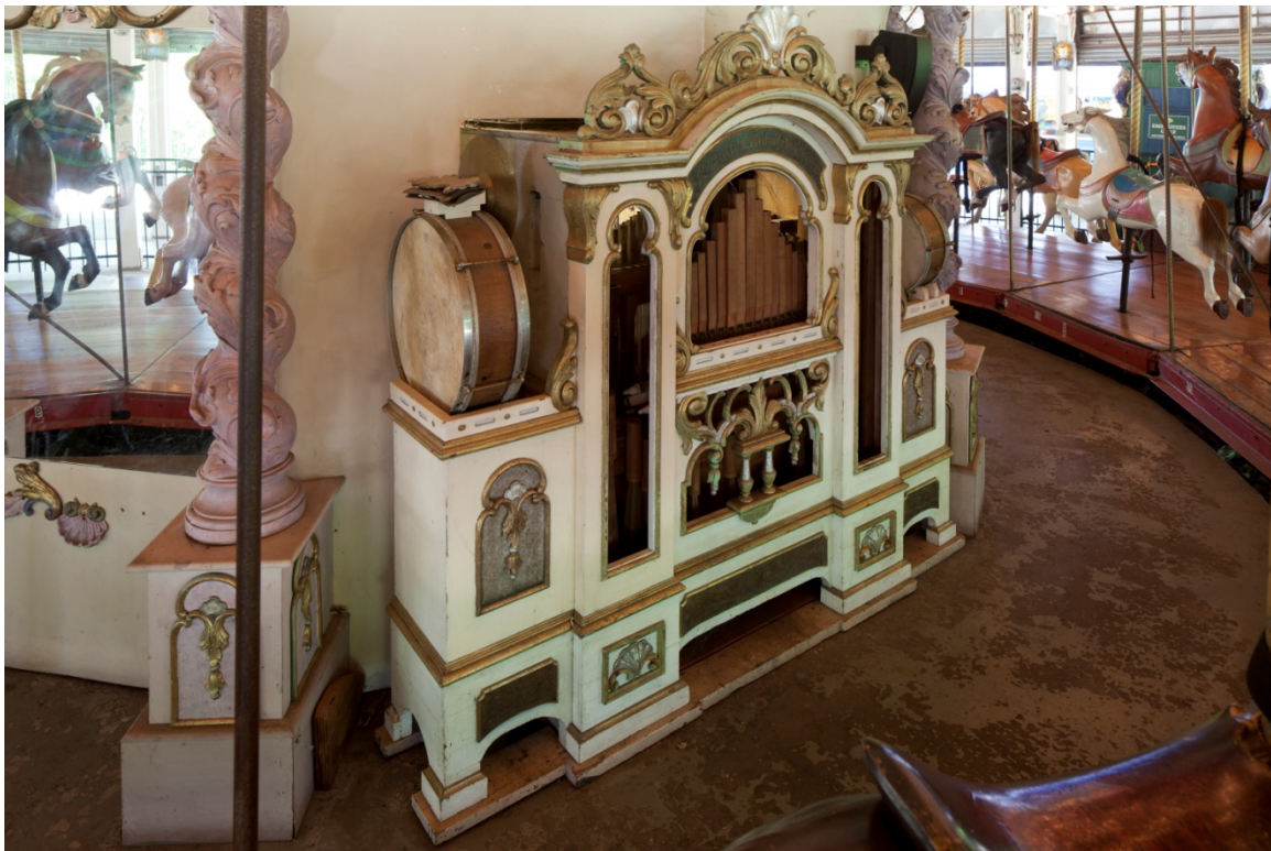
Forest Park Carousel Ticket Booth (rear); Band Organ