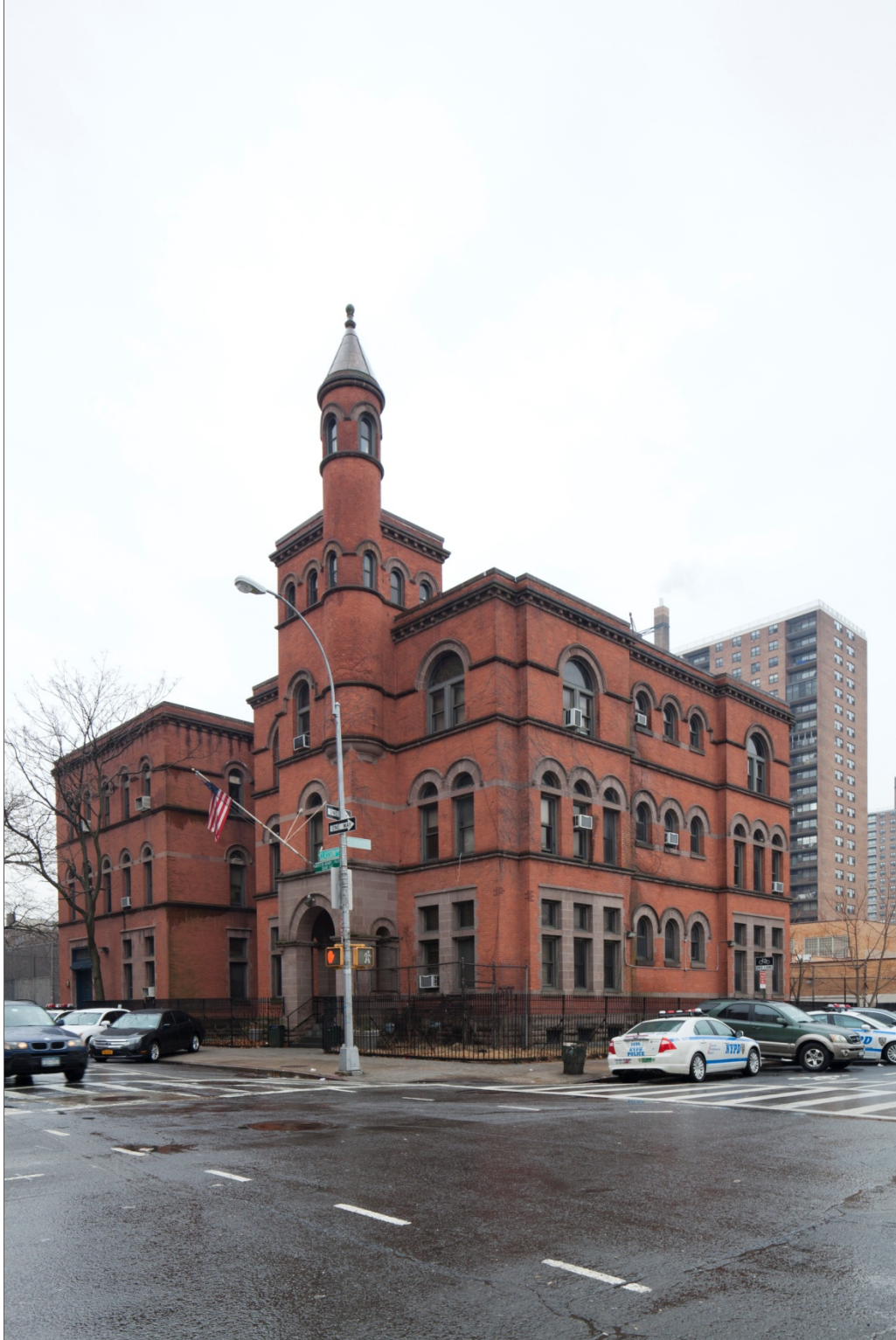
4 th (now 88 th) Police Precinct Station House 298 Classon Avenue, aka 414-20 DeKalb Avenue, Brooklyn Borough of Brooklyn Tax Map Block 1922, Lot 121