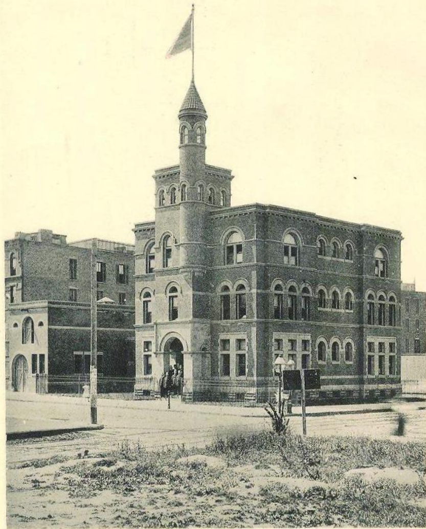
4th PRECINCT STATION HOUSE.

Annual Report of the Department of Police and Excise of the City of Brooklyn for the year 1890