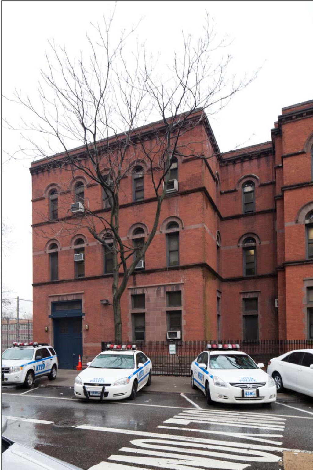
4 th (now 88 th) Police Precinct Station House Classon Avenue, extension, 1924-26