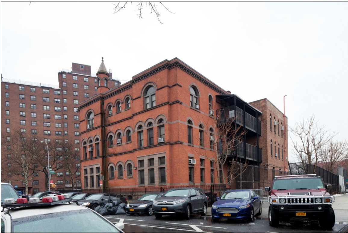
4 th (now 88 th) Police Precinct Station House DeKalb Avenue facade and rear (west) facade