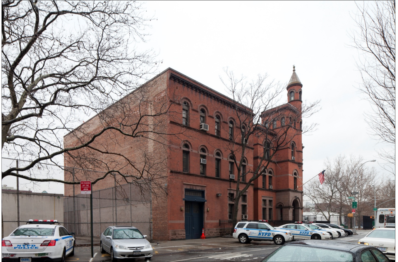
4 th (now 88 th) Police Precinct Station House South facade and Classon Avenue facade