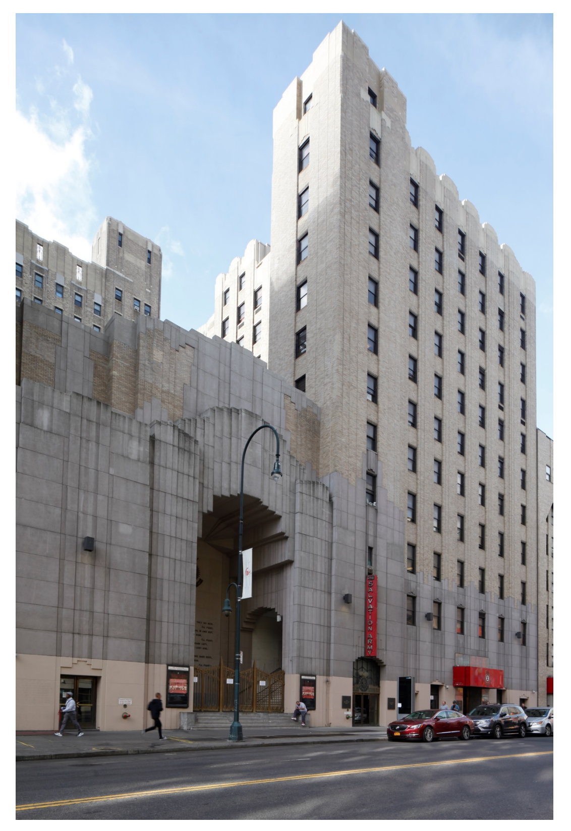
Auditorium Entrance Barrett Reiter (LPC), October 2017