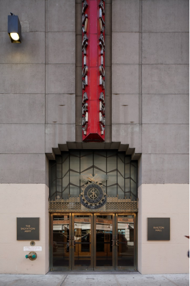
Entrance to the Office Building Barrett Reiter (LPC), October 2017