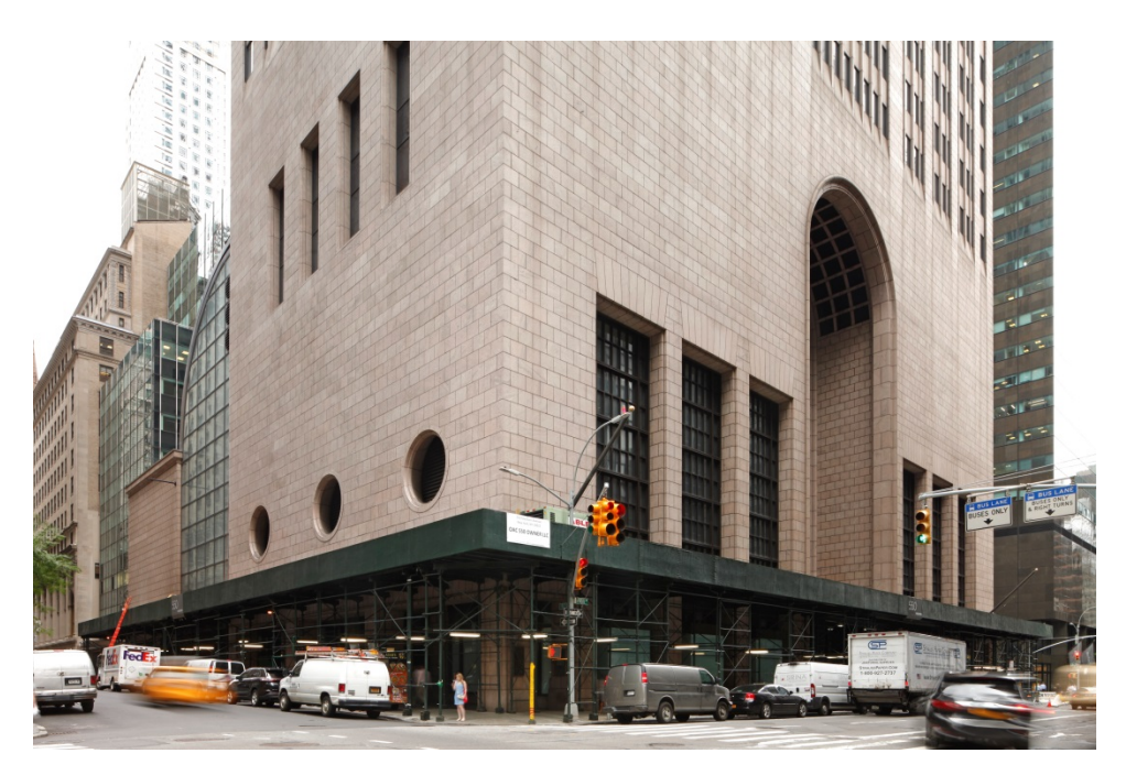
Madison Avenue and East 55th Street July 2018