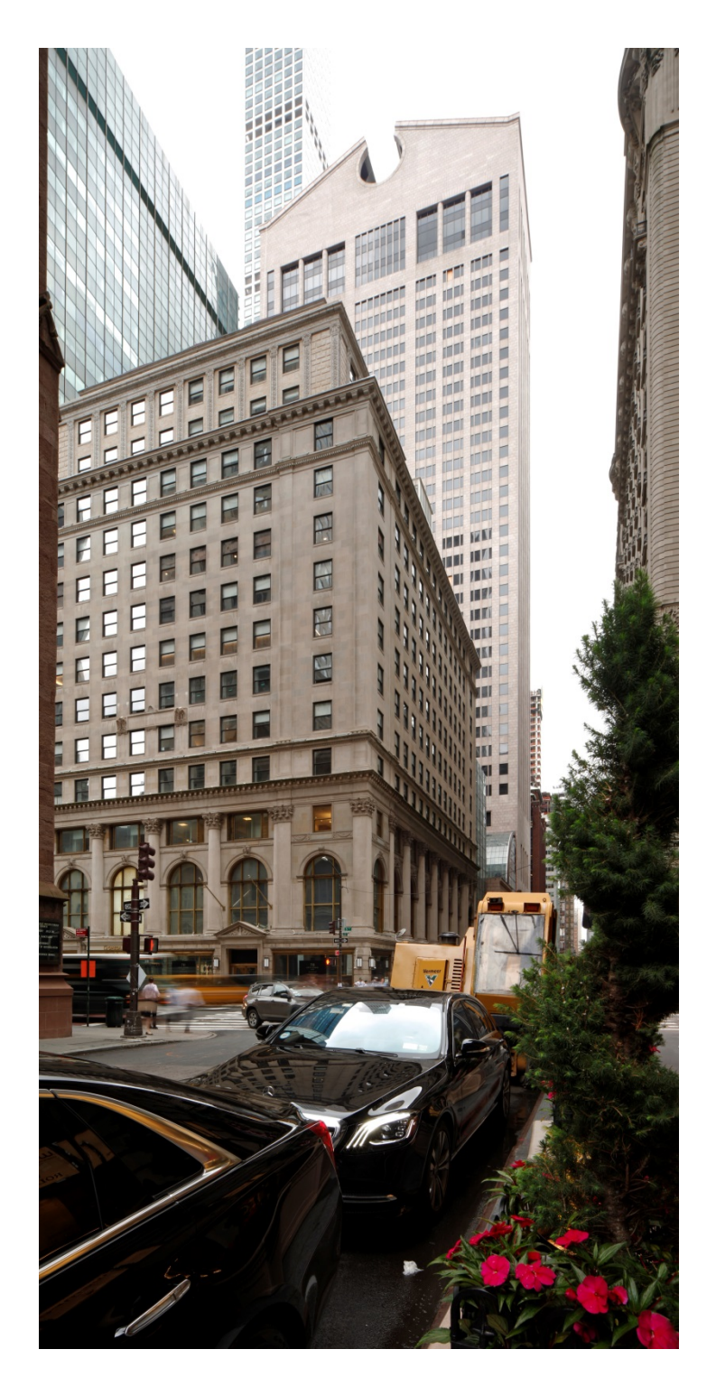
AT&T Corporate Headquarters Building West facade, from 55<sup>th</sup> Street