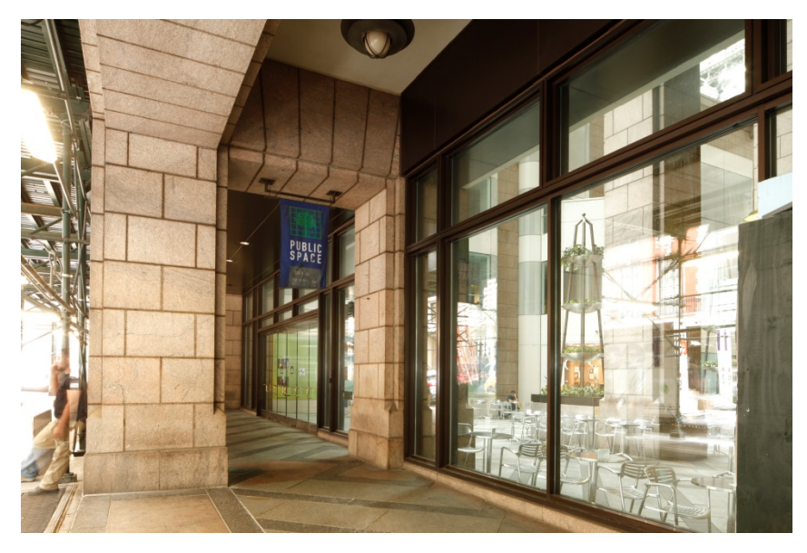
East 55<sup>th</sup> Street passage, view west Sarah Moses, July 2018