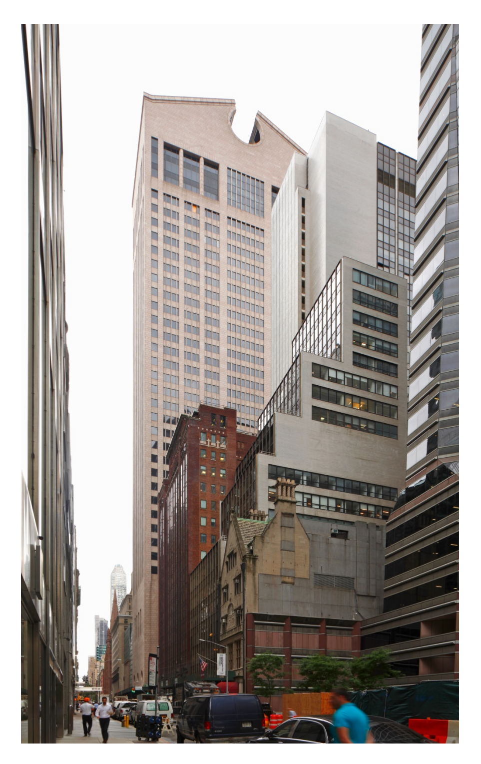
AT&T Corporate Headquarters Building East facade, from 55<sup>th</sup> Street Sarah Moses, July 2018