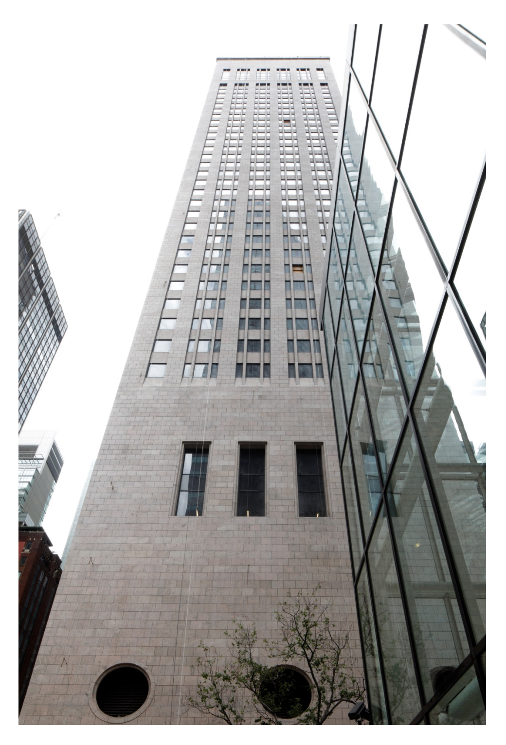
East 56<sup>th</sup> Street (north) facade Sarah Moses, July 2018