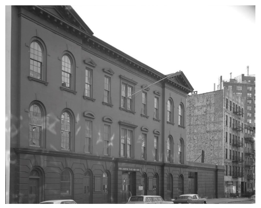
208 West 13th Street, LPC files 1964