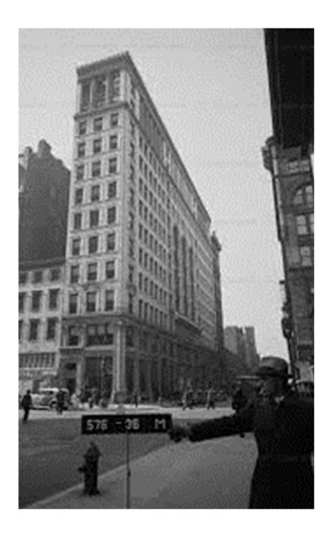
Educational Building, 70 Fifth Avenue Municipal Archives, City of New York, c. 1940