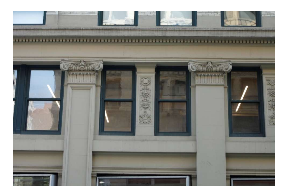
Educational Building 70 Fifth Avenue West 13th Street, details Jessica Baldwin, May 2021