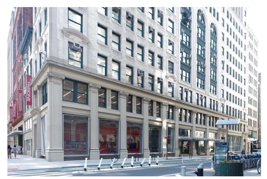
Educational Building 70 Fifth Avenue West 13th Street, view west Jessica Baldwin, May 2021